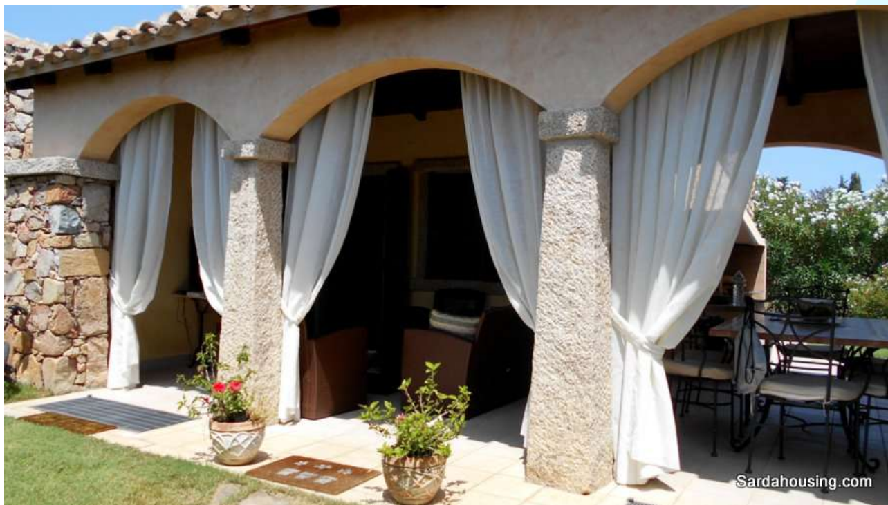
2– Costa Rei – Cala Sinzias – Villa Filirea: loggia