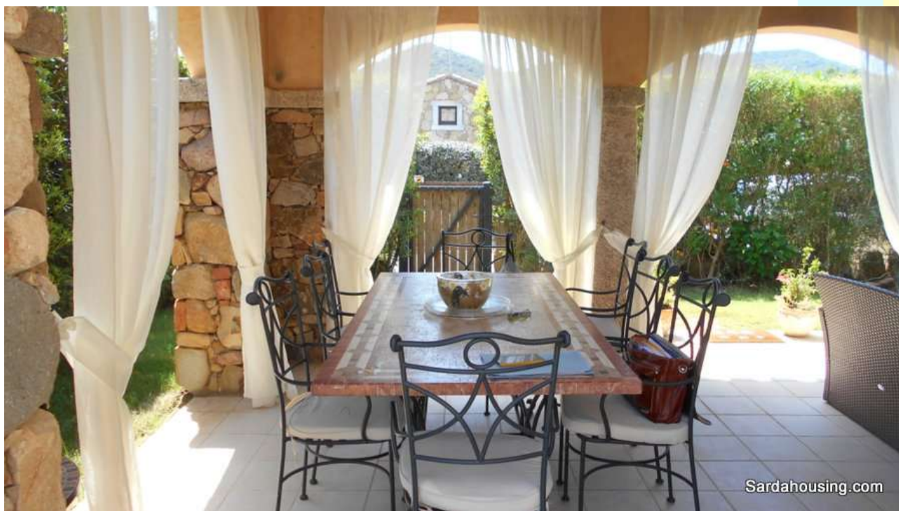
3 – Costa Rei – Cala Sinzias – Villa Filirea: loggia