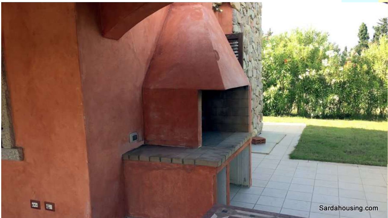
6 - Costa Rei – Cala Sinzias – Villa Filireia: barbecue area

Services: The accommodations in Castiadas meet every need. Given the agricultural vocation of the area can offer great hospitality (bio food and natural products). Two campsites in Cala Sinzias. Sea and countryside guided tours, hiking, and diving.