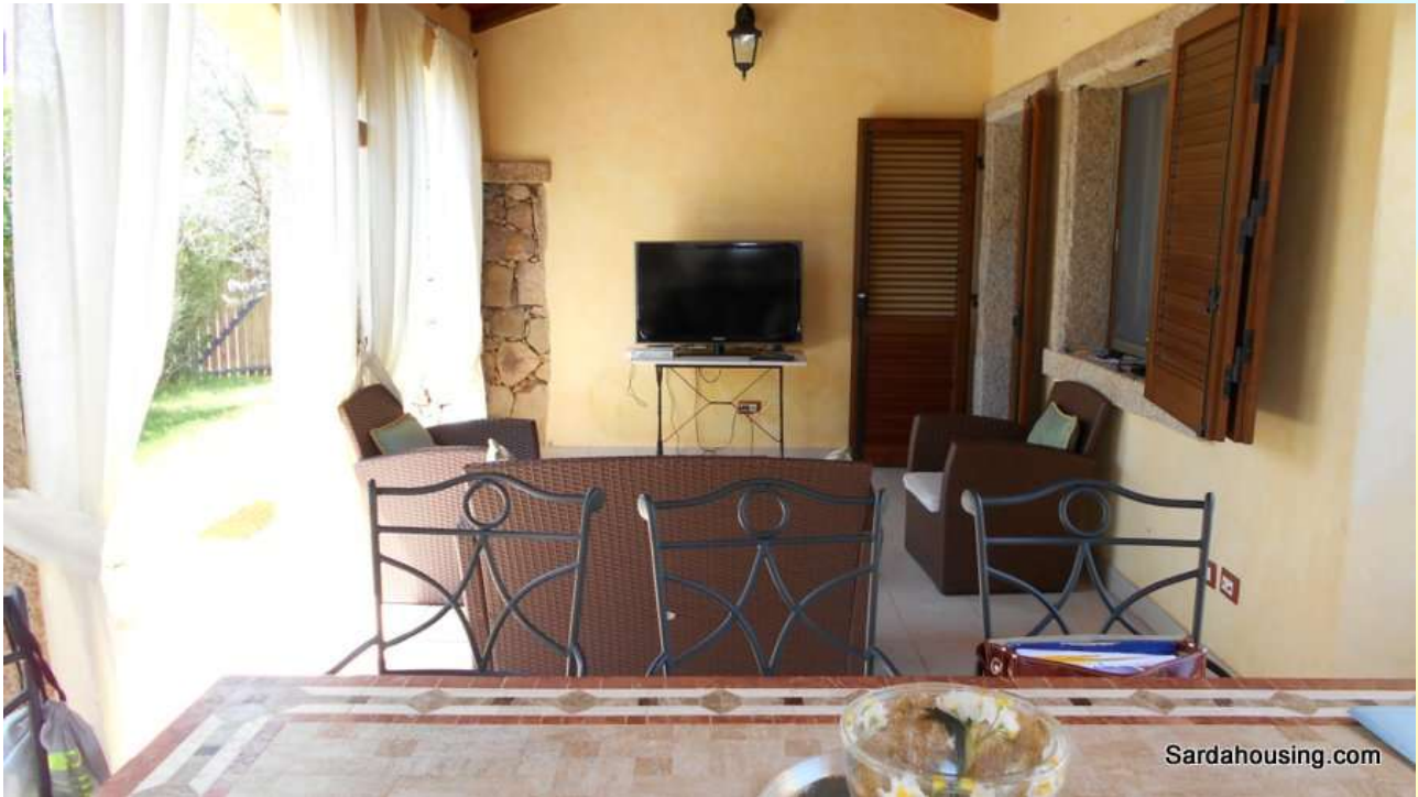
4 – Costa Rei – Cala Sinzias – Villa Filirea: loggia