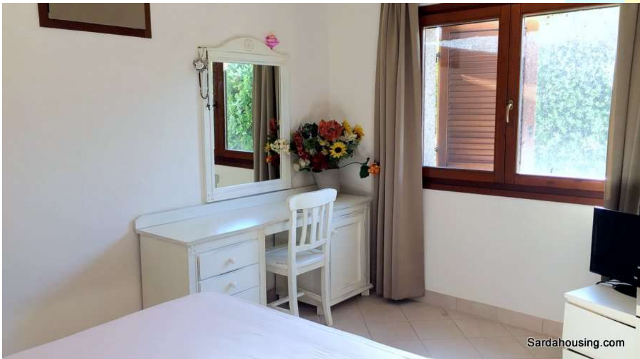
5 - Costa Rei – Cala Sinzias – Villa Filirea: bedroom