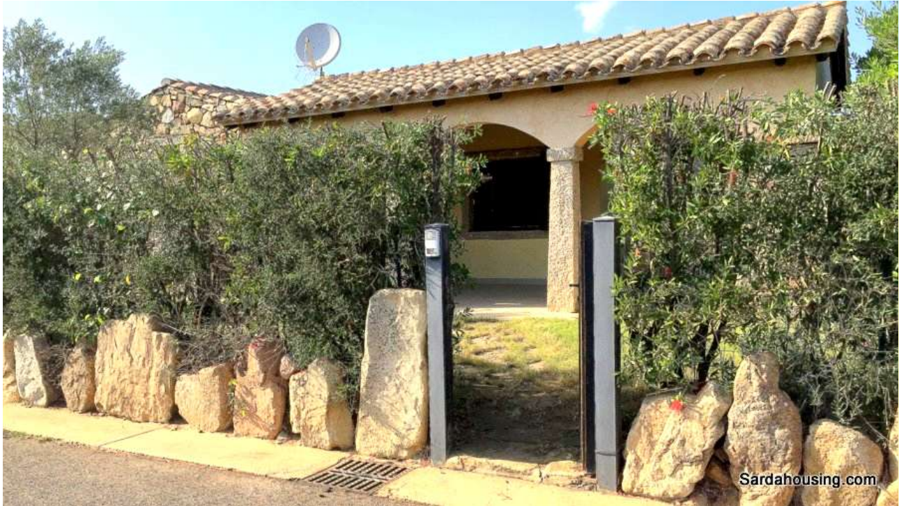
1 – Costa Rei – Cala Sinzias – Villa Filirea 400 m to the beach

400 m to the beautiful beach of Cala Sinzias, south of Costa Rei, we offer a recent detached villa with excellent finishes.