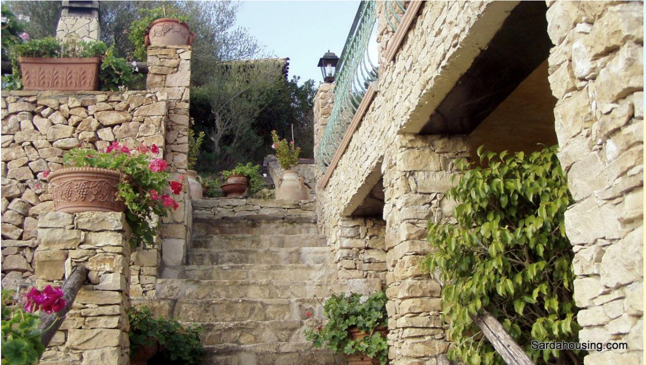
6 – Chia - Villa Domus: external finishing in local stone