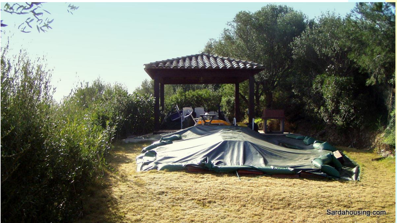
11 - Chia - Villa Domus: pool and gazebo