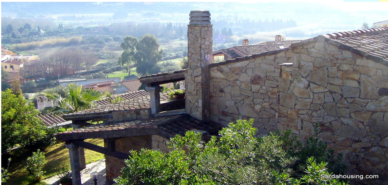
12 – Chia - Villa Domus

In summer Festivals of theatre and of music take place in the Roman theatre of the archaeological site Nora.