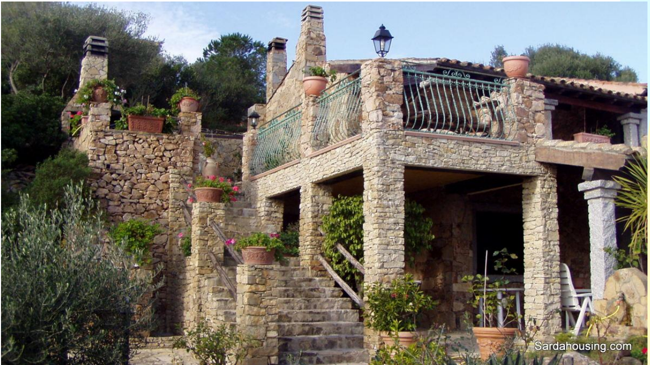
4 – Chia - Villa Domus