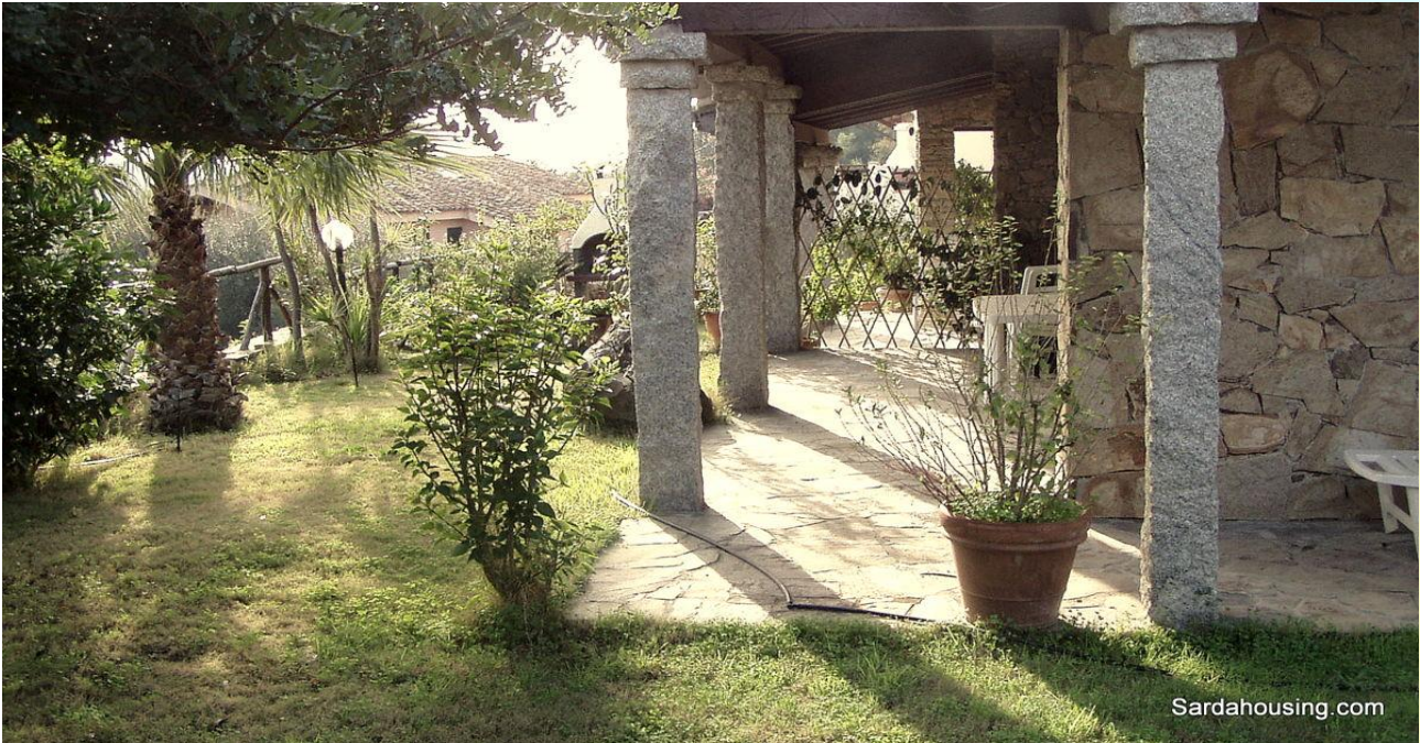
2 – Chia – Villa Domus: veranda and garden

info@sardahousing.com - www.sardahousing.com