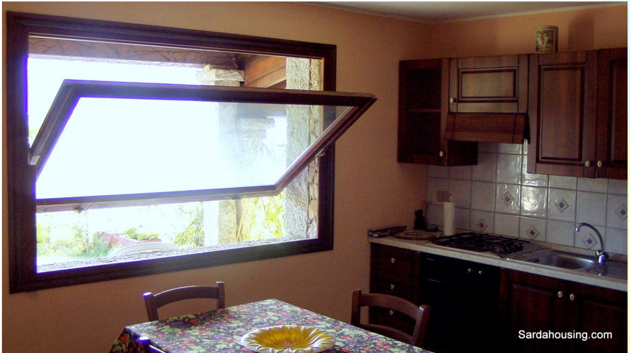
8 – Chia - Villa Domus: one of the kitchens