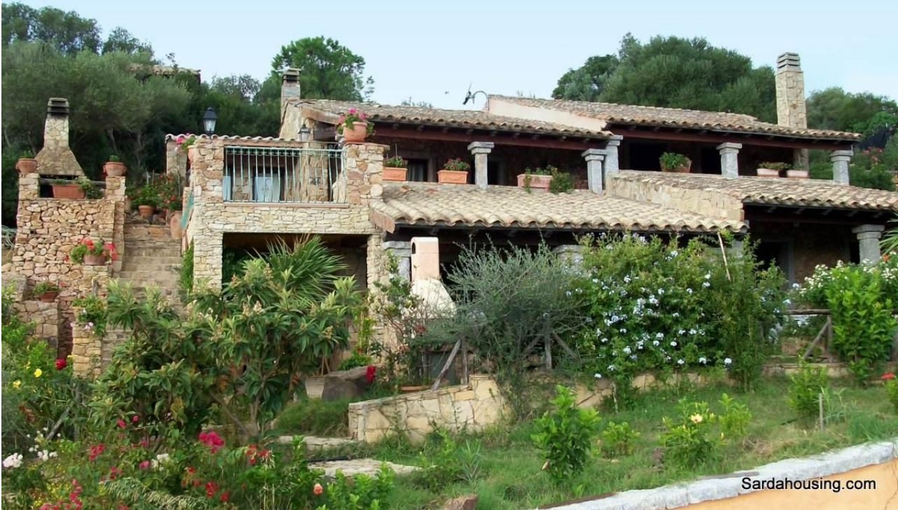
1 – Chiia Villa Domus: finished with local stone

In Chia, on the South coast of Sardinia a great villa with sea views and pool, 800 m from the Golf Course.