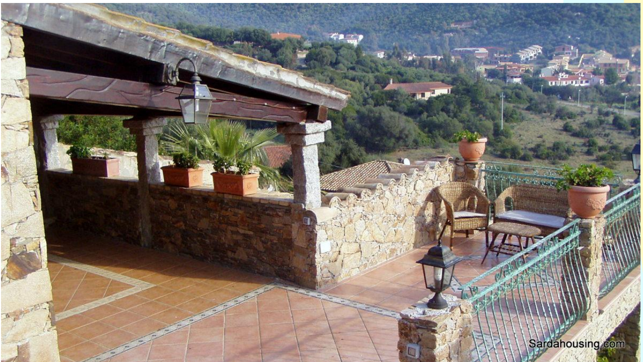
7 – Chia - Villa Domus: panoramic terrace