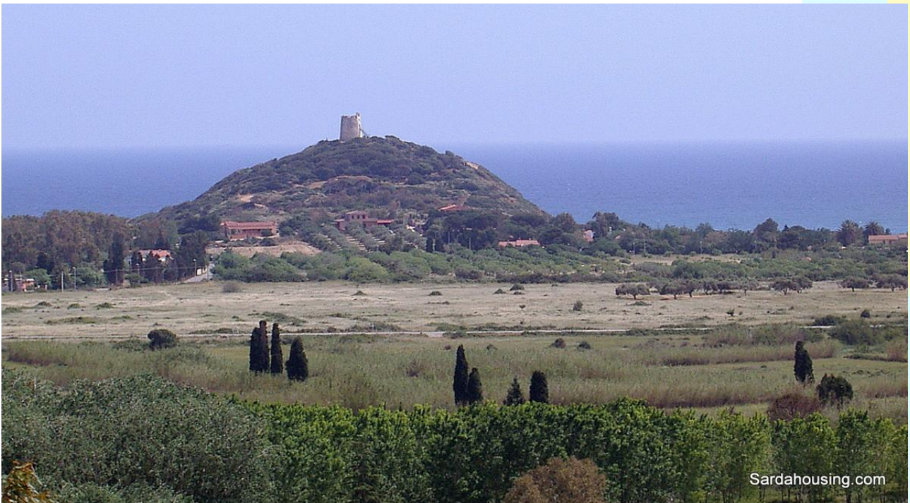
3 – Chia – Villa Domus:: a view from the villa