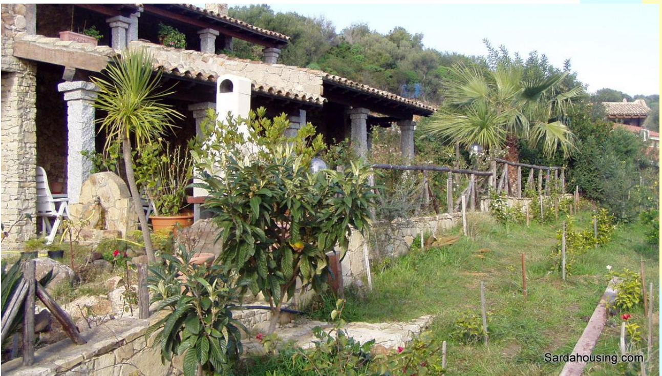
5 – Chia - Villa Domus: garden