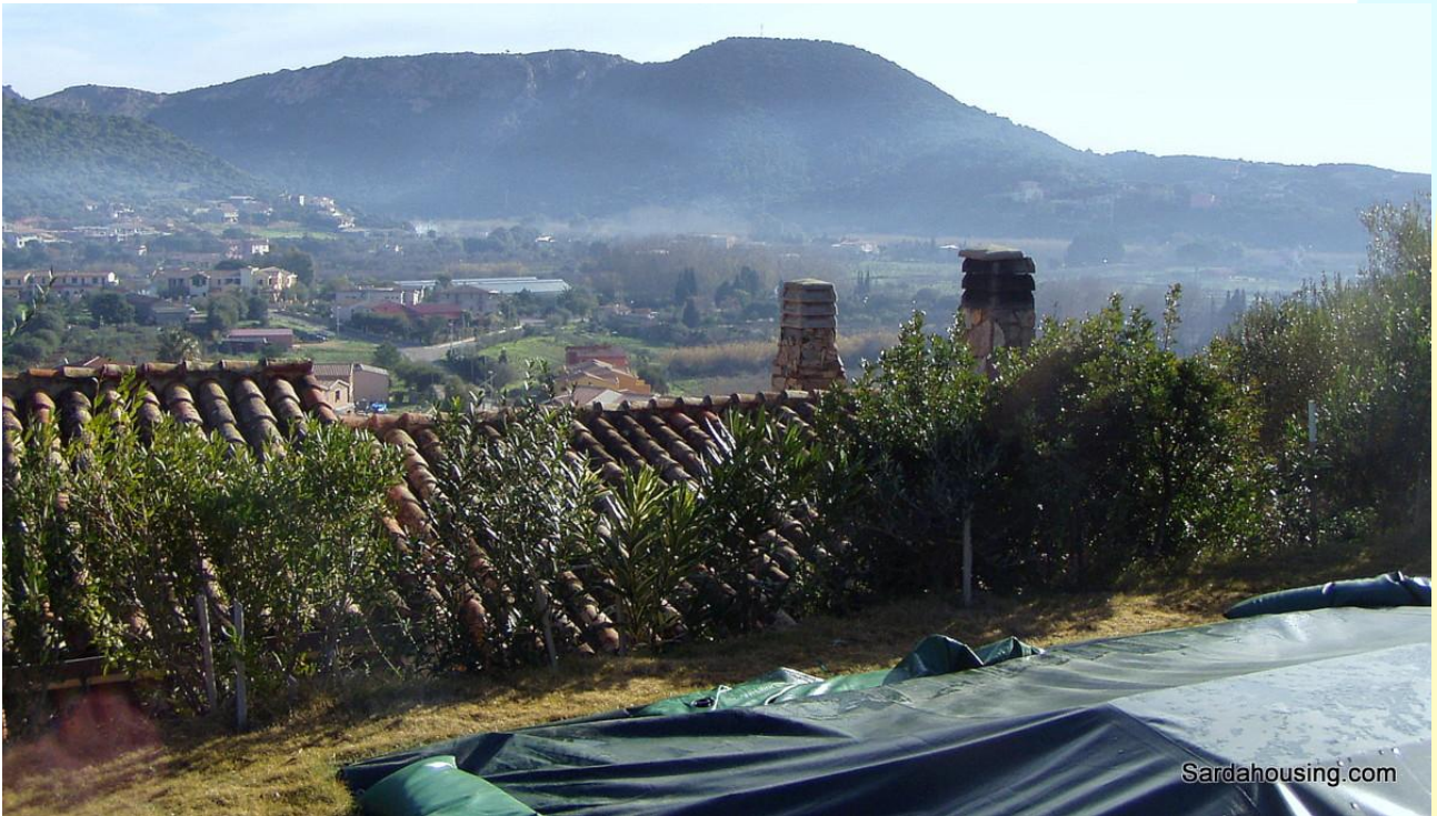
10- Chia - Villa Domus: swimming pool