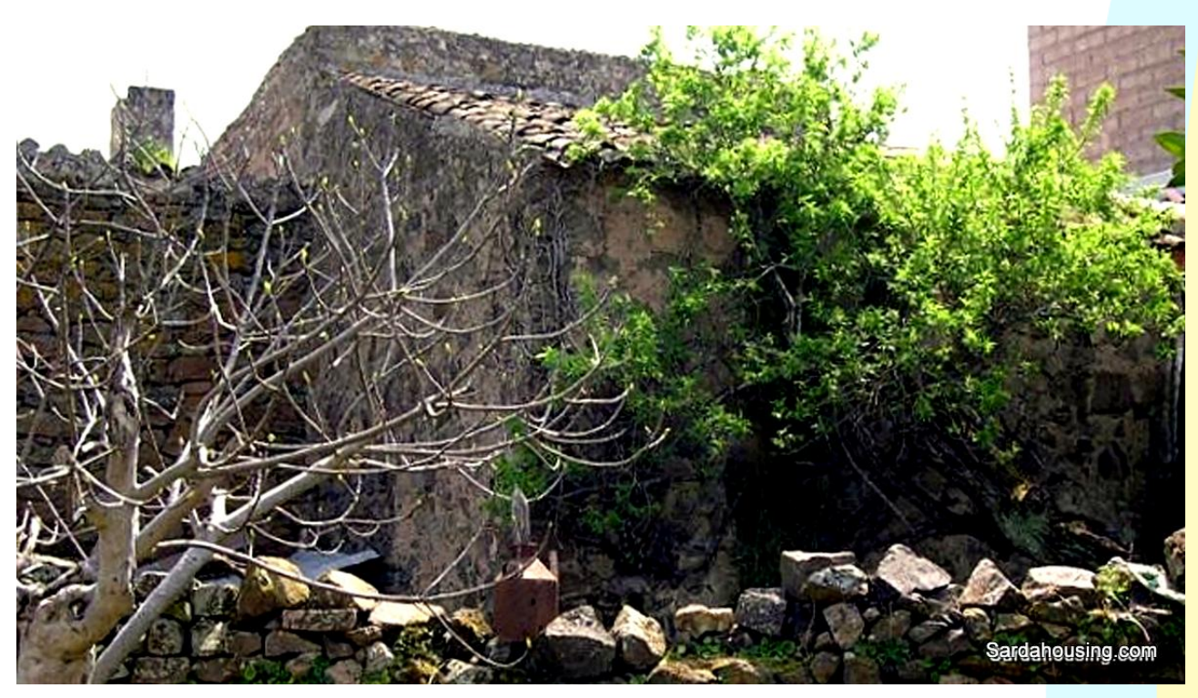
1 – House Il Mandorlo in Oschiri Sardinia: back garden

In the village of Oschiri we offer a semi-detached house with walls in local trachyte-stone , and a century old fire place . Completely to be restored .