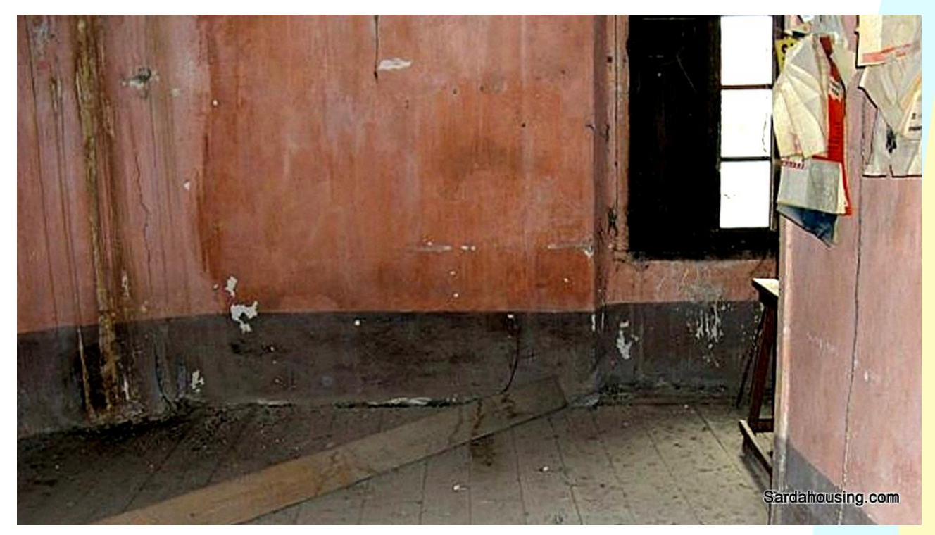
5 – House II Mandorlo in Oschiri Sardinia: interiors