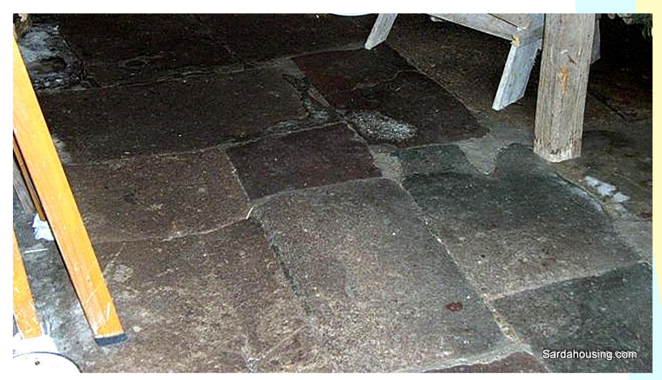
6– House II Mandorlo in Oschiri Sardinia: original granite floors