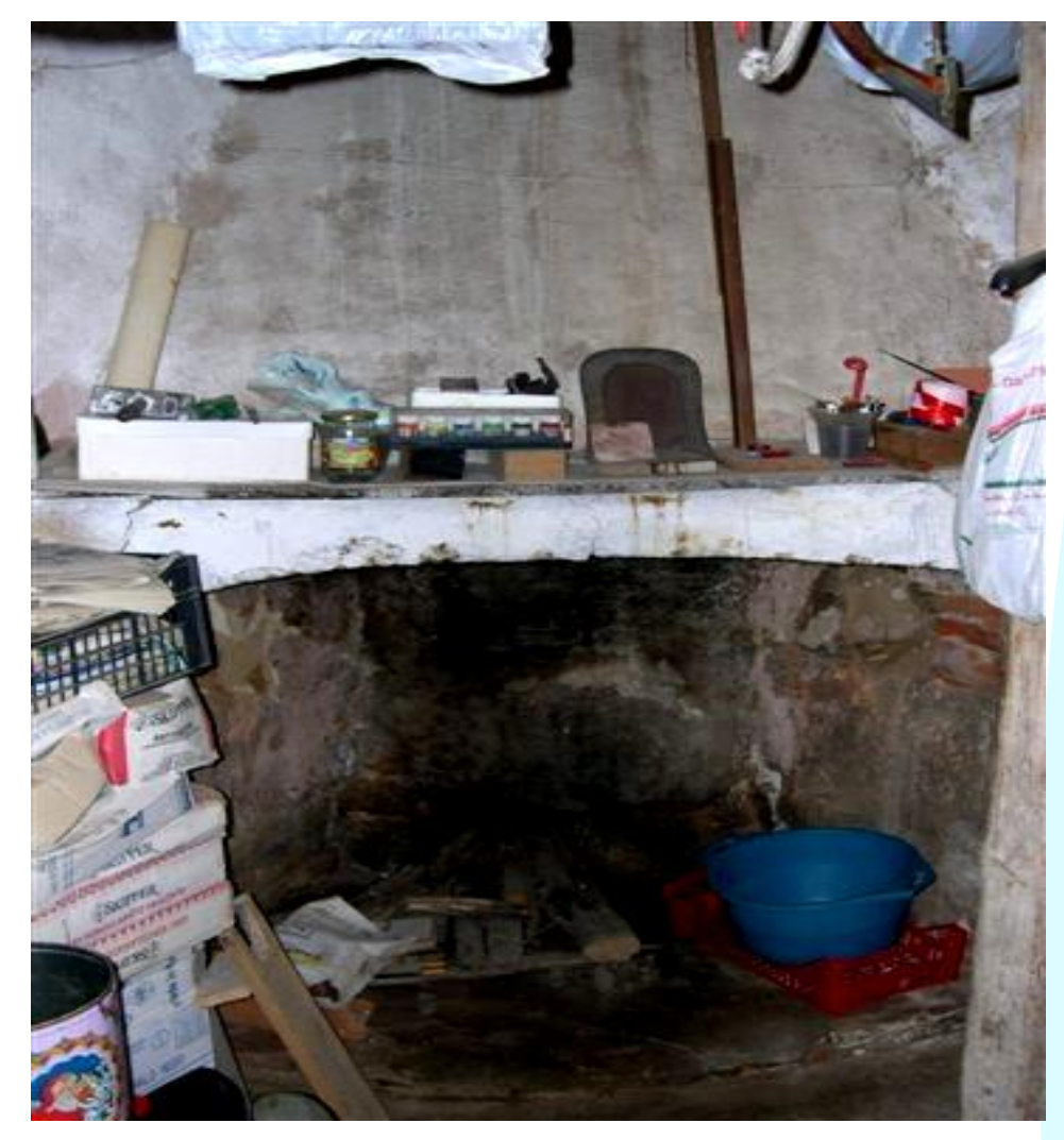
7 – House II Mandorlo in Oschiri Sardinia: original fireplace