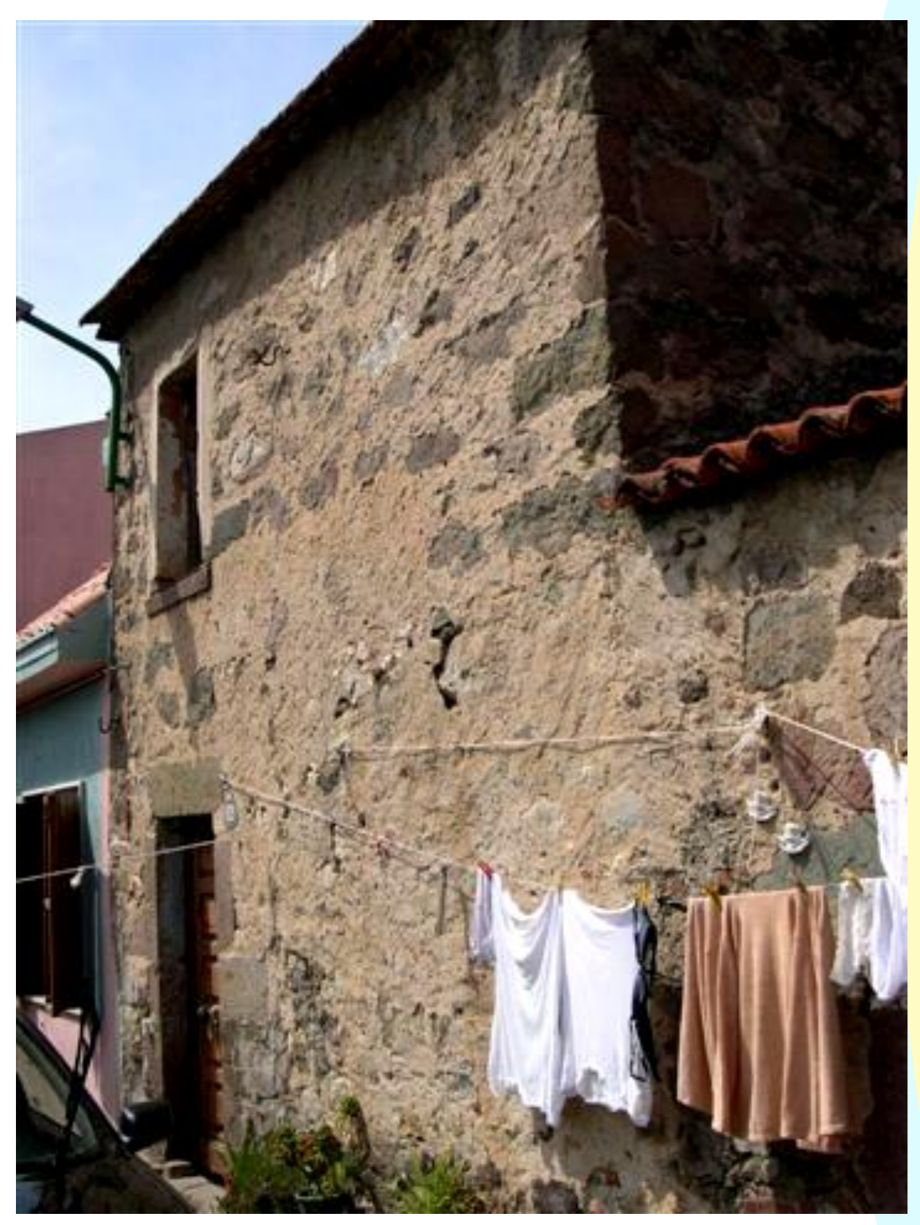
2 – House II Mandorlo in Oschiri Sardinia: front of the house