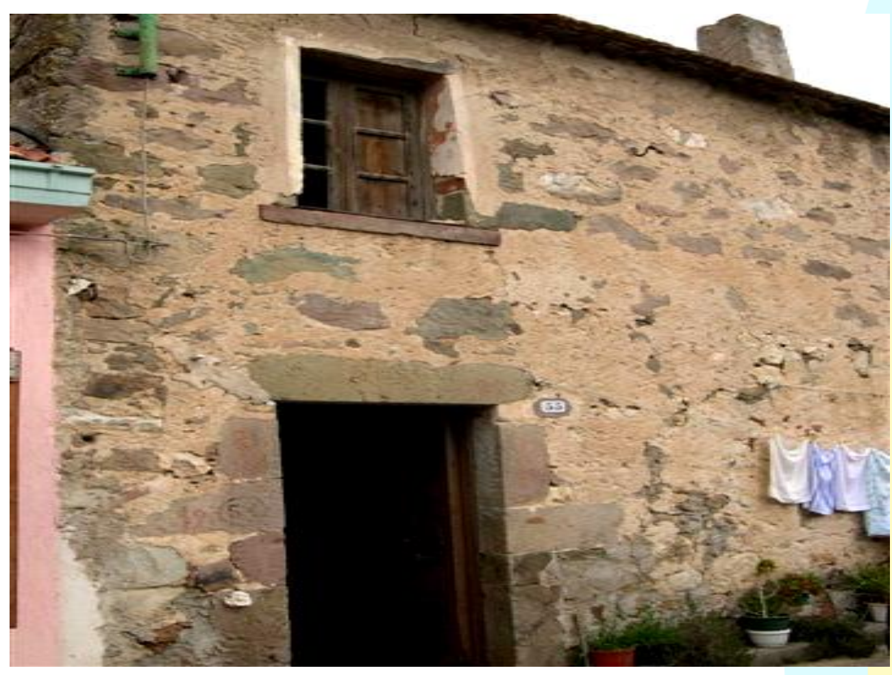
3 – House II Mandorlo in Oschiri Sardinia: front of the house