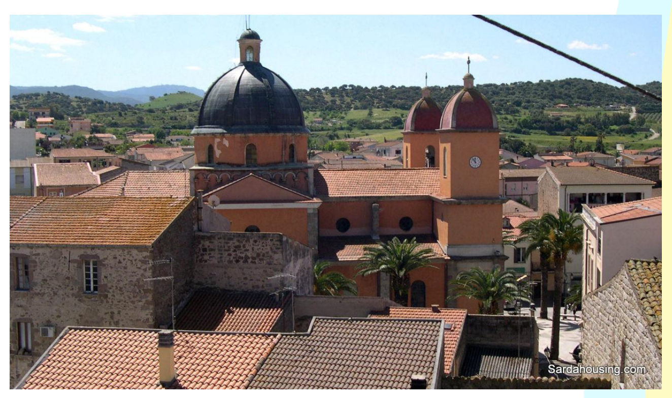
Oschiri, Sardegna – vista sul paese

was the first station in cave in Italy. The coasts of the lake, where you can enjoy boating, fishing and water sports, are an attraction for bird watchers. Along the coasts there are also the necropolis of Pedredu and the centre of Pianas Sa Murighessa with the church of San Leonardo, which belonged to the disappeared village Golianuti and is located on a high hilltop, at the foot of the Mount Limbara.