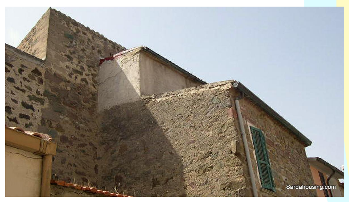
3 – Oschiri old centre, Sardinia – House Bua: back of the house