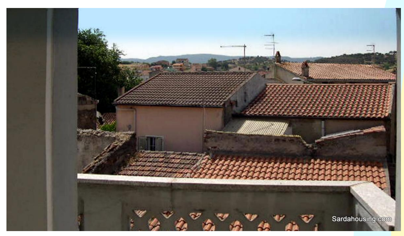
2 – Oschiri old centre, Sardinia – House Bua: a view from th ebalcony