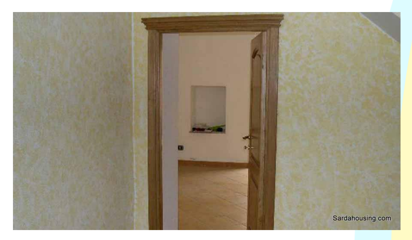
6 - Oschiri old centre, Sardinia - House Bua: renovated interiors