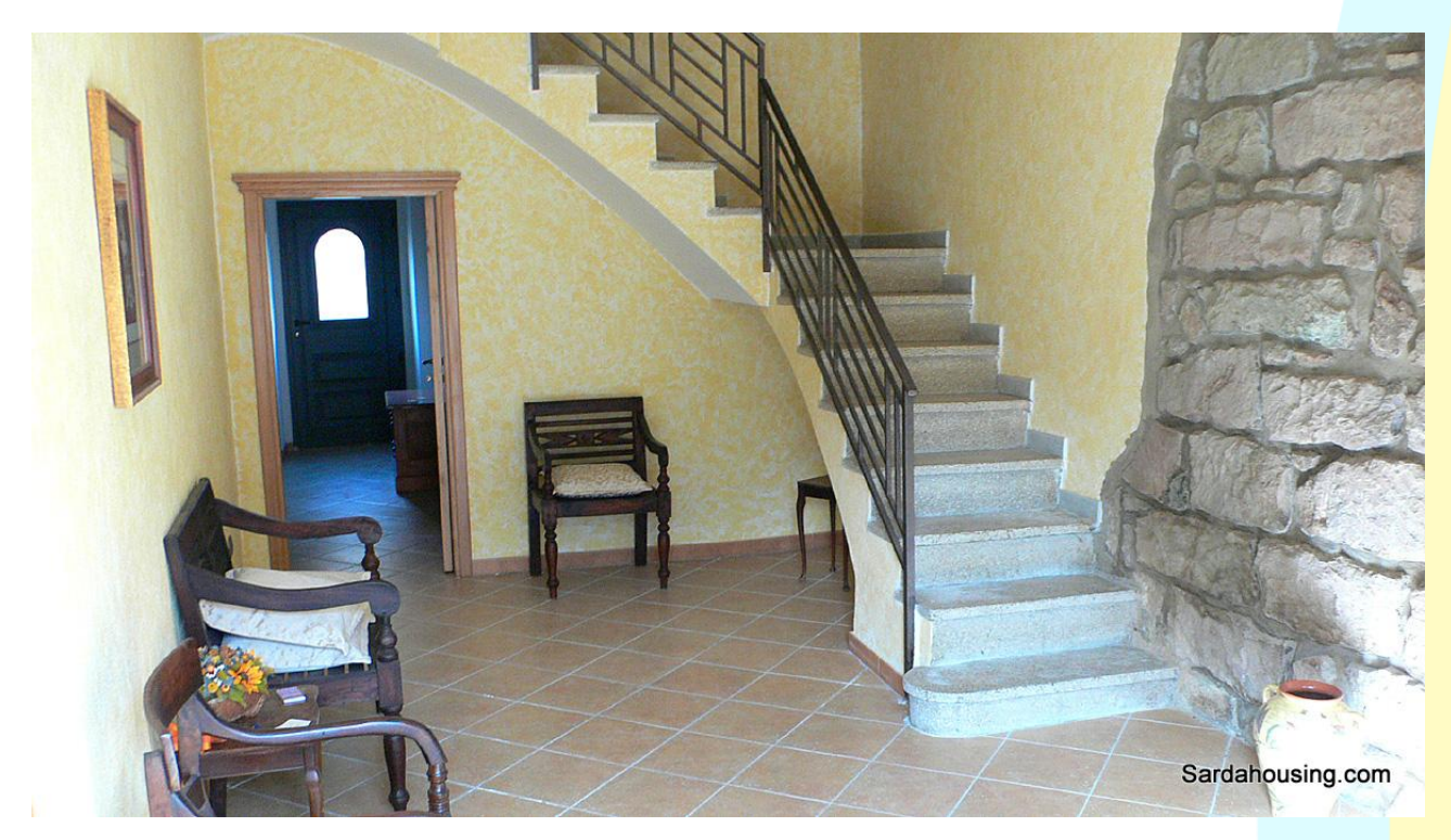
1 – Oschiri old centre, Sardinia – House Bua: interiors

In the village of Oschiri we offer a renovated house with entrances from two roads and balcony with views.