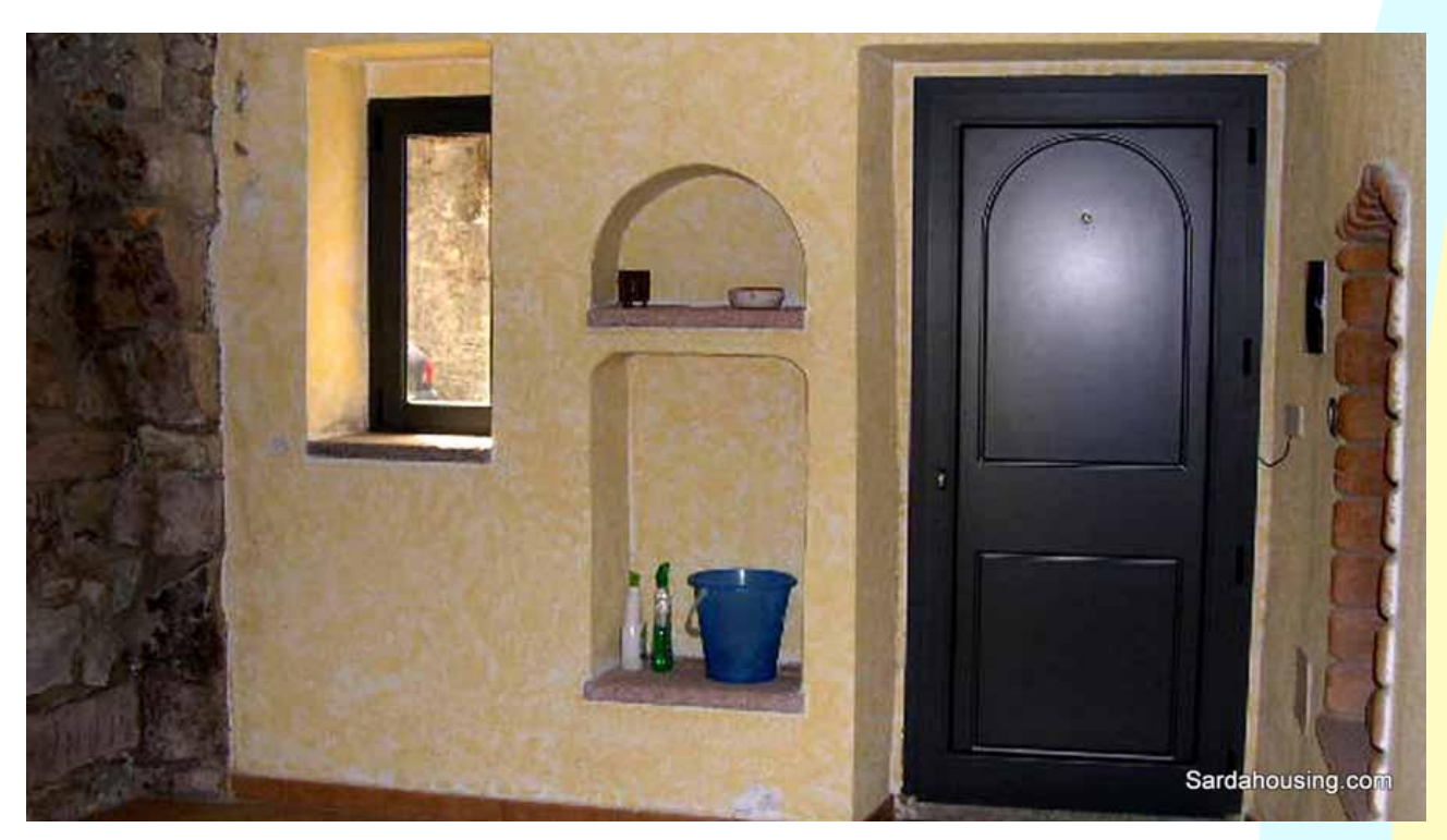
4 - Oschiri old centre, Sardinia – House Bua: entrance