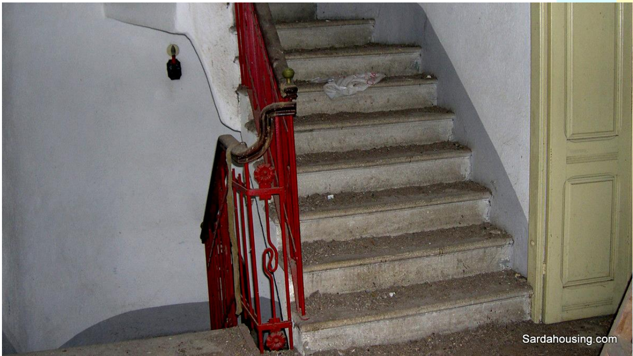
5 - Oschiri old centre, Sardinia – House Federico: interiors