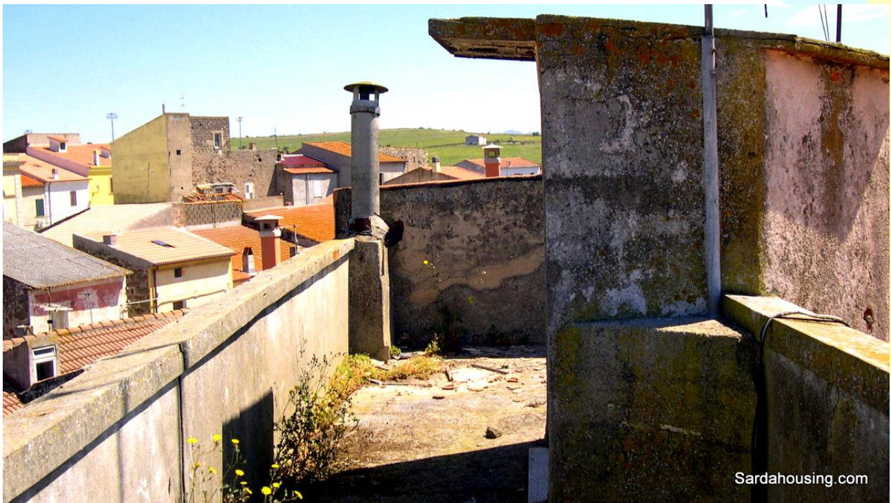
7 - Oschiri old centre, Sardinia – House Federico: terrace with views of the village