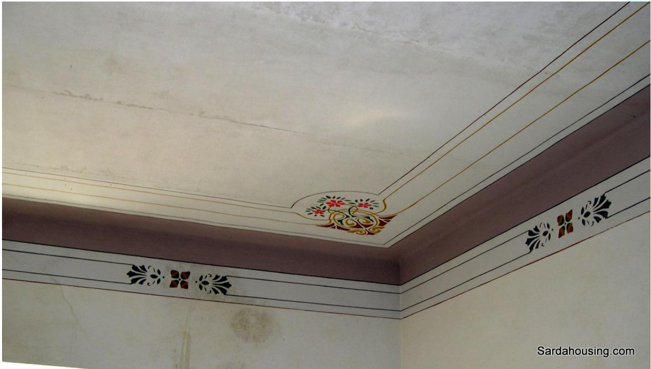
4 - Oschiri old centre, Sardinia – House Federico: original ceilings