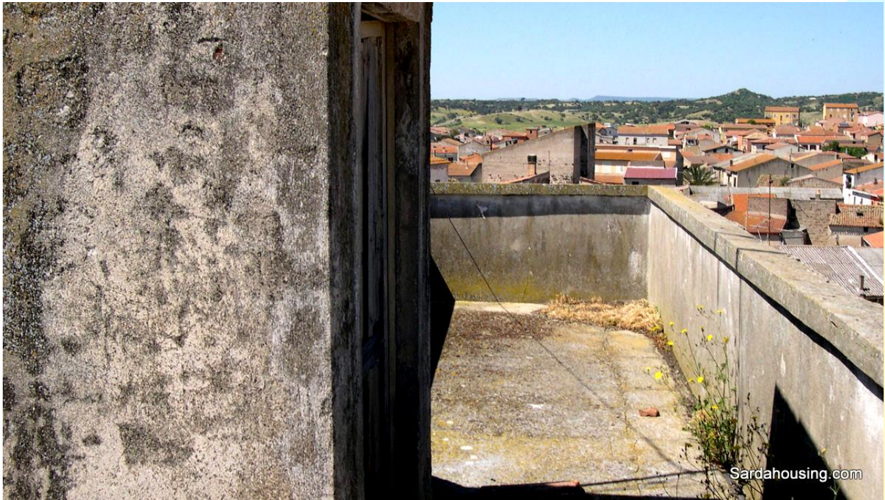
6 - Oschiri old centre, Sardinia – House Federico: terrace with views of the village