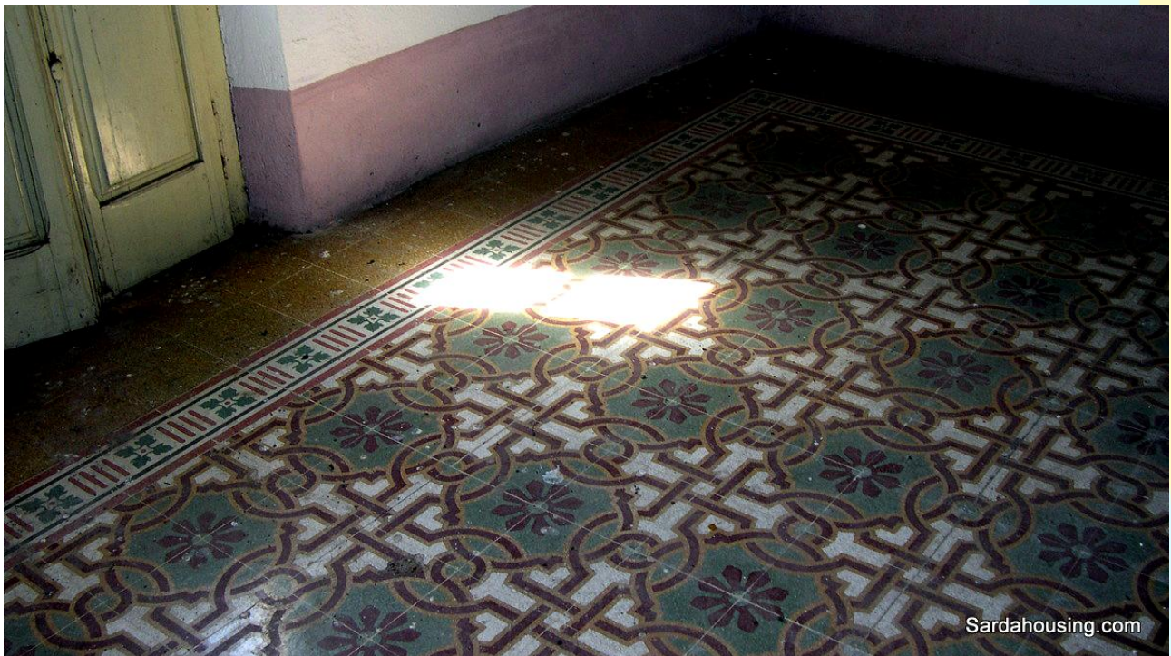
3 - Oschiri old centre, Sardinia – House Federico: original floor tiles