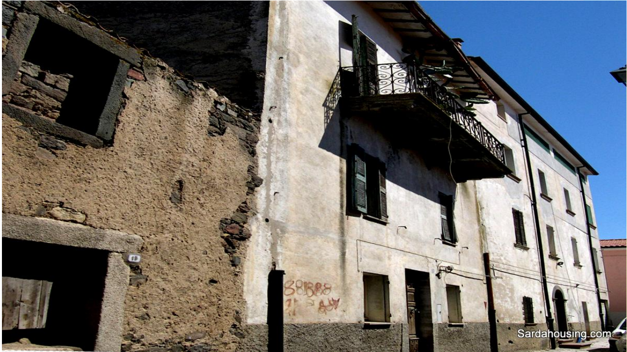
1 – Oschiri old centre, Sardinia – House Federico: front of the house

In the old centre of Oschiri we offer a typical old manor house to be renovated , with a small garden , a balcony and a terrace .