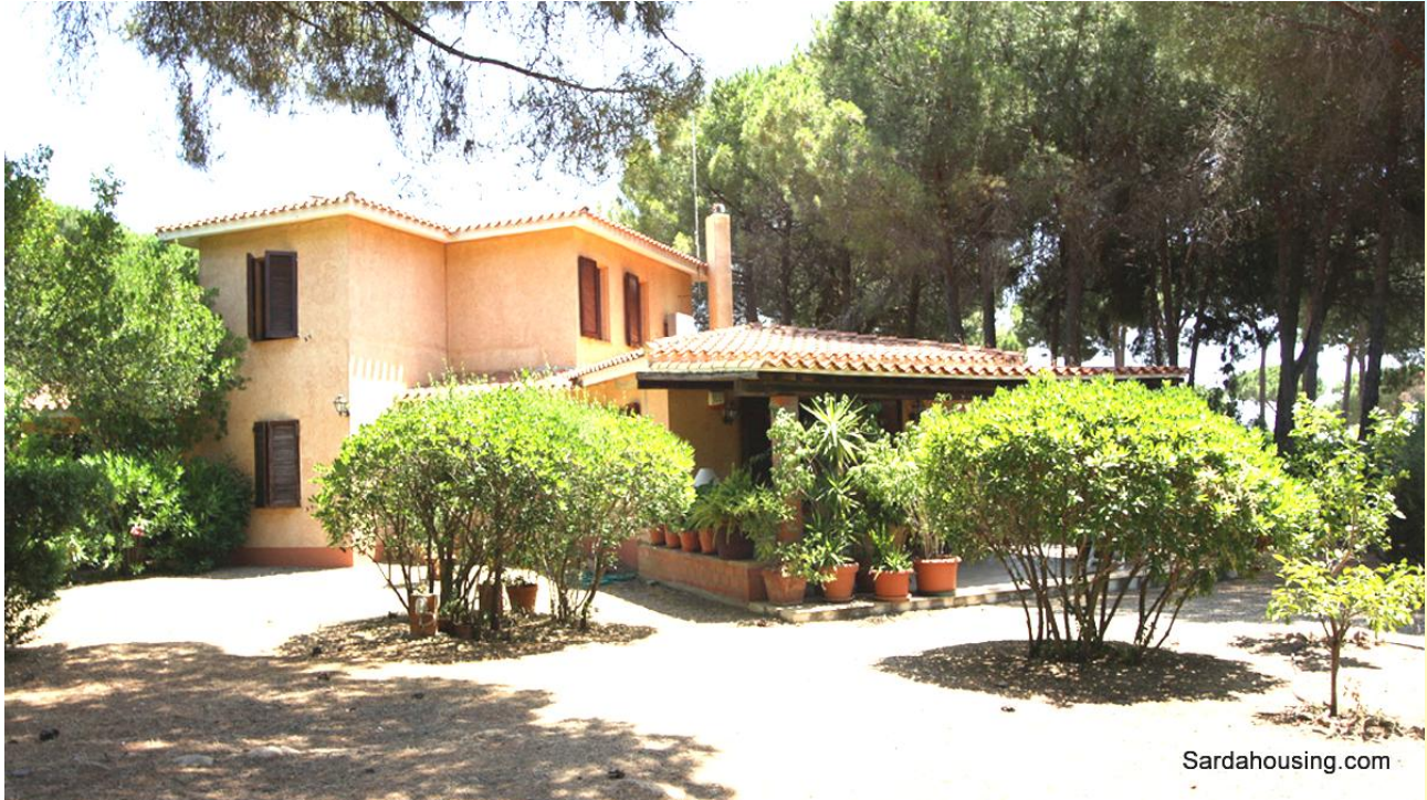
1 – S. Margherita di Pula - Condominio Pineta Is Morus: Villa Ortensia: 250 m to the beach

In S. Margherita di Pula, along southern coast in Sardinia , a nice Villa 250 m to the sea , inside the exclusive condo Comunione Pineta Is Morus .