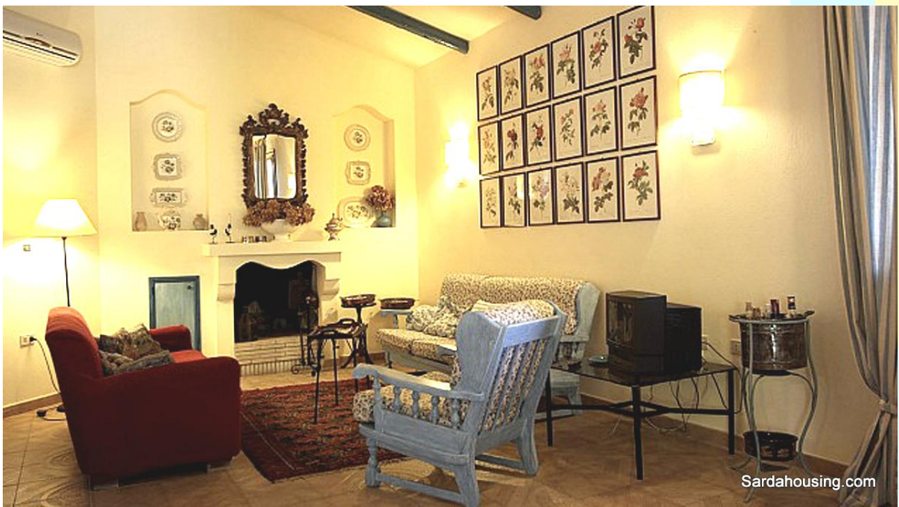
3 – S. Margherita di Pula - Condominio Pineta Is Morus: Villa Ortensia: living room with fireplace