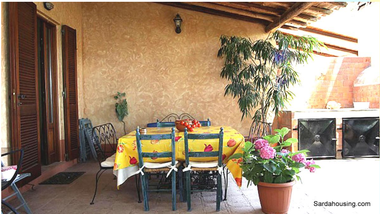
5 - S. Margherita di Pula - Condominio Pineta Is Morus: Villa Ortensia: veranda and outdoor kitchen