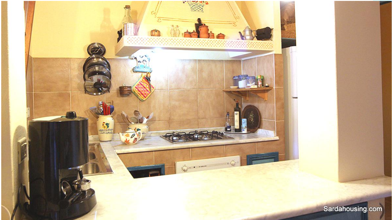
4 – S. Margherita di Pula - Condominio Pineta Is Morus: Villa Ortensia: kitchen