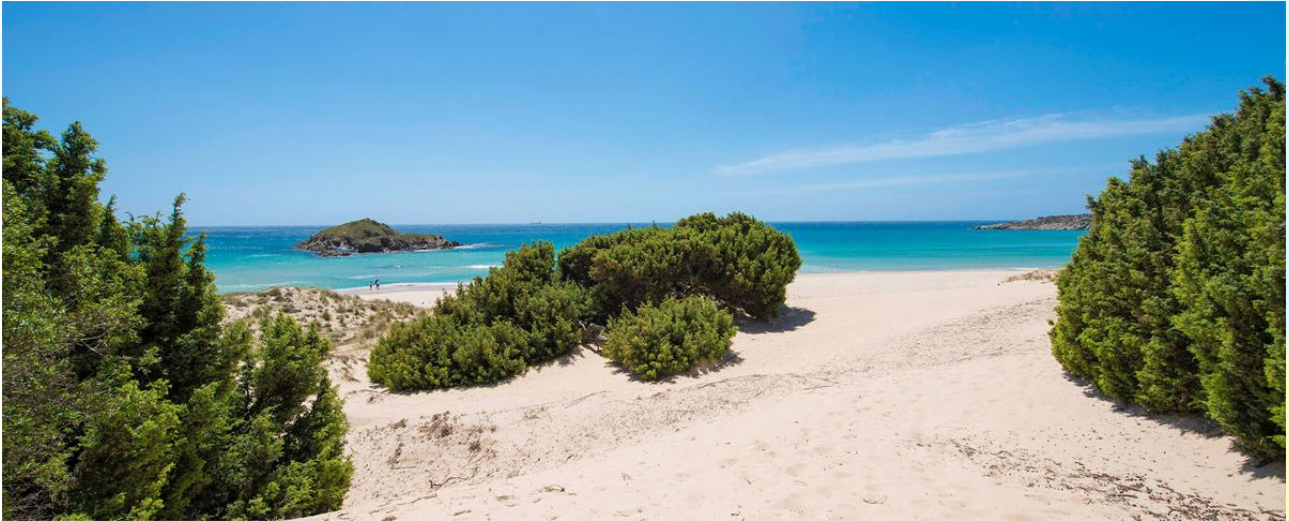
7 - S. Margherita di Pula - Condominio Pineta Is Morus: Villa Ortensia: Beach Is Morus