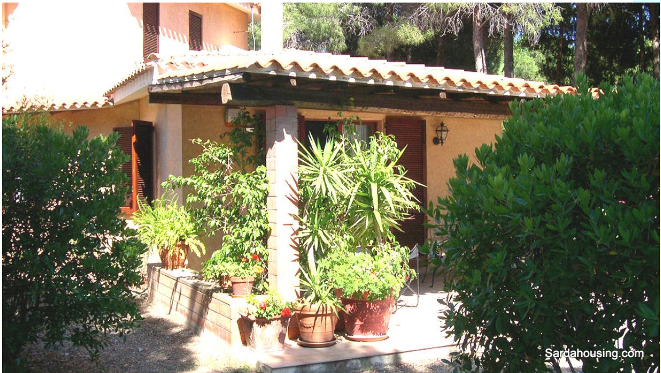
2 – S. Margherita di Pula - Condominio Pineta Is Morus: Villa Ortensia: veranda