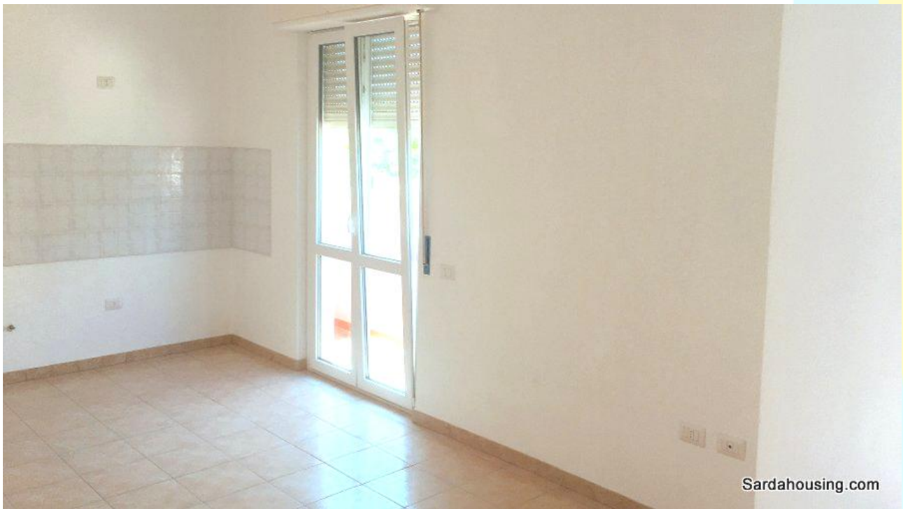
5 – Soleminis – Via della Libertà – Apartment Libertà with garage: living room with kitchenette