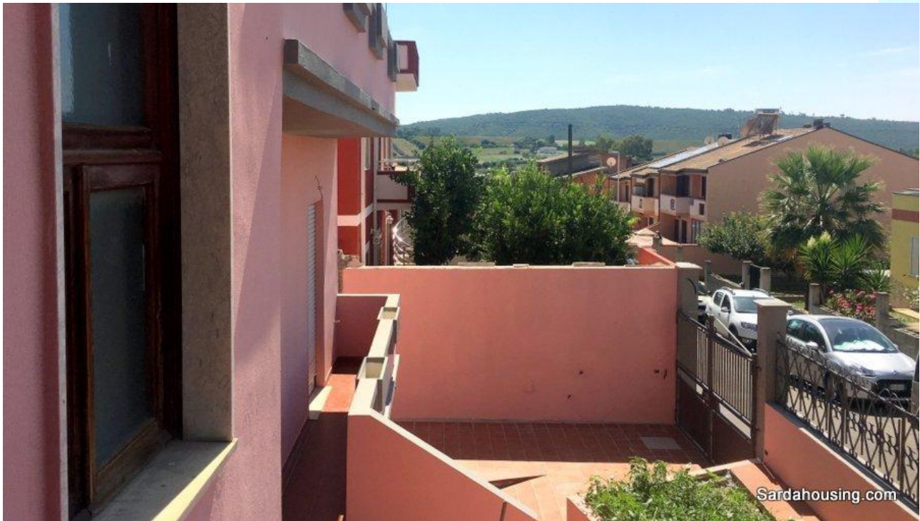
8 - Soleminis – Via della Libertà – Apartment Libertà with garage: a panoramic view