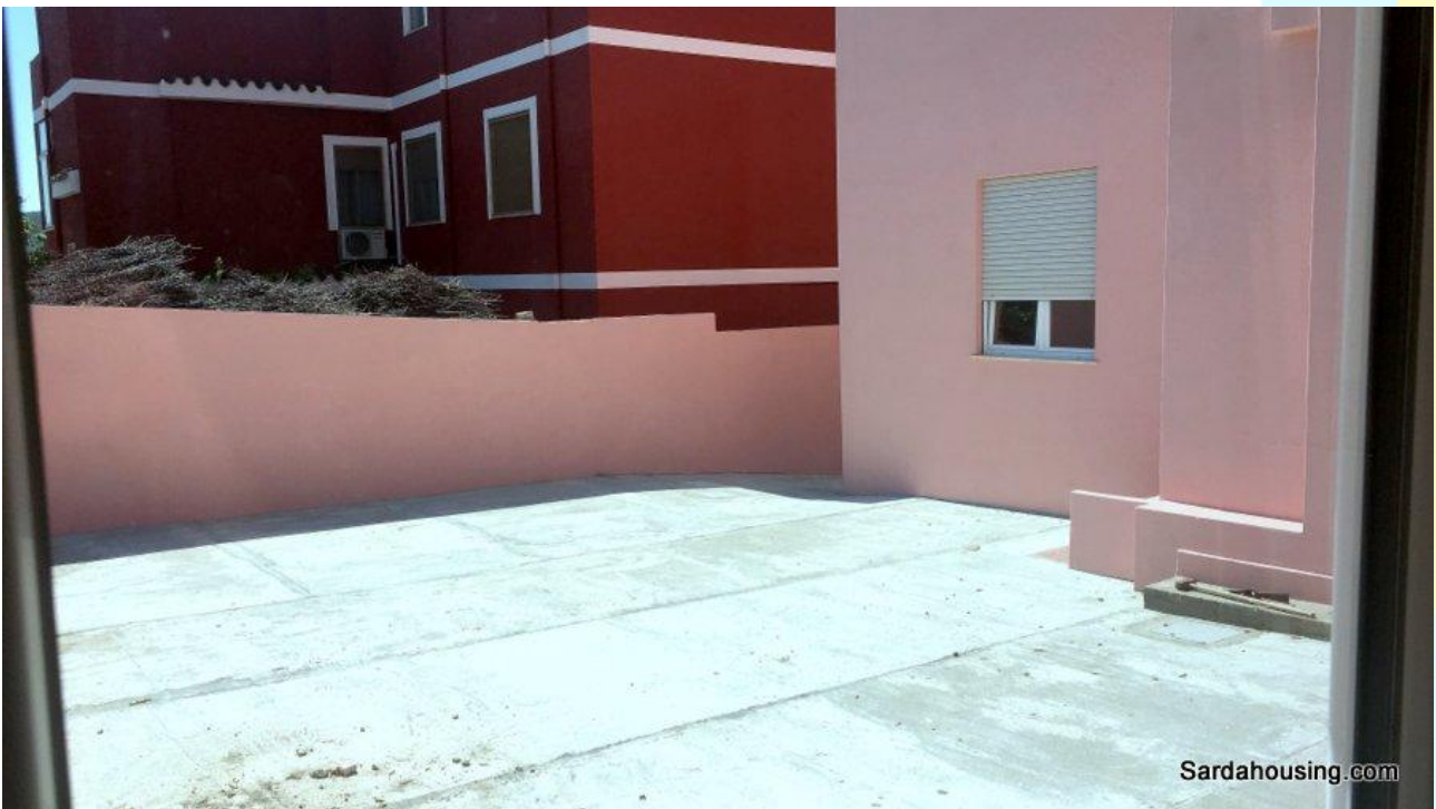
3 – Soleminis – Via della Libertà – Apartment Libertà with garage: courtyard