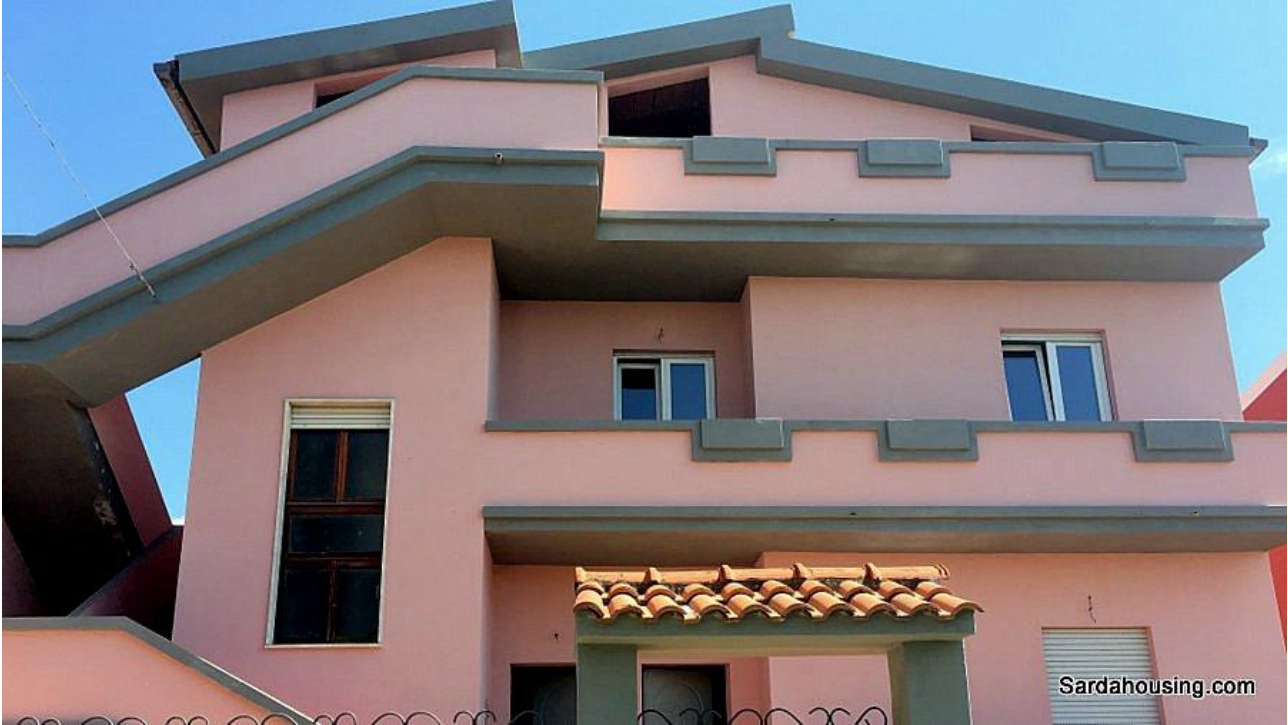
1 – Soleminis – Via della Libertà – Apartment Libertà with garage: building front

In Soleminis, in Cagliari hinterland, we offer a ground floor apartment with a large garage.