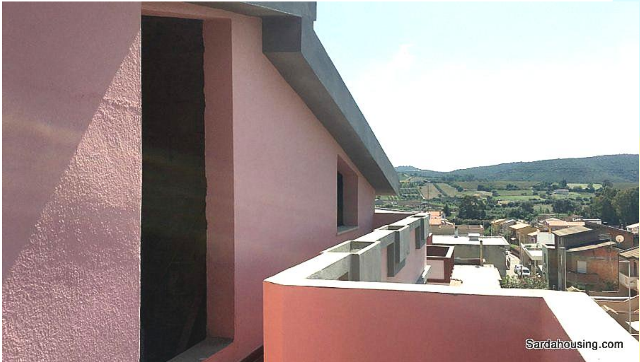
4 – Soleminis – Via della Libertà – Apartment Libertà with garage: a view from the building