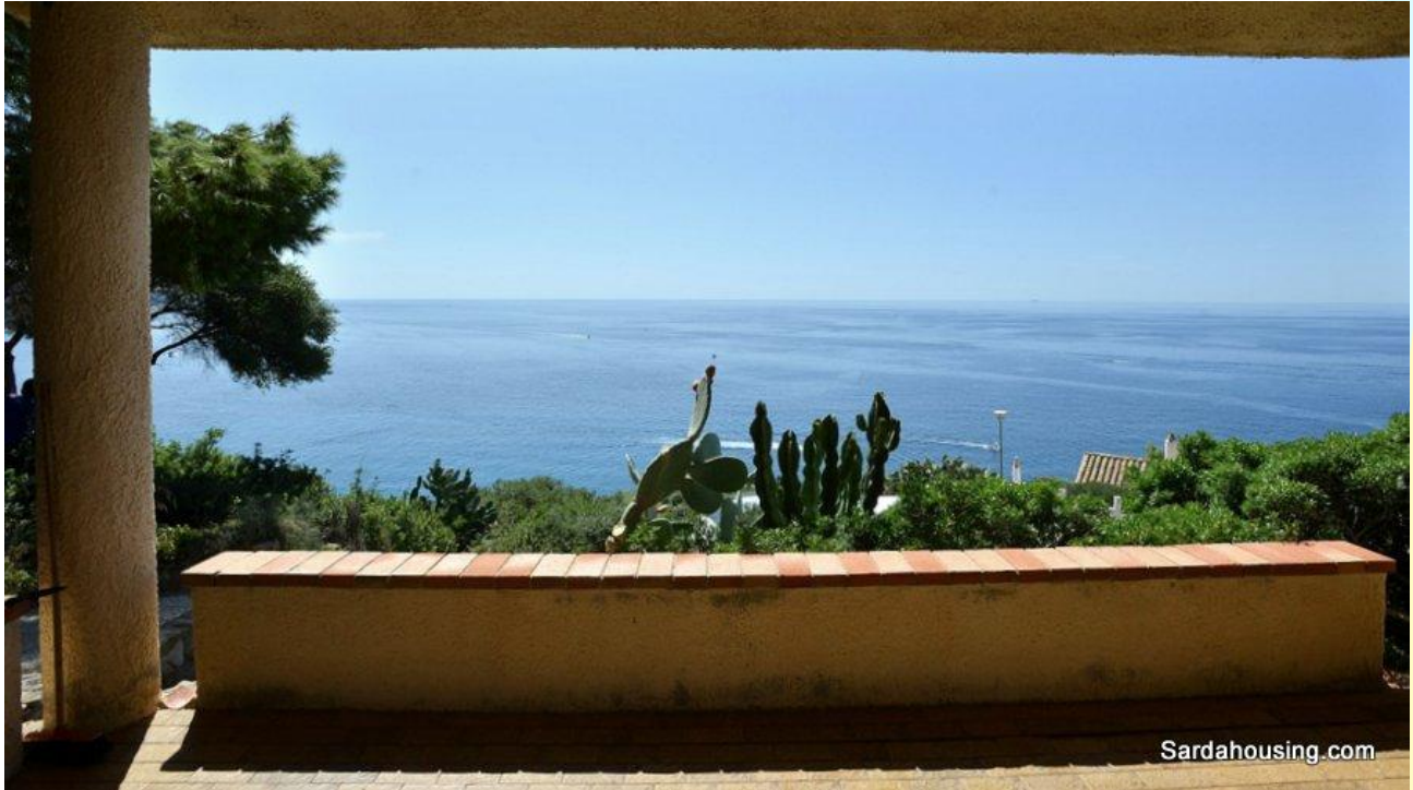
12 - Torre delle Stelle – Villa Delfino: sea view