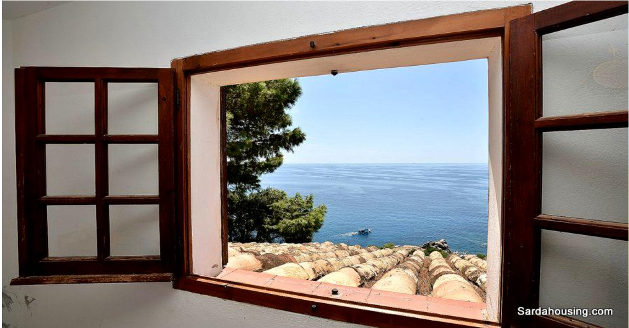
4 – Torre delle Stelle – Villa Delfino: bedroom with sea views