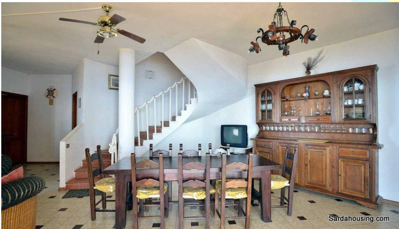
7 – Torre delle Stelle – Villa Delfino: lounge