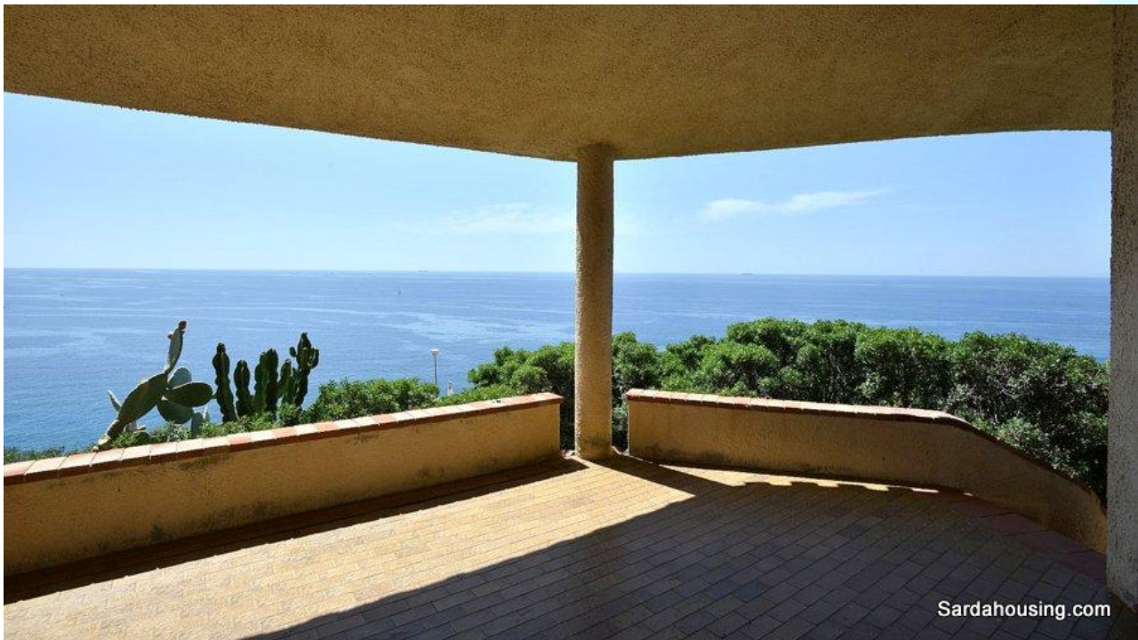
6 – Torre delle Stelle – Villa Delfino: a sea view