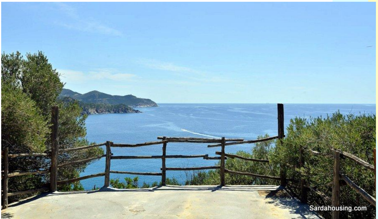
9 – Torre delle Stelle – Villa Delfino: sea view from the garden