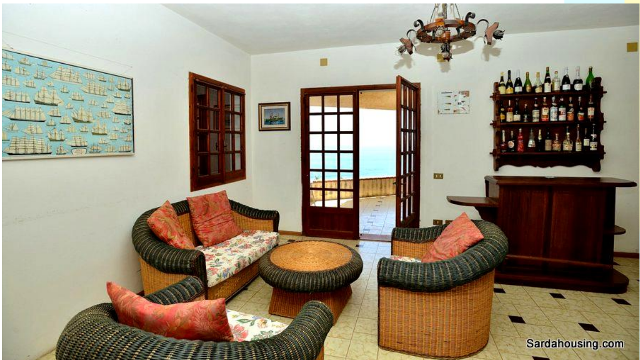
3 – Torre delle Stelle – Villa Delfino: lounge with sea views

All bedrooms and the two bathrooms on the first floor have a wonderful view directly on the sea .