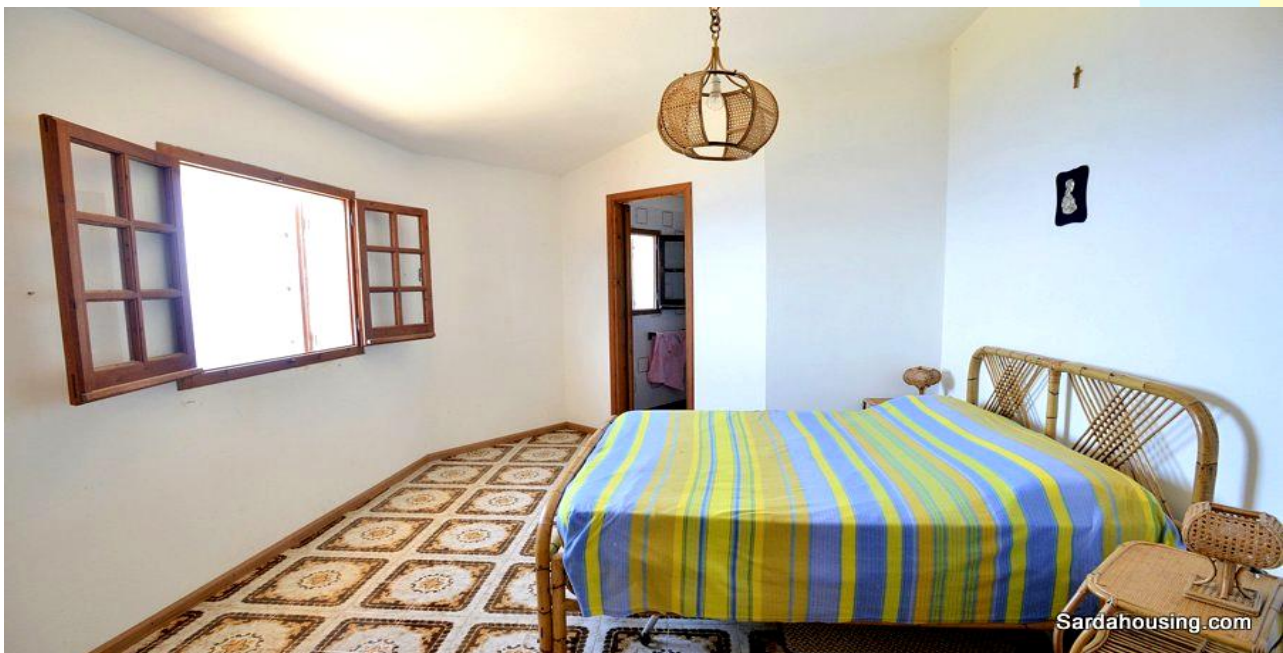
5 – Torre delle Stelle – Villa Delfino: double bedroom en-suite

info@sardahousing.com - www.sardahousing.com