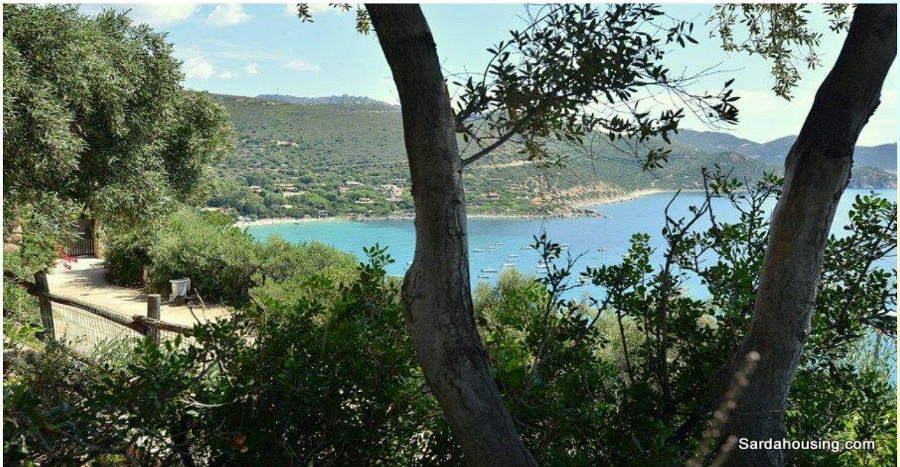
10 – Torre delle Stelle – Villa Delfino: sea view from the garden