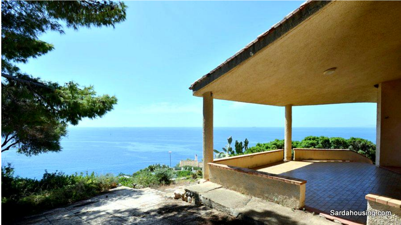
1 – Torre delle Stelle – Villa Delfino: a sea view from a porch

In Torre delle Stelle , 100 metres from Cala Delfino , we offer a detached villa with stunning the sea views and a beautiful garden .