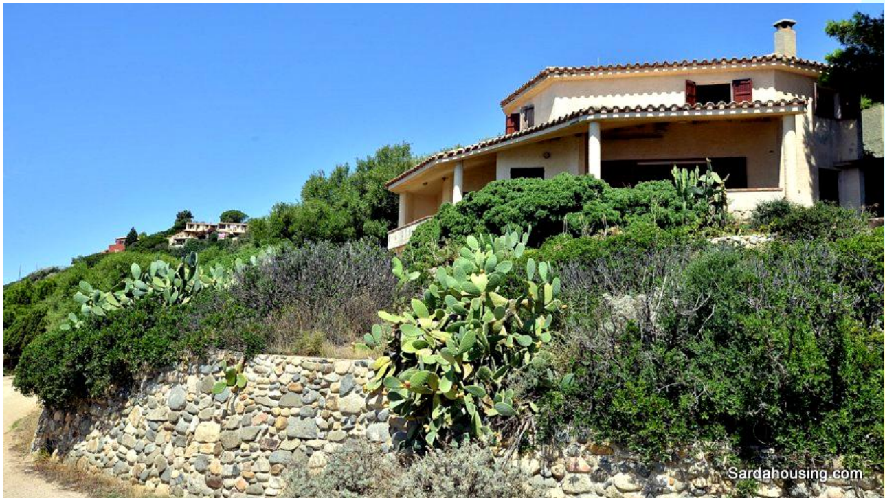
2 – Torre delle Stelle – Villa Delfino: panoramic location between beaches Genn'e Mari e Cann'e Sisa

A comfortable staircase leads from the living room to the first floor , where we find a large double bedroom with private bathroom with tub; three large bedrooms , a third bathroom with shower and a utility room with window.