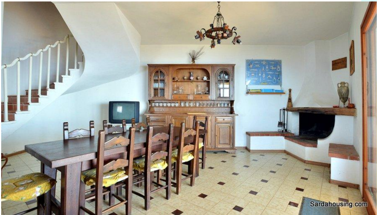
8 – Torre delle Stelle – Villa Delfino: lounge with fireplace