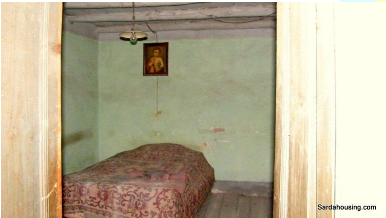
11 - Santu Lussurgiu – old centre - House La Volta: wooden beam floors