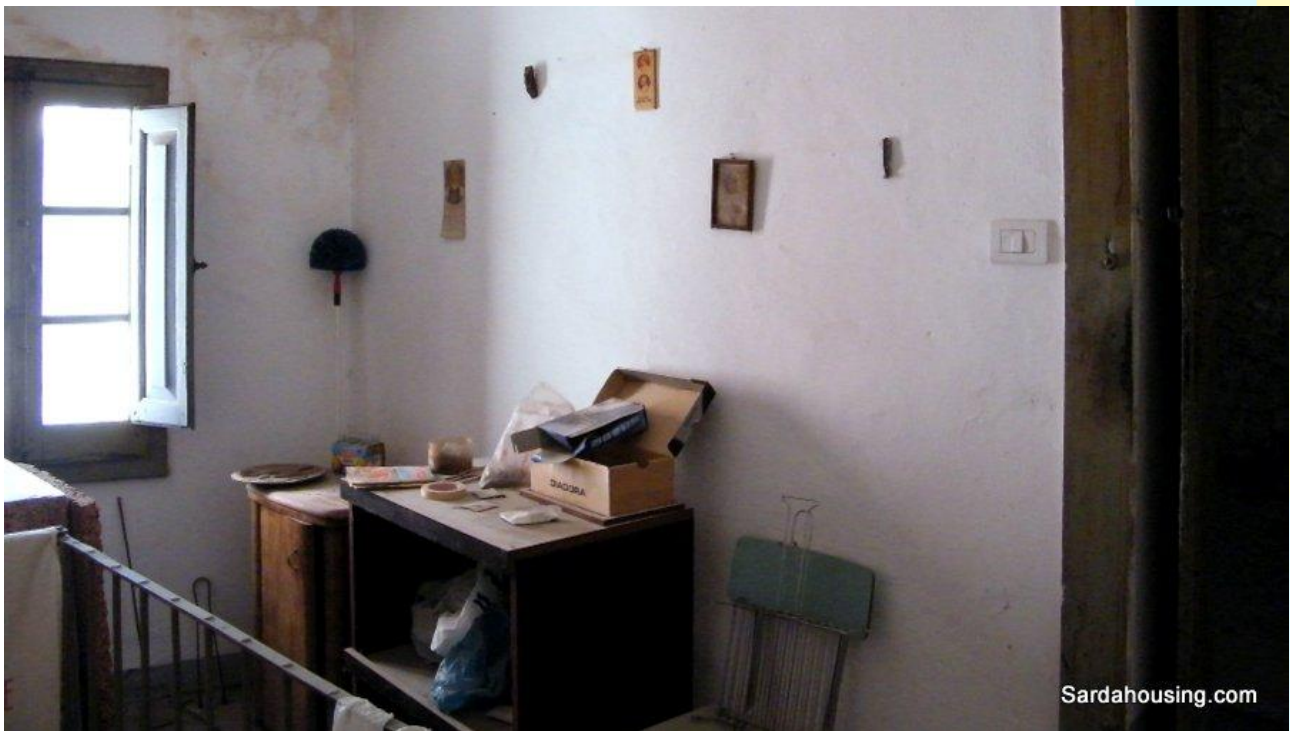
13 - Santu Lussurgiu – old centre - House La Volta: top floor