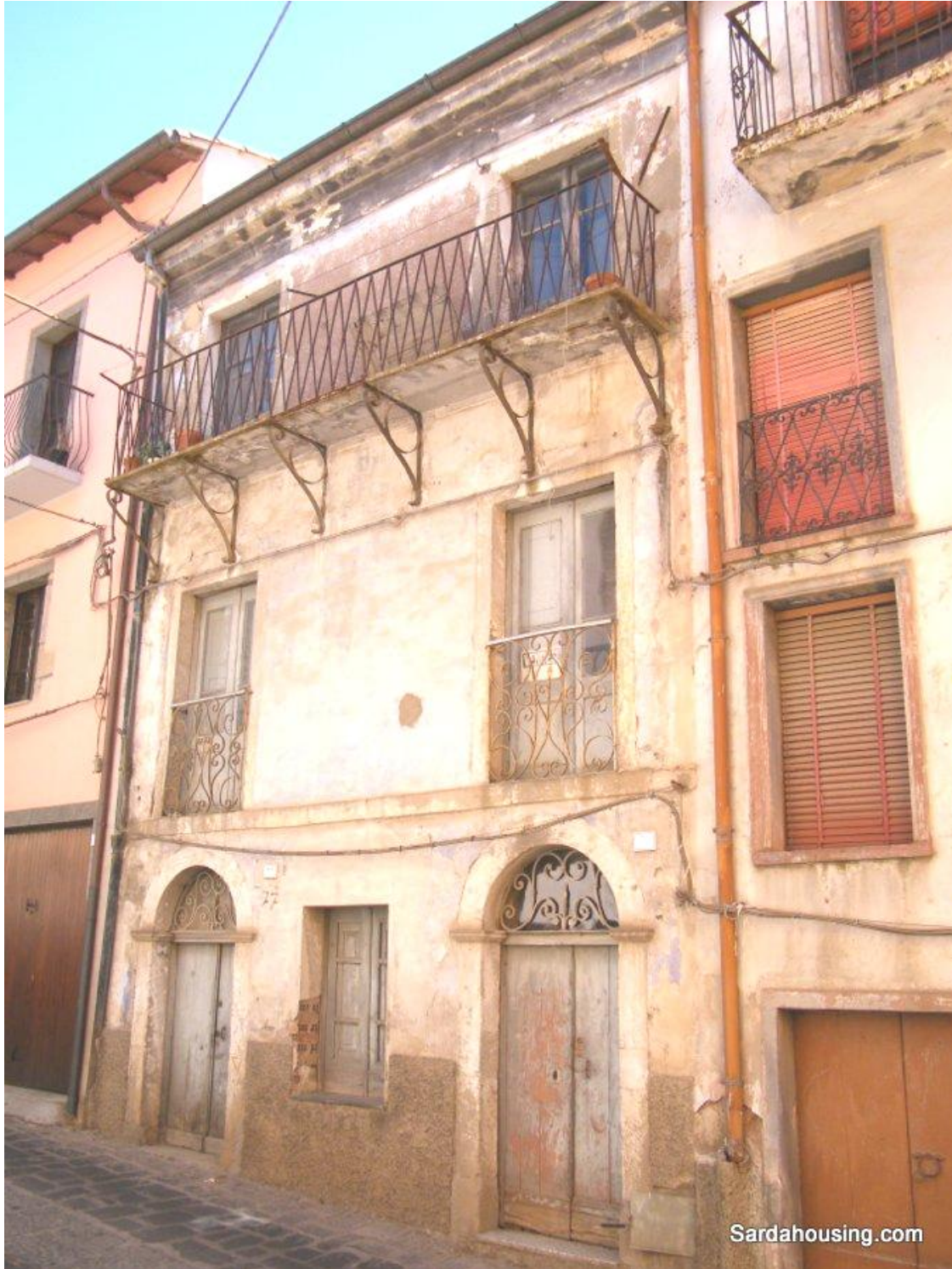
1 – Santu Lussurgiu – old centre - House La Volta: facade

In the old centre of Santu Lussurgiu , an ancient village in central-western Sardinia , we offer a partially renovated historic house .