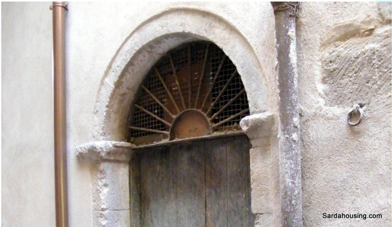
- Santu Lussurgiu – old centre - House La Volta: carved stone cornices