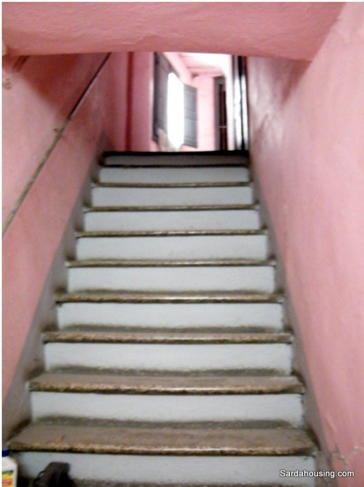
19 – Santu Lussurgiu – old centre - House La Volta: internal stairs