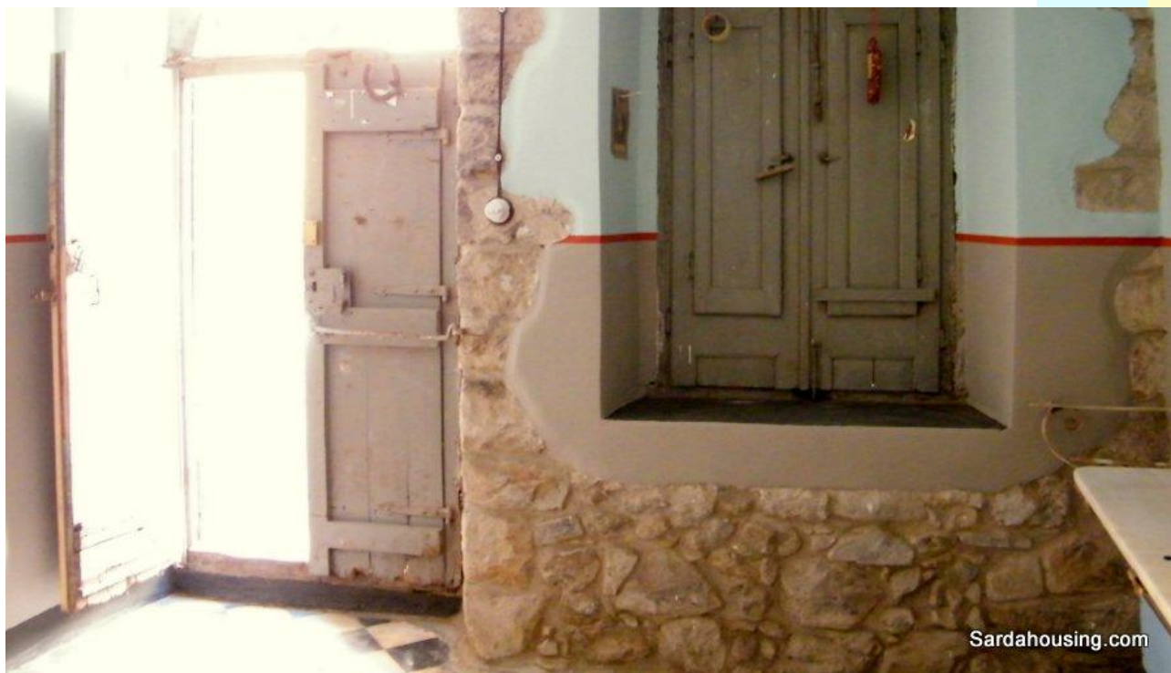
7 - Santu Lussurgiu – old centre - House La Volta: entrance room