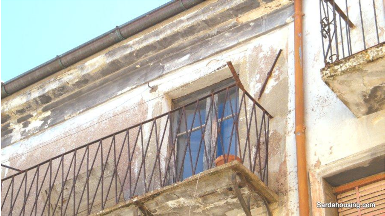
3 - Santu Lussurgiu – old centre - House La Volta: balcony at the upper floor

A part of the roof was redone in 2019 with insulation cork boarding (18 cm), another part is to be restored.