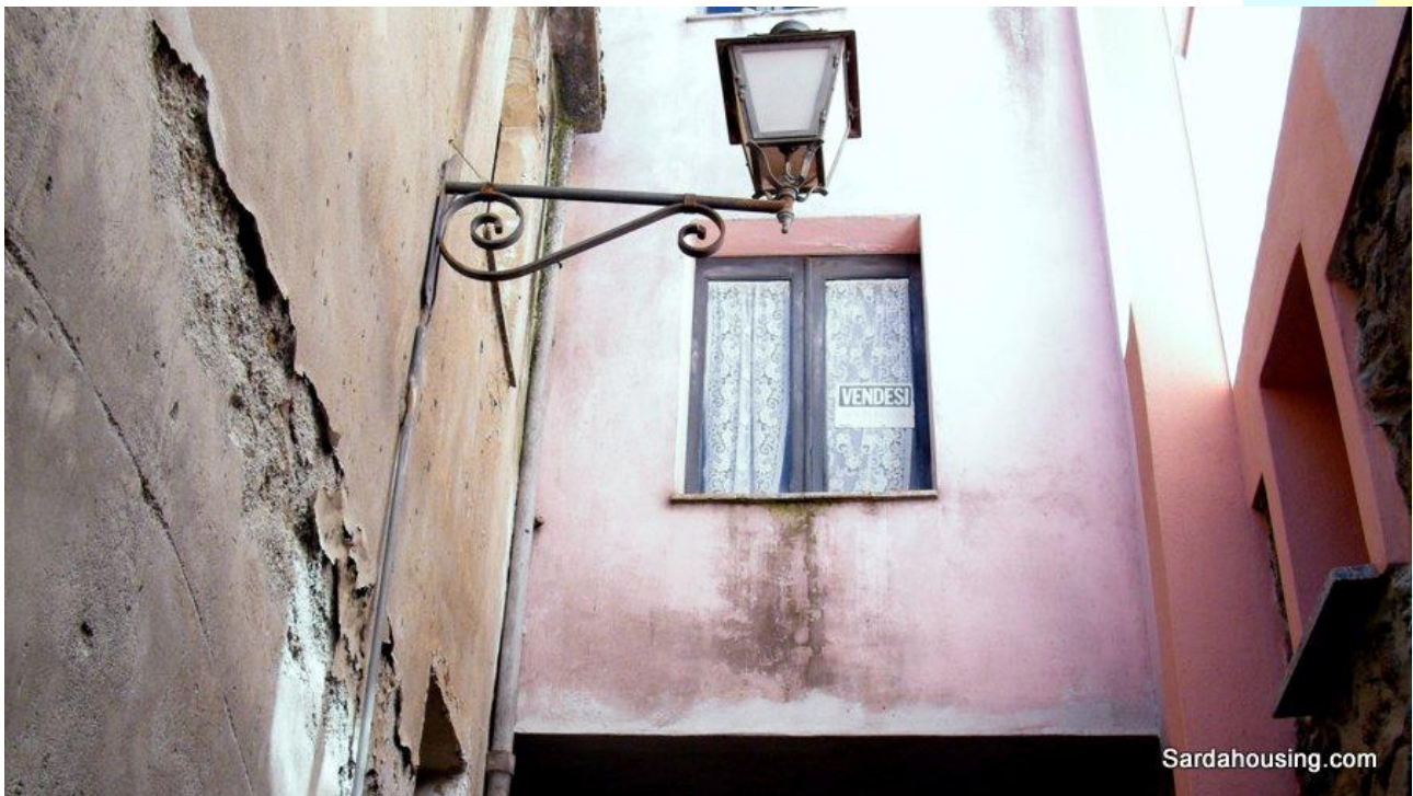
5 - Santu Lussurgiu – old centre - House La Volta: a part of the house is over the alley