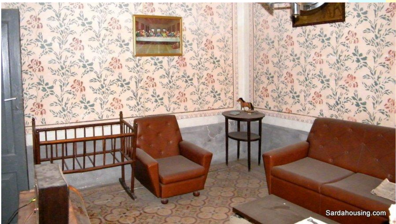
9 - Santu Lussurgiu – old centre - House La Volta: a room with original floor tiles