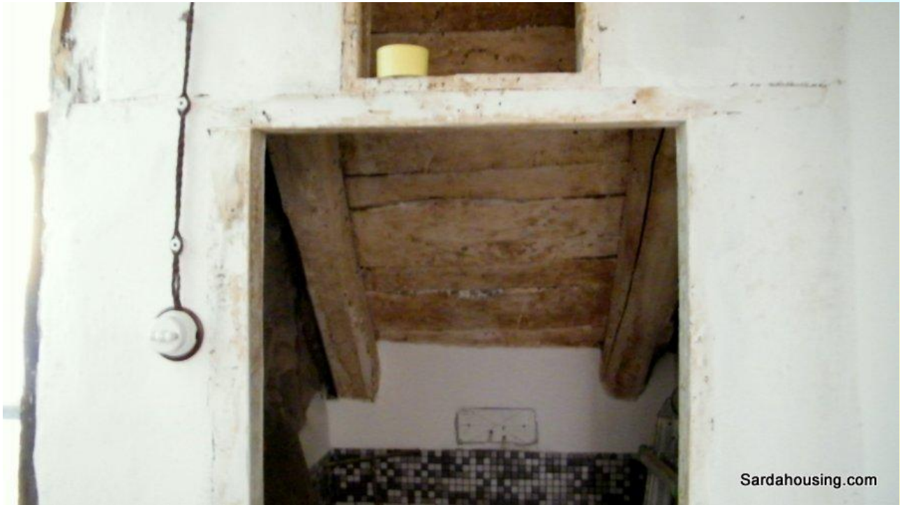
12 - Santu Lussurgiu – old centre - House La Volta: a particular view