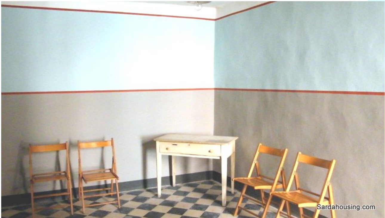
8 - Santu Lussurgiu – old centre - House La Volta: inside