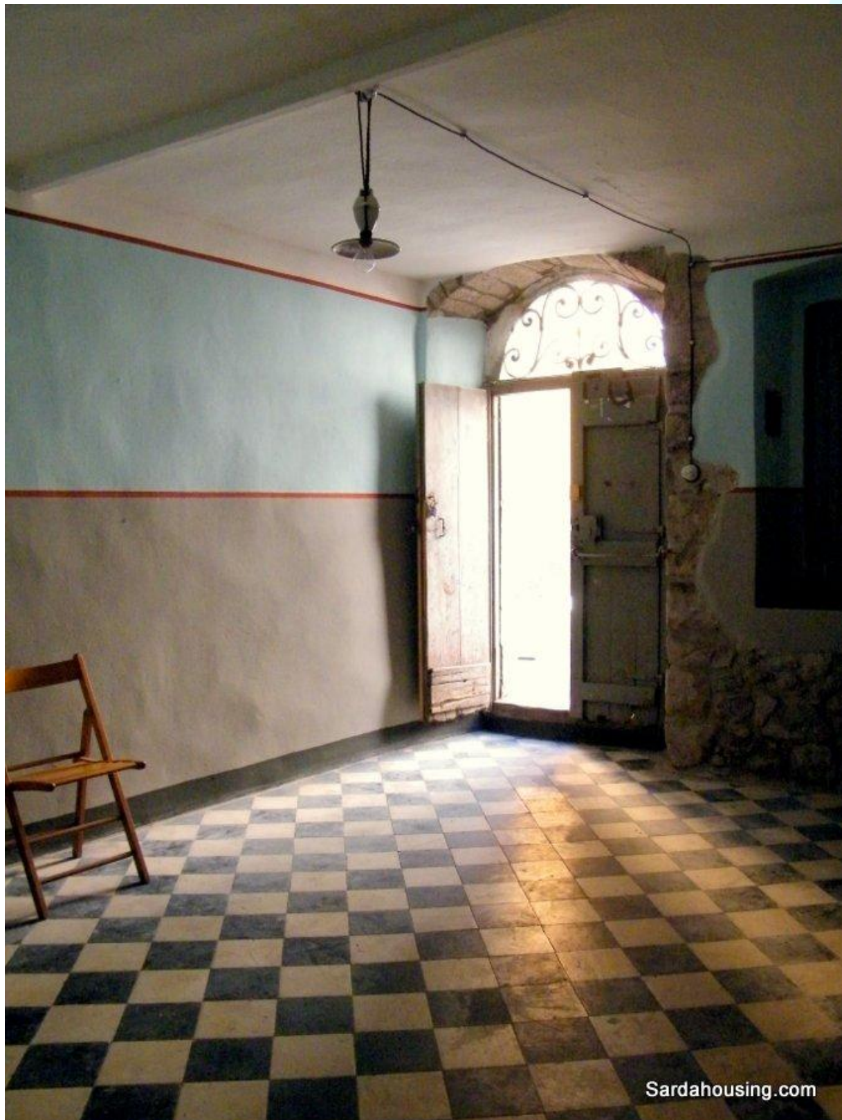
18 - Santu Lussurgiu – old centre - House La Volta: entrance room