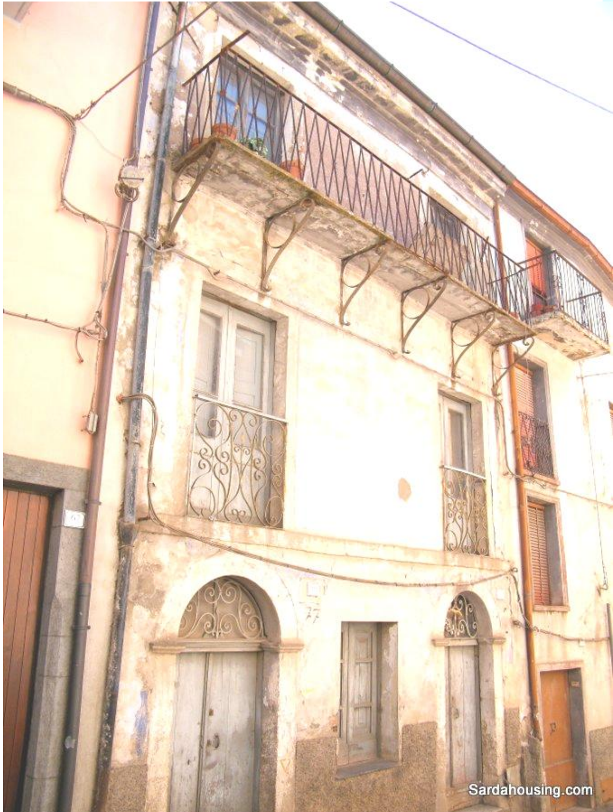
14 - Santu Lussurgiu – old centre - House La Volta: facade