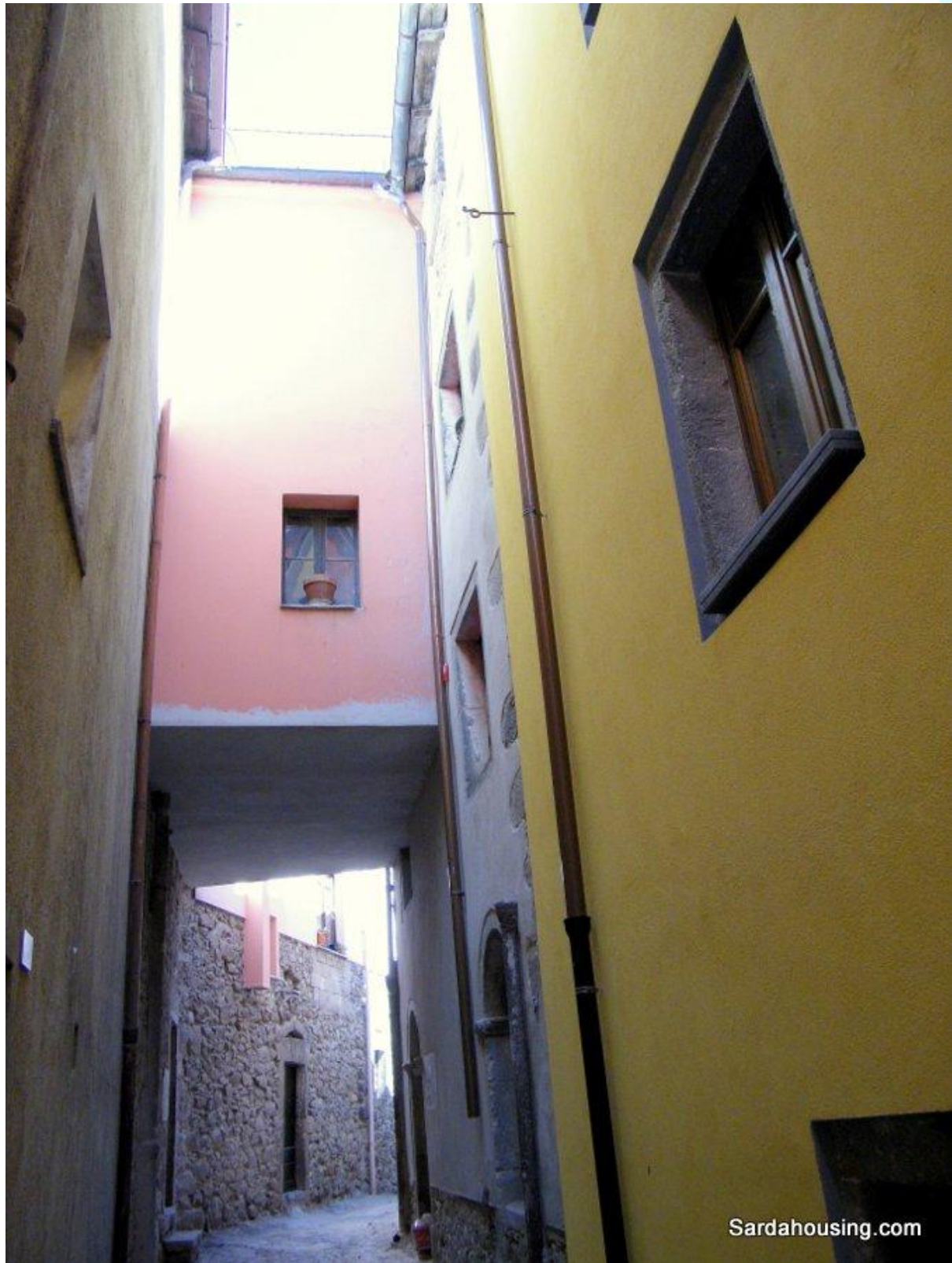
17 - Santu Lussurgiu – old centre - House La Volta: the back alley