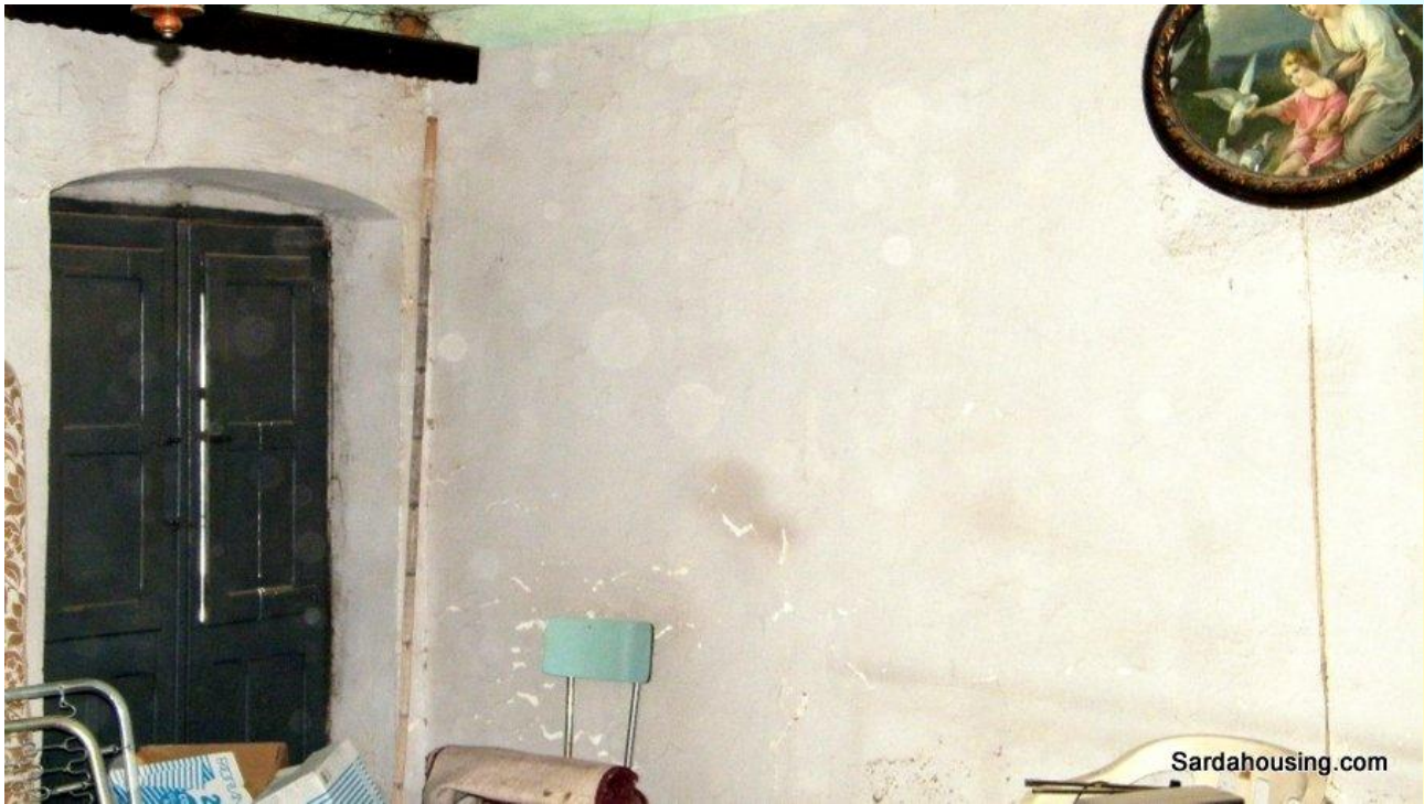
10 Santu Lussurgiu – old centre - House La Volta