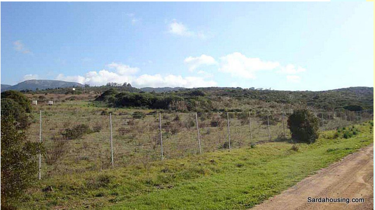
4 - Soleminis – Farm Land Sa Misa: a view