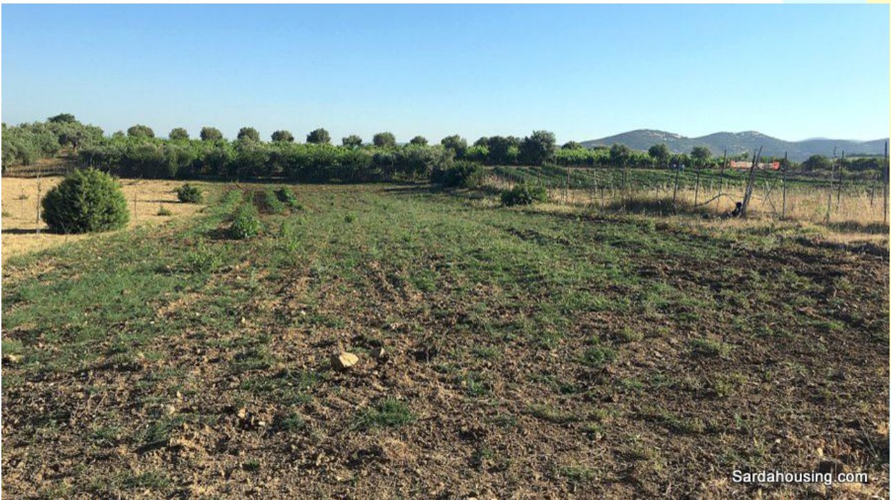
7 - Soleminis – Farm Land Sa Misa: arable land