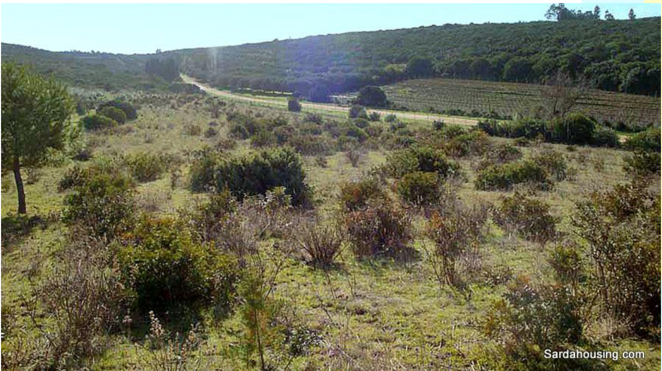
3 - Soleminis – Farm Land Sa Misa: access road