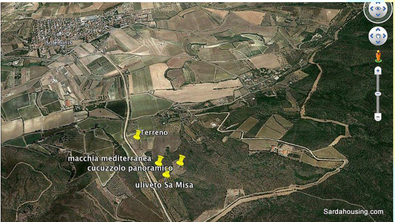
9 - Soleminis – Farm Land Sa Misa