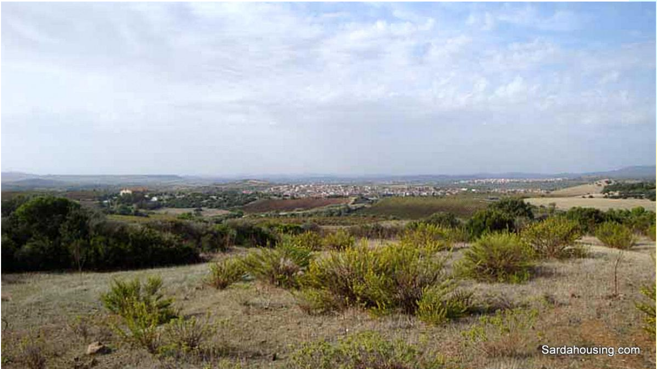
2 - Soleminis – Farm Land Sa Misa: a view