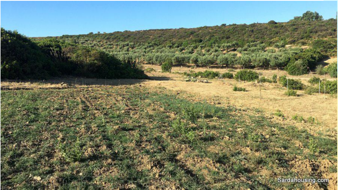
8 - Soleminis – Farm Land Sa Misa: arable land