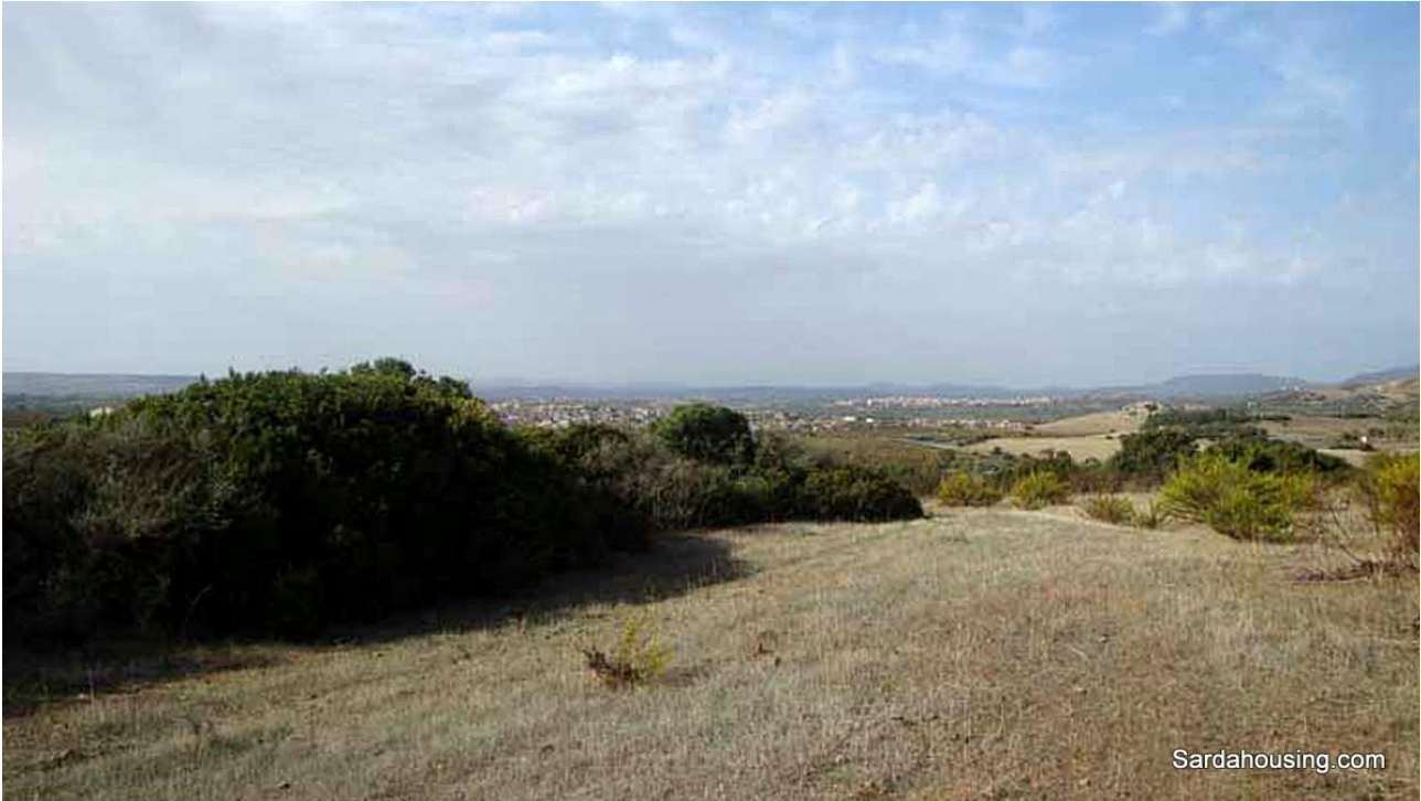
1 – Soleminis – Farm Land Sa Misa: a view

In Soleminis countryside, near Cagliari , we offer a beautiful farm land in a magnificent location about one kilometre from the village.