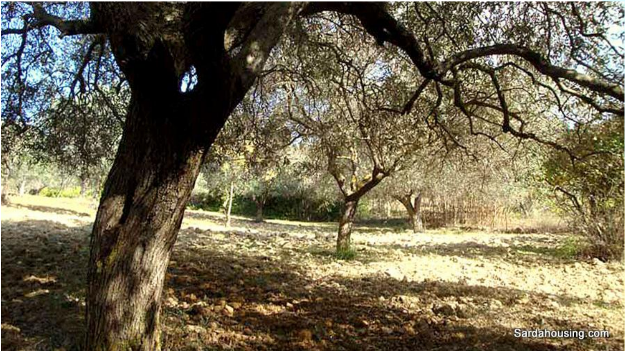
12 - Soleminis – Farm Land Sa Misa