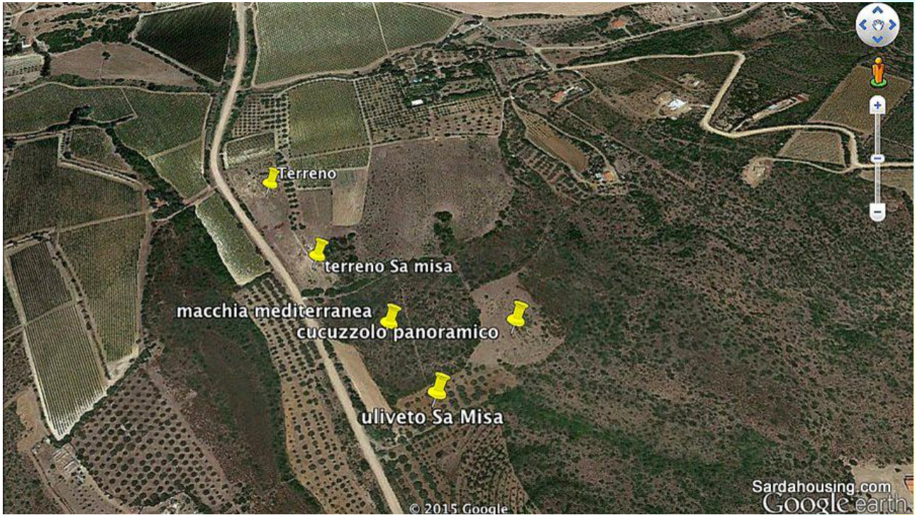
10 - Soleminis – Farm Land Sa Misa