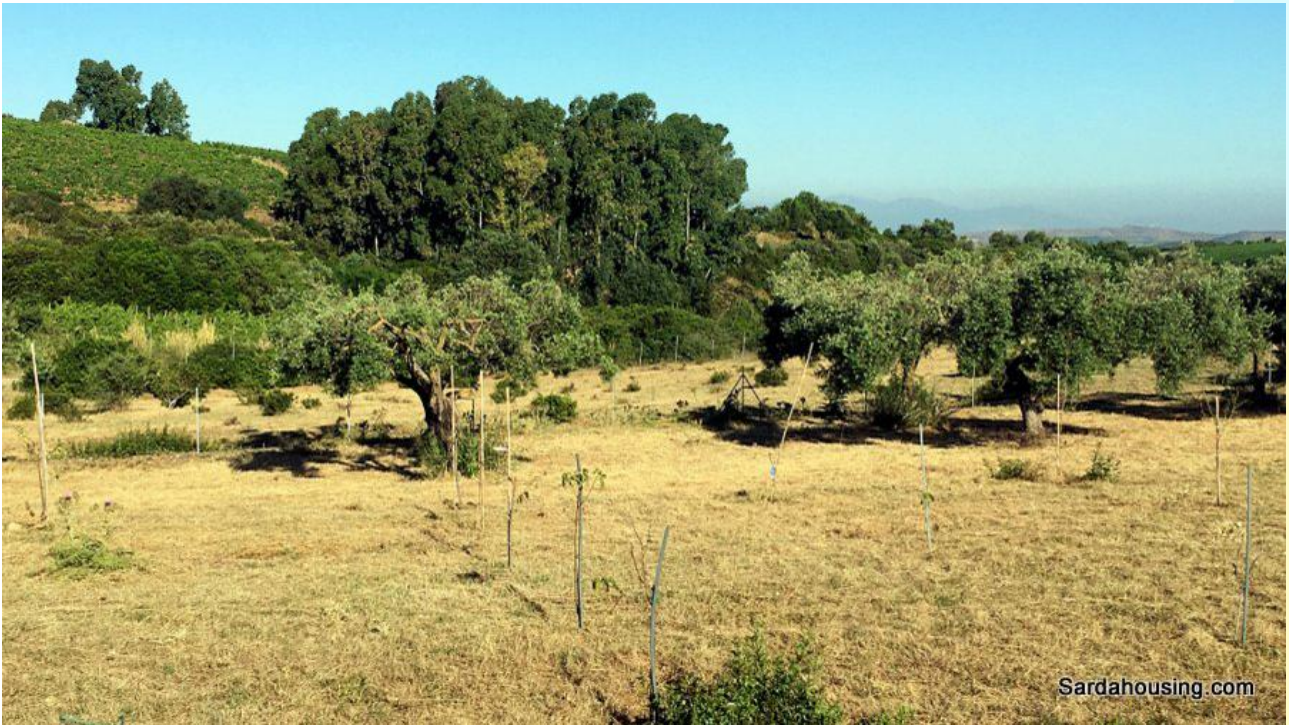
6 - Soleminis – Farm Land Sa Misa: olive grove