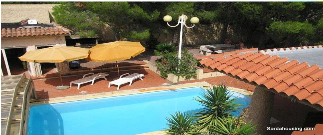
2 – Marina of Tertenia – Sardinia: Villa Sole e Mare: villa and covered pool

info@sardahousing.com - www.sardahousing.com