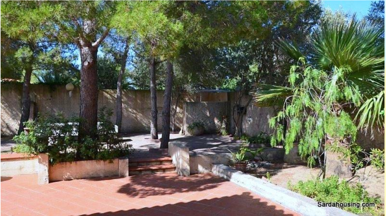
3 – Marina of Tertenia – Sardinia: Villa Sole e Mare: 1100 sqm garden