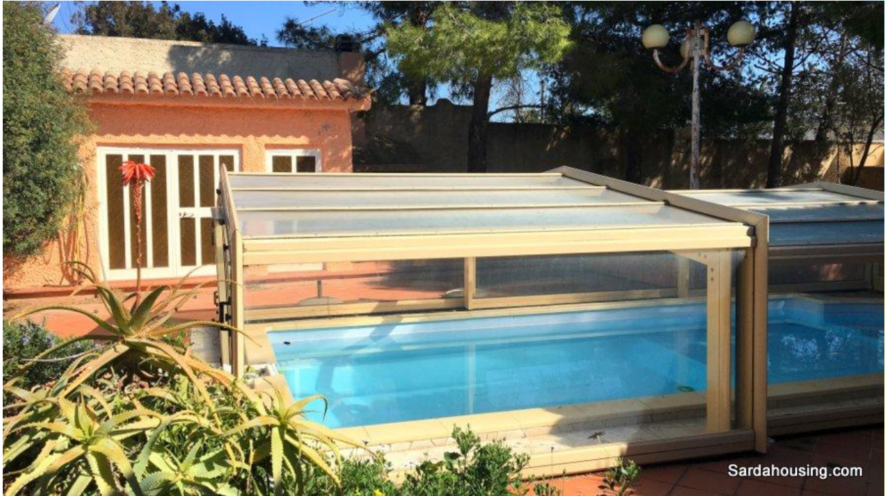
2 – Marina of Tertenia – Sardinia: Villa Sole e Mare: villa and covered pool