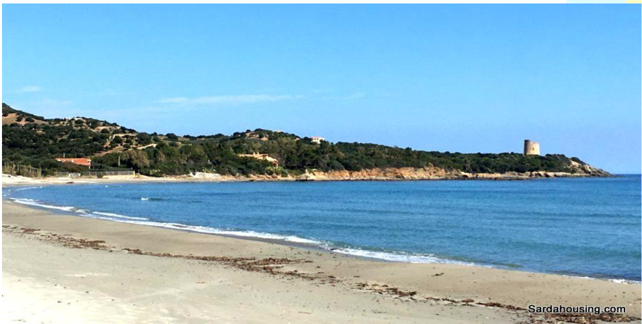
10 – Marina of Tertenia – Sardinia: Villa Sole e Mare: views of Beach Foxi Murdegu