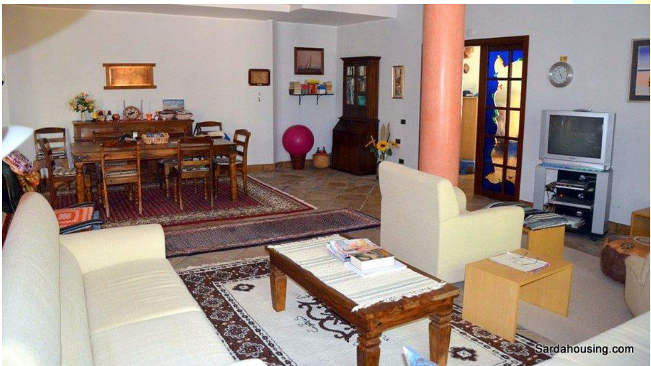
6 – Marina of Tertenia – Sardinia: Villa Sole e Mare: an 80 sqm lounge