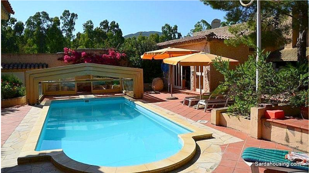
1 – Marina of Tertenia – Sardinia: Villa Sole e Mare: villa and pool

Along Ogliastra coast , 50 metres to the beach , we offer a nice detached villa with swimming pool in a large garden.