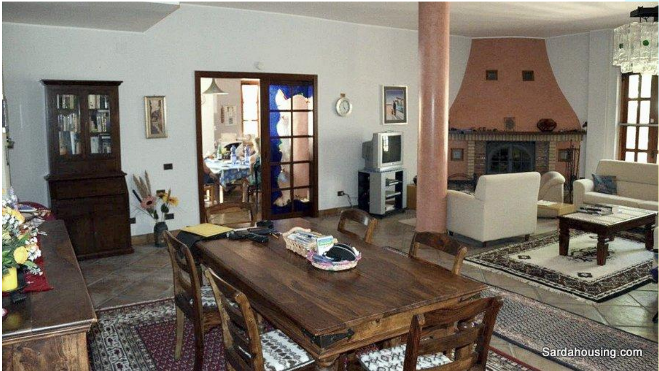
7 – Marina of Tertenia – Sardinia: Villa Sole e Mare: large lounge with fireplace and air-co