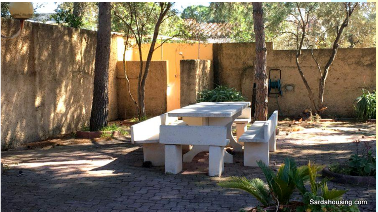
4 – Marina of Tertenia – Sardinia: Villa Sole e Mare: outdoor dining area