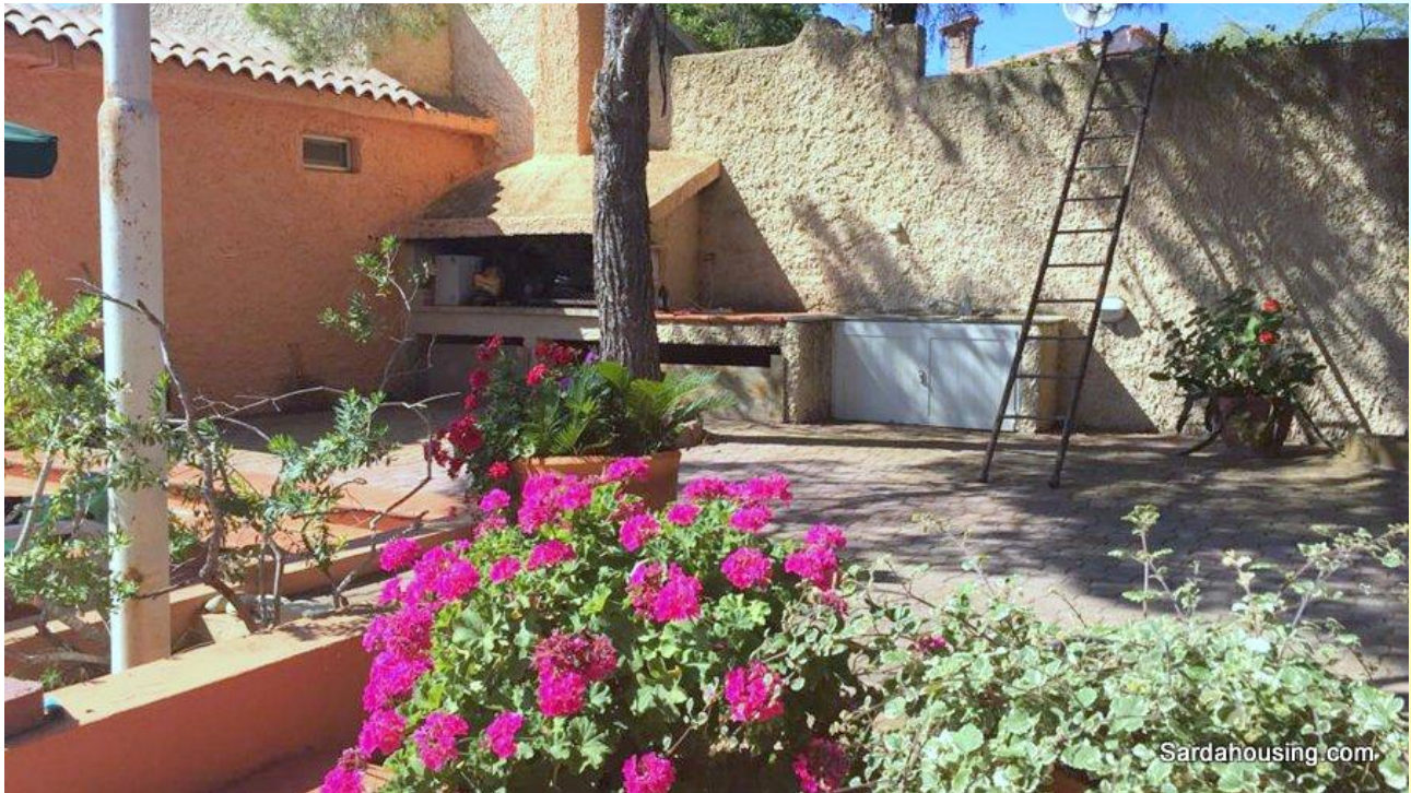
5 – Marina of Tertenia – Sardinia: Villa Sole e Mare: stone barbecue