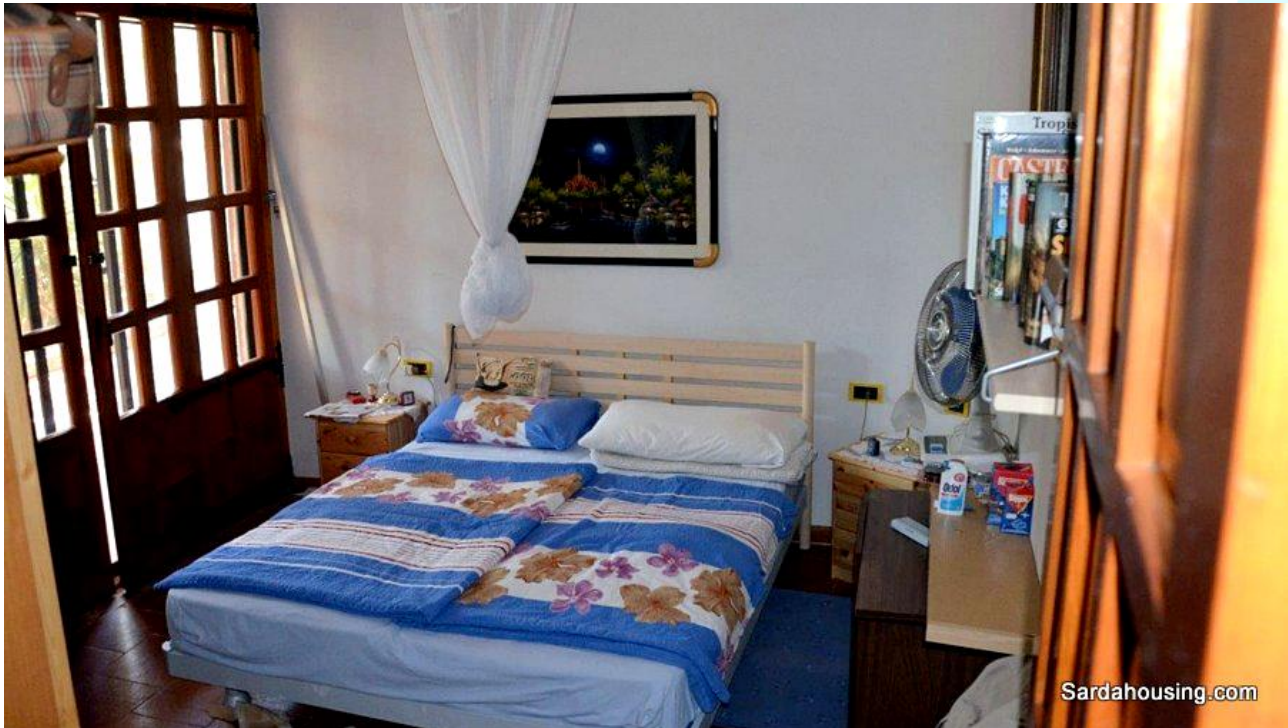
9 – Marina of Tertenia – Sardinia: Villa Sole e Mare: a double bedroom