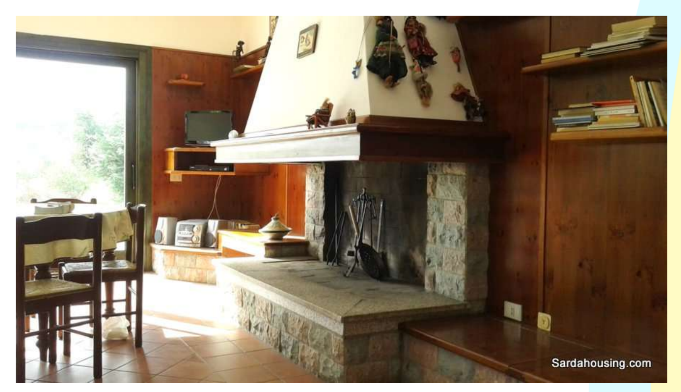
5 - House Carruba – Uta countryside: fireplace lined with stone