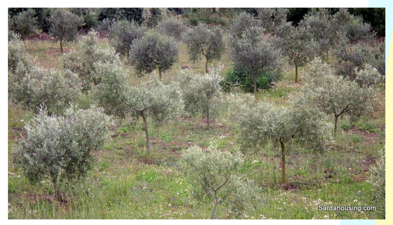
15 - House Carruba – Uta countryside: young olive grove