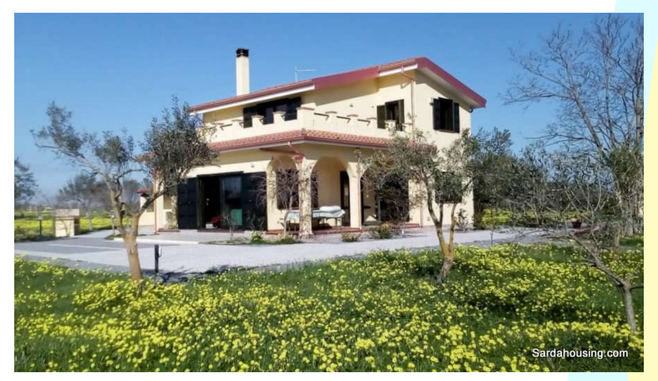
13 - House Carruba – Uta countryside: before the swimming pool was realized