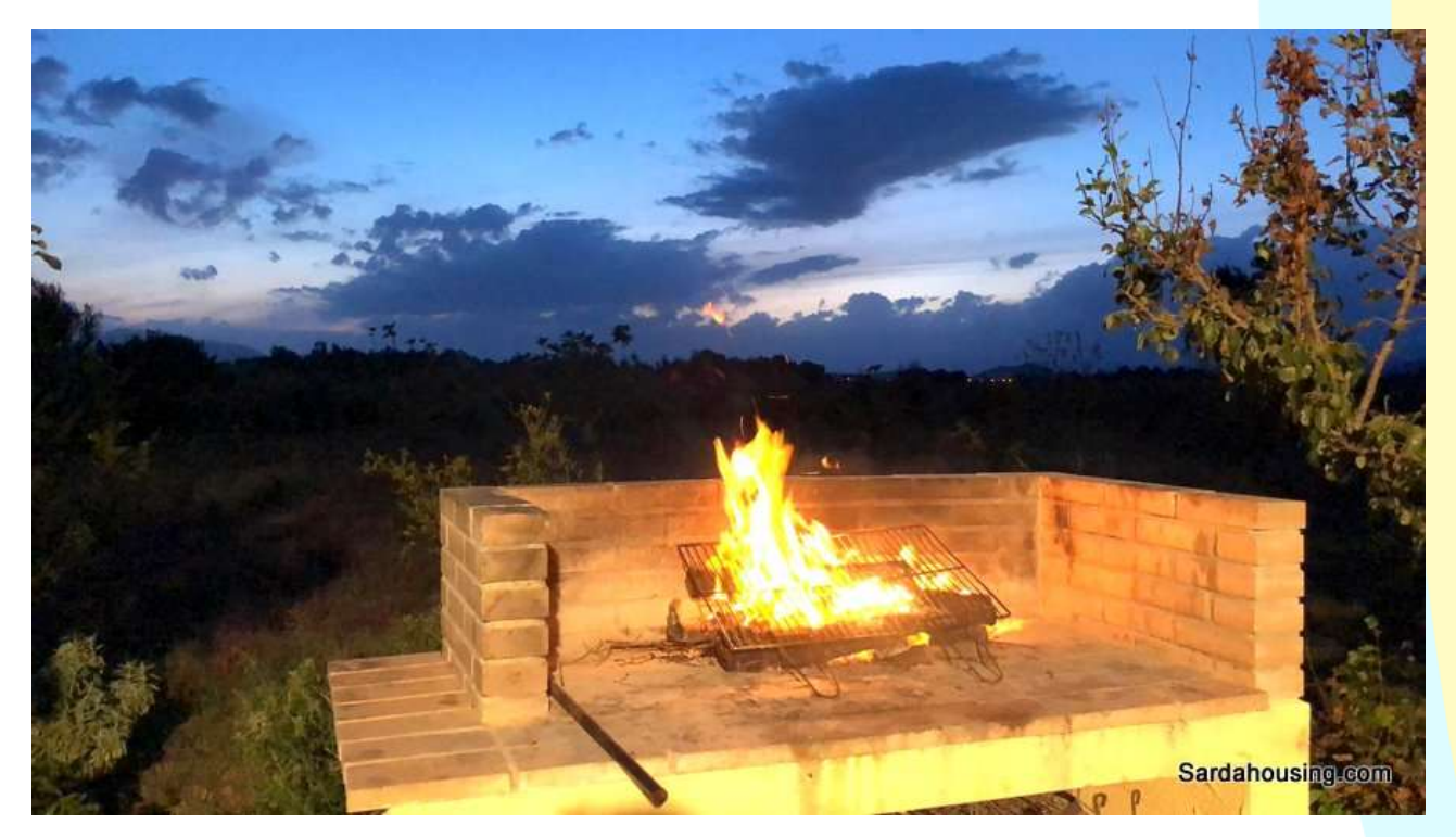
16 - House Carruba –Uta countryside: masonry barbecue