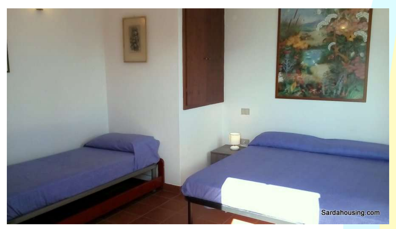
11 - House Carruba –Uta countryside: a bedroom