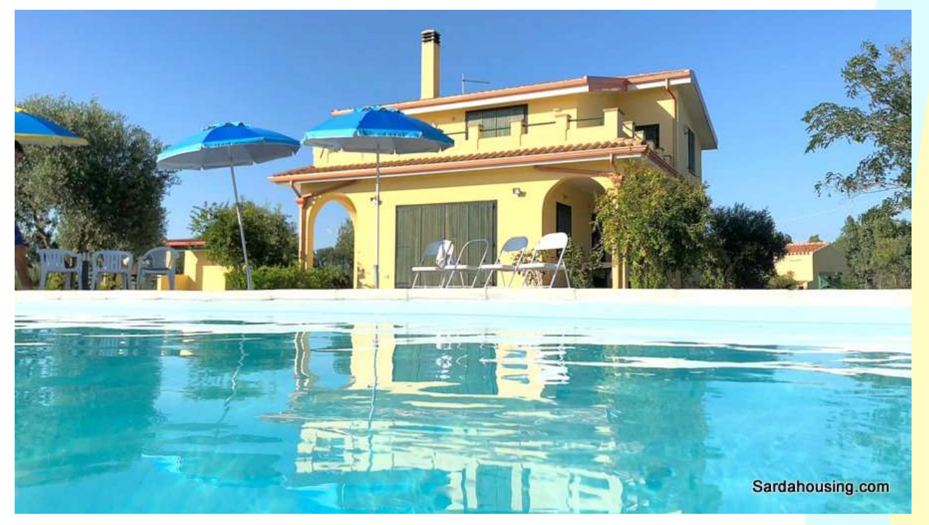
2 - House Carruba – Uta countryside: recently built swimming pool