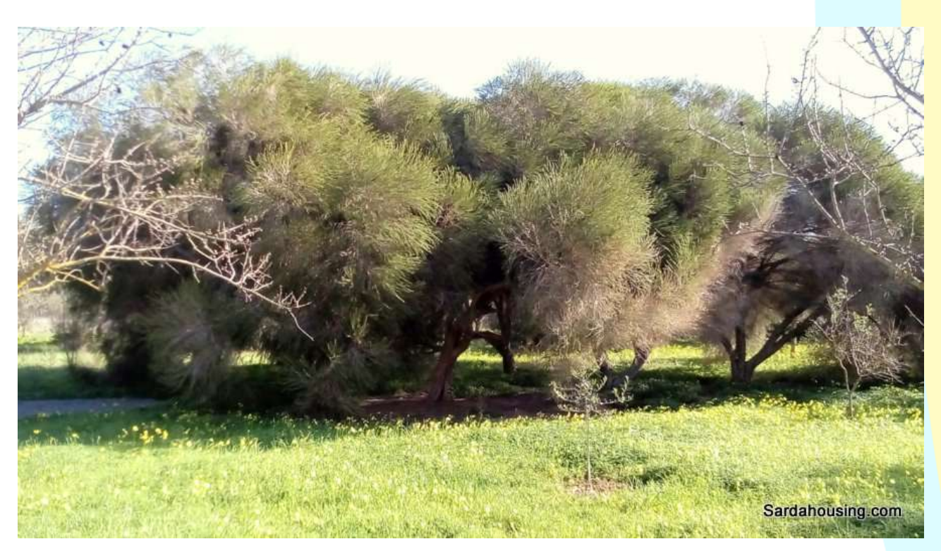
14 - House Carruba – Uta countryside: Mediterranean grove