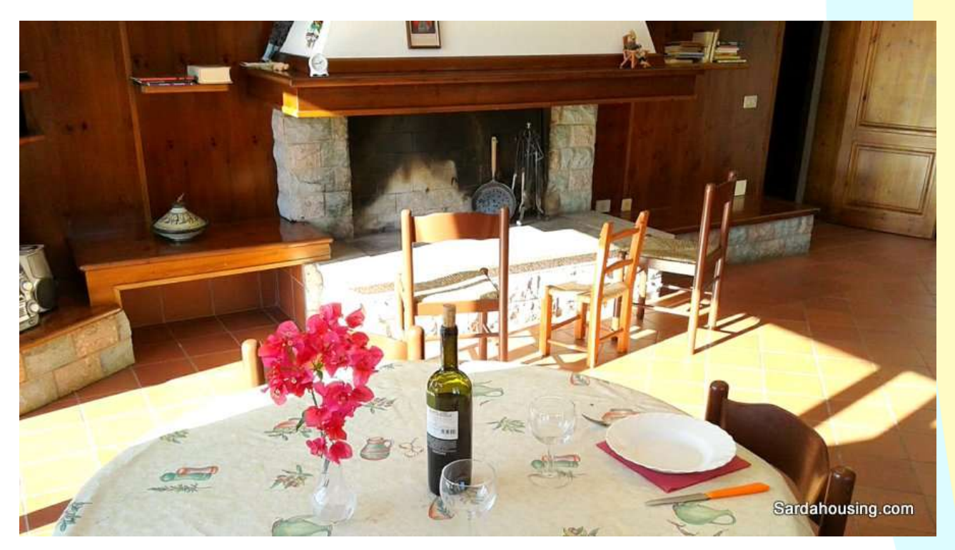
6 - House Carruba – Uta countryside: living room with cotto floor and wooden finishings