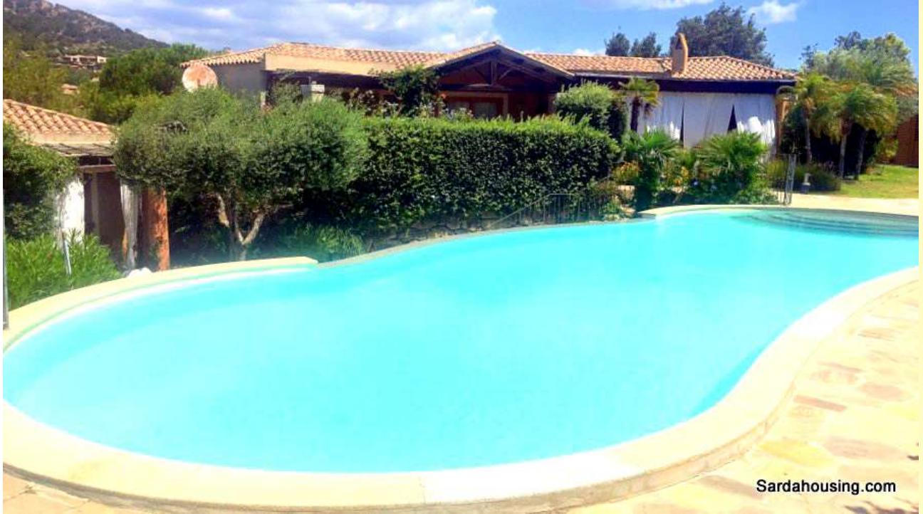
1 – Chia – Domus de Maria - House Laguna: shared swimming pools

In Chia Laguna area on the southern coast of Sardinia , we offer a beautiful house with shared swimming pool 450 m from the sea .