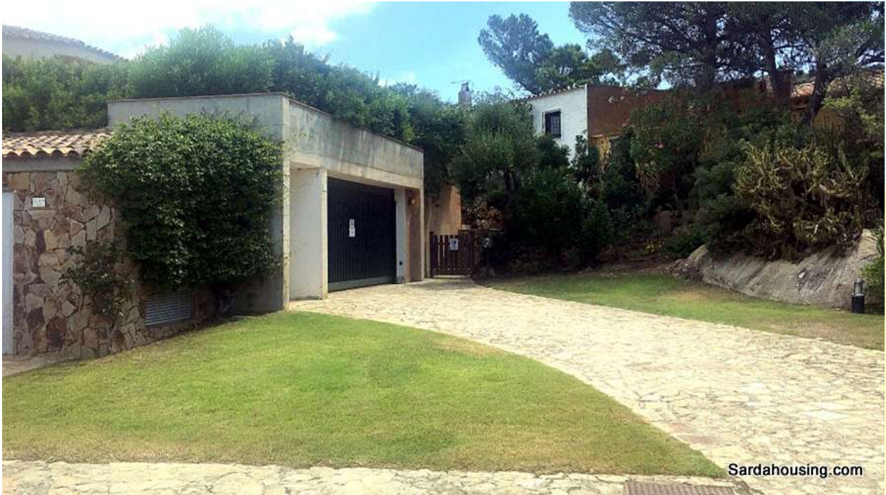
12 - Chia – Domus de Maria - House Laguna: garage area