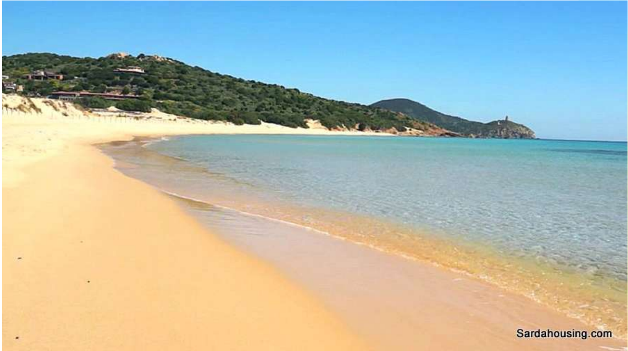
Beach di Campana Dune – Porto Campana

In summer Festivals of theatre and of music take place in the Roman theatre of the archaeological site Nora.