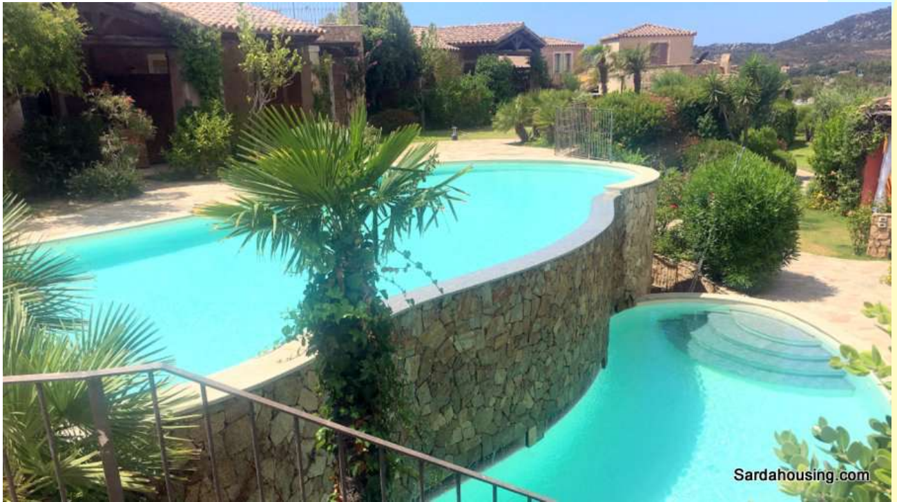
4 – Chia – Domus de Maria - House Laguna: shared swimming pools