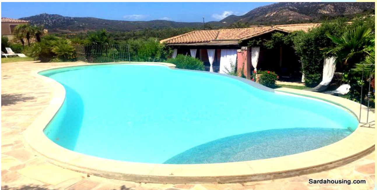
3 – Chia – Domus de Maria - House Laguna: shared swimming pools

info@sardahousing.com - www.sardahousing.com