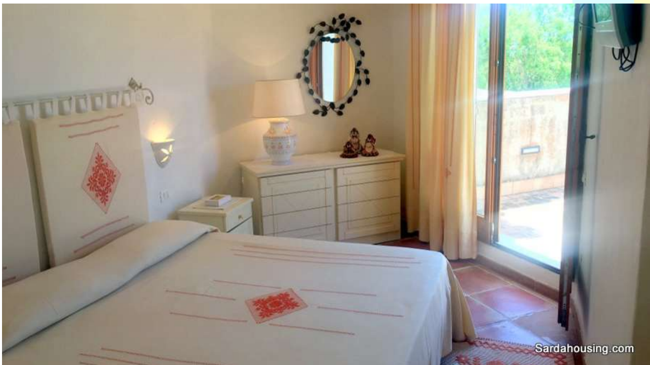
11 - Chia – Domus de Maria - House Laguna: double bedroom with panoramic terrace