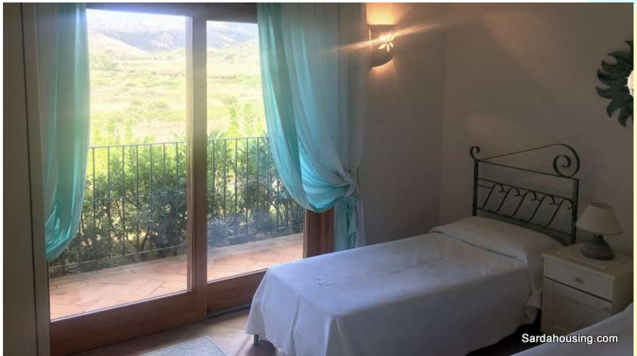
10 - Chia – Domus de Maria - House Laguna: double bedroom with veranda