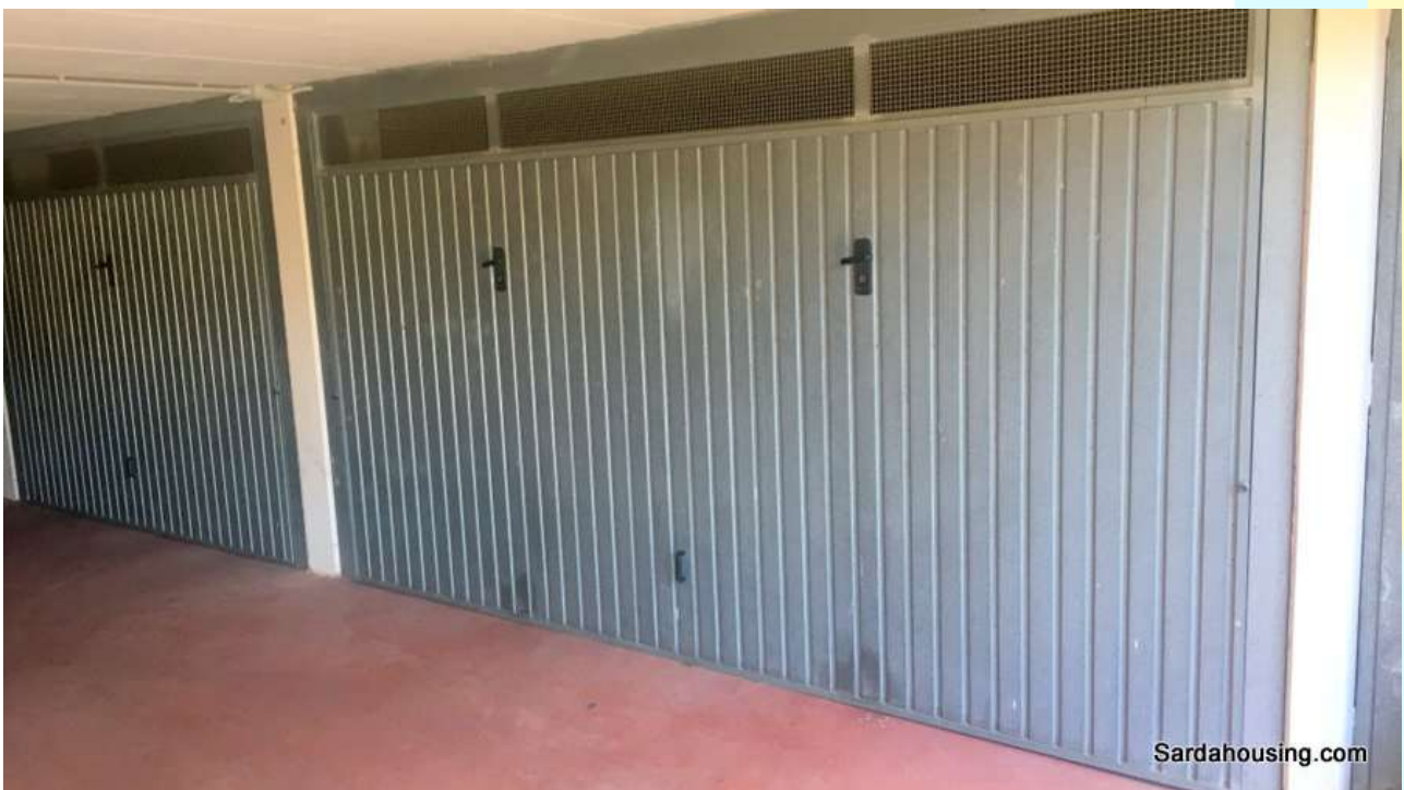
13 - Chia – Domus de Maria - House Laguna: garage