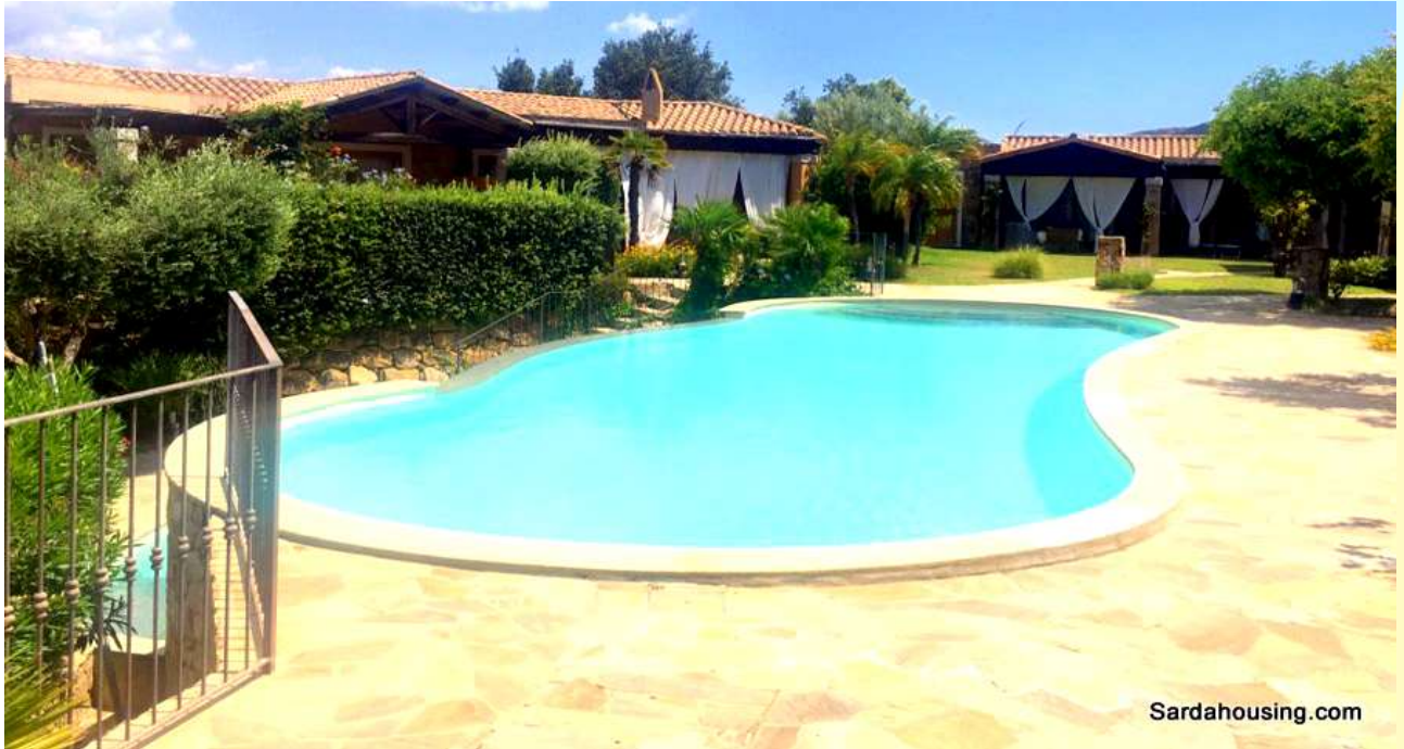
2 – Chia – Domus de Maria - House Laguna: shared swimming pools