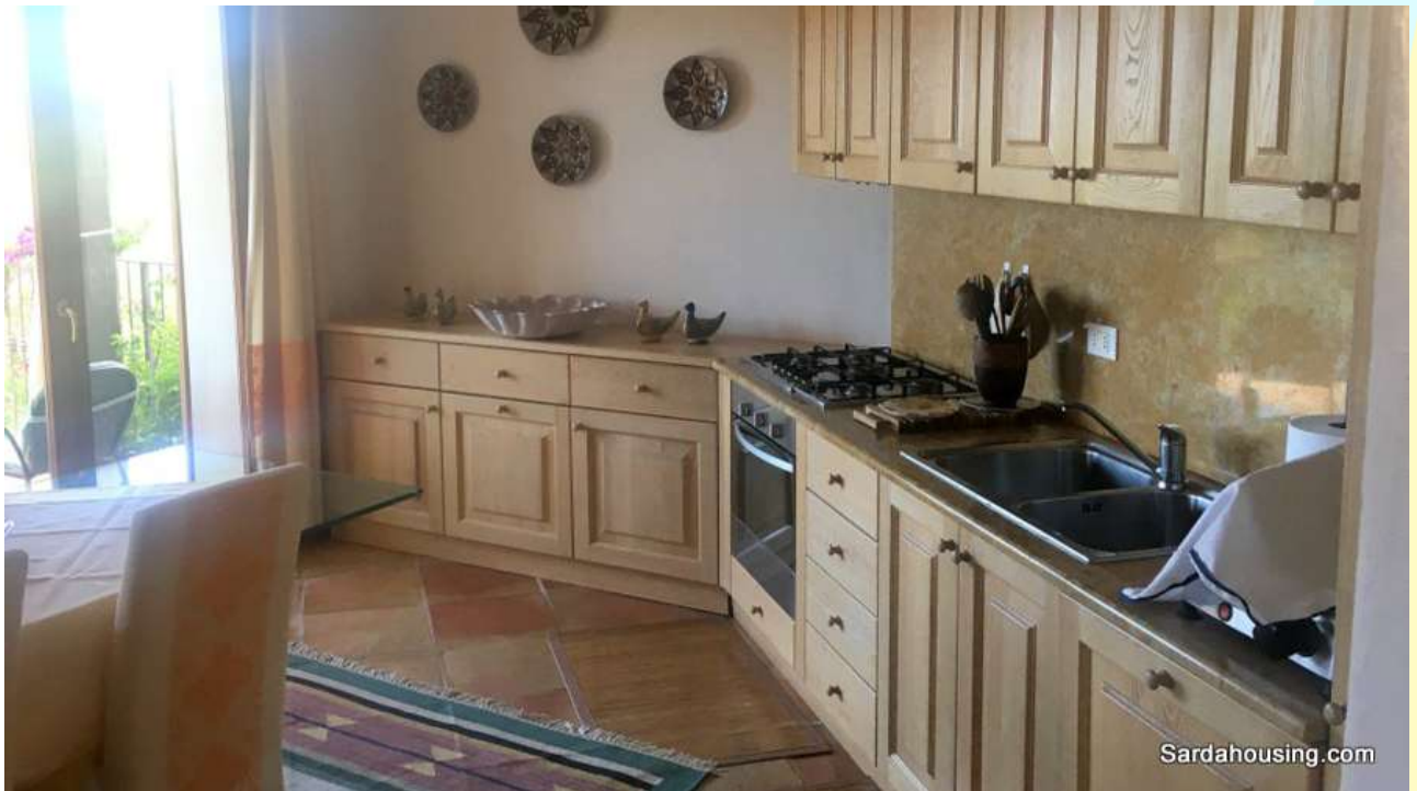
8 - Chia – Domus de Maria - House Laguna: kitchen-dining area with access to a veranda with pergola