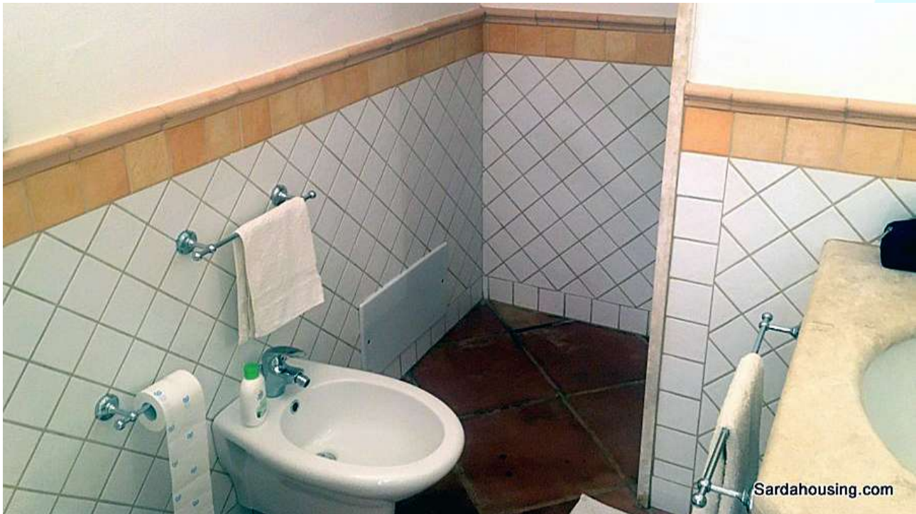
14 - Chia – Domus de Maria - House Laguna: bathroom