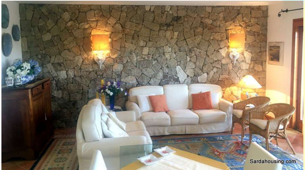
6 – Chia – Domus de Maria - House Laguna: living area