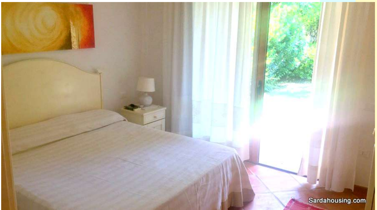
9 - Chia – Domus de Maria - House Laguna: double bedroom with en-suite bathroom and garden