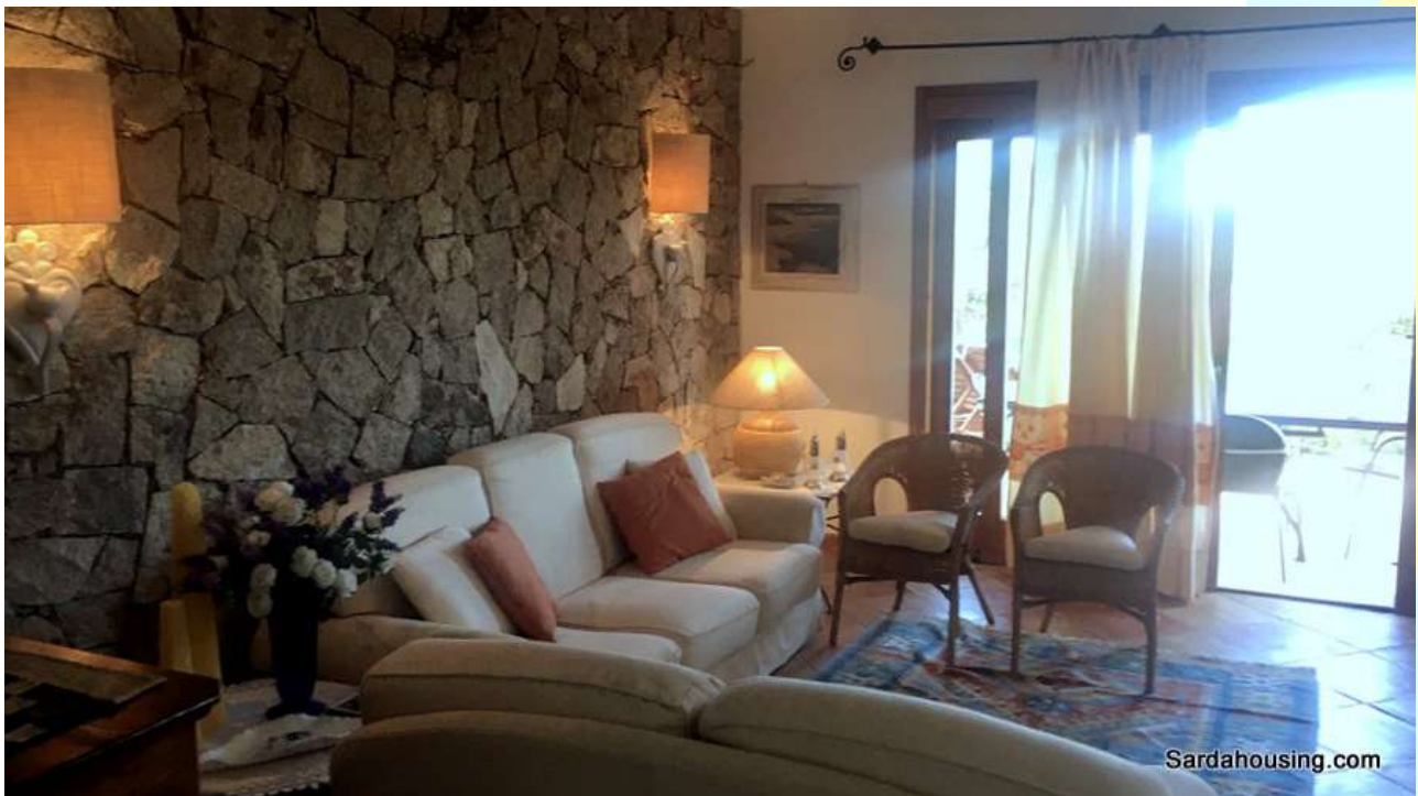
5 – Chia – Domus de Maria - House Laguna: living area with access to a veranda with pergola