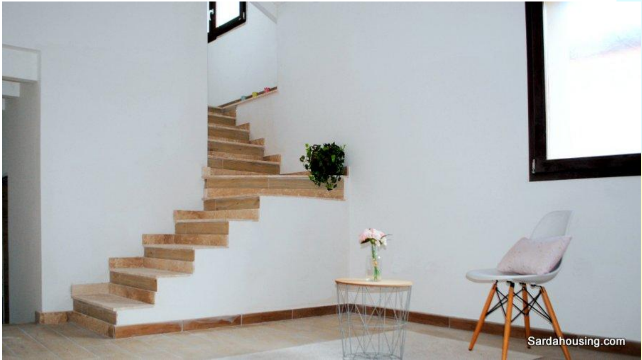
2 – Iglesias, via della Decima – Apartment Decima – living area