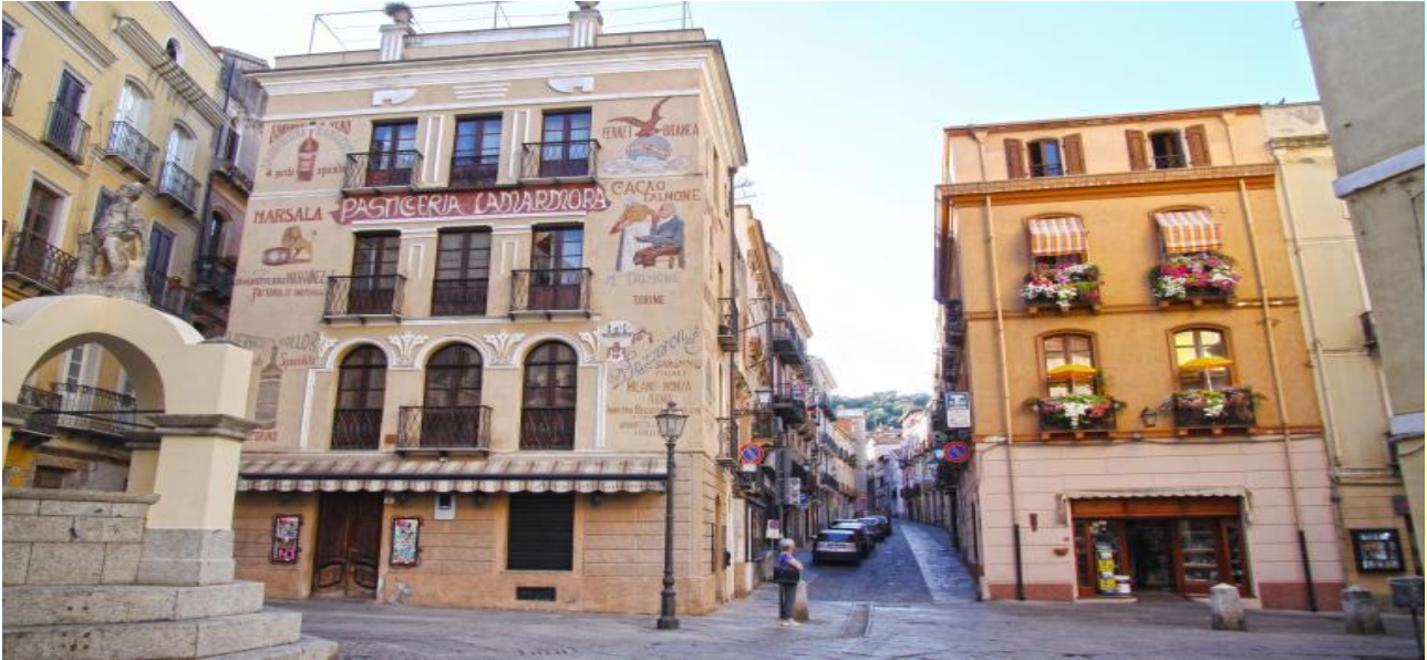
Iglesias – old town