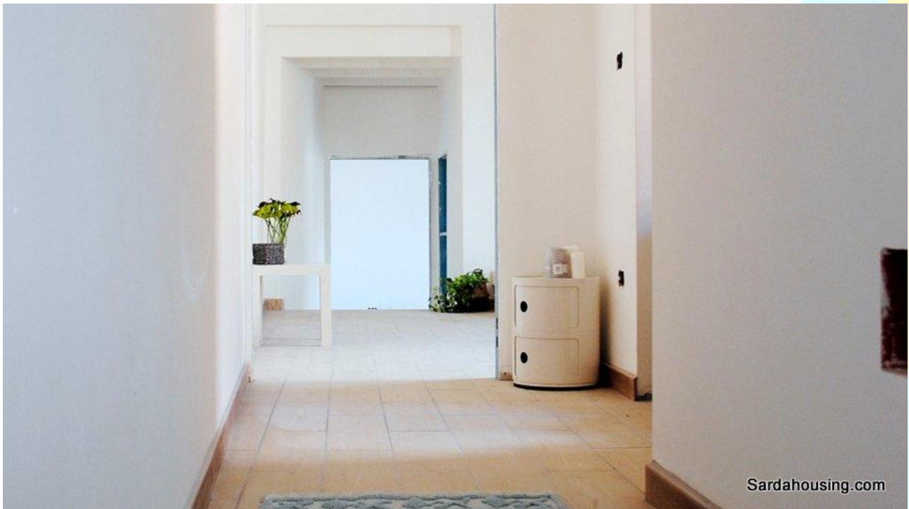
6 - Iglesias, via della Decima – Apartment Decima – bedroom