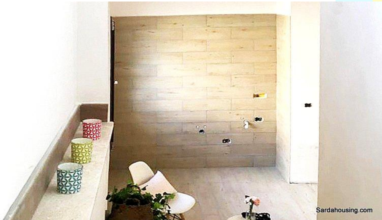
3 – Iglesias, via della Decima – Apartment Decima – kitchenette