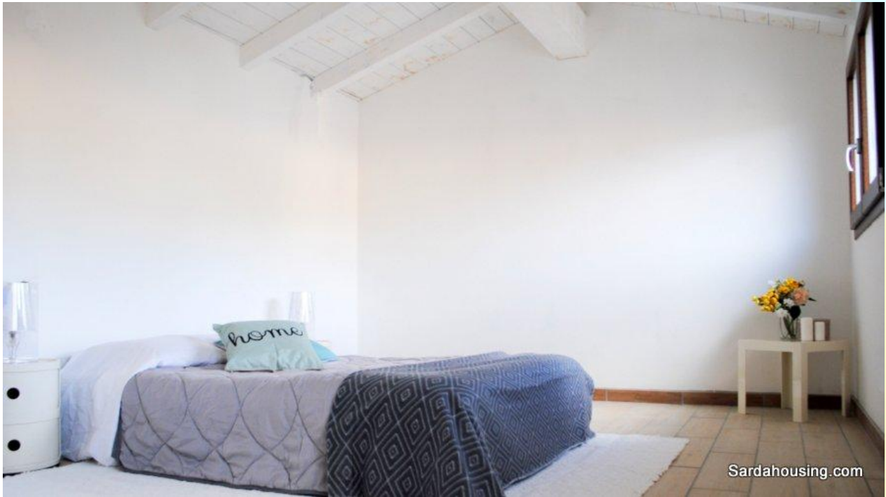
4 – Iglesias, via della Decima – Apartment Decima – double bedroom