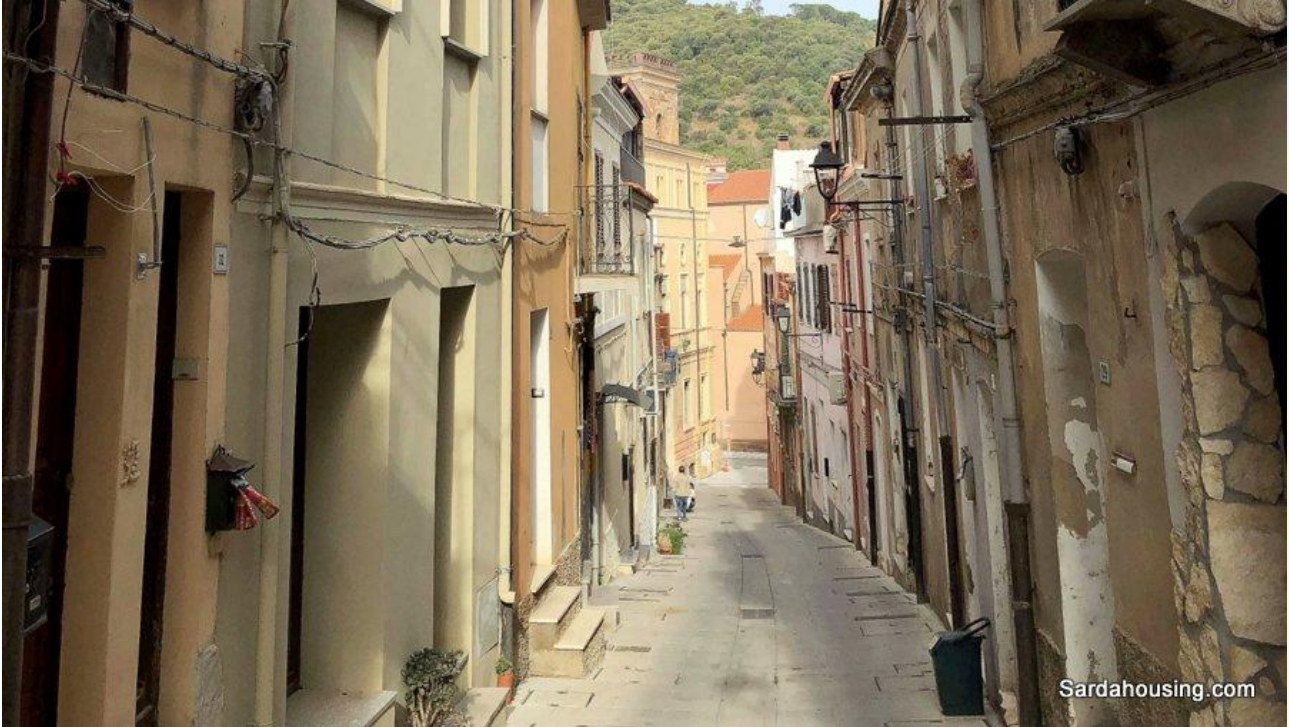
1 – Iglesias, via della Decima – Appartamento Decima

In a building in Iglesias old centre , we offer a completely renovated panoramic and bright apartment .