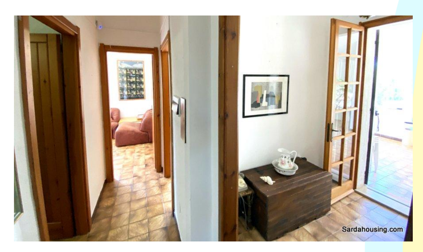
15 - Soleminis – Cagliari – Villa Cavana: entrance