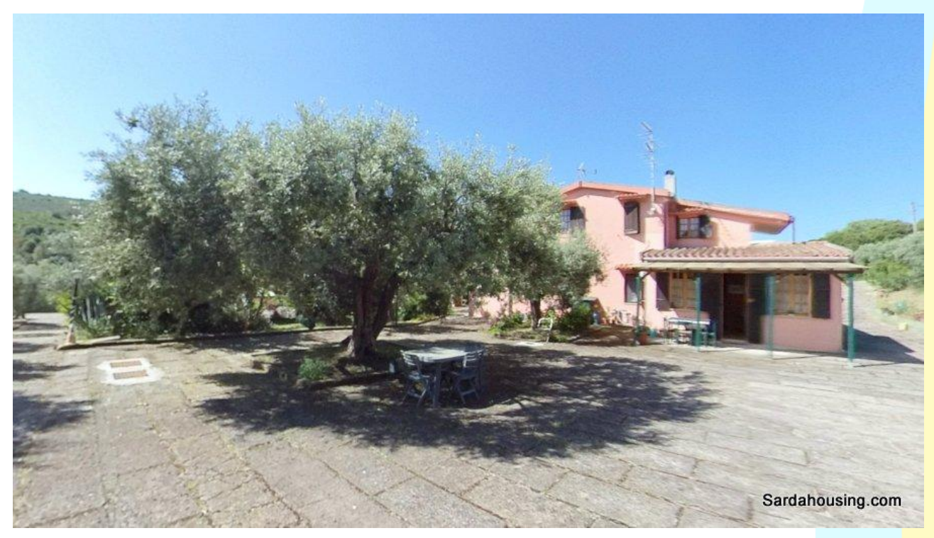
1 – Soleminis – Cagliari – Villa Cavana: front veranda

In Soleminis , in Cagliari hinterland, we offer a villa in the countryside in a magnificent natural setting one kilometre from the village .