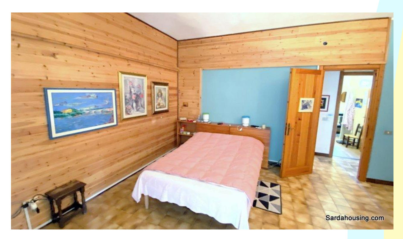
19 - Soleminis – Cagliari – Villa Cavana: bedroom