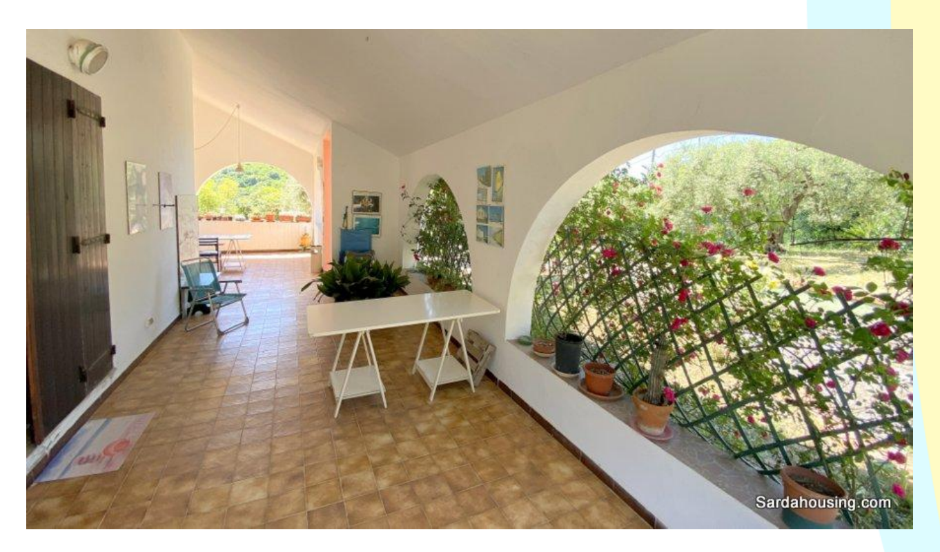
14 - Soleminis – Cagliari – Villa Cavana: veranda