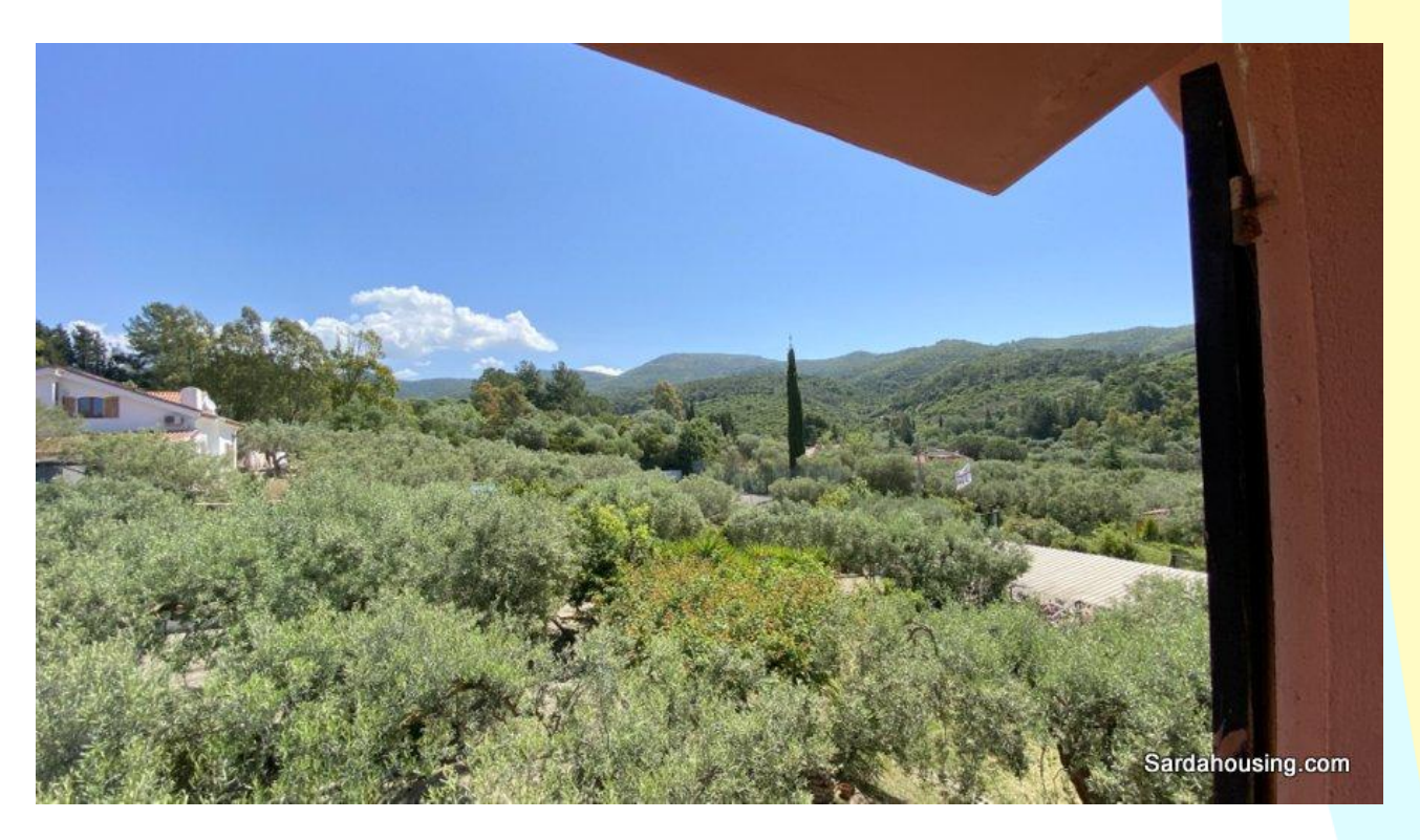
28 - Soleminis – Cagliari – Villa Cavana: a view from the terrace