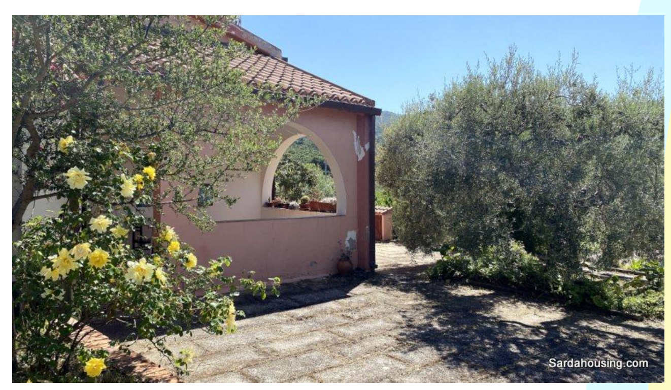
9 - Soleminis – Cagliari – Villa Cavana: veranda