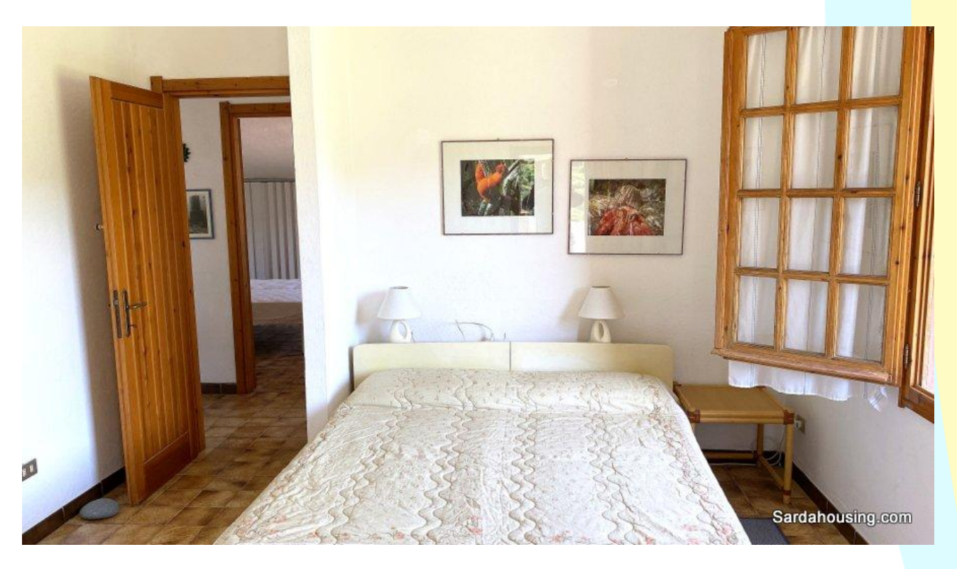
36 - Soleminis – Cagliari – Villa Cavana: bedroom in the attic