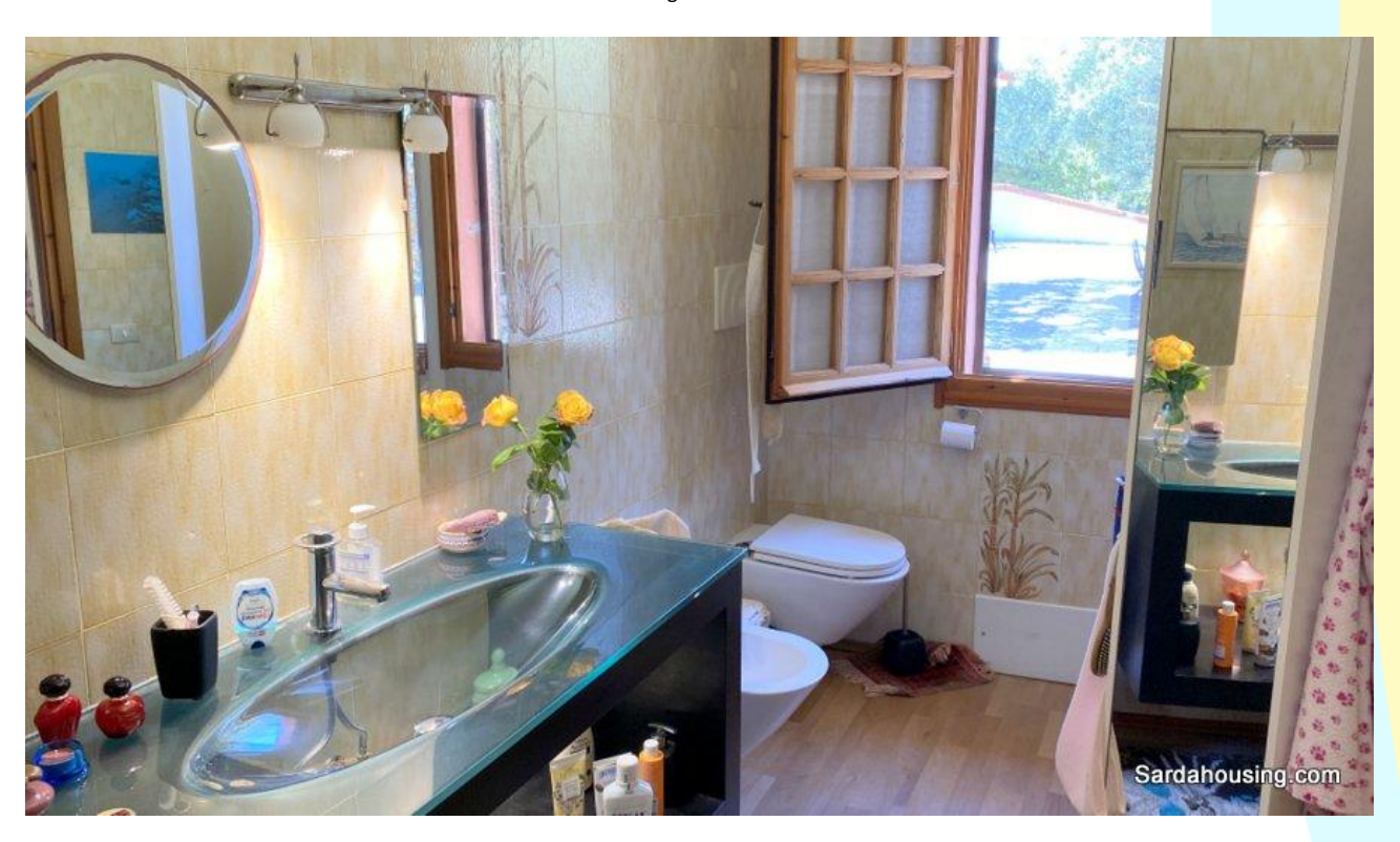
24 - Soleminis – Cagliari – Villa Cavana: the first bathroom