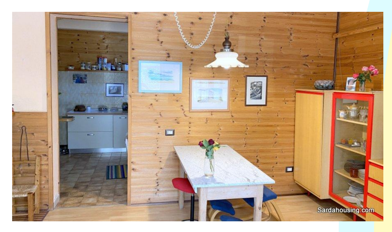
17 - Soleminis – Cagliari – Villa Cavana: dining area with adjoining kitchenette