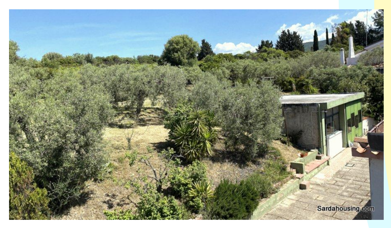
30 - Soleminis – Cagliari – Villa Cavana: a view from the terrace