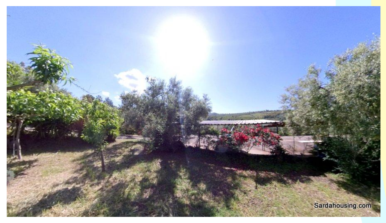
6 - Soleminis – Cagliari – Villa Cavana: carshed