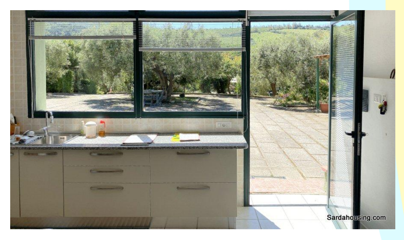
38 - Soleminis — Cagliari — Villa Cavana: garage