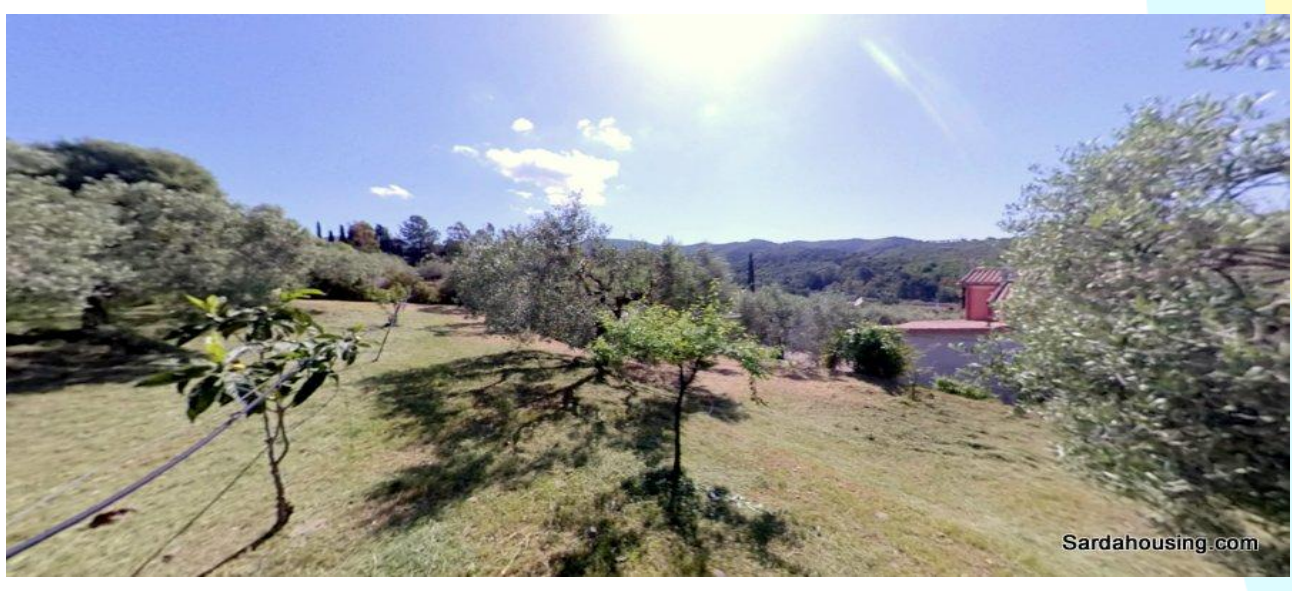
4 - Soleminis - Cagliari - Villa Cavana: garden