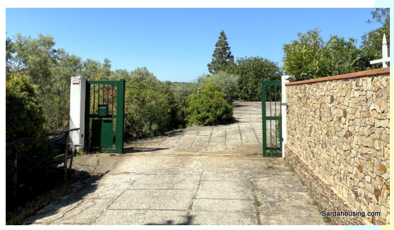
7 - Soleminis – Cagliari – Villa Cavana: main entrance