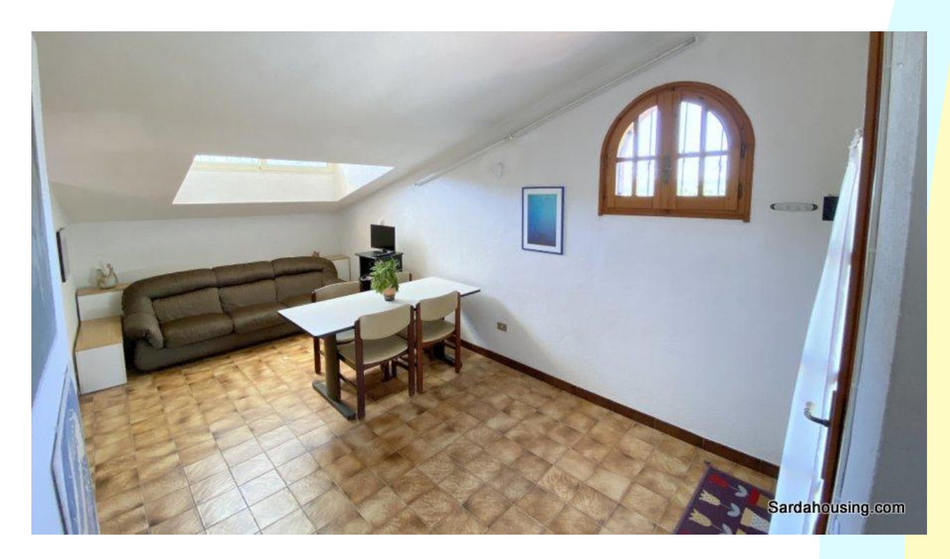
31 - Soleminis – Cagliari – Villa Cavana: living area in the attic