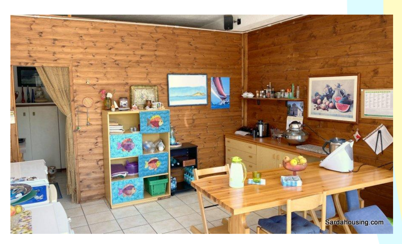
{\bf 32} - Soleminis – Cagliari – Villa Cavana: dining area and kitchnette in the attic