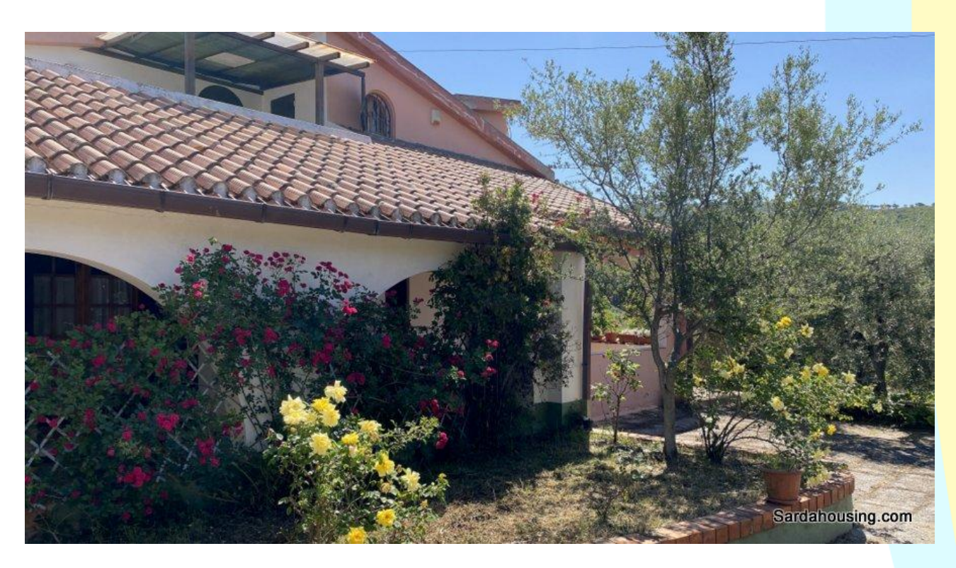
10 - Soleminis – Cagliari – Villa Cavana: veranda