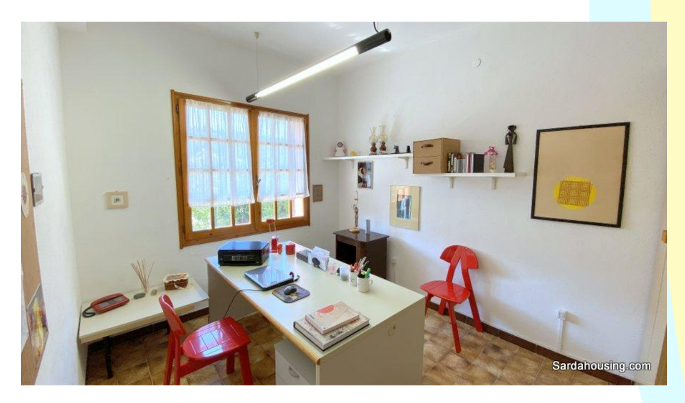
22 - Soleminis – Cagliari – Villa Cavana: studio room