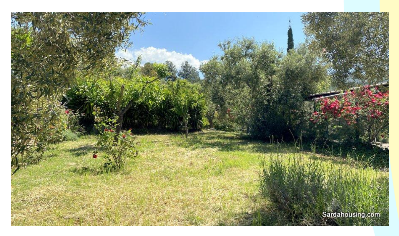
12 - Soleminis – Cagliari – Villa Cavana: garden