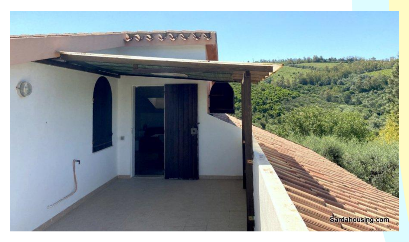
26 - Soleminis – Cagliari – Villa Cavana: terrace and attic entrance