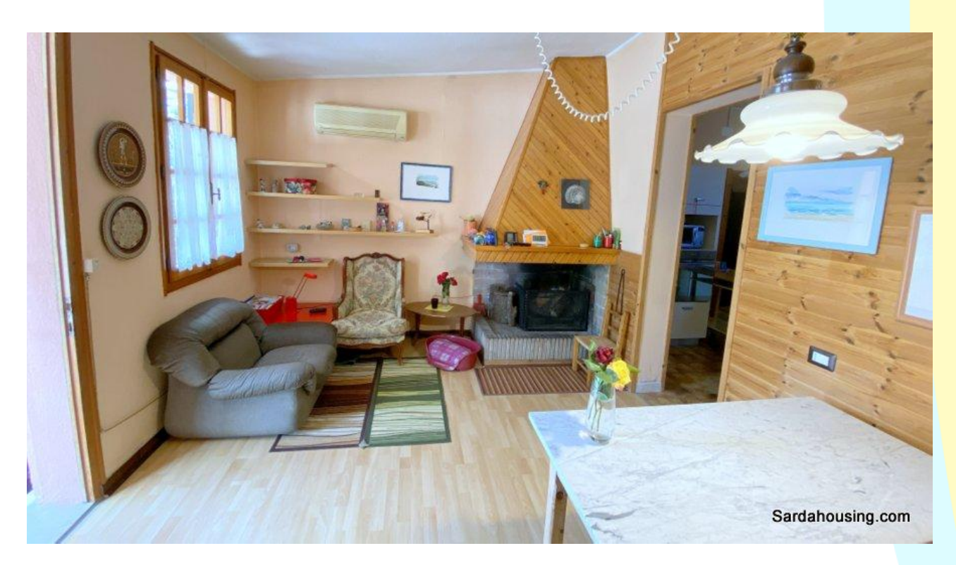
16 - Soleminis – Cagliari – Villa Cavana: living area with fire place