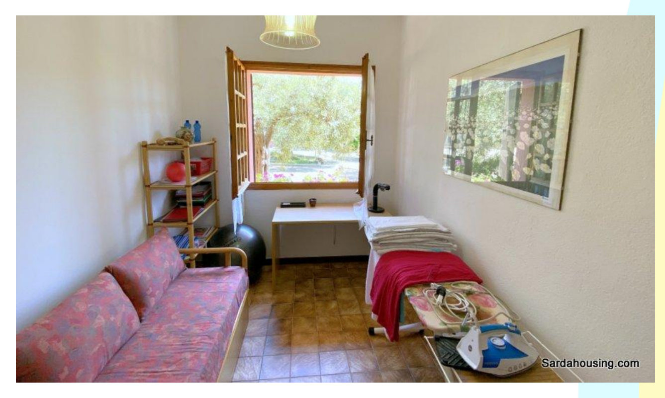
23 - Soleminis – Cagliari – Villa Cavana: room