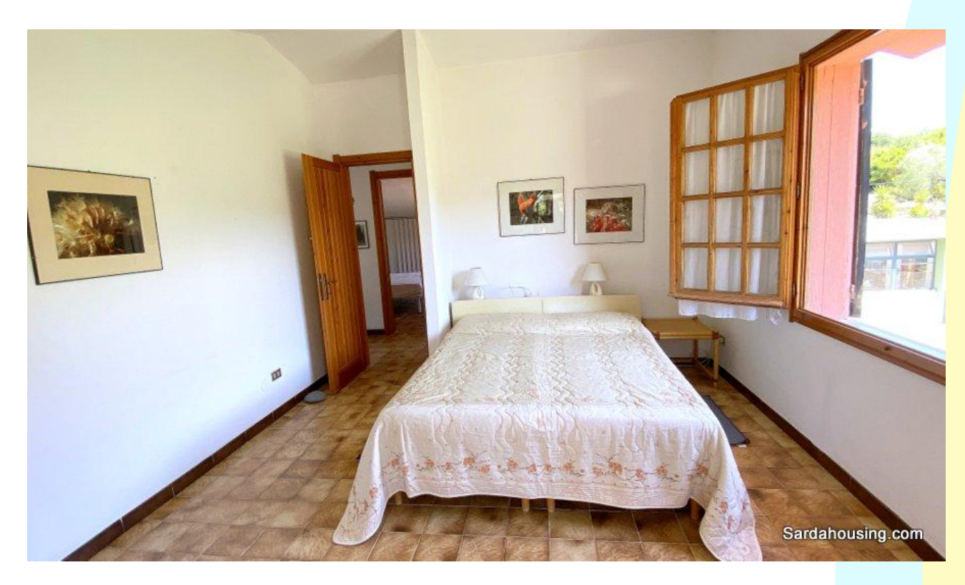
35 - Soleminis – Cagliari – Villa Cavana: bedroom in the attic