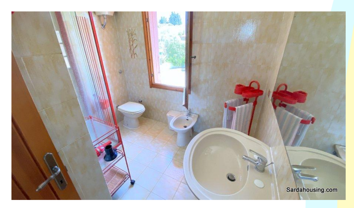
37 - Soleminis – Cagliari – Villa Cavana: bathroom in the attic