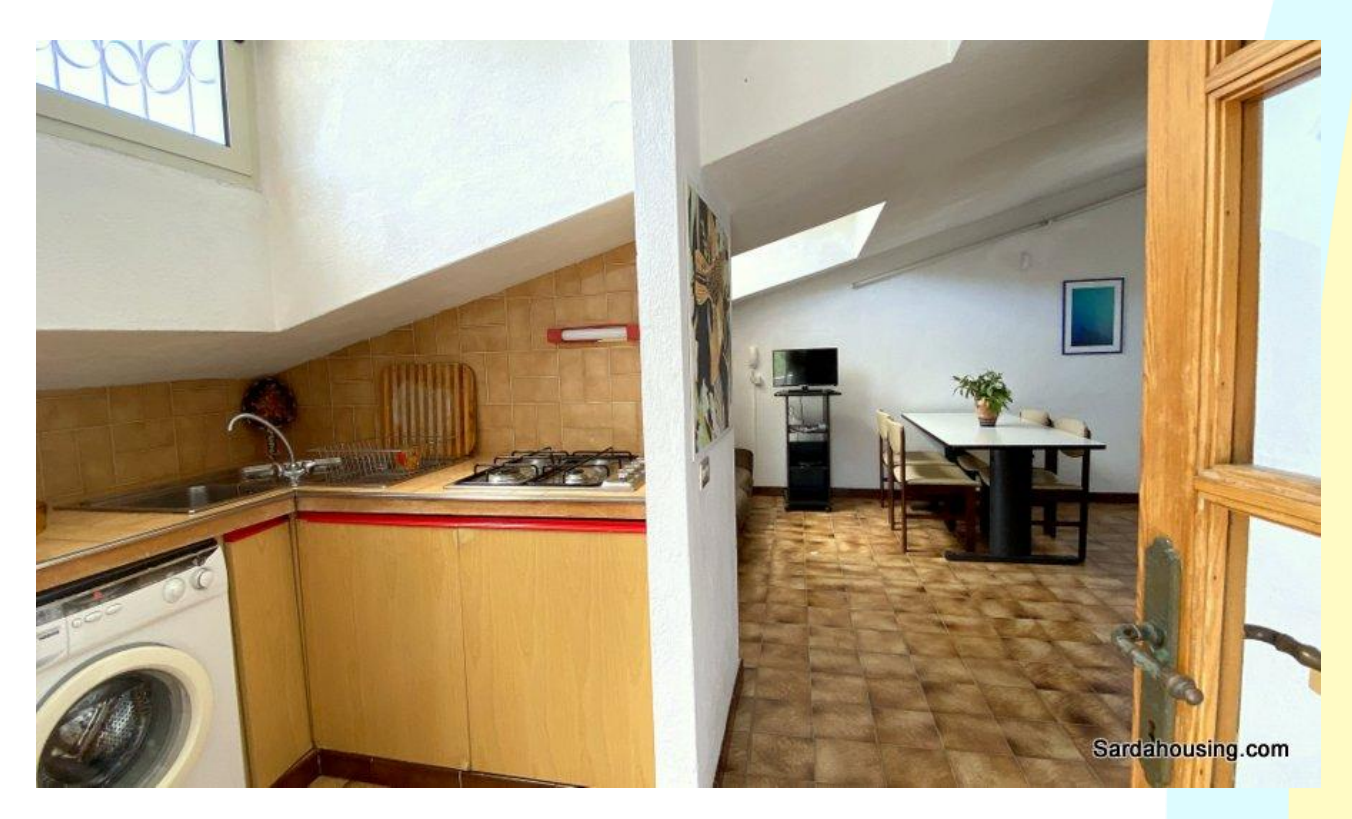
33 - Soleminis – Cagliari – Villa Cavana: kitchenette and dining are in the attic