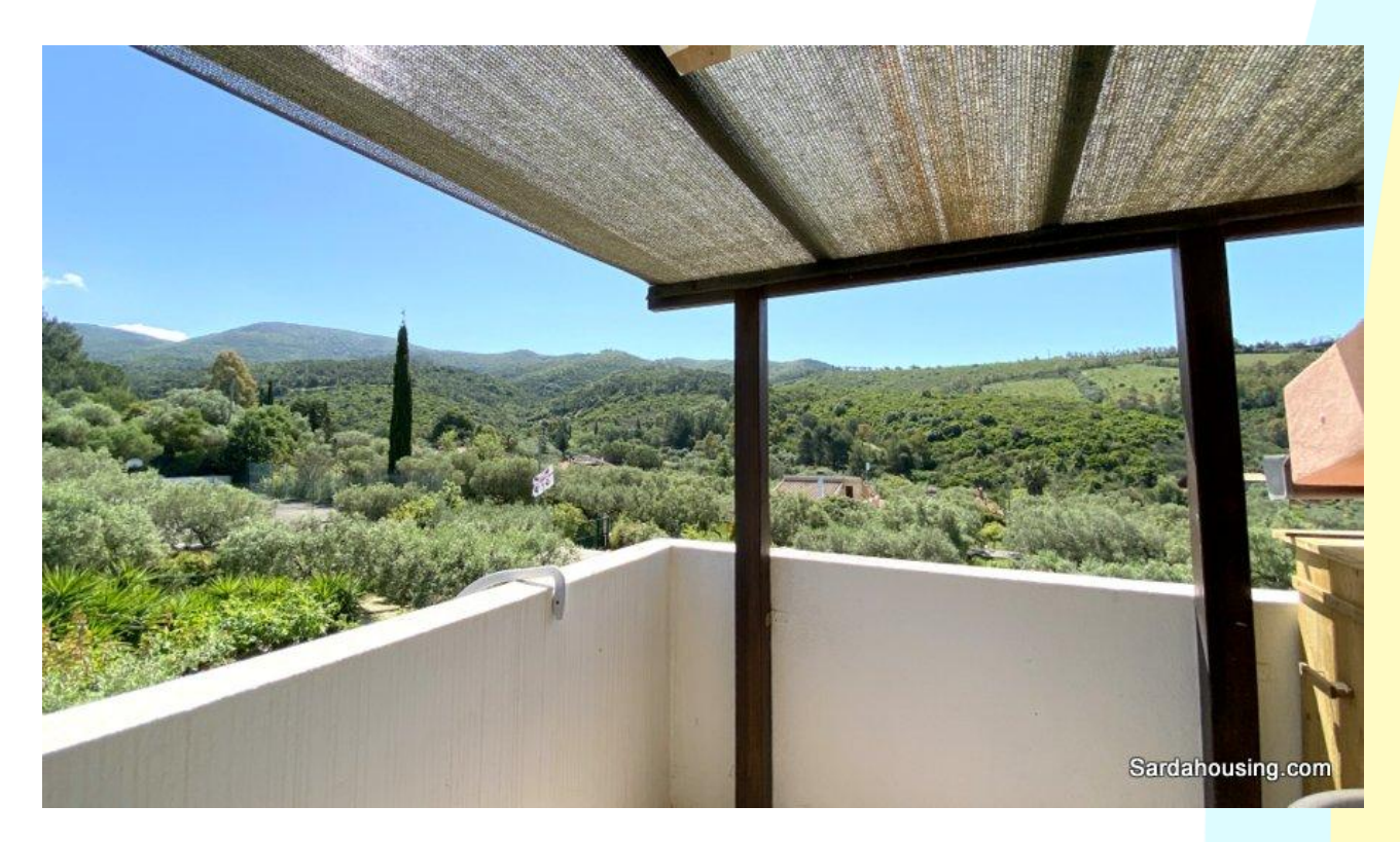
27 - Soleminis – Cagliari – Villa Cavana: a view from the terrace