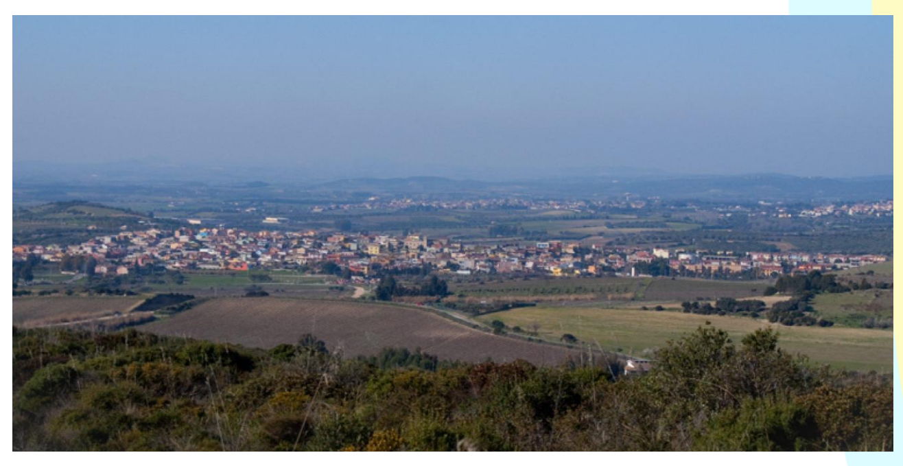
Soleminis (province Sud-Sardegna)

Entering from Soleminis, north of the forest, you reach Monte Arrubiu and find also a plant nursery and the former forest barracks, that were renovated and destined to environmental education activities.