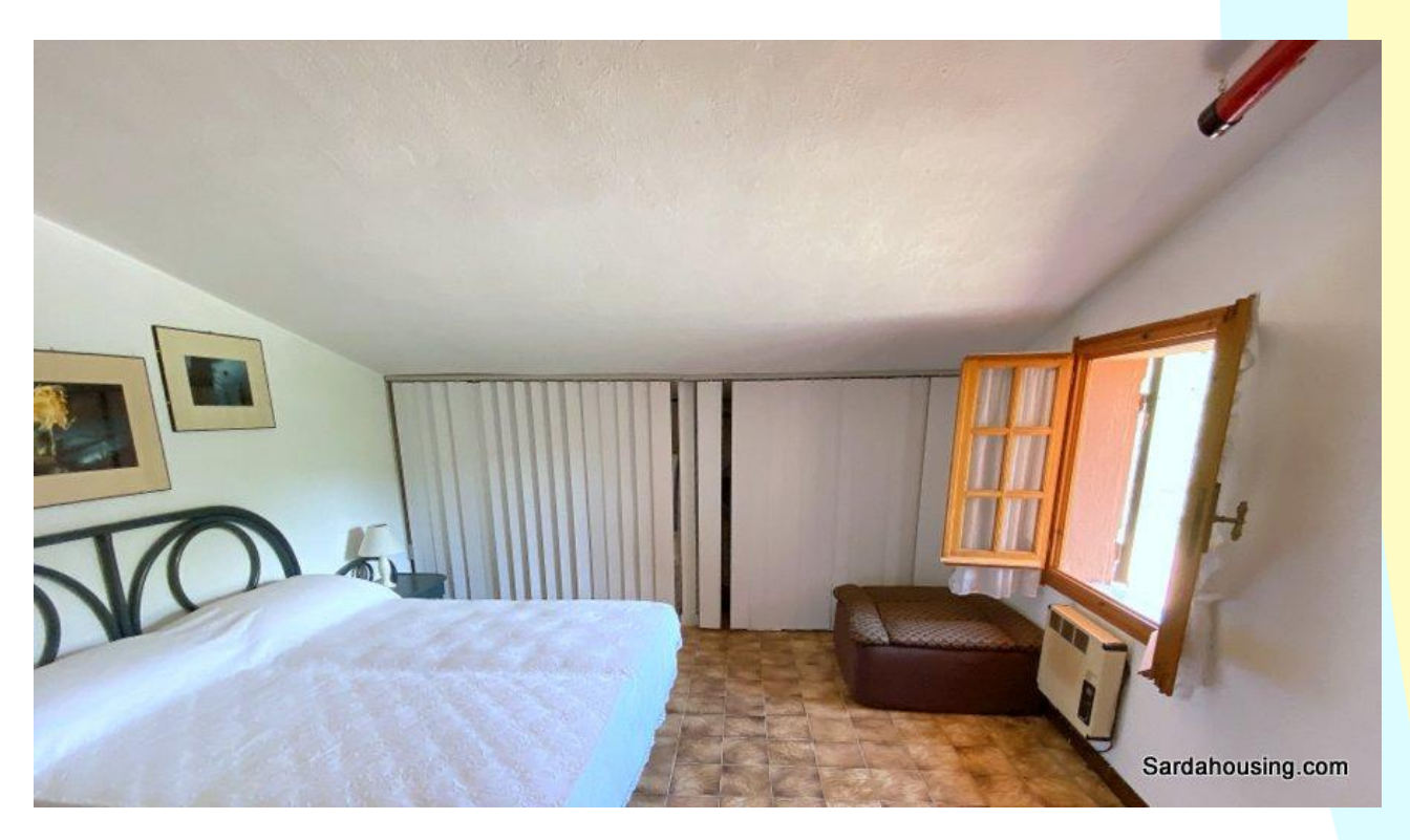
34 - Soleminis – Cagliari – Villa Cavana: bedroom in the attic