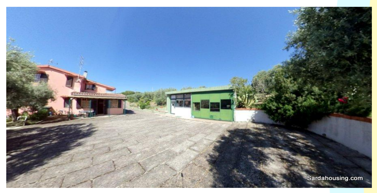
3 - Soleminis - Cagliari - Villa Cavana

info@sardahousing.com - www.sardahousing.com