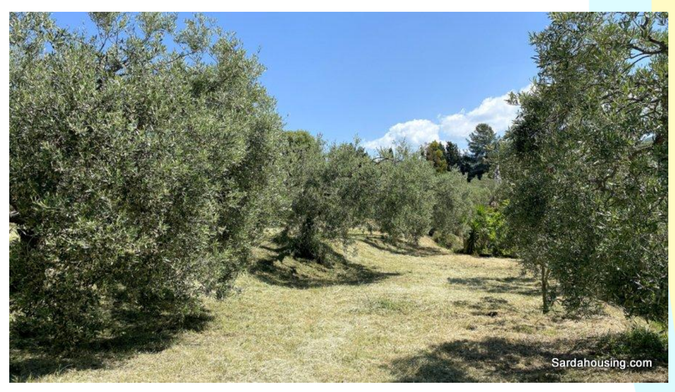
8 - Soleminis – Cagliari – Villa Cavana: garden