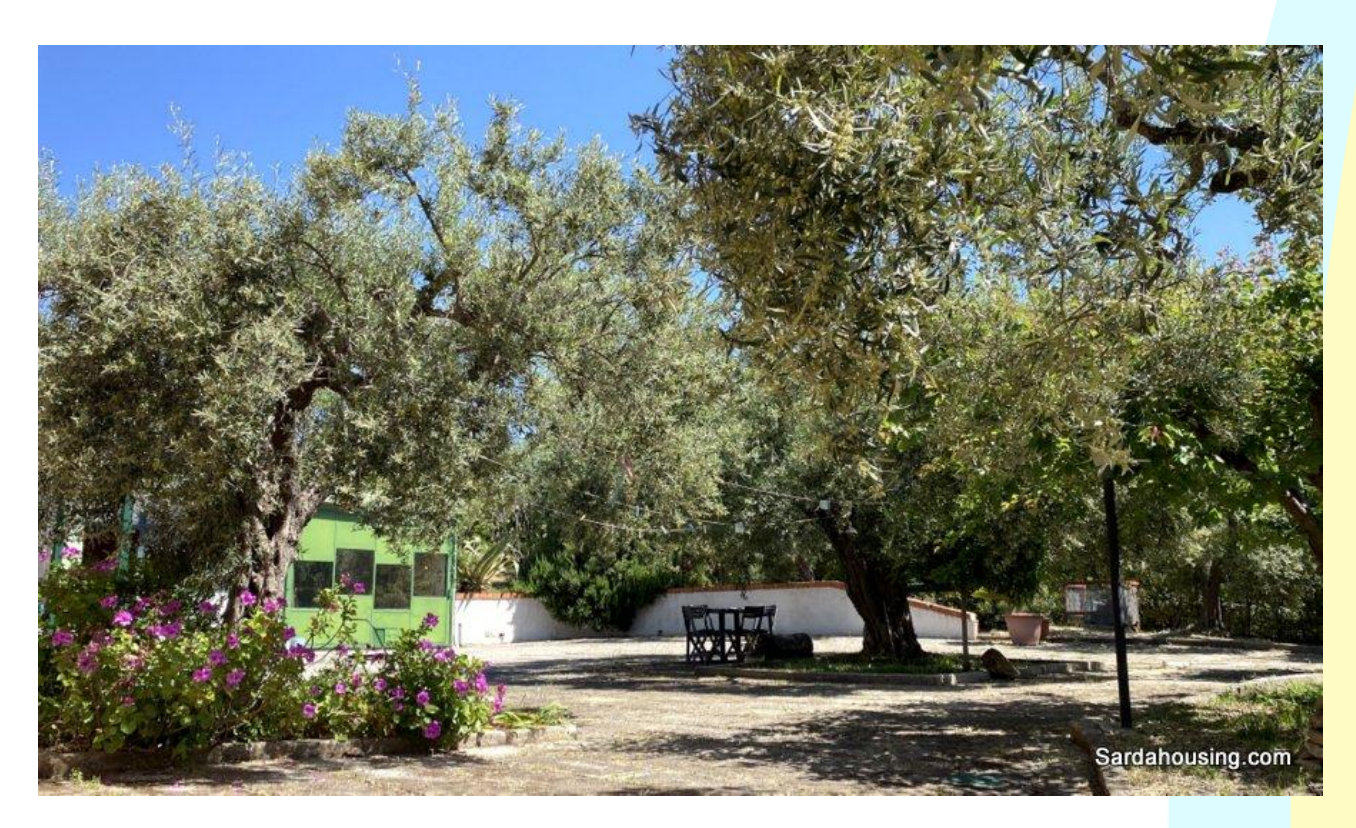
13 - Soleminis – Cagliari – Villa Cavana: garage area