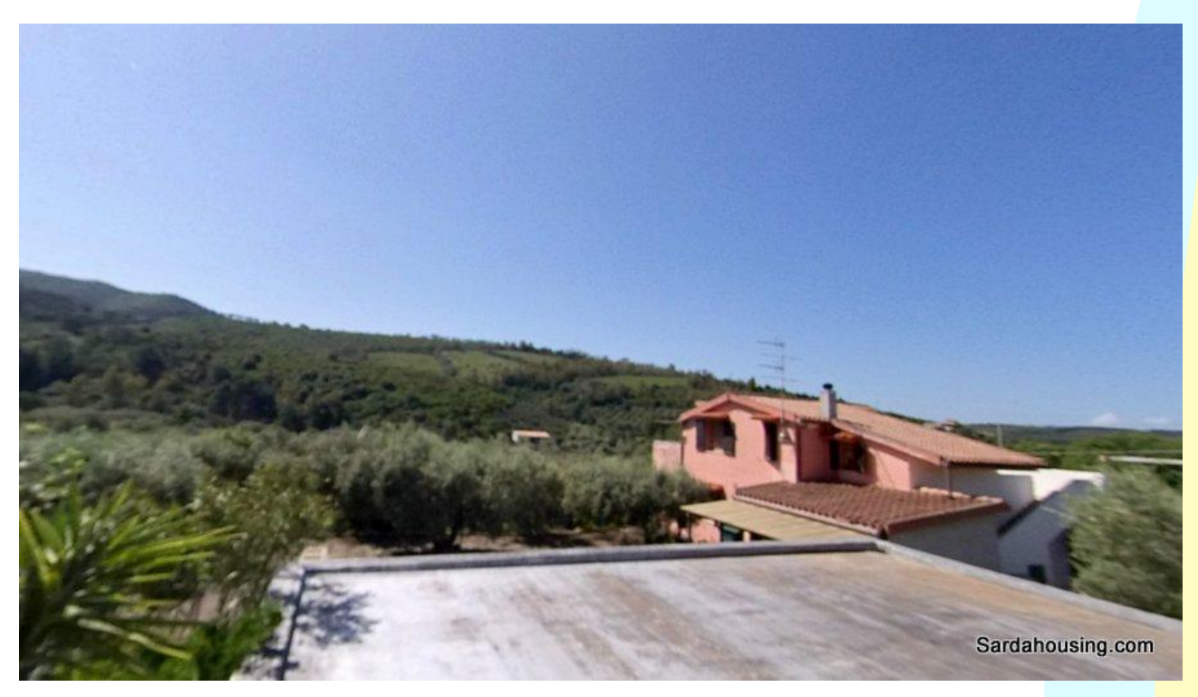
5 - Soleminis – Cagliari – Villa Cavana