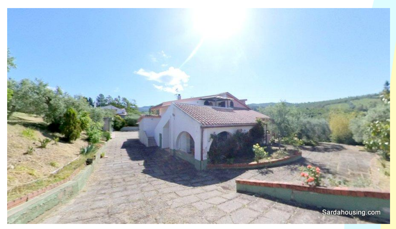
2 - Soleminis – Cagliari – Villa Cavana: