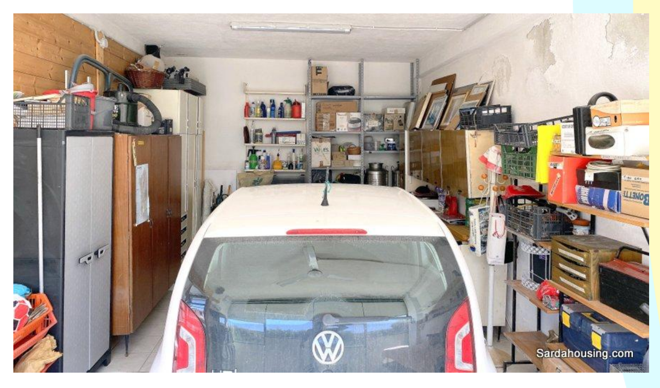
40 - Soleminis — Cagliari — Villa Cavana: garage