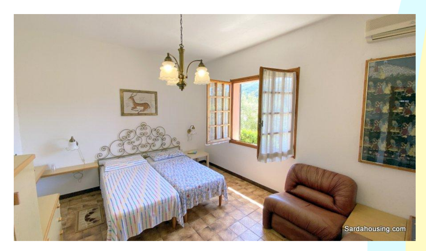
21 - Soleminis – Cagliari – Villa Cavana: bedroom