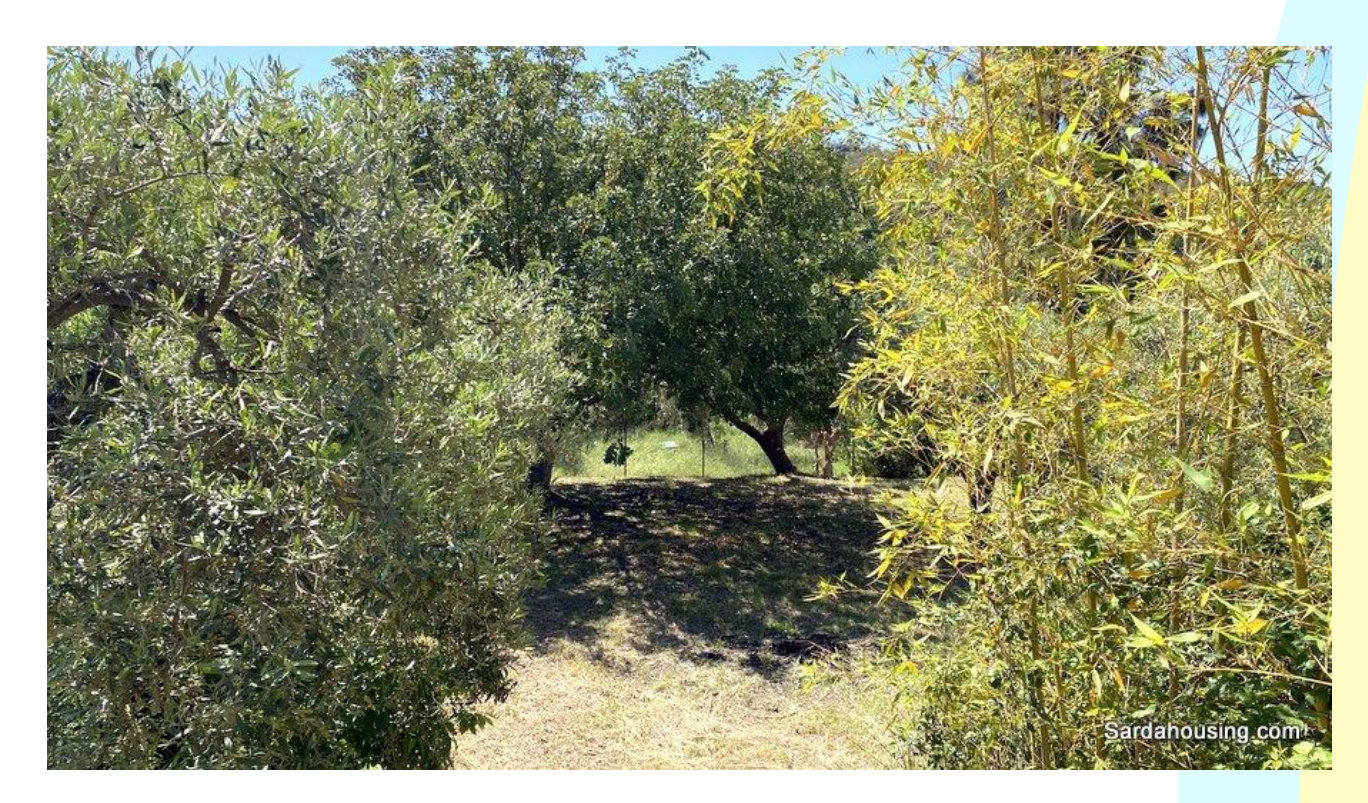
11 - Soleminis – Cagliari – Villa Cavana: garden