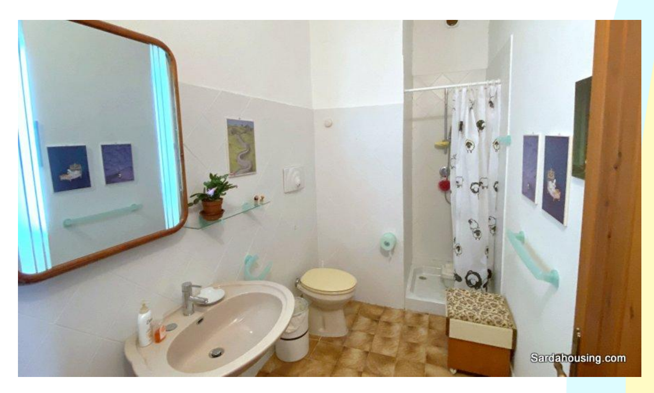
25 - Soleminis – Cagliari – Villa Cavana: the second bathroom