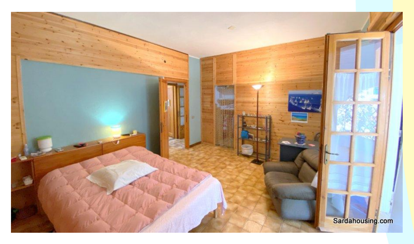
20 - Soleminis – Cagliari – Villa Cavana: bedroom