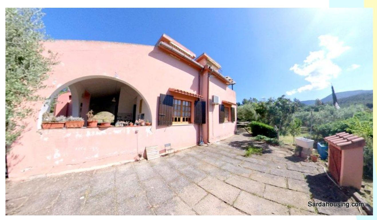
3 - Soleminis – Cagliari – Villa Cavana