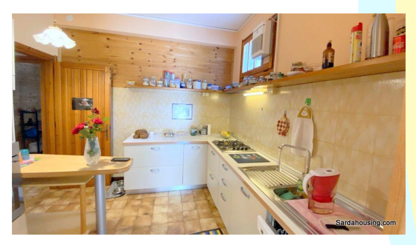
18 - Soleminis – Cagliari – Villa Cavana: kitchenette