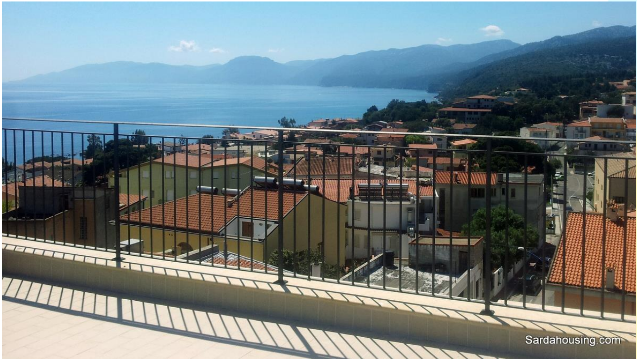
17 - Cala Gonone – Dorgali – Apartments Amerigo: sea view from roof terrace