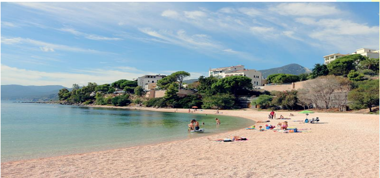
Cala Gonone – Spiaggia Centrale

Distances: Dorgali 10 km; Nuoro: 39 km; Olbia porto e aeroporto: 107 km.