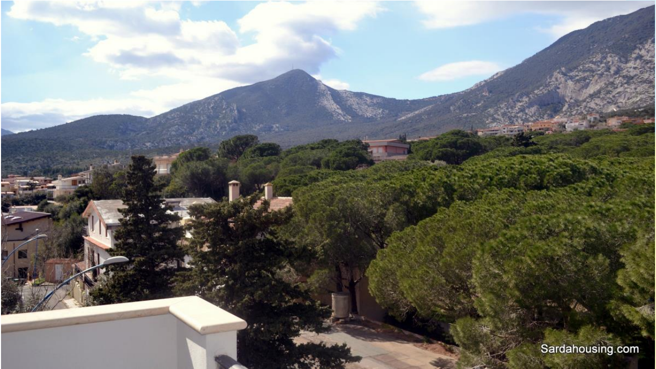
19 - Cala Gonone – Dorgali – Apartments Amerigo: view from penthouse