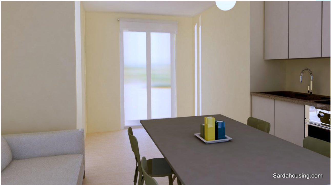
9 - Cala Gonone – Dorgali – Apartments Amerigo