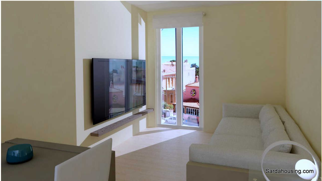
11 - Cala Gonone – Dorgali – Apartments Amerigo