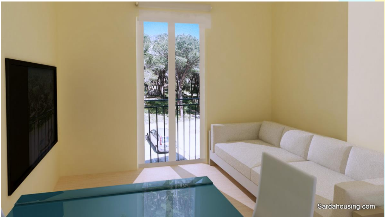
7 - Cala Gonone – Dorgali – Apartments Amerigo