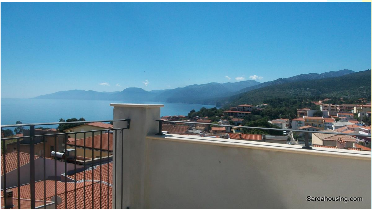
20 - Cala Gonone – Dorgali – Apartments Amerigo: sea view from roof terrace