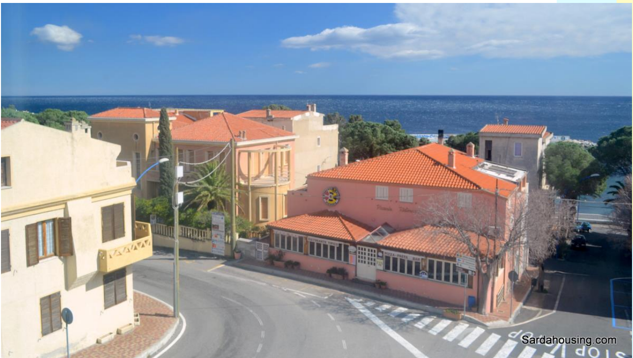
21 - Cala Gonone – Dorgali – Apartments Amerigo: sea view from roof terrace