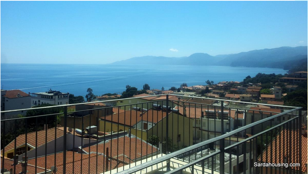
3 - Cala Gonone – Dorgali – Apartments Amerigo: sea view from roof terrace