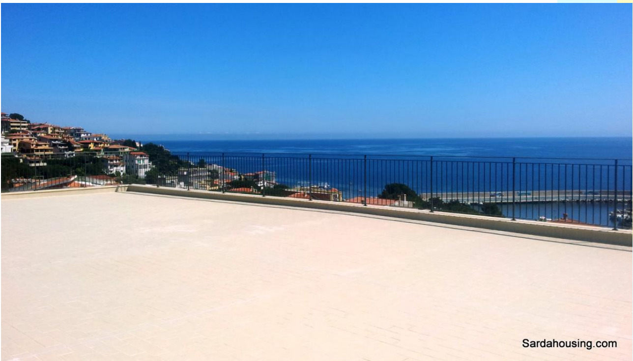
14 - Cala Gonone – Dorgali – Apartments Amerigo: sea view from roof terrace