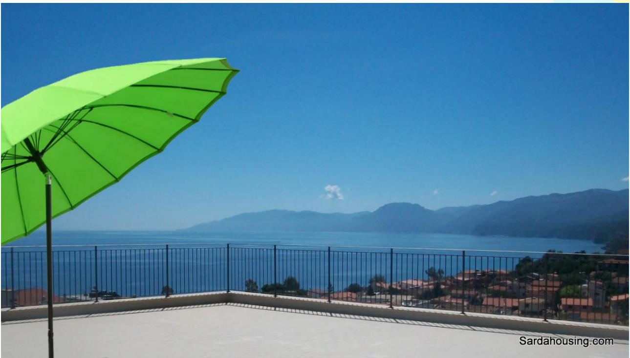
4 - Cala Gonone – Dorgali – Apartments Amerigo: sea view from roof terrace