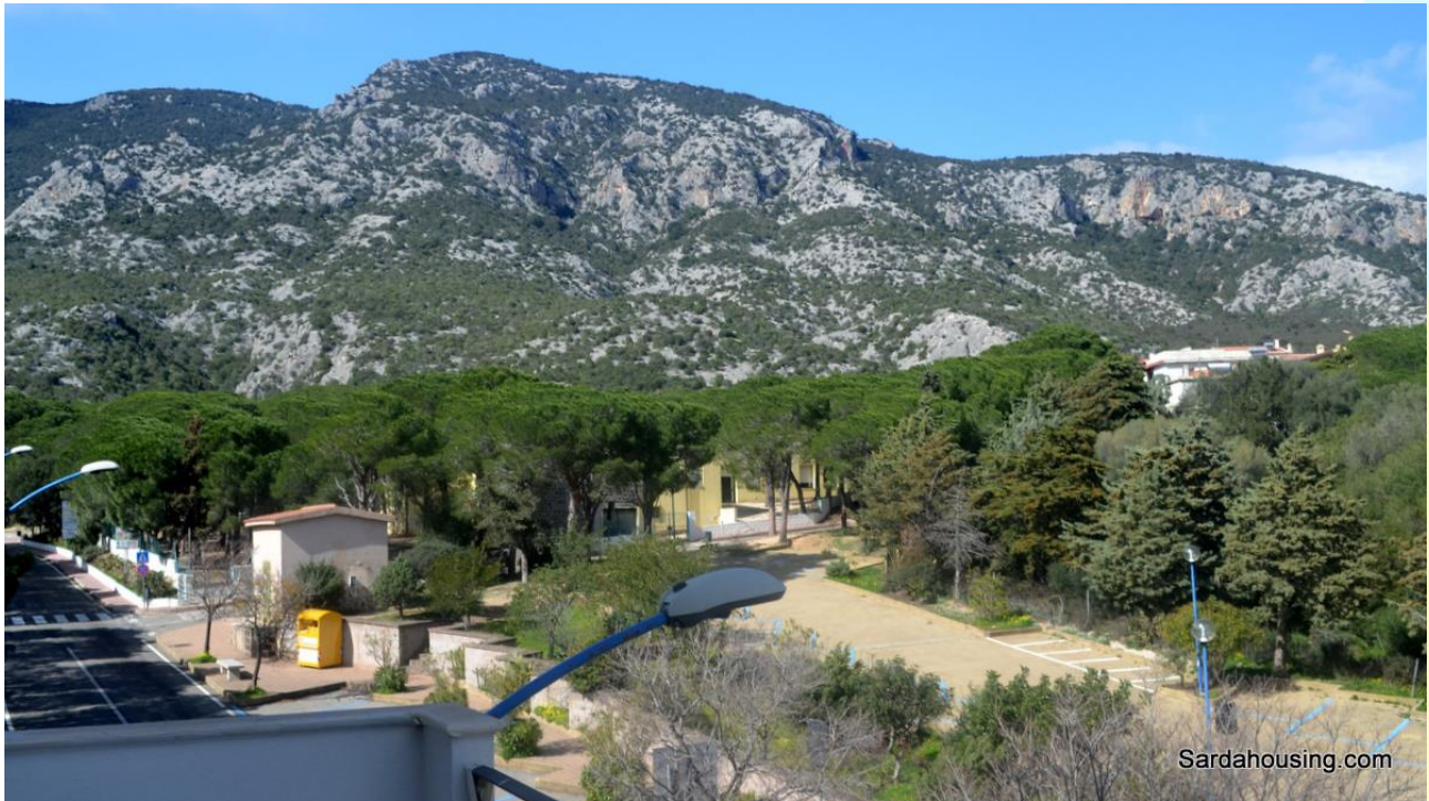
23 - Cala Gonone – Dorgali – Apartments Amerigo: sea view