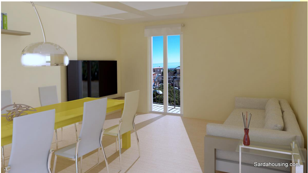
12 - Cala Gonone – Dorgali – Apartments Amerigo