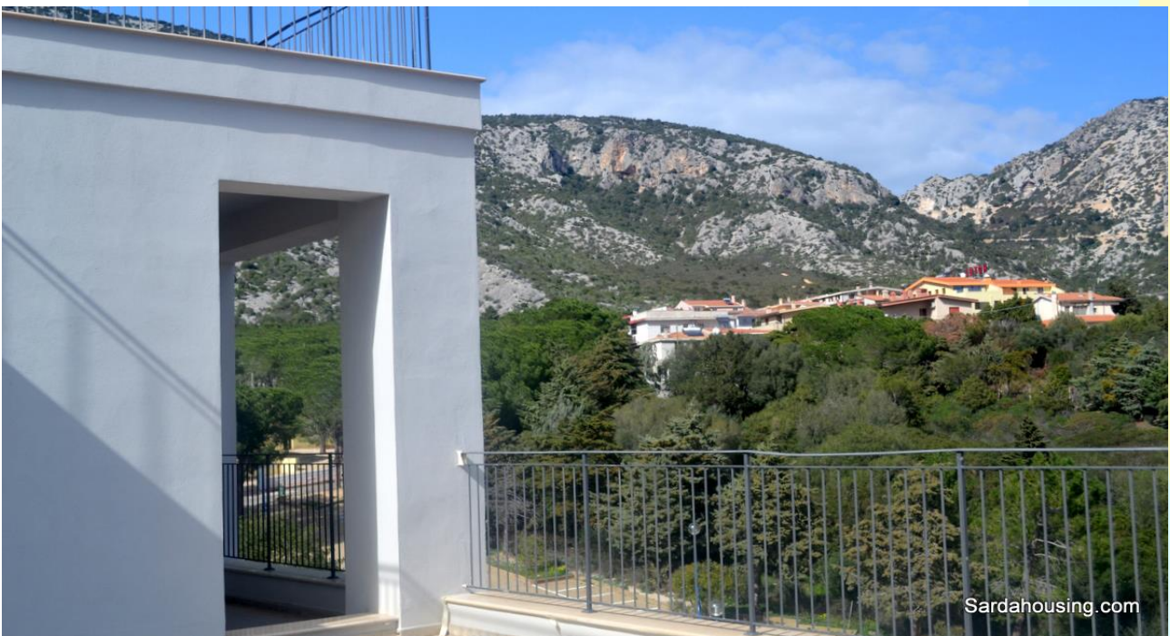
5 - Cala Gonone – Dorgali – Apartments Amerigo: sea view from roof terrace