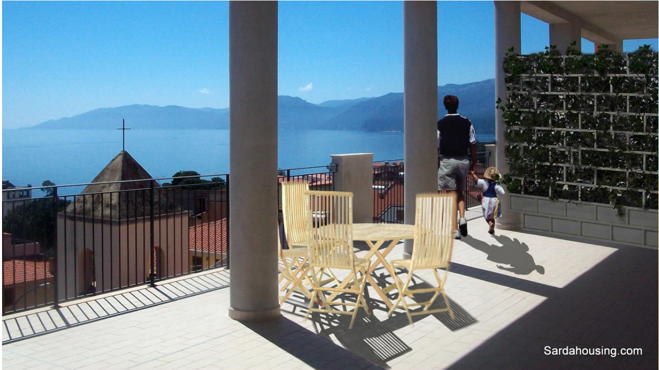
2 – Cala Gonone – Dorgali – Apartments Amerigo: sea view from penthouse terrace