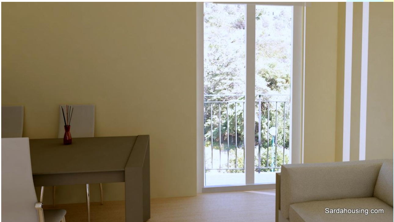
10 - Cala Gonone – Dorgali – Apartments Amerigo