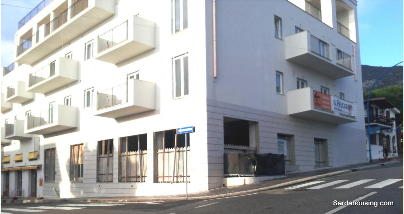
25 - Cala Gonone – Dorgali – Apartments Amerigo: the completely renewed building