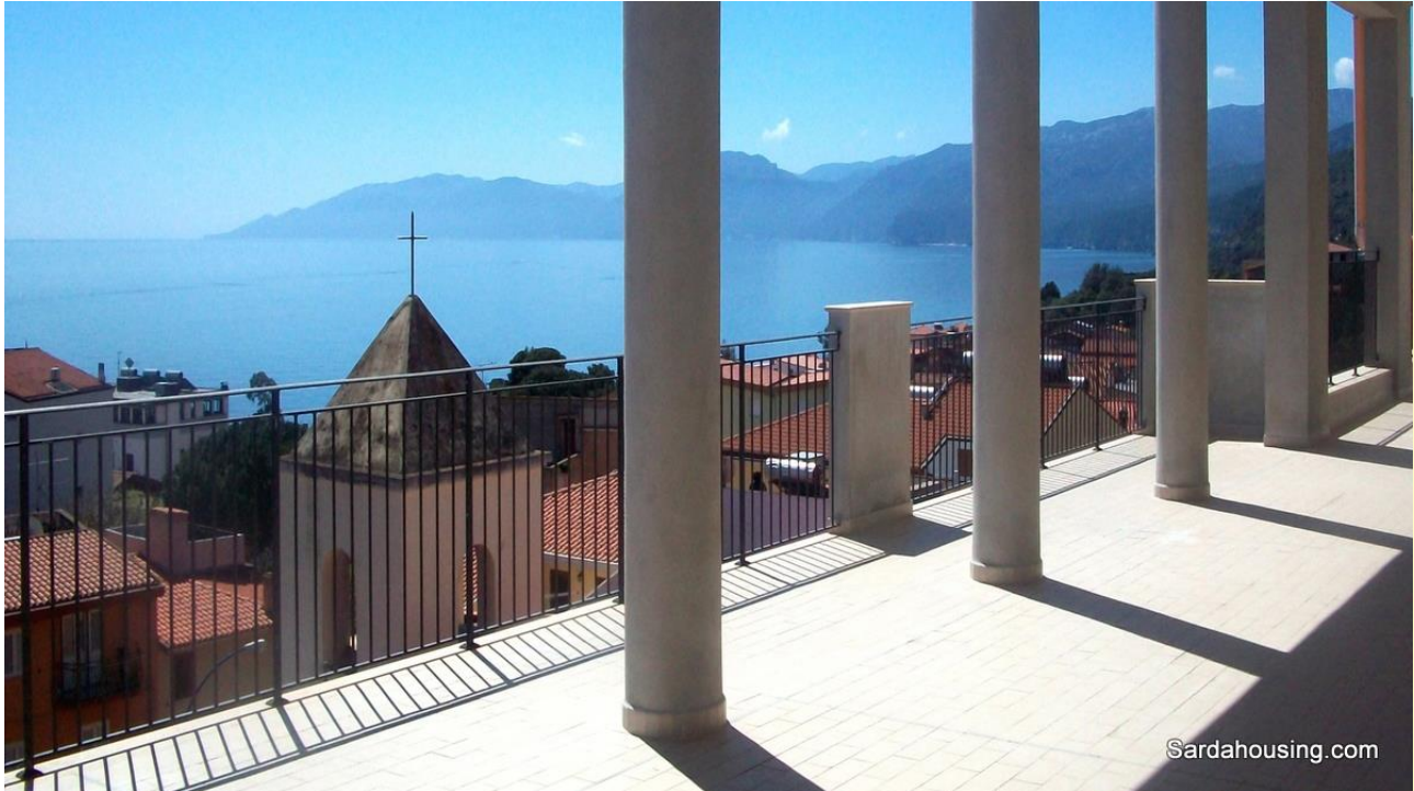
1 – Cala Gonone – Dorgali – Apartments Amerigo: sea view from penthouse terrace

In Cala Gonone , one of the best known sea locations on the east coast of Sardinia , we offer new panoramic apartments 150 metres to the beach .