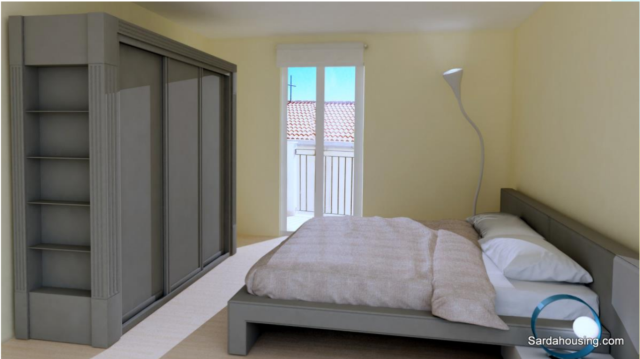
13 - Cala Gonone – Dorgali – Apartments Amerigo