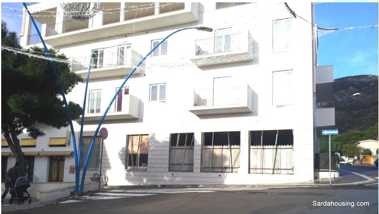
24 - Cala Gonone – Dorgali – Apartments Amerigo: the completely renewed building