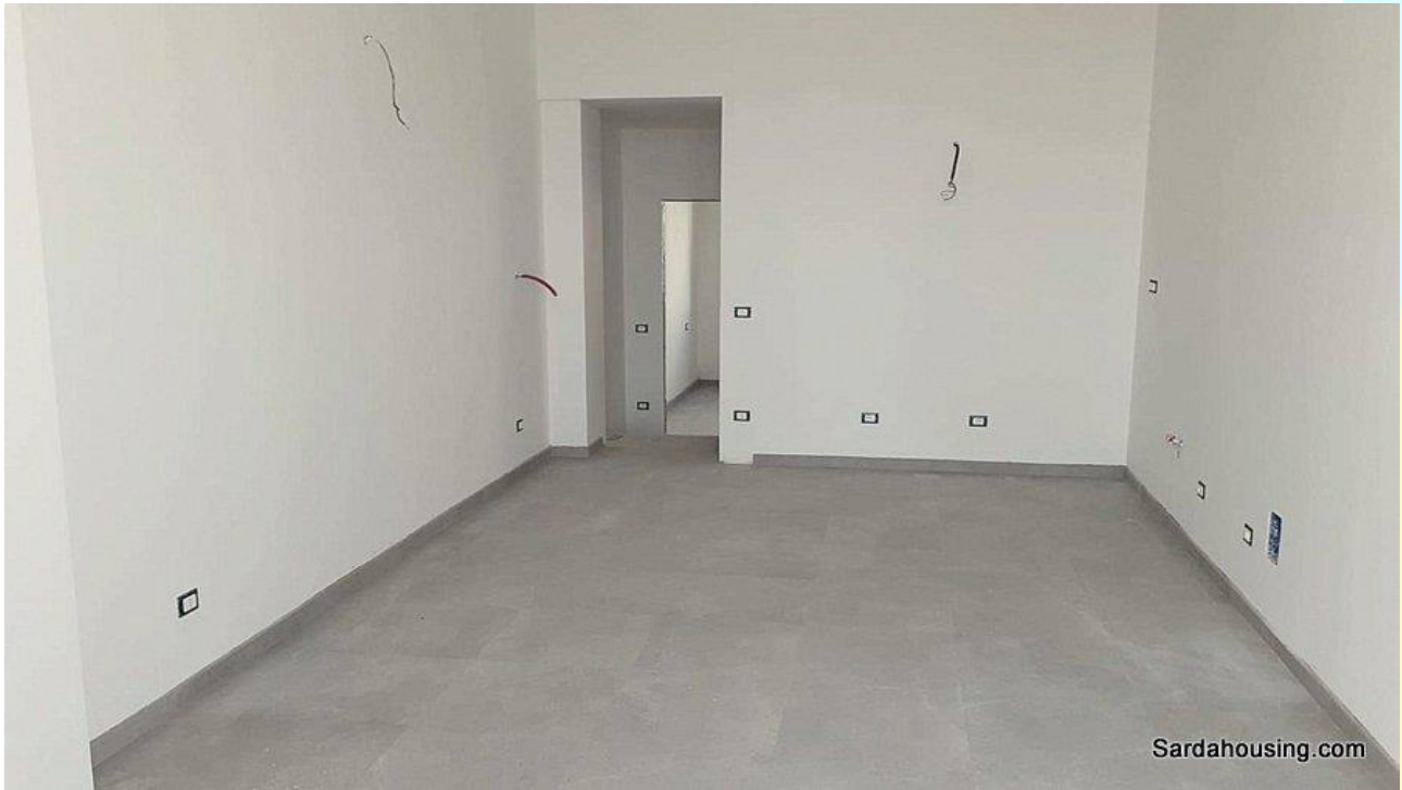
13 - Carloforte – Isola S. Pietro – Buildings Le Colonie