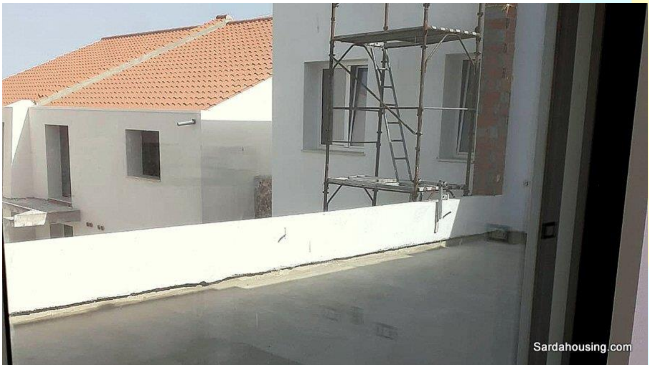
20 - Carloforte – Isola S. Pietro – Buildings Le Colonie