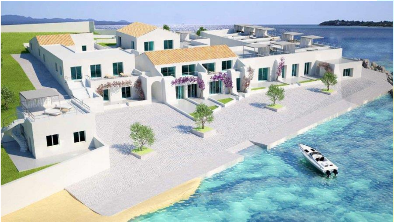
3 - Carloforte – Isola S. Pietro – Buildings Le Colonie