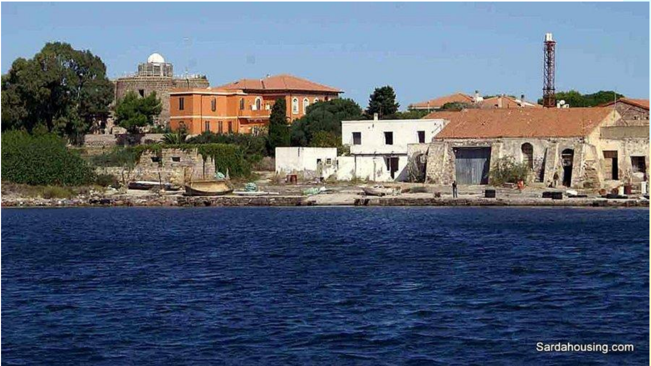
25 - Carloforte – Isola S. Pietro – Buildings Le Colonie (before renovation)