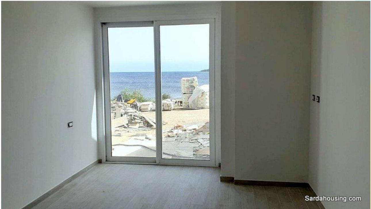
9 - Carloforte – Isola S. Pietro – Buildings Le Colonie