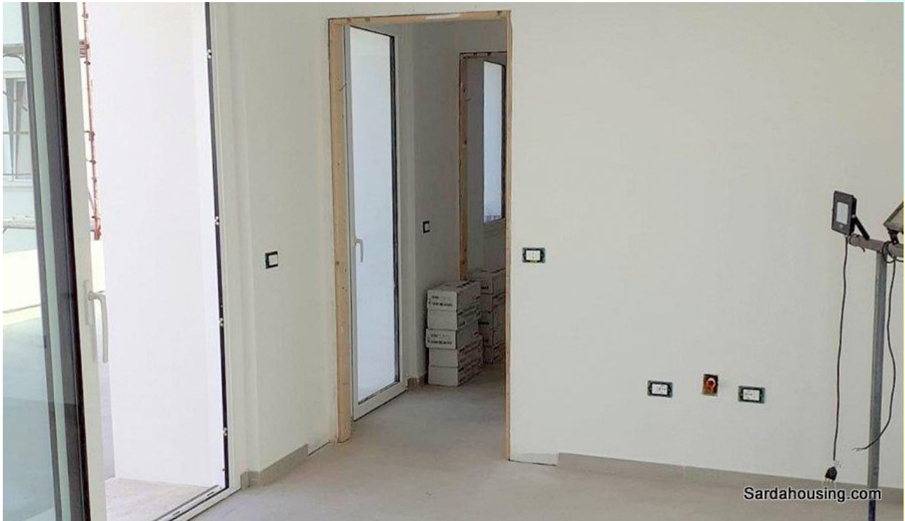
19 - Carloforte – Isola S. Pietro – Buildings Le Colonie