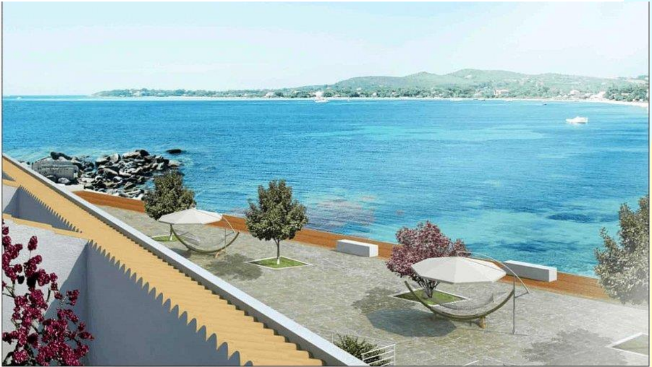
5 - Carloforte – Isola S. Pietro – Buildings Le Colonie