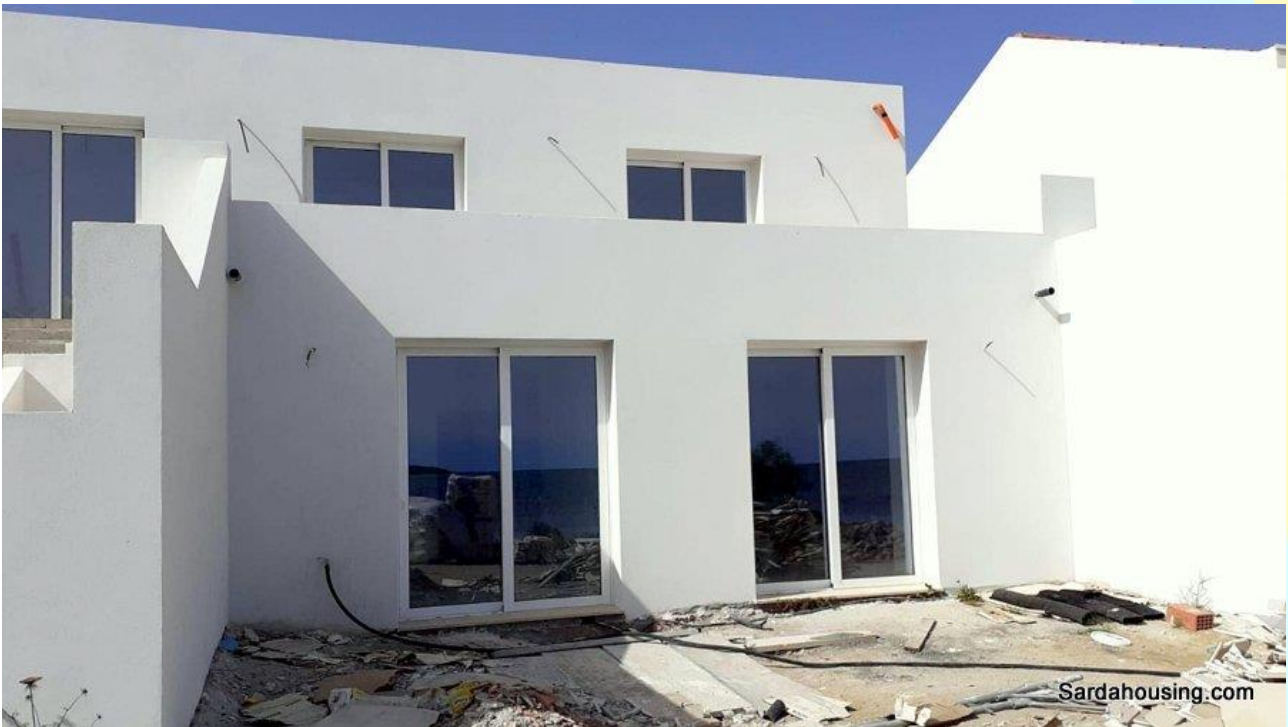
12 - Carloforte – Isola S. Pietro – Buildings Le Colonie