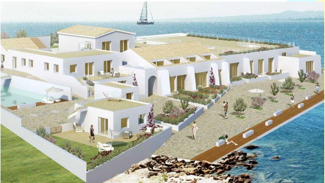
2 - Carloforte – Isola S. Pietro – Buildings Le Colonie

info@sardahousing.com - www.sardahousing.com