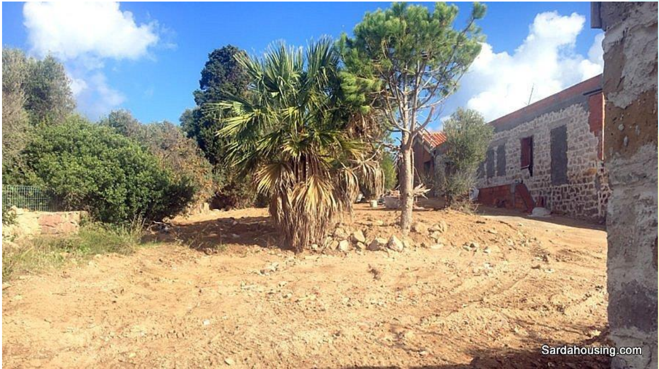
31 - Carloforte – Isola S. Pietro – Buildings Le Colonie