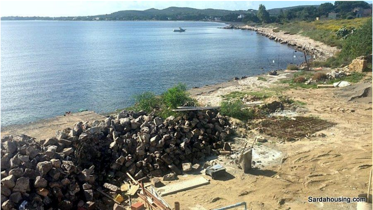
35 - Carloforte – Isola S. Pietro – Buildings Le Colonie