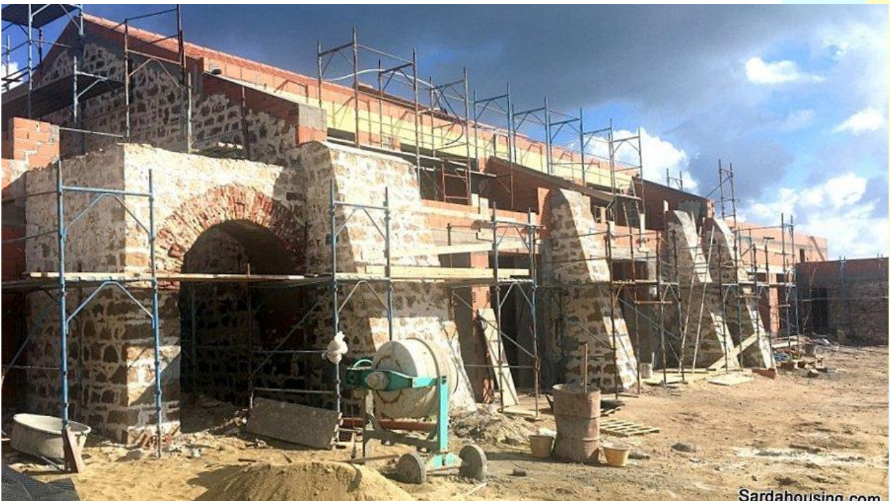
26 - Carloforte – Isola S. Pietro – Buildings Le Colonie