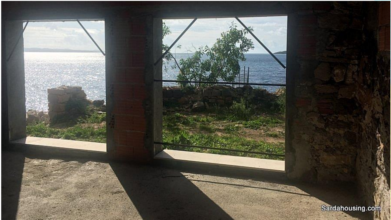
29 - Carloforte – Isola S. Pietro – Buildings Le Colonie