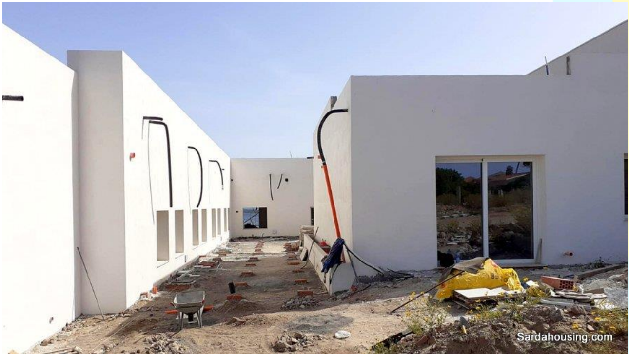
14 - Carloforte – Isola S. Pietro – Buildings Le Colonie