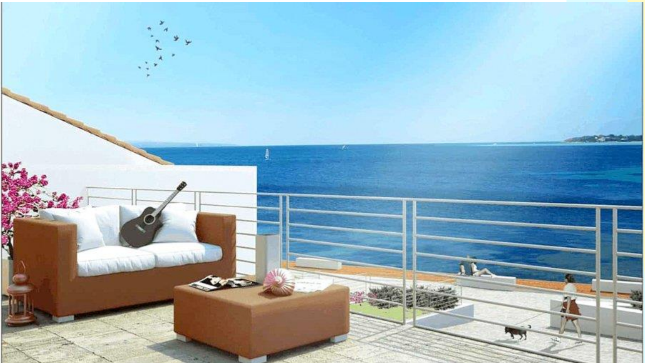
6 - Carloforte – Isola S. Pietro – Buildings Le Colonie