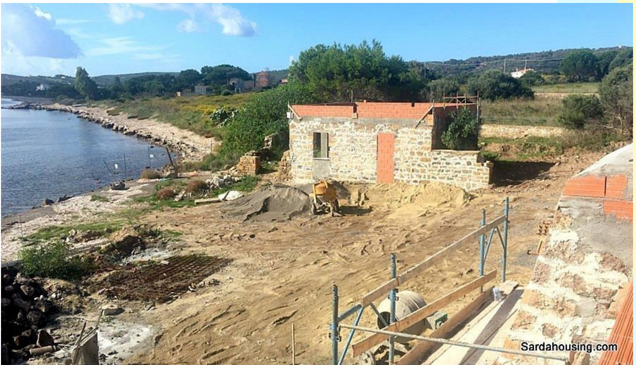
28 - Carloforte – Isola S. Pietro – Buildings Le Colonie