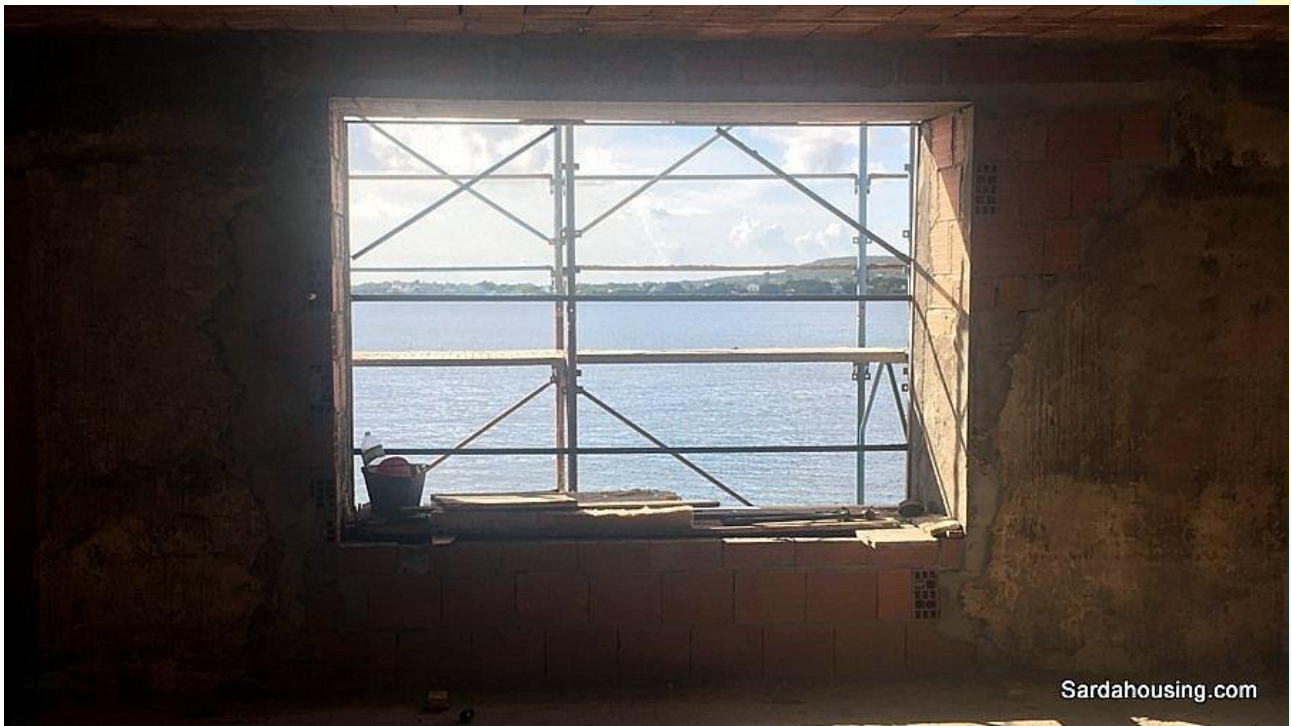
32 - Carloforte – Isola S. Pietro – Buildings Le Colonie