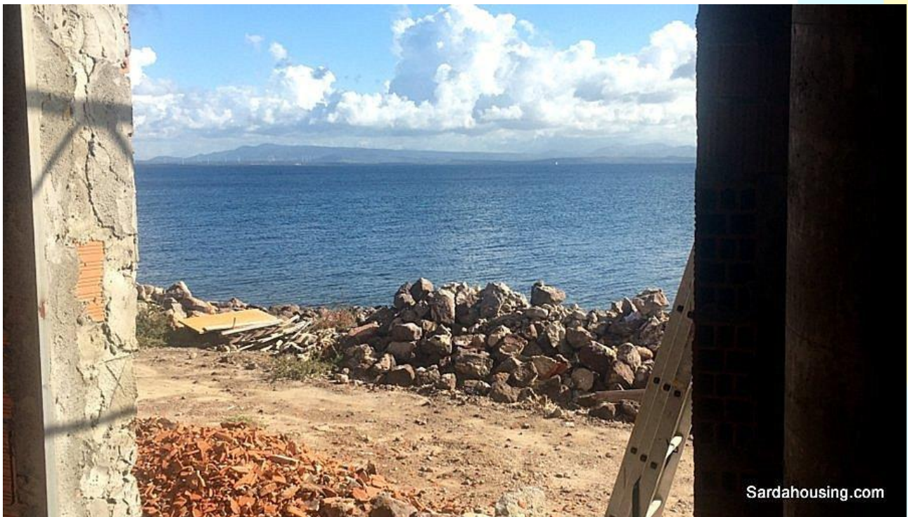
30 - Carloforte – Isola S. Pietro – Buildings Le Colonie