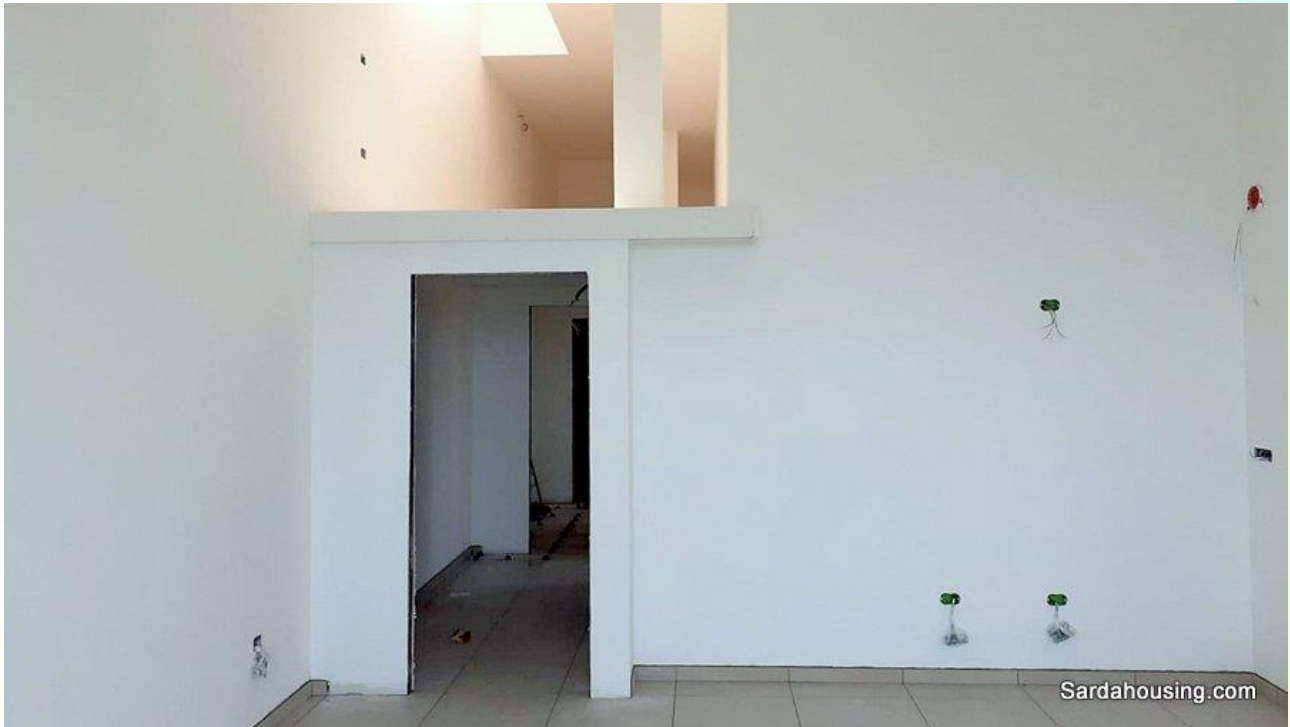
15 - Carloforte – Isola S. Pietro – Buildings Le Colonie