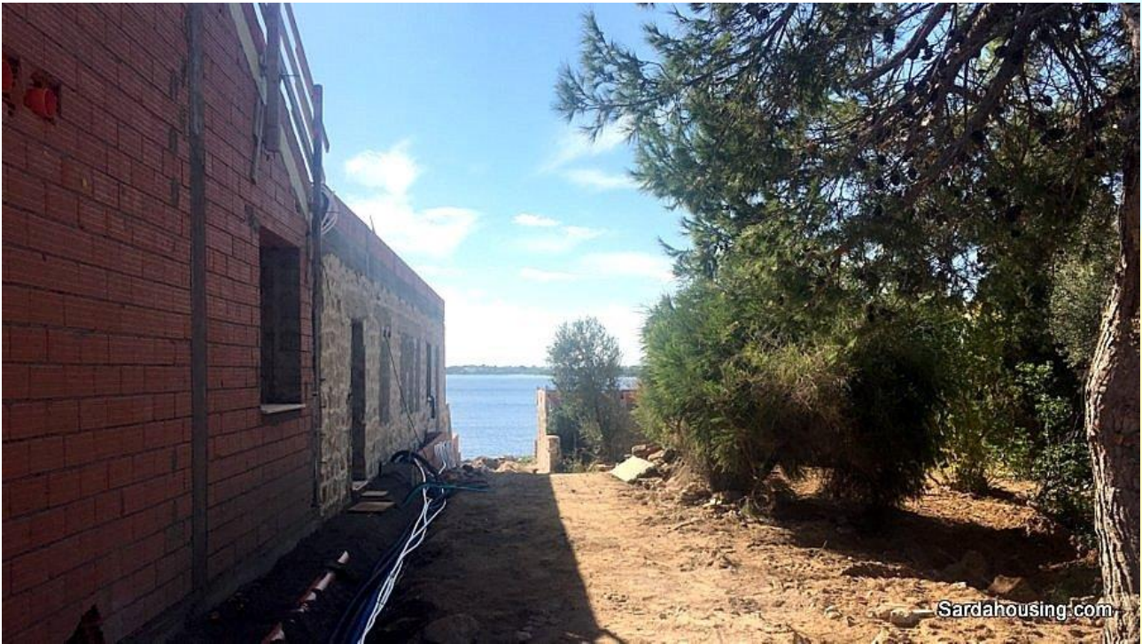
37 - Carloforte – Isola S. Pietro – Buildings Le Colonie