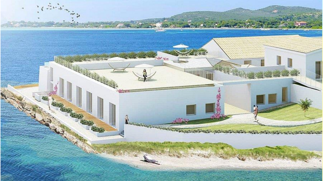
1 – Carloforte – Isola S. Pietro – Complesso Le Colonie

In Carloforte , on Island of San Pietro in Sardinia , we offer a seafront complex of buildings, being redeveloped into residential units .