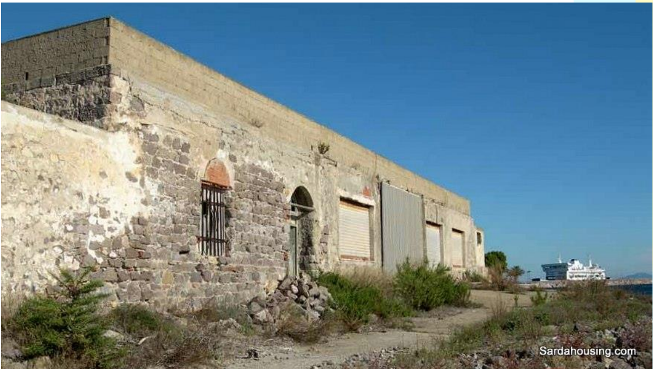
22- Carloforte – Isola S. Pietro – Buildings Le Colonie: (before renovation)