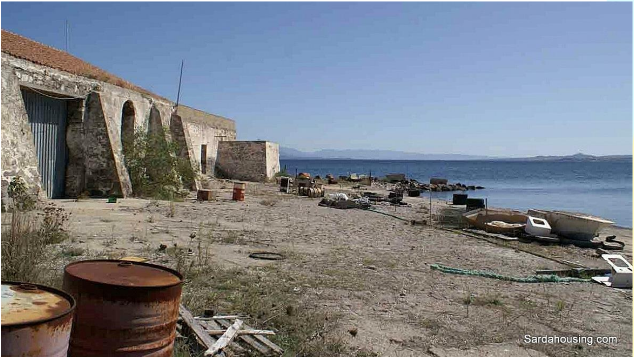
21- Carloforte – Isola S. Pietro – Sea front Buildings Le Colonie (before renovation)