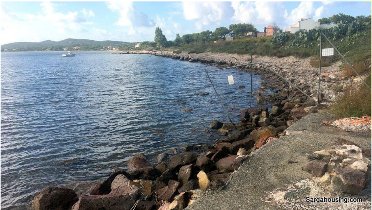
34 - Carloforte – Isola S. Pietro – Buildings Le Colonie