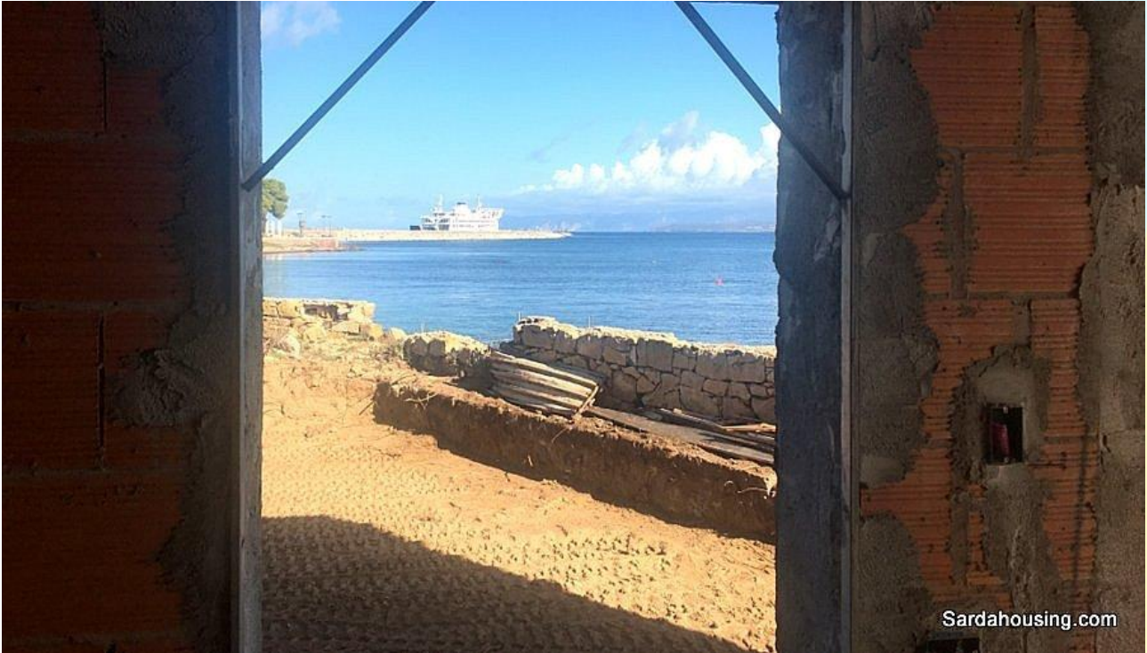
33 - Carloforte – Isola S. Pietro – Buildings Le Colonie