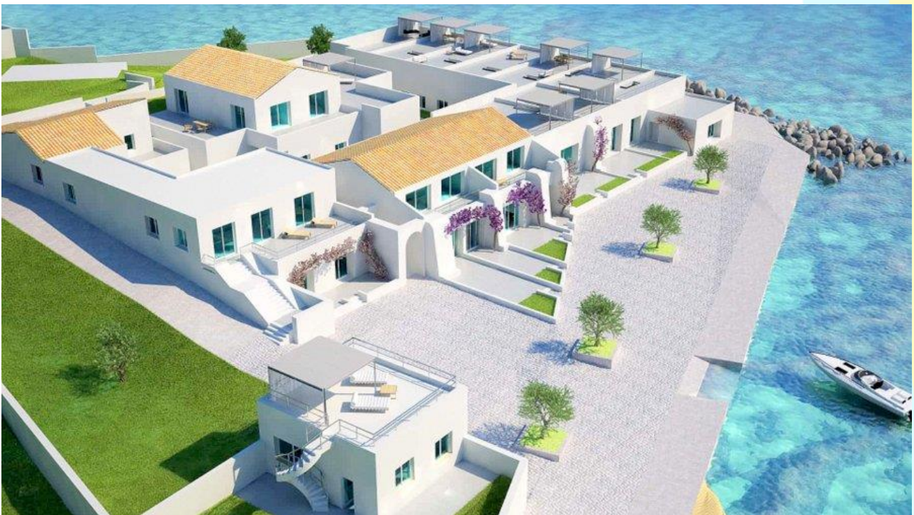
4 - Carloforte – Isola S. Pietro – Buildings Le Colonie