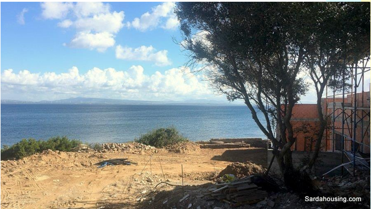
36 - Carloforte – Isola S. Pietro – Buildings Le Colonie