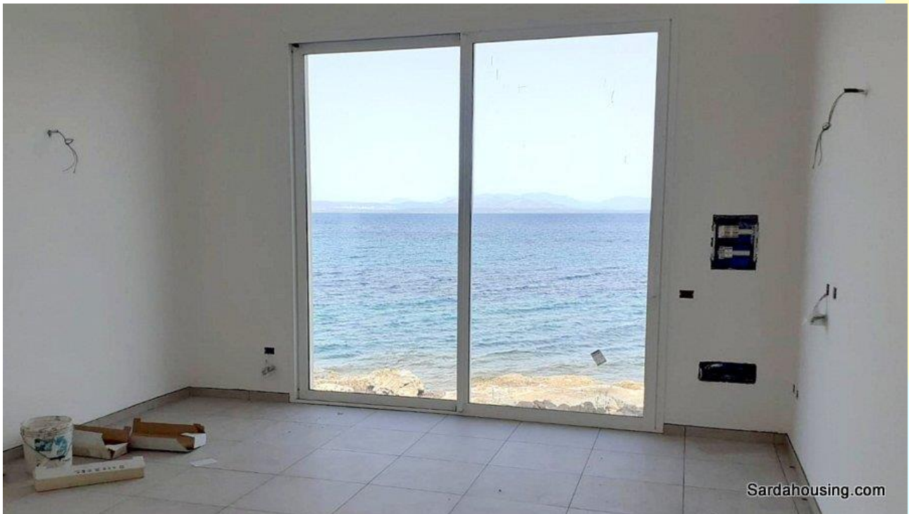
10 - Carloforte – Isola S. Pietro – Buildings Le Colonie