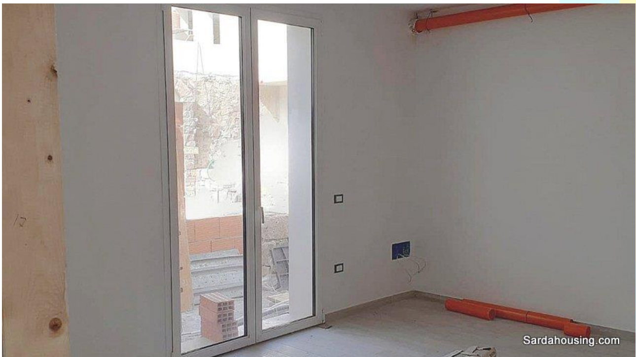
18 - Carloforte – Isola S. Pietro – Buildings Le Colonie