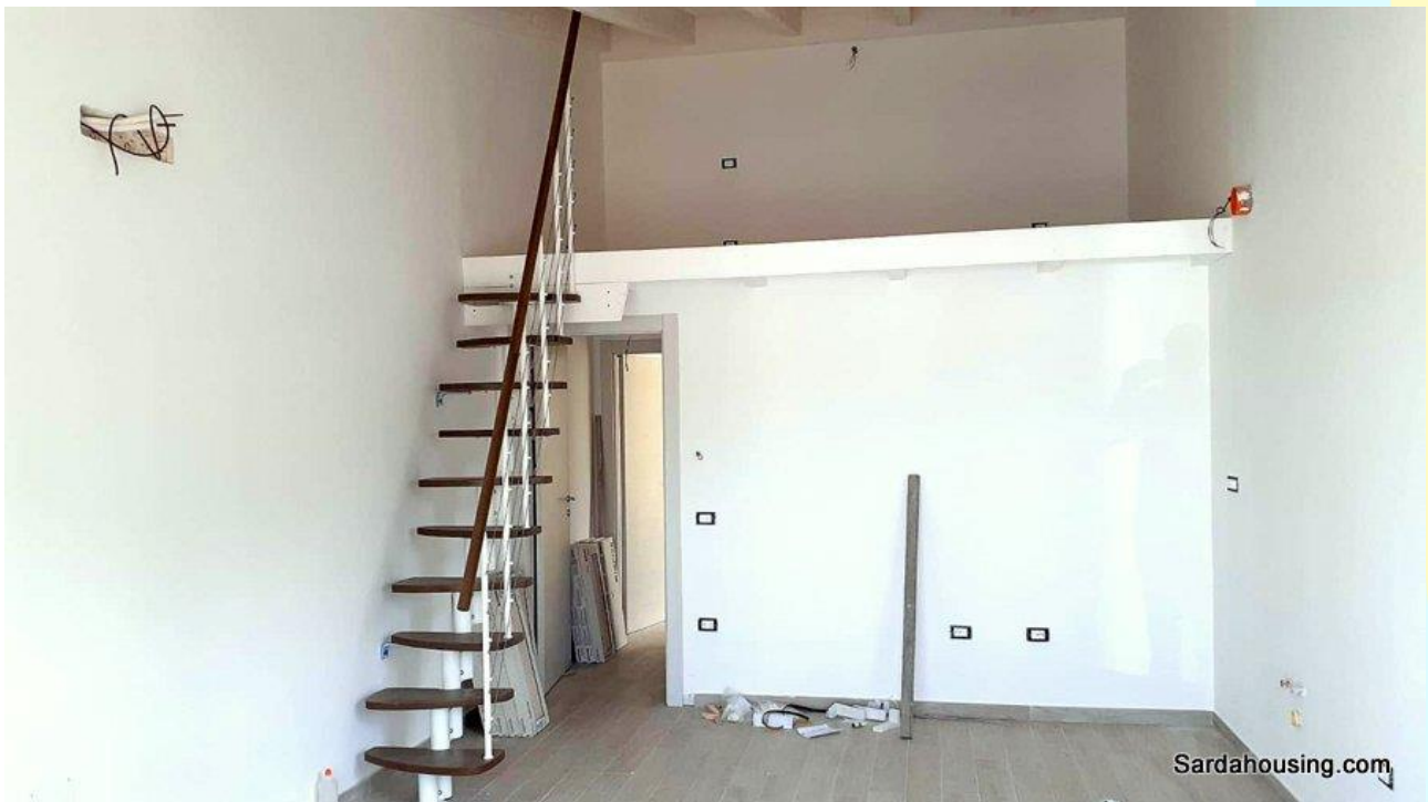
16 - Carloforte – Isola S. Pietro – Buildings Le Colonie