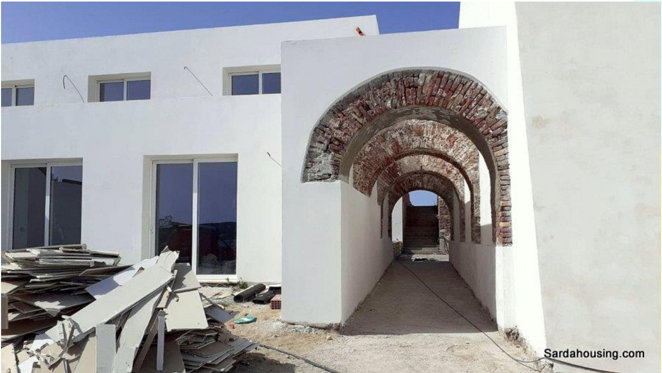
11 - Carloforte – Isola S. Pietro – Buildings Le Colonie