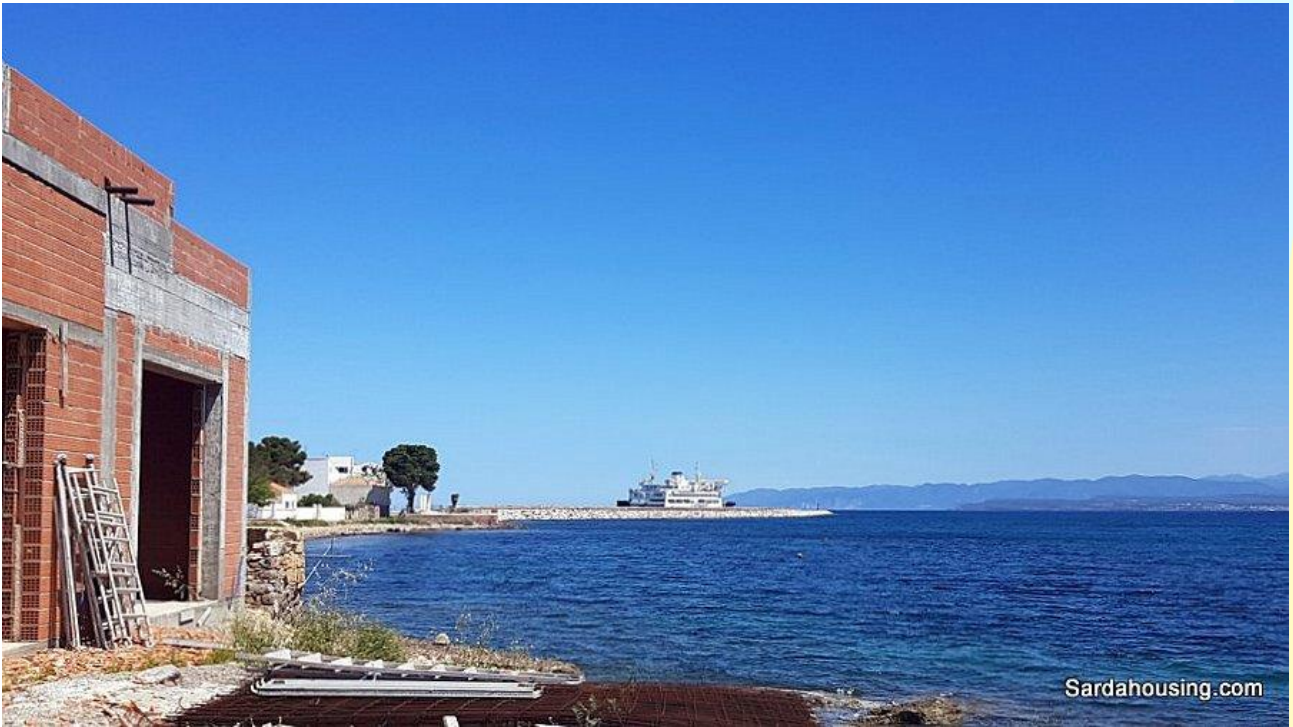
27 - Carloforte – Isola S. Pietro – Buildings Le Colonie