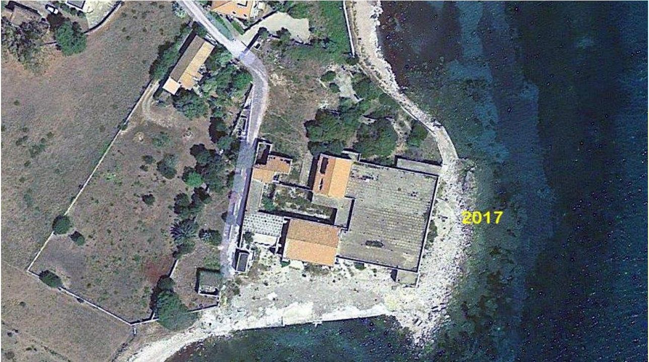
39 - Carloforte – Isola S. Pietro – Buildings Le Colonie