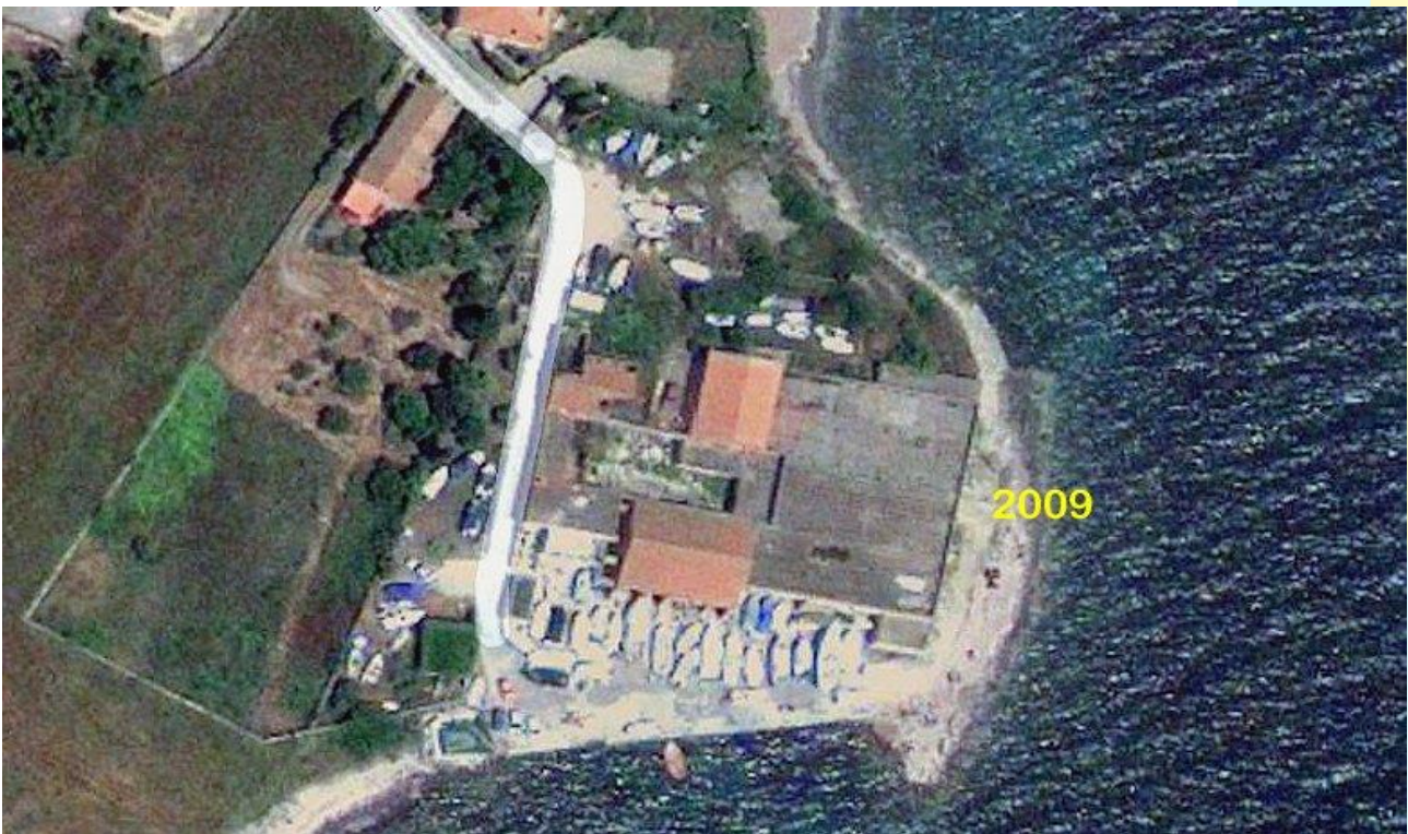
38 - Carloforte – Isola S. Pietro – Buildings Le Colonie