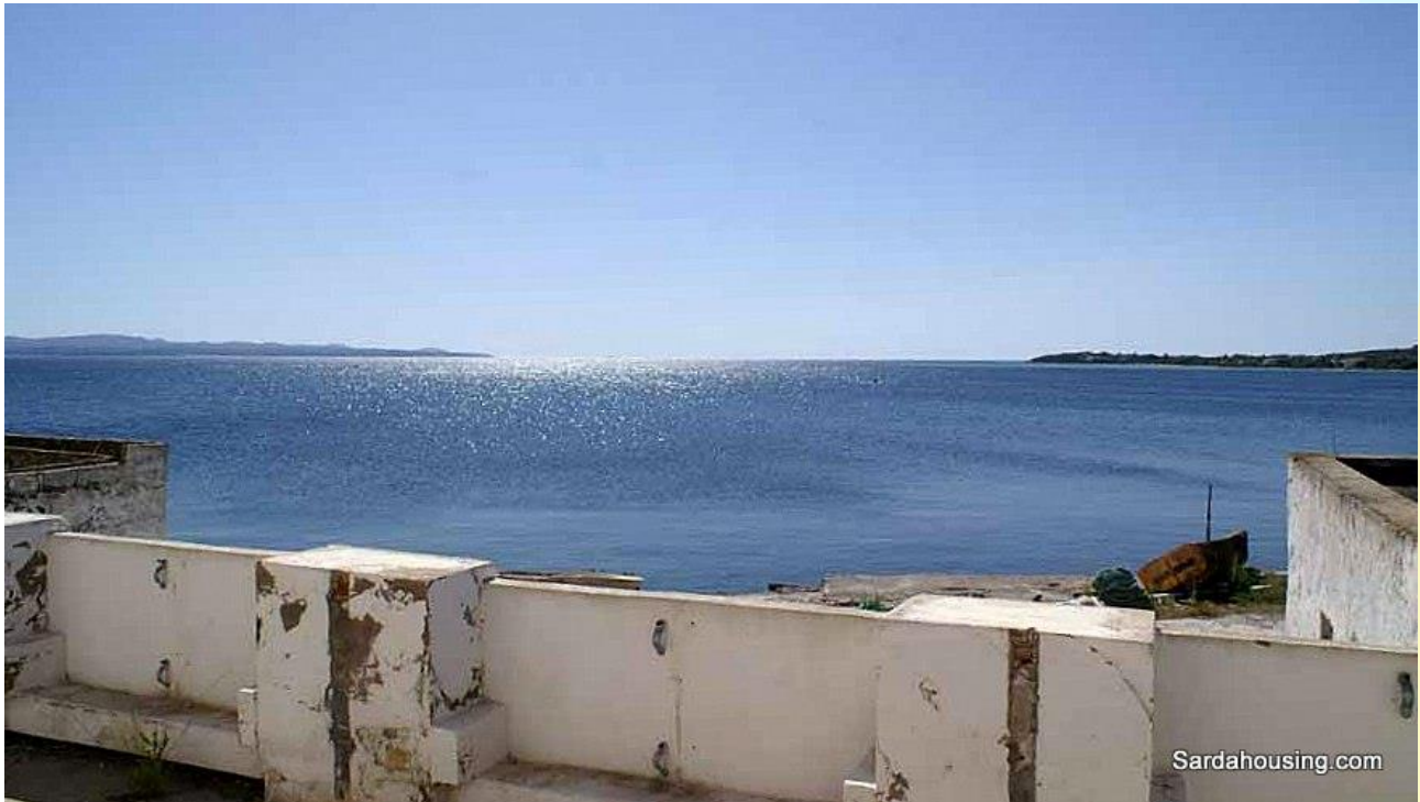
23 – Carloforte – Isola S. Pietro – Buildings Le Colonie: sea view (before renovation)