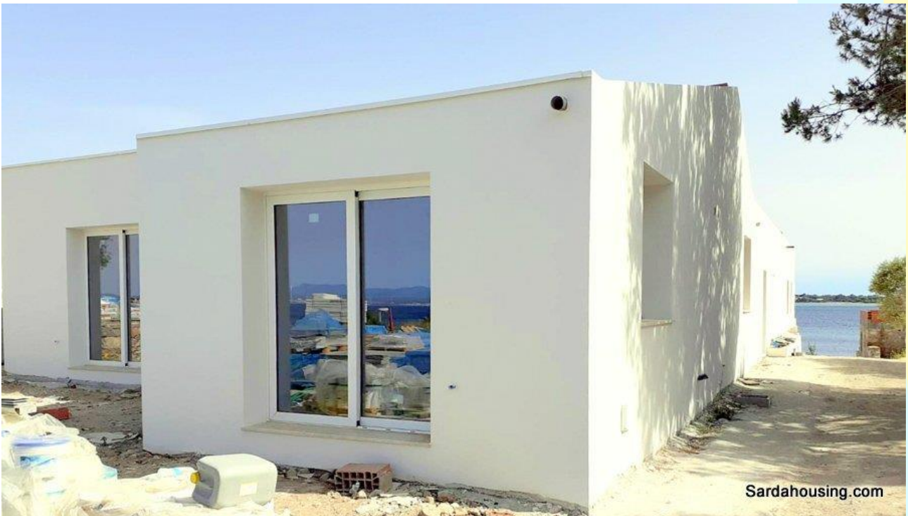
7 - Carloforte – Isola S. Pietro – Buildings Le Colonie