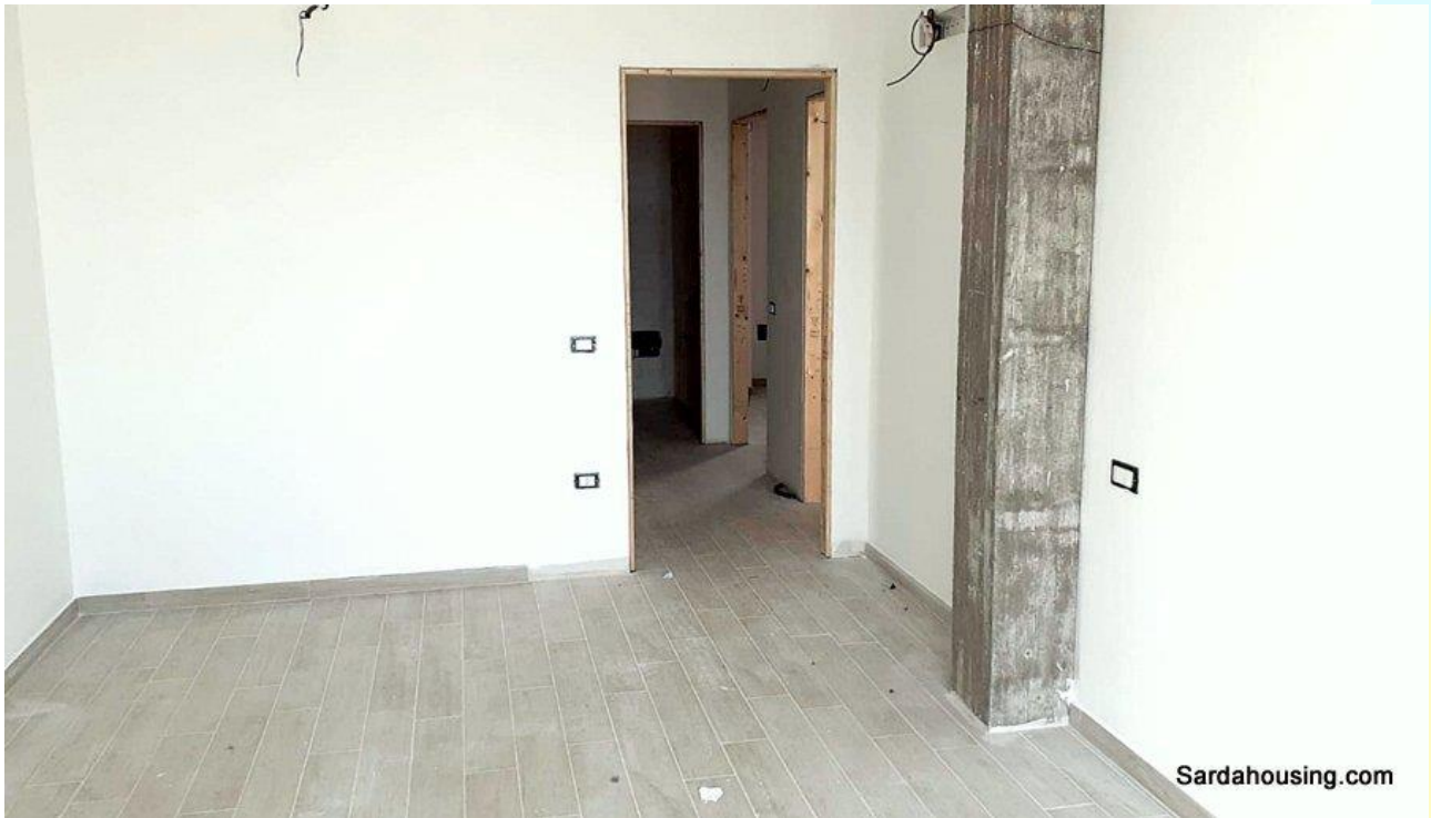
17 - Carloforte – Isola S. Pietro – Buildings Le Colonie