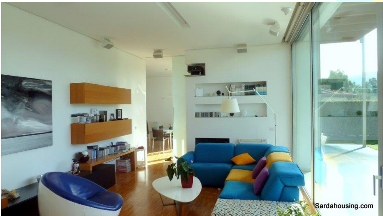
20 - Tiria, Palmas Arborea, Oristano - Villa with pool: living room