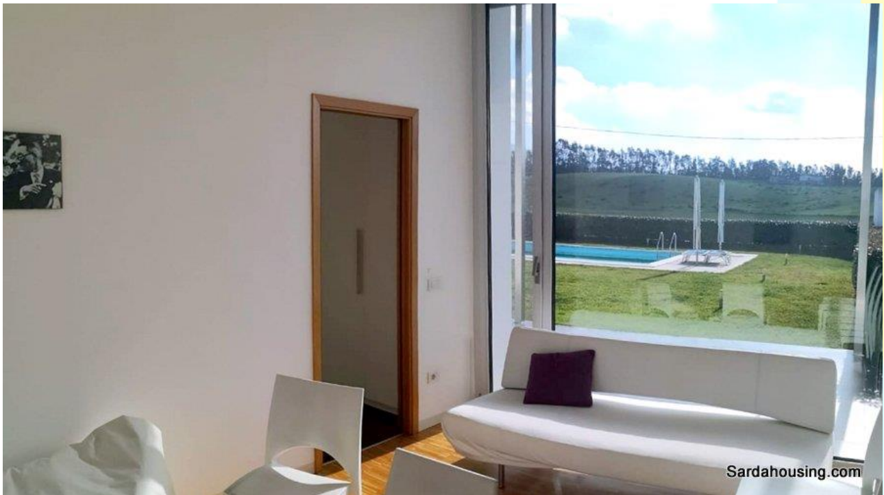
28 - Tiria, Palmas Arborea, Oristano - Villa with pool: dining area