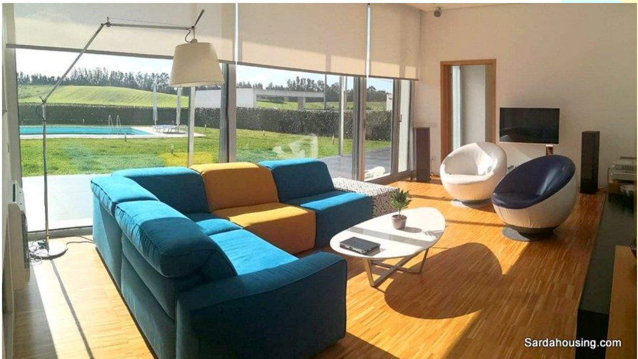
22 - Tiria, Palmas Arborea, Oristano - Villa with pool: living room