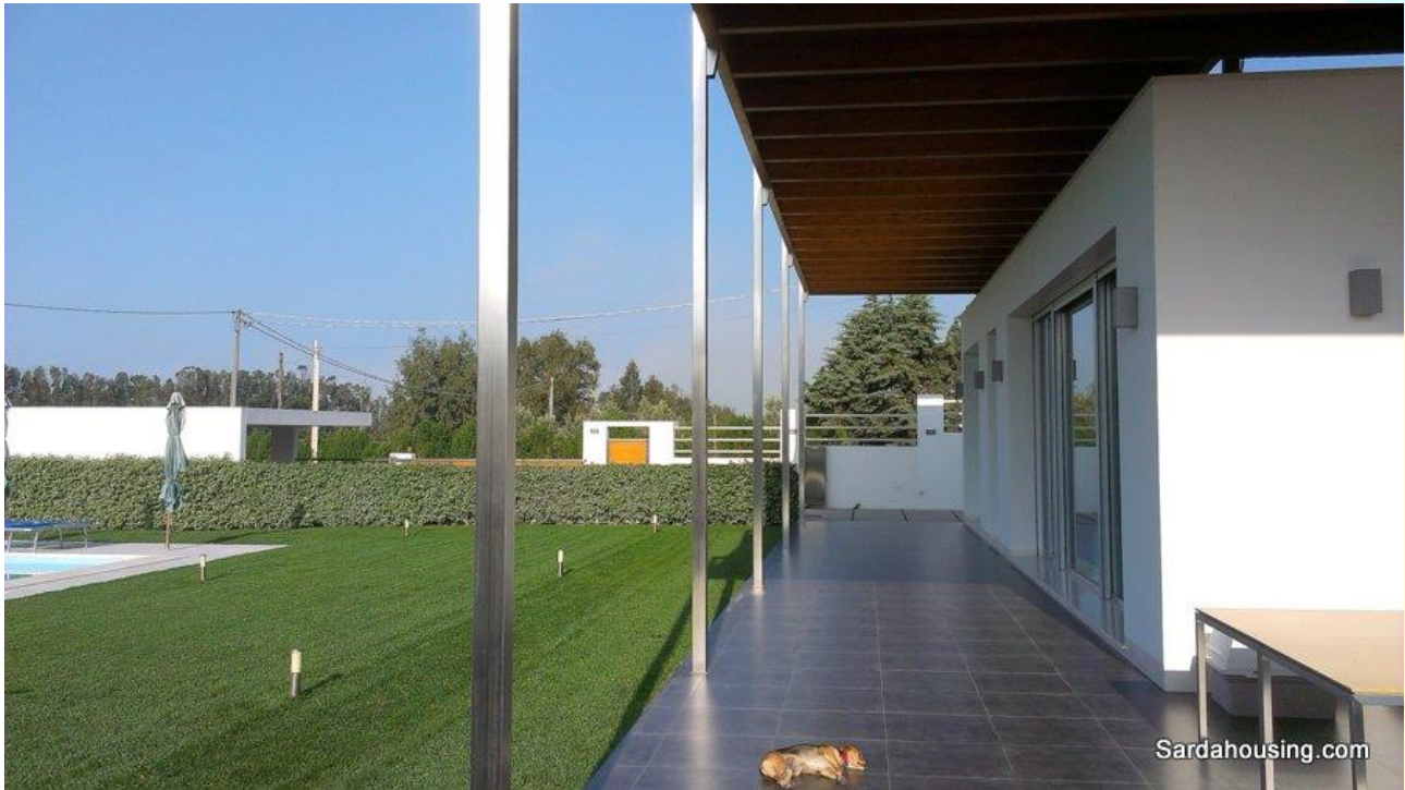
11 - - Tiria, Palmas Arborea, Oristano - Villa with pool