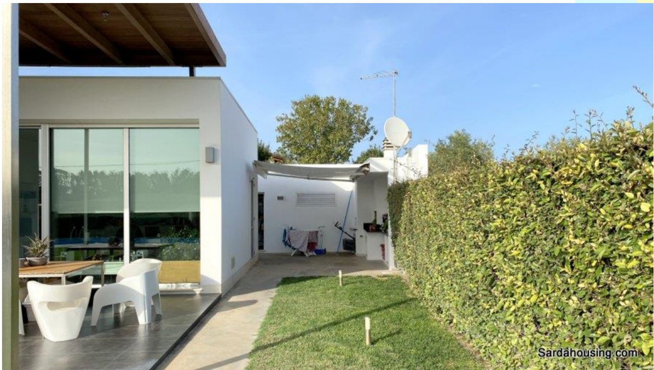
12 - Tiria, Palmas Arborea, Oristano - Villa with pool: laundry room