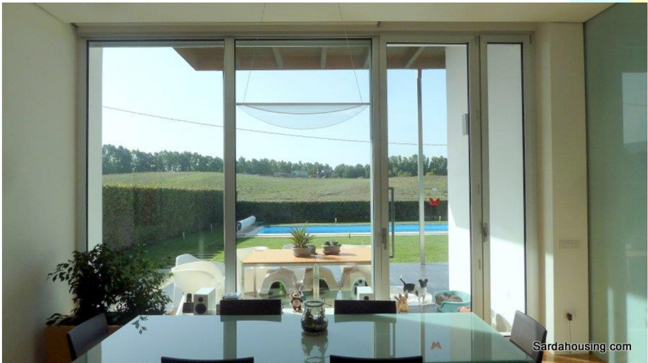
26 - Tiria, Palmas Arborea, Oristano - Villa with pool: dining area