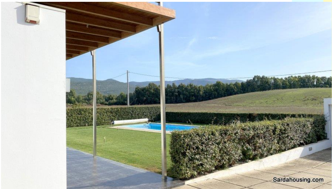
14 - Tiria, Palmas Arborea, Oristano - Villa with pool