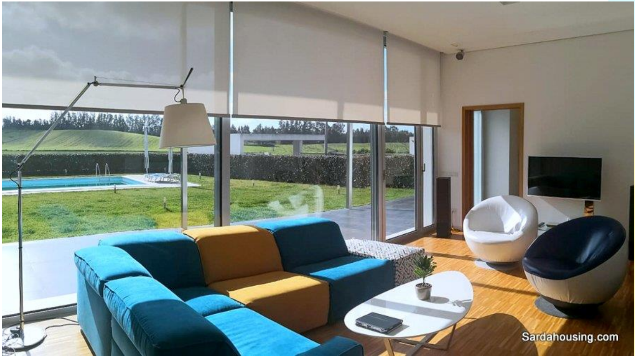
21 - Tiria, Palmas Arborea, Oristano - Villa with pool: living room