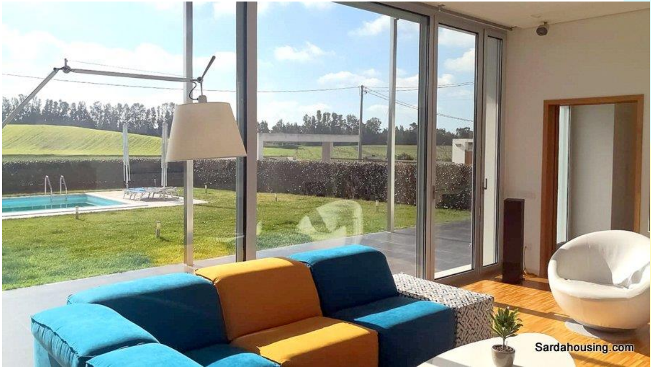
23 - Tiria, Palmas Arborea, Oristano - Villa with pool: living room