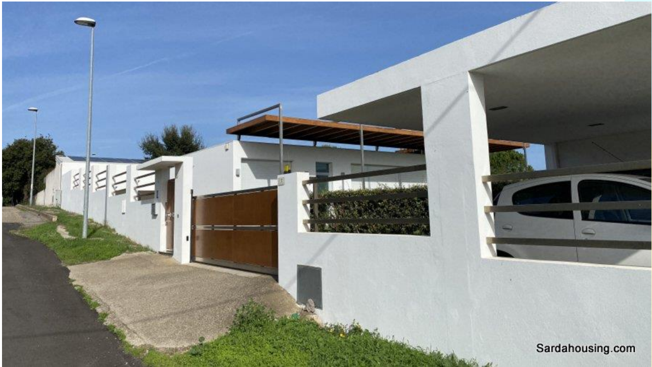
40 - - Tiria, Palmas Arborea, Oristano - Villa with pool: entrance gate and parking shelter