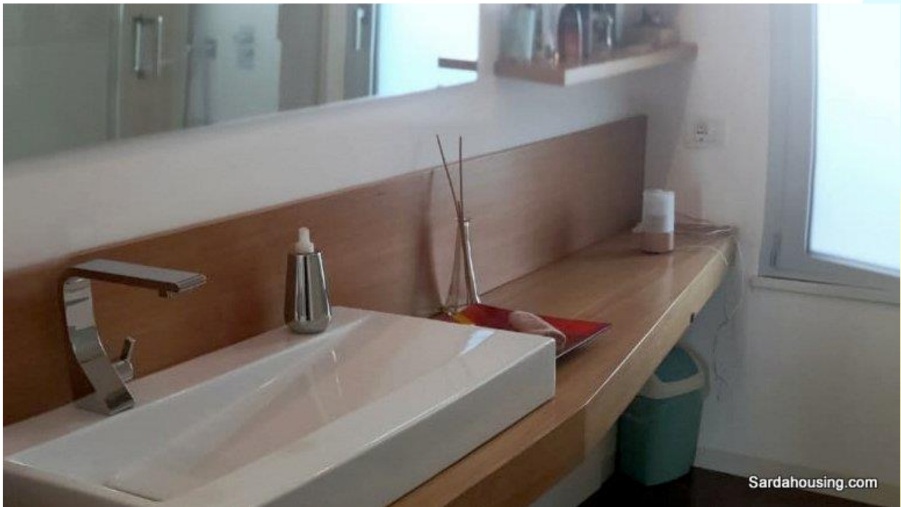
38 - Tiria, Palmas Arborea, Oristano - Villa with pool: bathroom