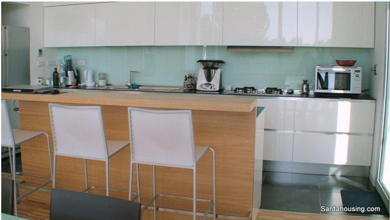
31 - Tiria, Palmas Arborea, Oristano - Villa with pool: kitchen area