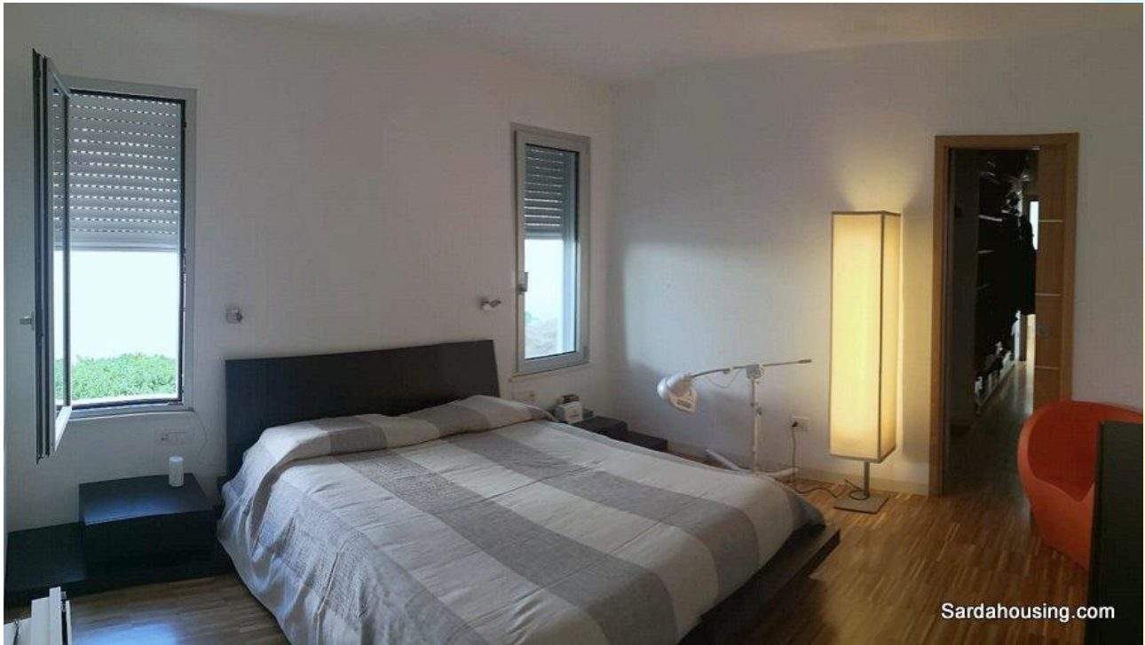
33 - Tiria, Palmas Arborea, Oristano - Villa with pool: bedroom