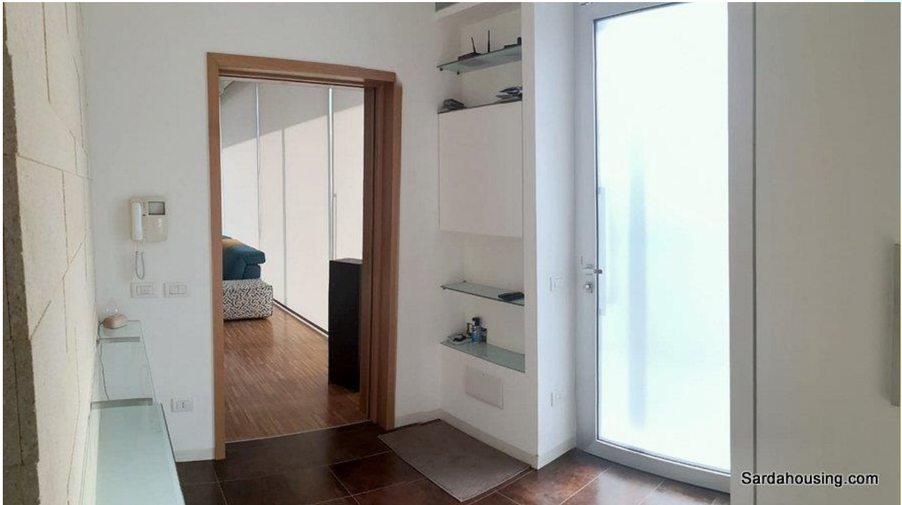
29 - Tiria, Palmas Arborea, Oristano - Villa with pool: entrance