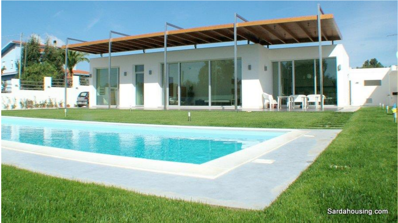
1 - Tiria, Palmas Arborea, Oristano - Villa with pool

In Borgata Tiria , a few kilometres from Oristano , we offer a beautiful villa with garden and swimming pool that combines modernity and environmental sustainability in perfect synergy .