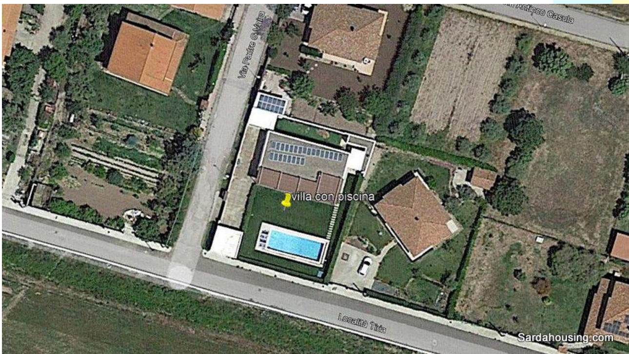
41 - - Tiria, Palmas Arborea, Oristano - Villa with pool on googlemap