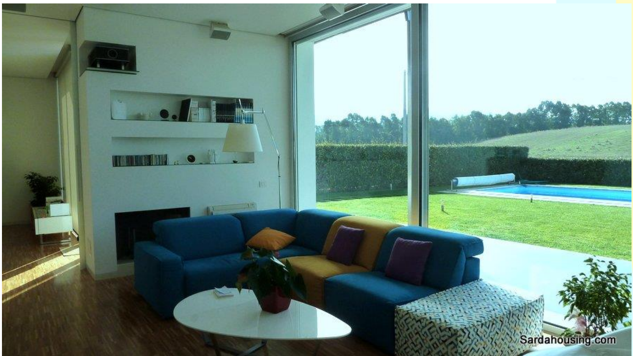
18 - Tiria, Palmas Arborea, Oristano - Villa with pool: living room