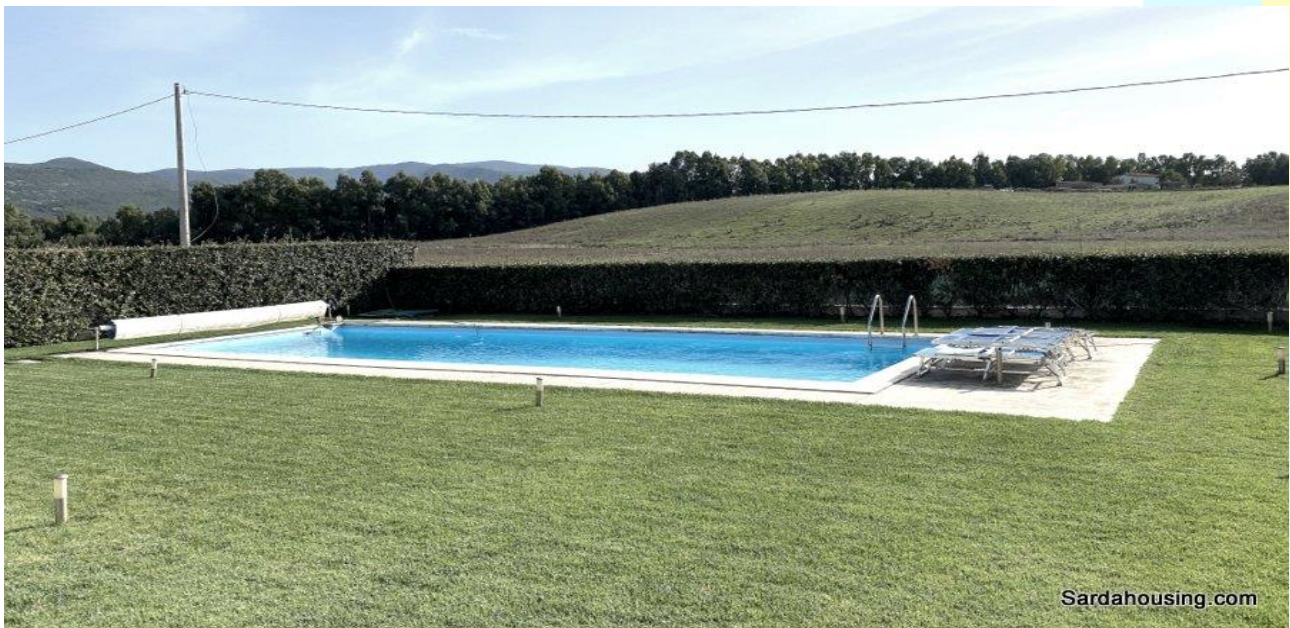
6 - Tiria, Palmas Arborea, Oristano - Villa with pool

info@sardahousing.com - www.sardahousing.com