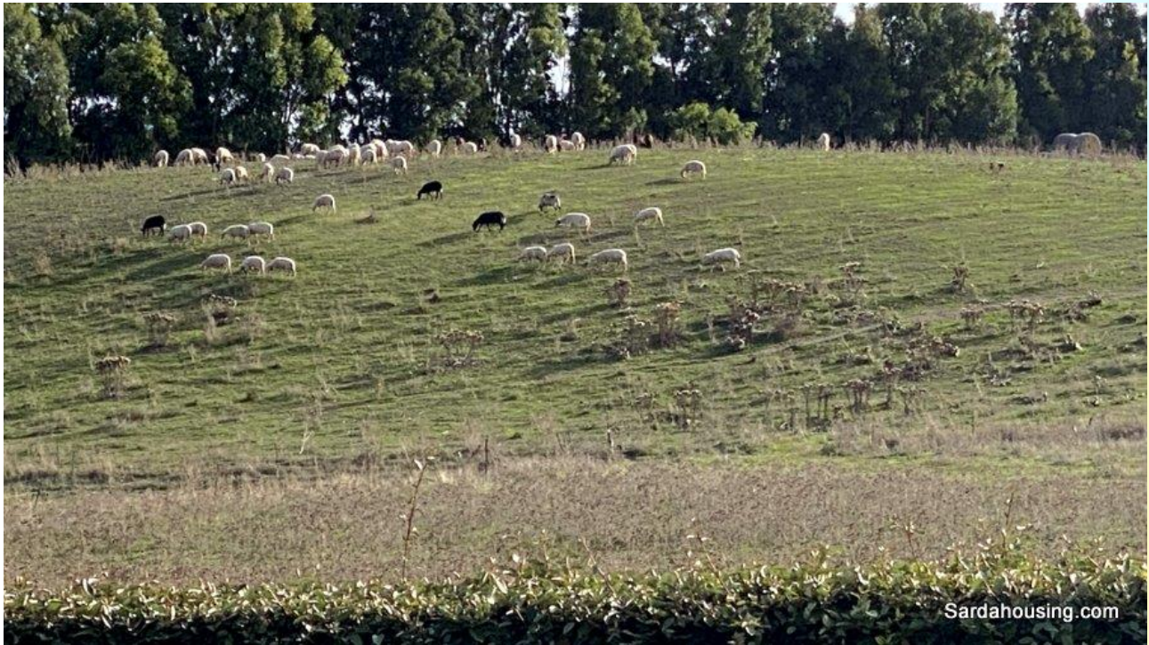
17 - Tiria, Palmas Arborea, Oristano - Villa with pool: grazings around