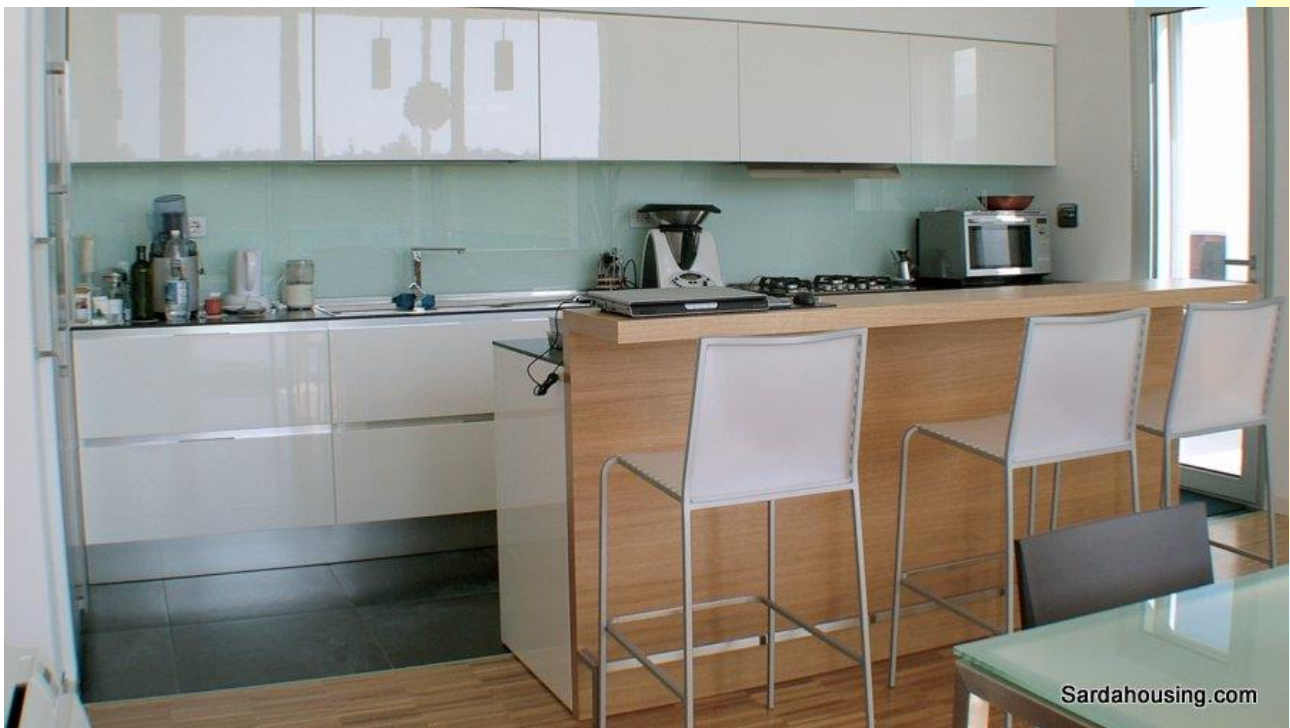
32 - Tiria, Palmas Arborea, Oristano - Villa with pool: kitchen area