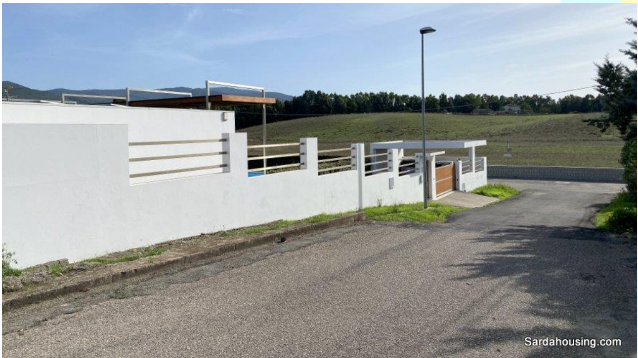
39 - Tiria, Palmas Arborea, Oristano - Villa with pool: external view