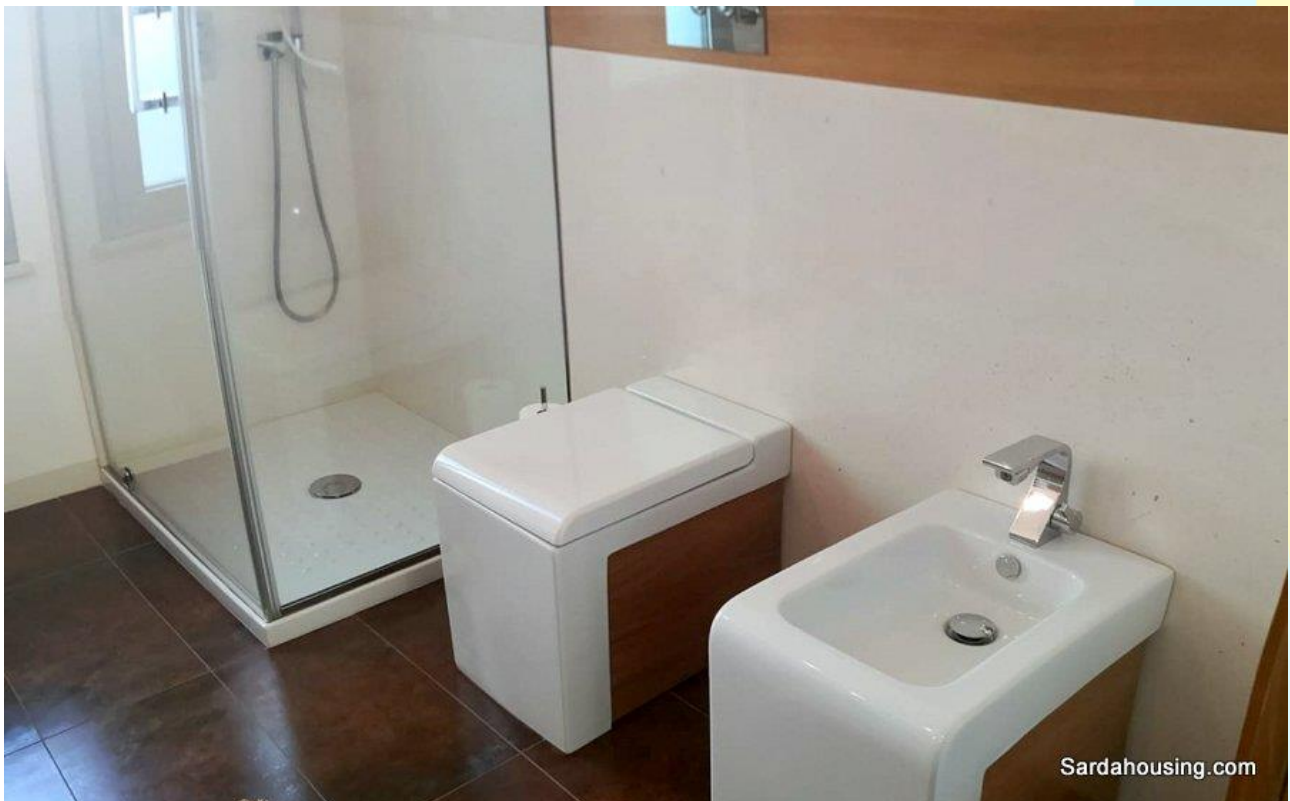
36 - Tiria, Palmas Arborea, Oristano - Villa with pool: bathroom