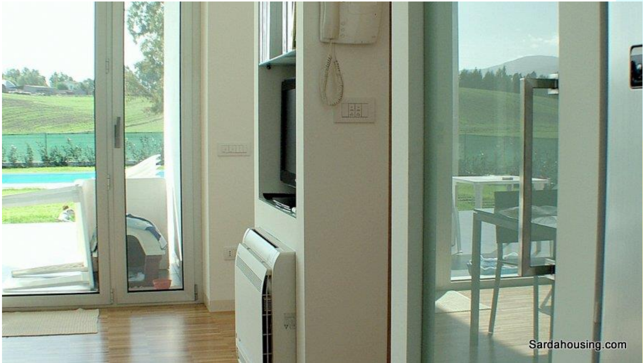
25 - Tiria, Palmas Arborea, Oristano - Villa with pool: living room, air co