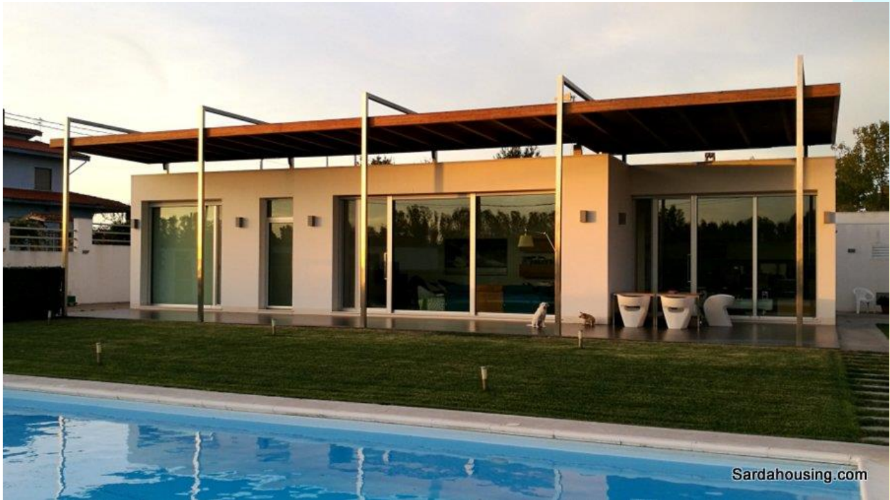
7 - Tiria, Palmas Arborea, Oristano - Villa with pool