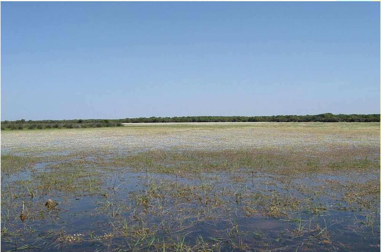
Pond of Pauli Majori

The territory of Tiria is flat and is mainly used for agriculture and grazing. The village of Tiria is a quiet residential district where you can enjoy nature, peacefulness and the food and wine specialties of the Campidano of Oristano.