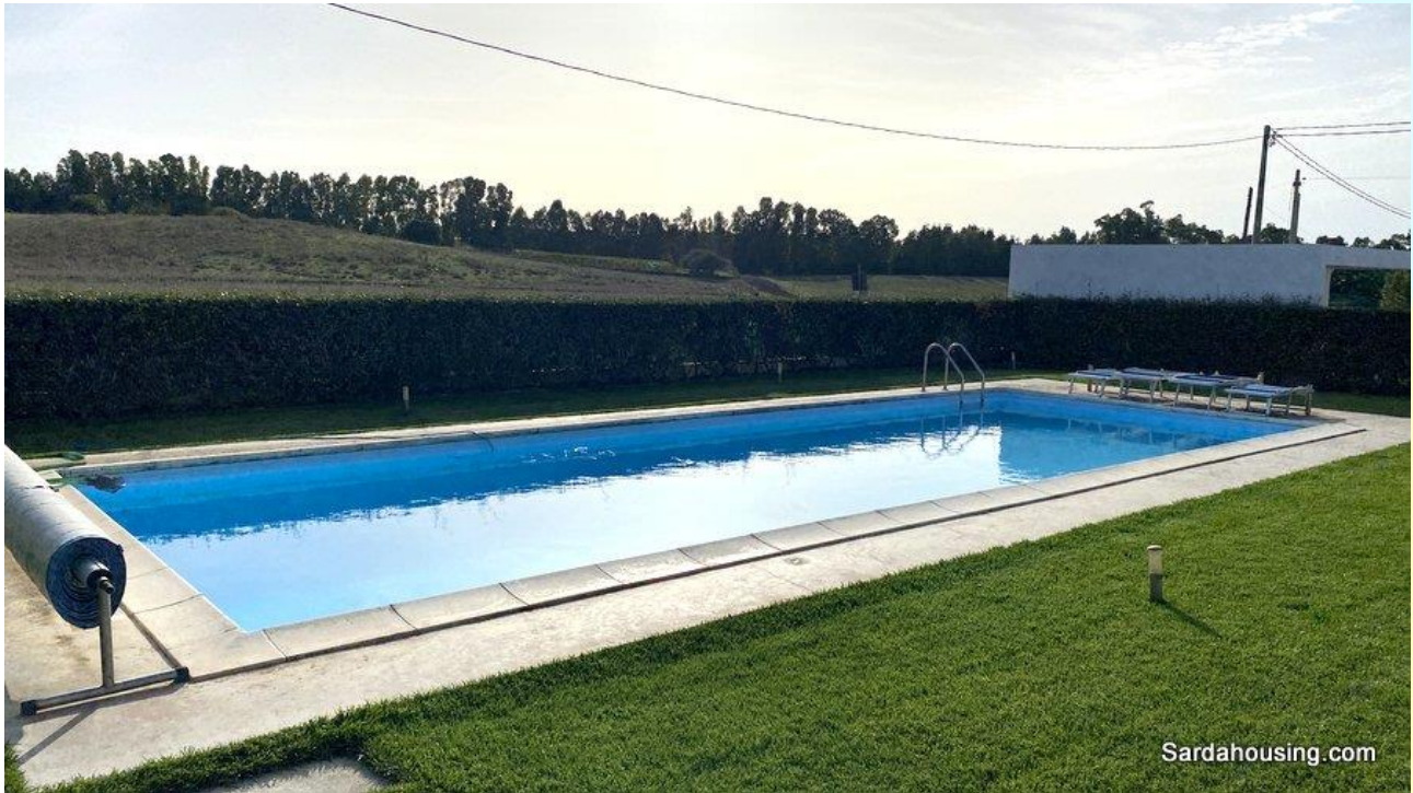
15 - Tiria, Palmas Arborea, Oristano - Villa with pool