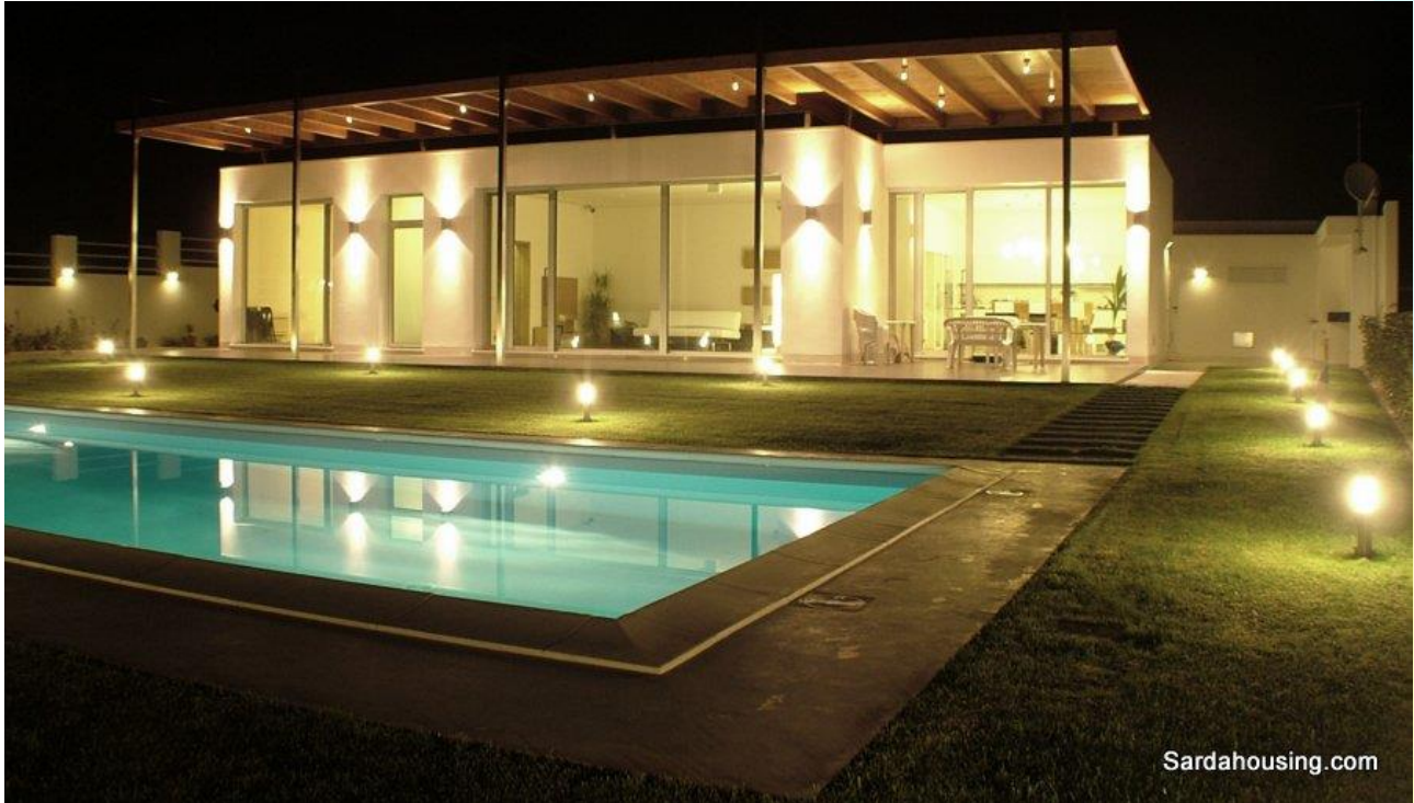
3 - Tiria, Palmas Arborea, Oristano - Villa with pool