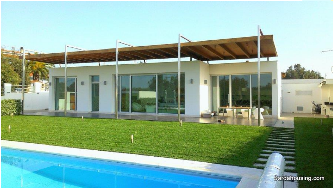
2 - Tiria, Palmas Arborea, Oristano - Villa with pool