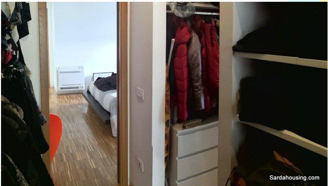
34 - Tiria, Palmas Arborea, Oristano - Villa with pool: walk-in closet