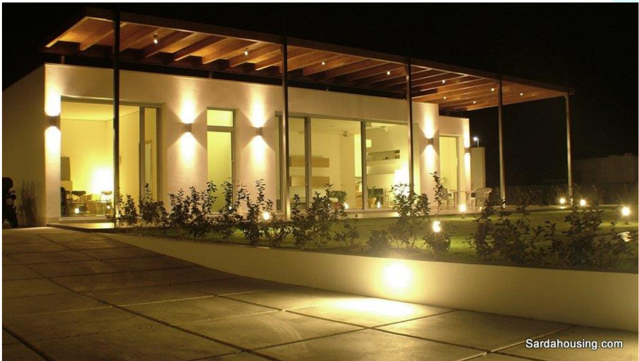
9 - Tiria, Palmas Arborea, Oristano - Villa with pool