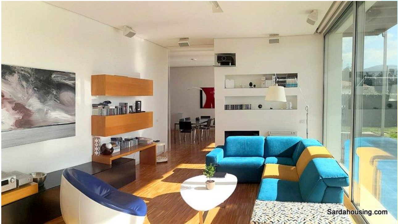
19 - Tiria, Palmas Arborea, Oristano - Villa with pool: living room