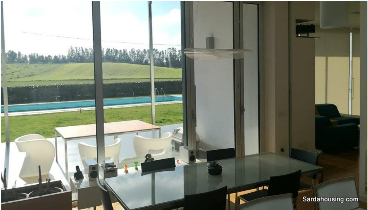
27 - Tiria, Palmas Arborea, Oristano - Villa with pool: dining area