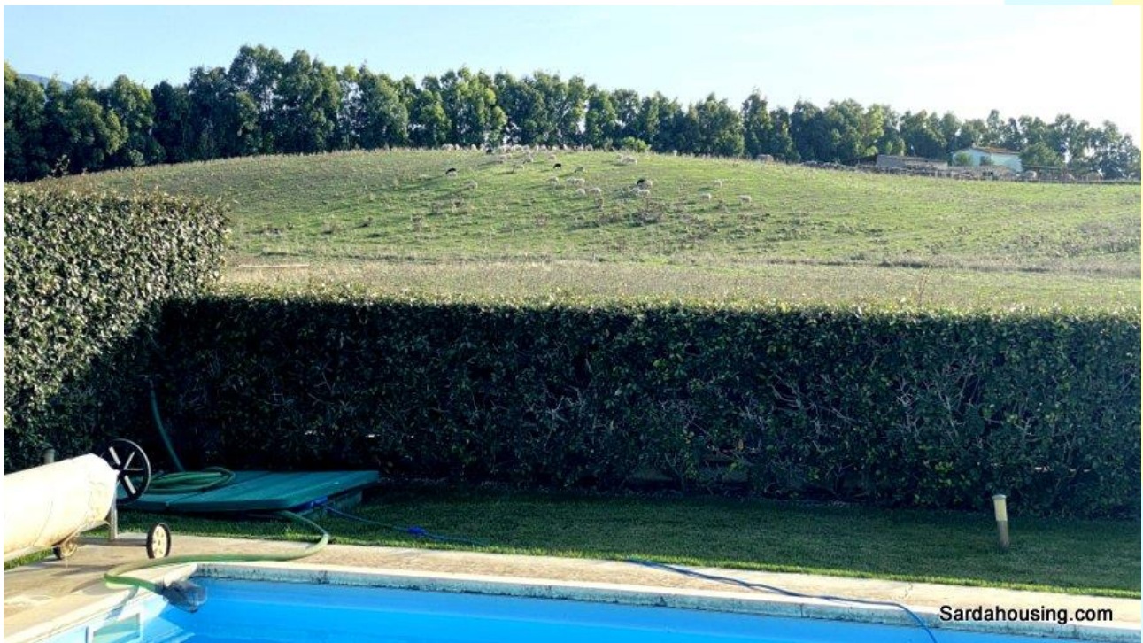
16 - Tiria, Palmas Arborea, Oristano - Villa with pool