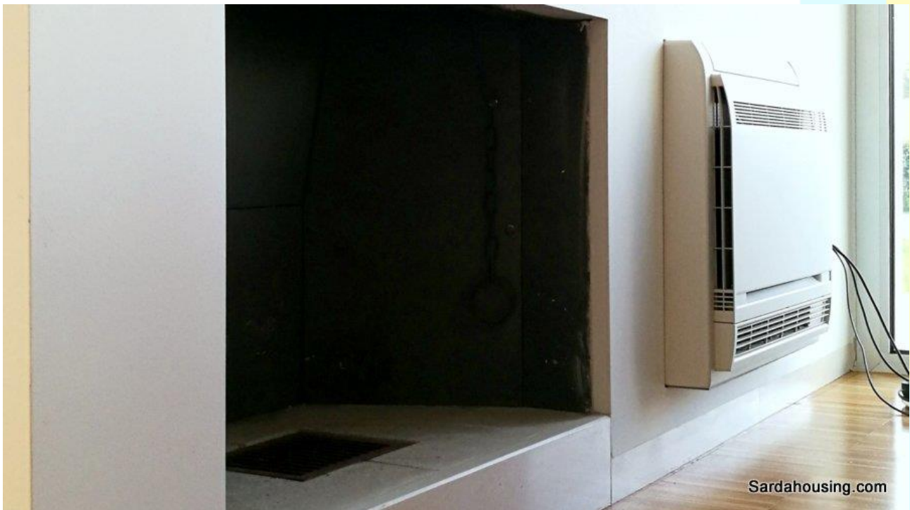
24 - Tiria, Palmas Arborea, Oristano - Villa with pool: living room, the fireplace