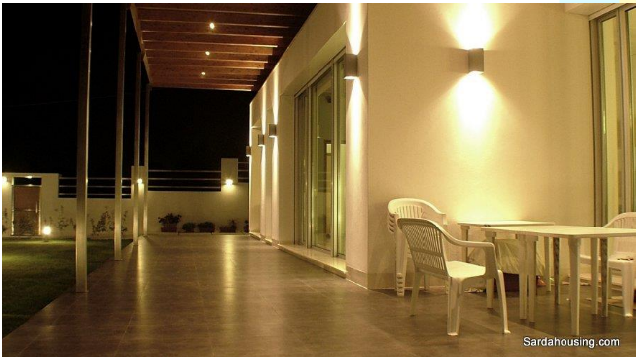
10 - Tiria, Palmas Arborea, Oristano - Villa with pool