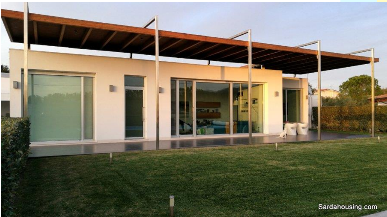
8 - - Tiria, Palmas Arborea, Oristano - Villa with pool