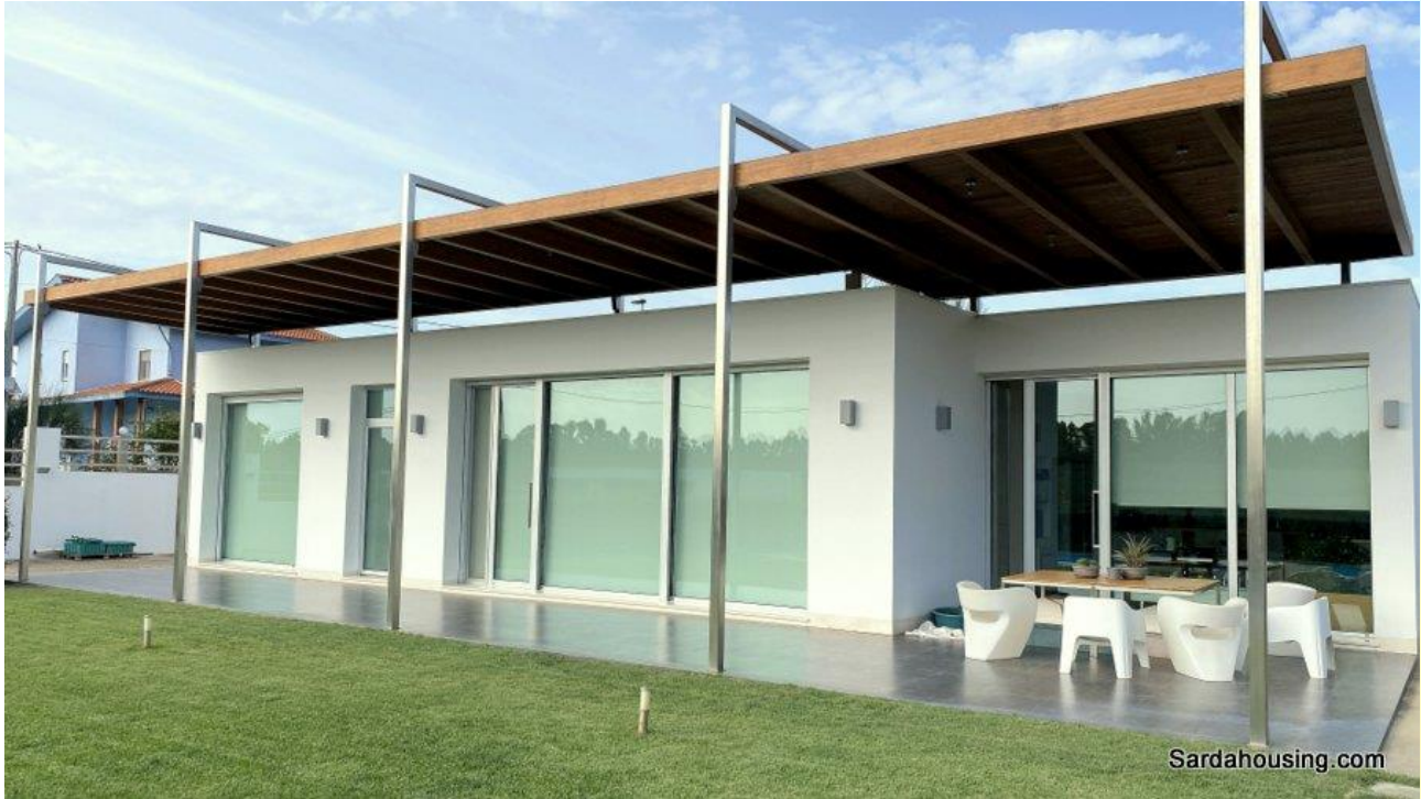
5 - Tiria, Palmas Arborea, Oristano - Villa with pool