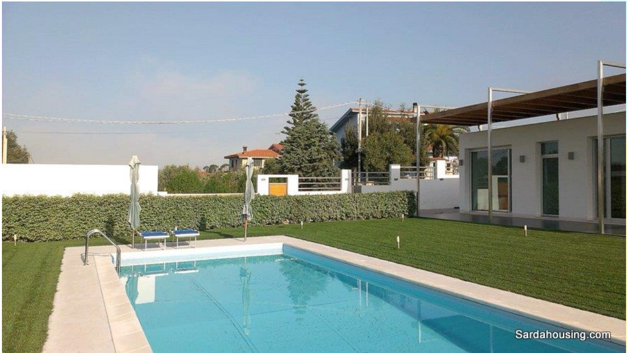
13 - Tiria, Palmas Arborea, Oristano - Villa with pool