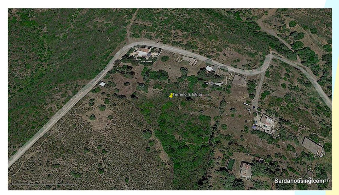
14 - Dolianova countryside - Land Is Istrias: on Googlemap