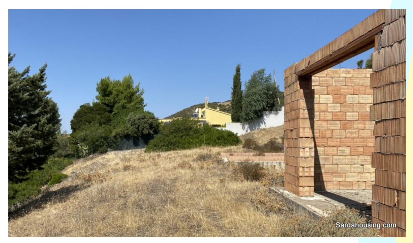
4 - Dolianova countryside - Land Is Istrias: building to be demolished