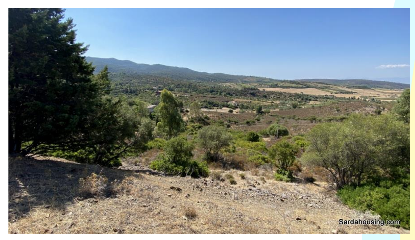
12 - Dolianova countryside – Land Is Istrias: a view