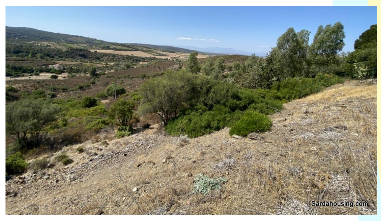
13- Dolianova countryside – Land Is Istrias: a view