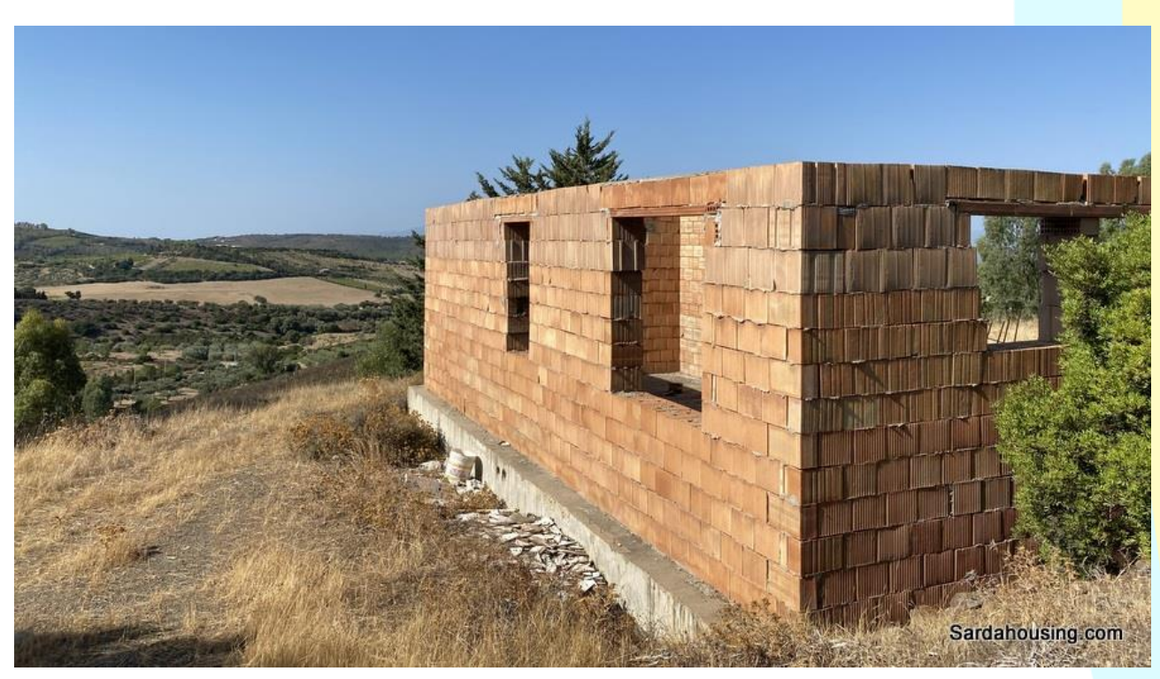
3- Dolianova countryside – Land Is Istrias: building to be demolished