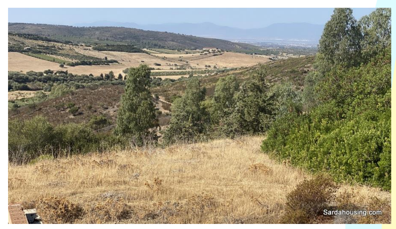
8 - Dolianova countryside – Land Is Istrias: a view