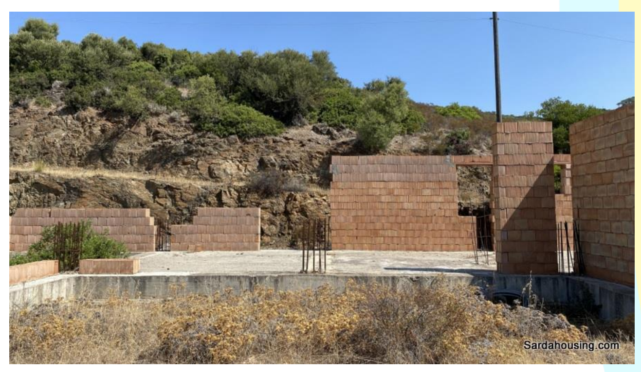
{\bf 5} - Dolianova countryside – Land Is Istrias: building to be demolished