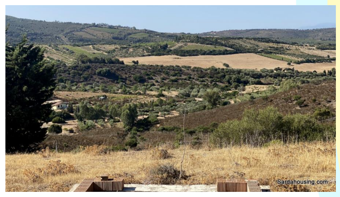
7 - Dolianova countryside – Land Is Istrias: a view