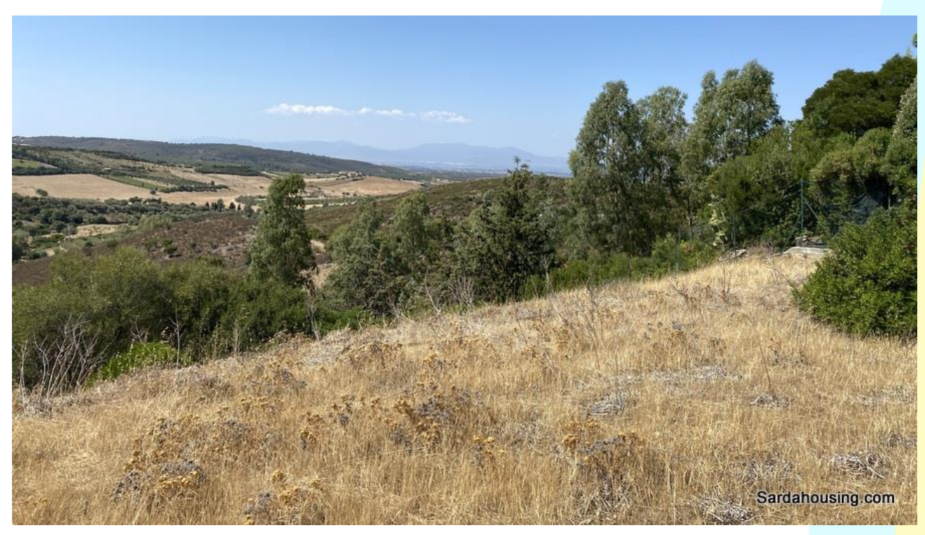
10 - Dolianova countryside – Land Is Istrias: a view