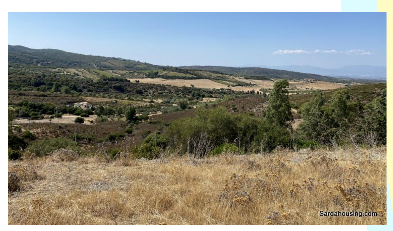
9 - Dolianova countryside – Land Is Istrias: a view