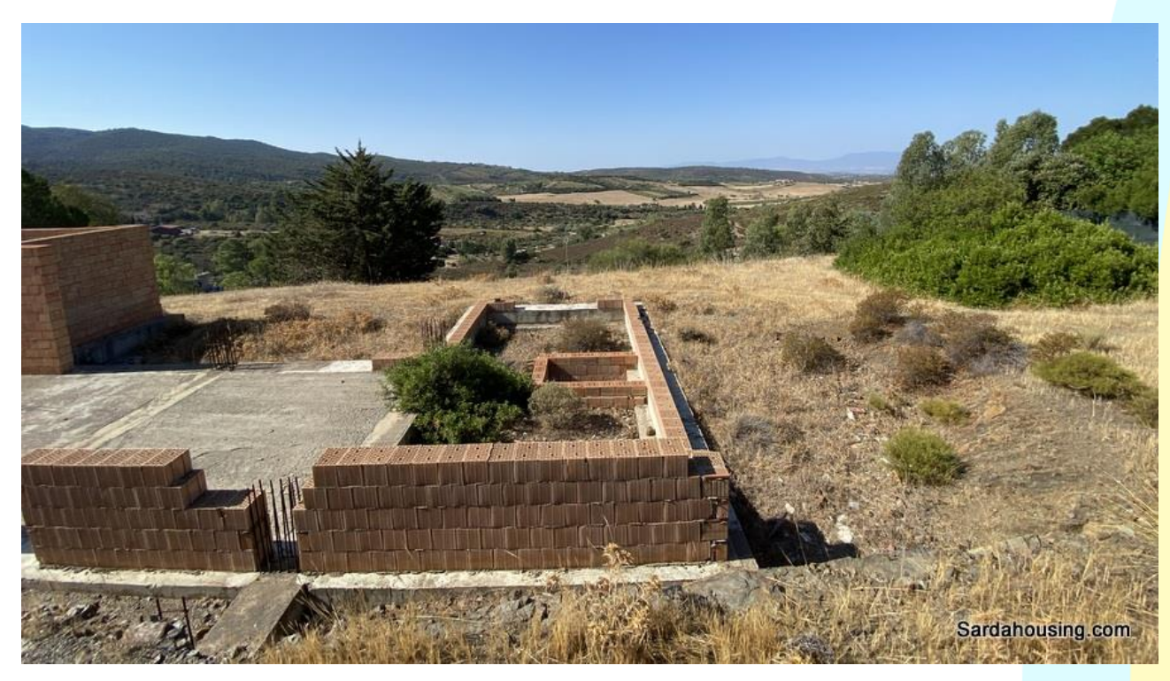
2 – Dolianova countryside – Land Is Istrias: building to be demolished