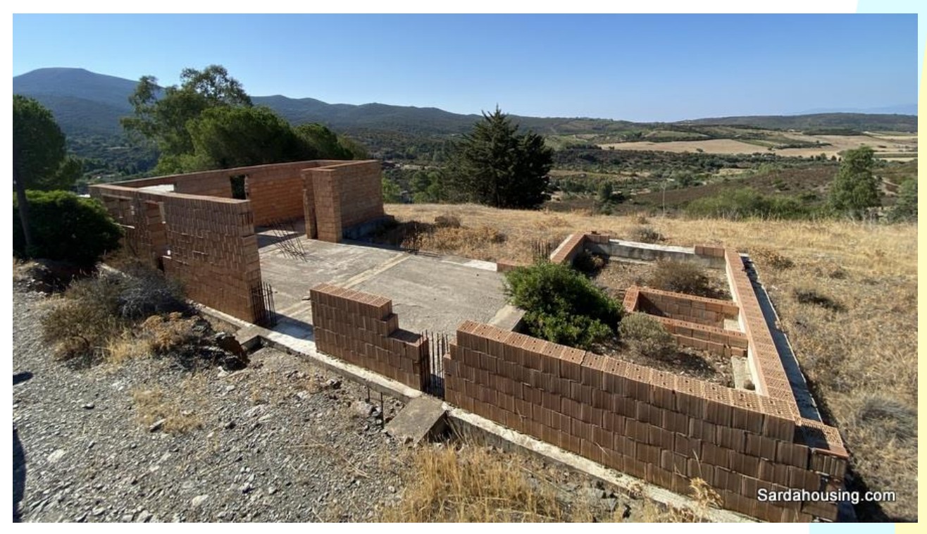
1 - Dolianova countryside - Land Is Istrias

In the countryside of Dolianova, in Località Is Istrias, we offer a panoramic hilly land with a building to be demolished.