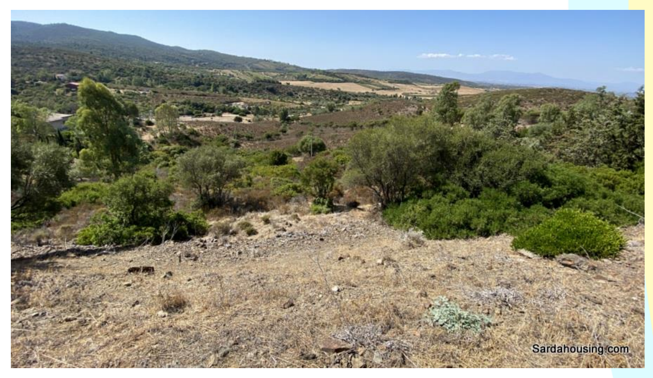
11 - Dolianova countryside – Land Is Istrias: a view