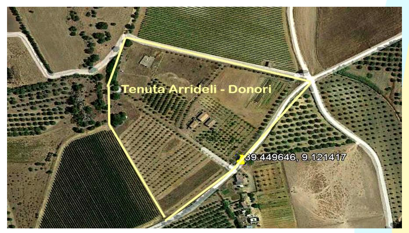
38 - Donori – Estate Arrideli: the property on googlemap