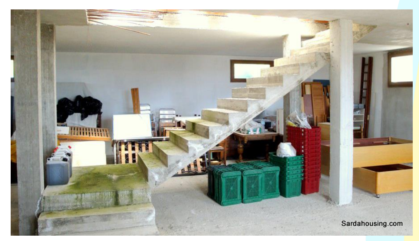
24 - Donori – Tenuta Arrideli: Estate Arrideli: main house basement