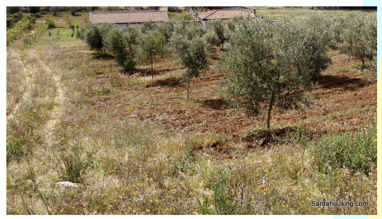
4 - Donori – Estate Arrideli: a view of buildings