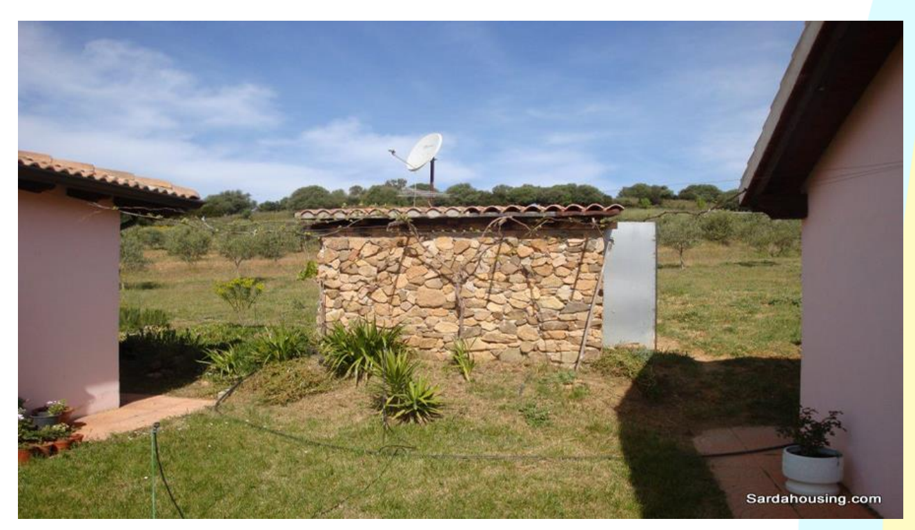
10 - Donori – Estate Arrideli: one of guest housing