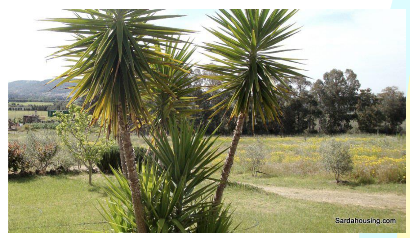
20 - Donori – Estate Arrideli: a view of property