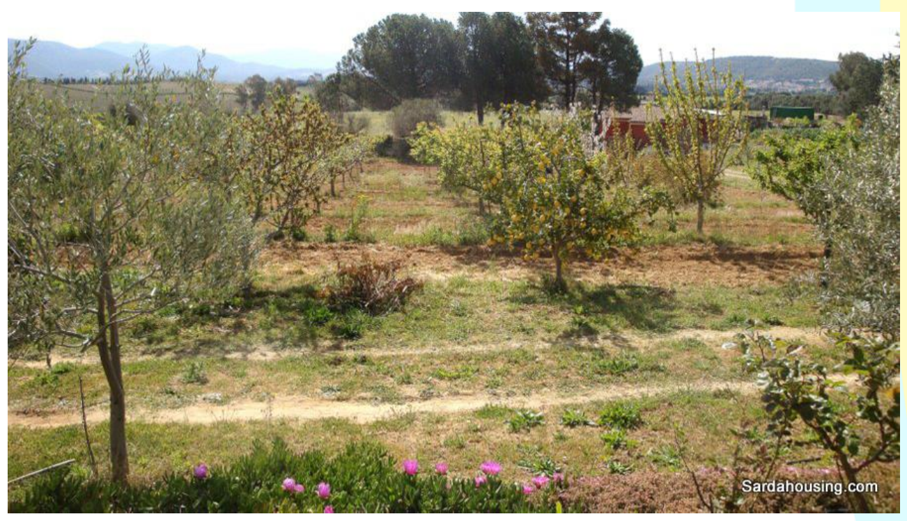
25 - Donori – Estate Arrideli: fruit tress