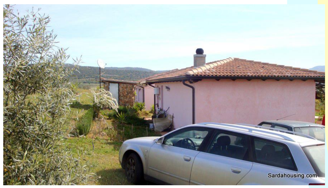
9 - Donori – Estate Arrideli: one of guest housing