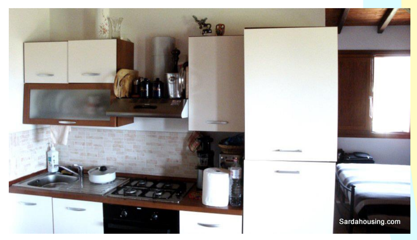
15 - Donori – Estate Arrideli: inside one of guest housing