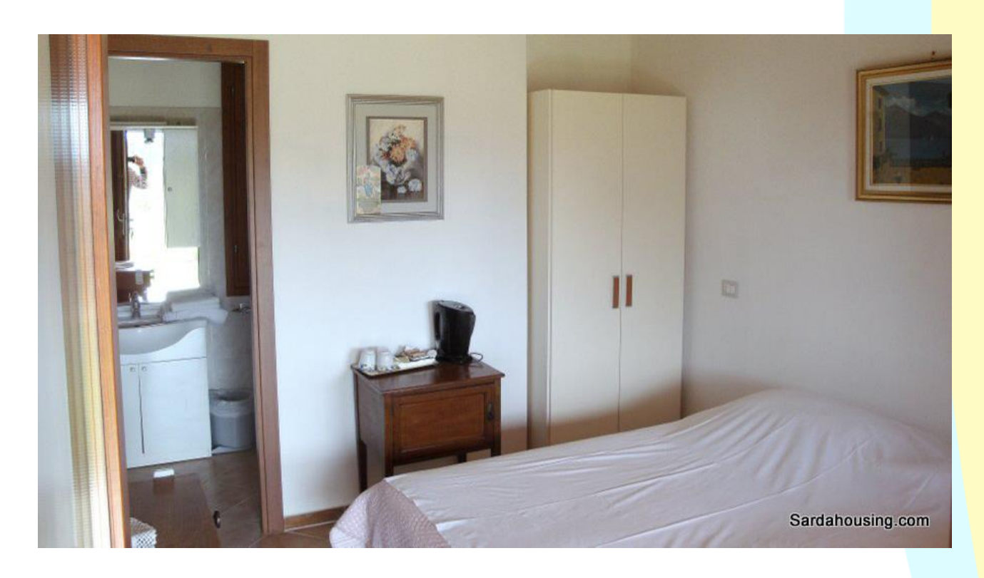
13 - Donori – Estate Arrideli: inside one of guest housing