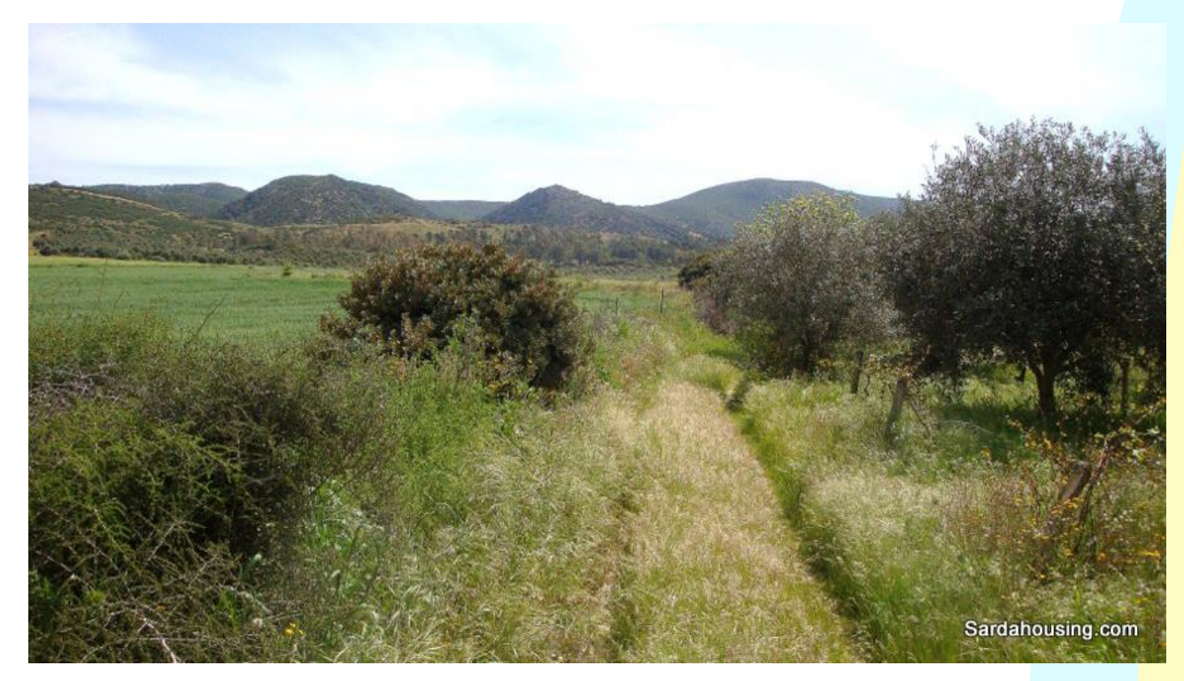
28 - Donori – Estate Arrideli: olive grove