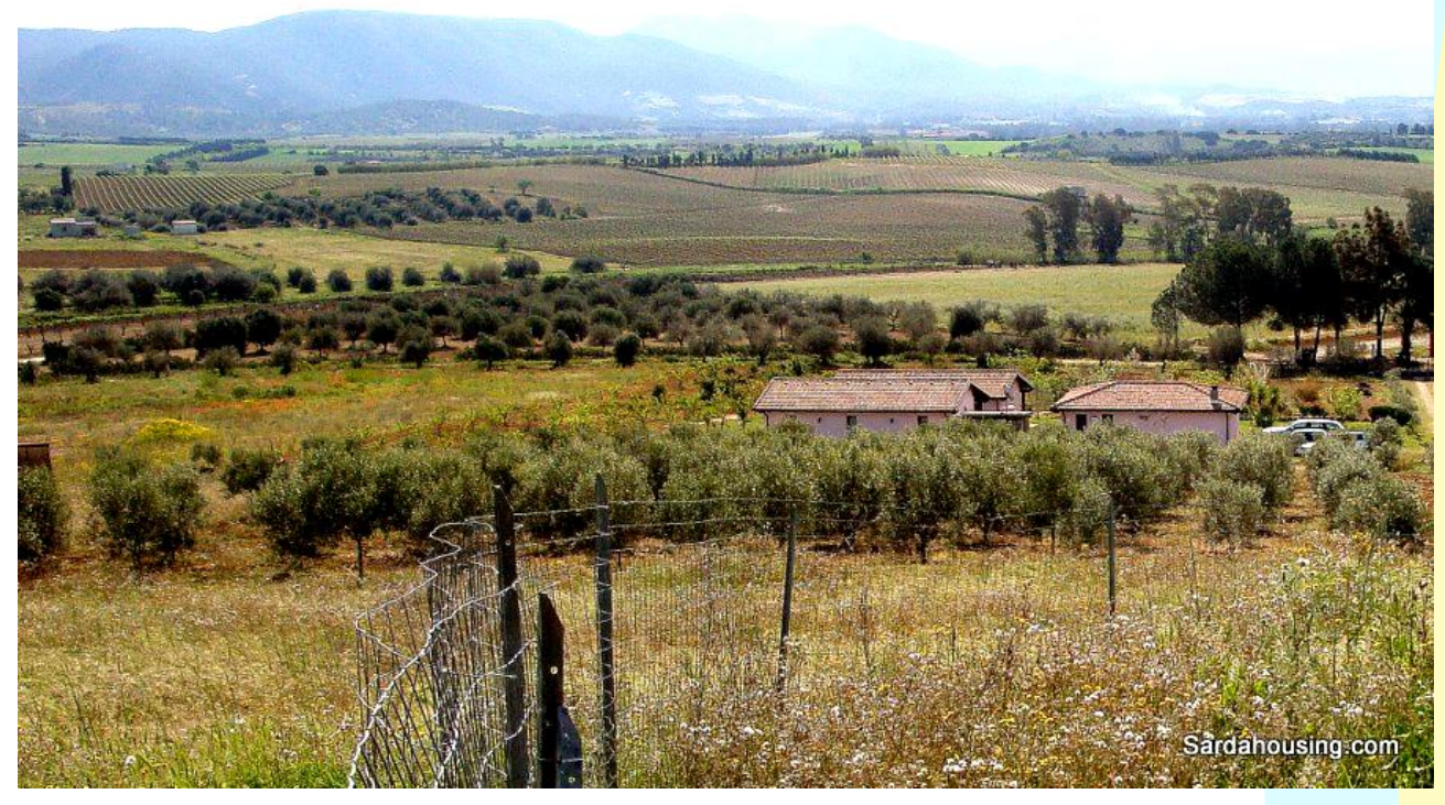
1 – Donori – Estate Arrideli: a view of buildings

In Donori countryside , 2 km from the village, we offer a beautiful recently built agricultural-tourist complex , suitable for cohousing , or an eco-village .