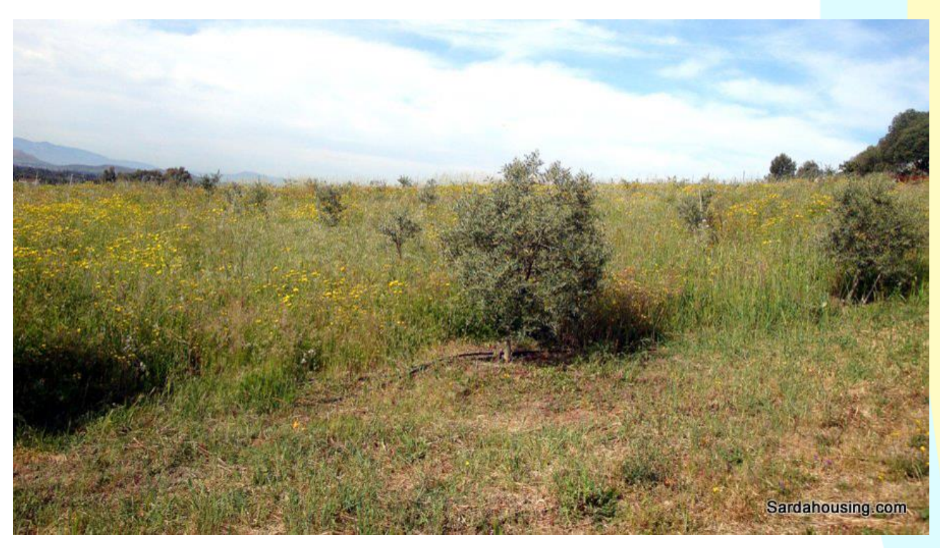
33 - Donori – Estate Arrideli: a view of the property