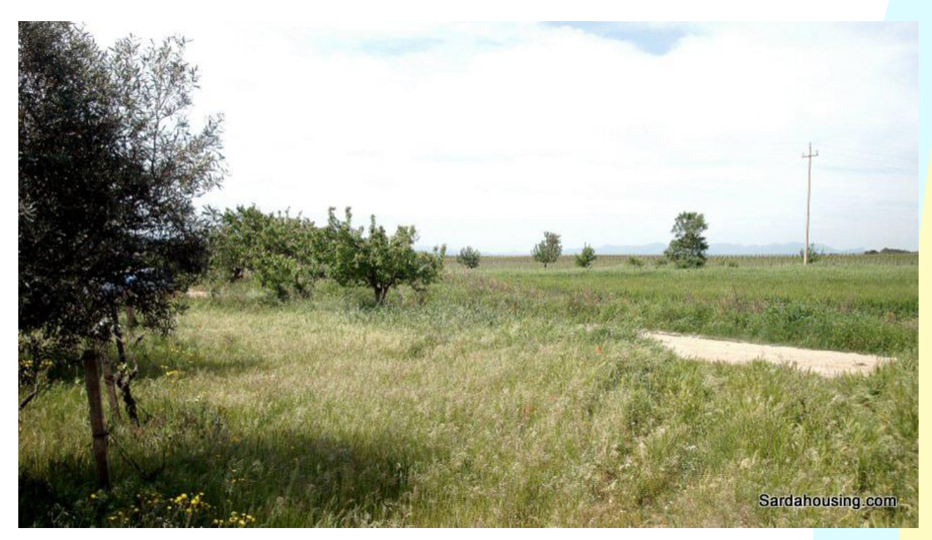
26 - Donori – Estate Arrideli: a view of the property