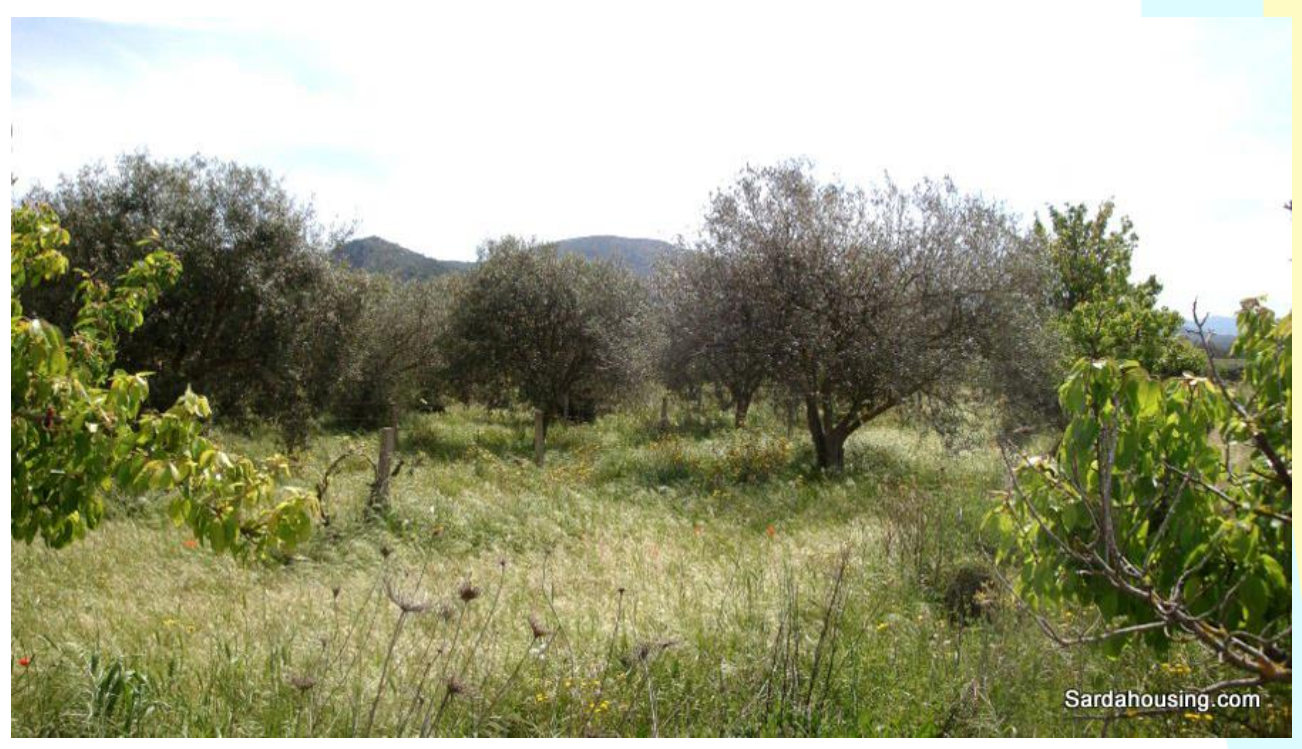
27 - Donori – Estate Arrideli: olive grove