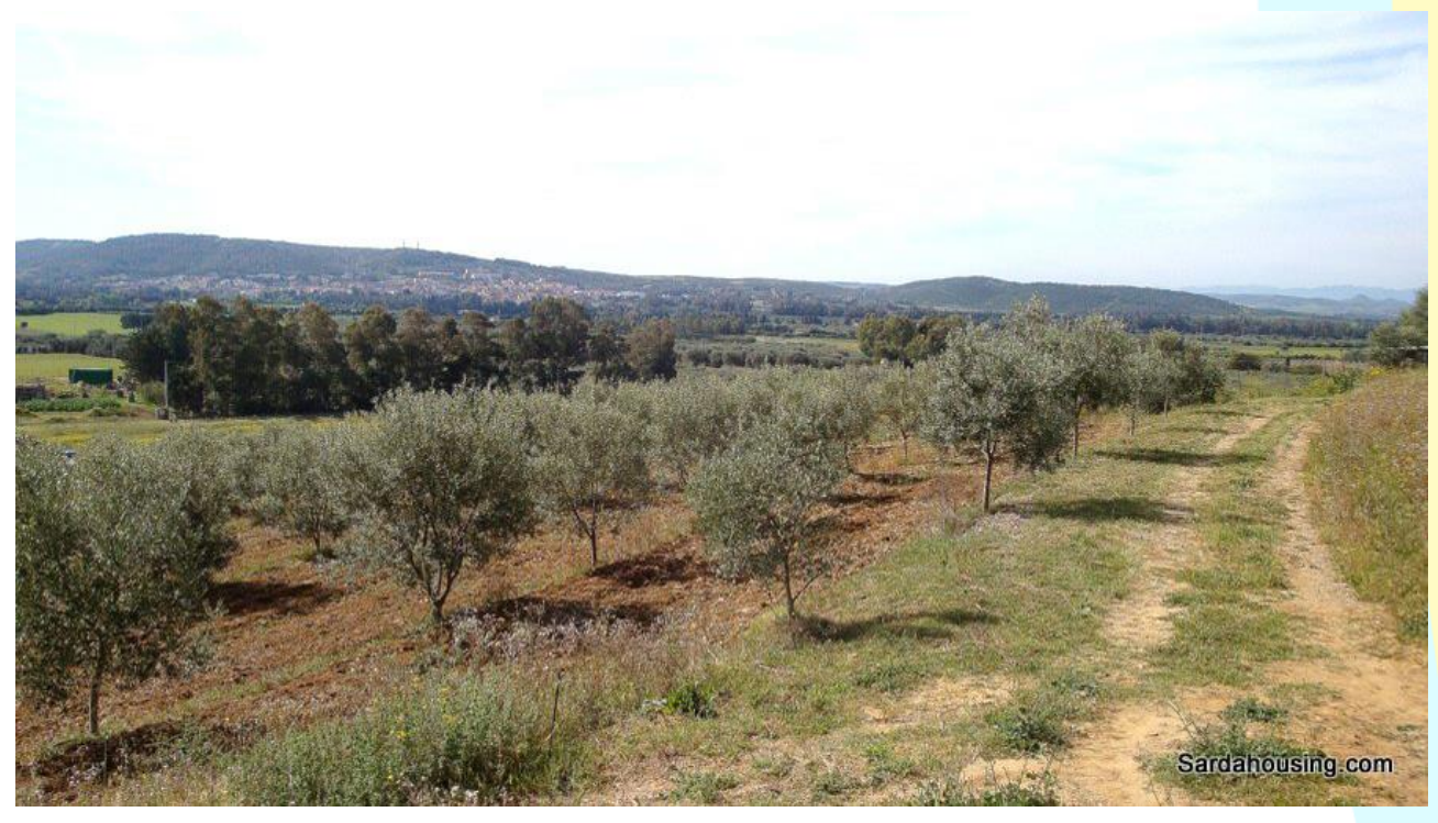
19 - Donori – Estate Arrideli: a view of property