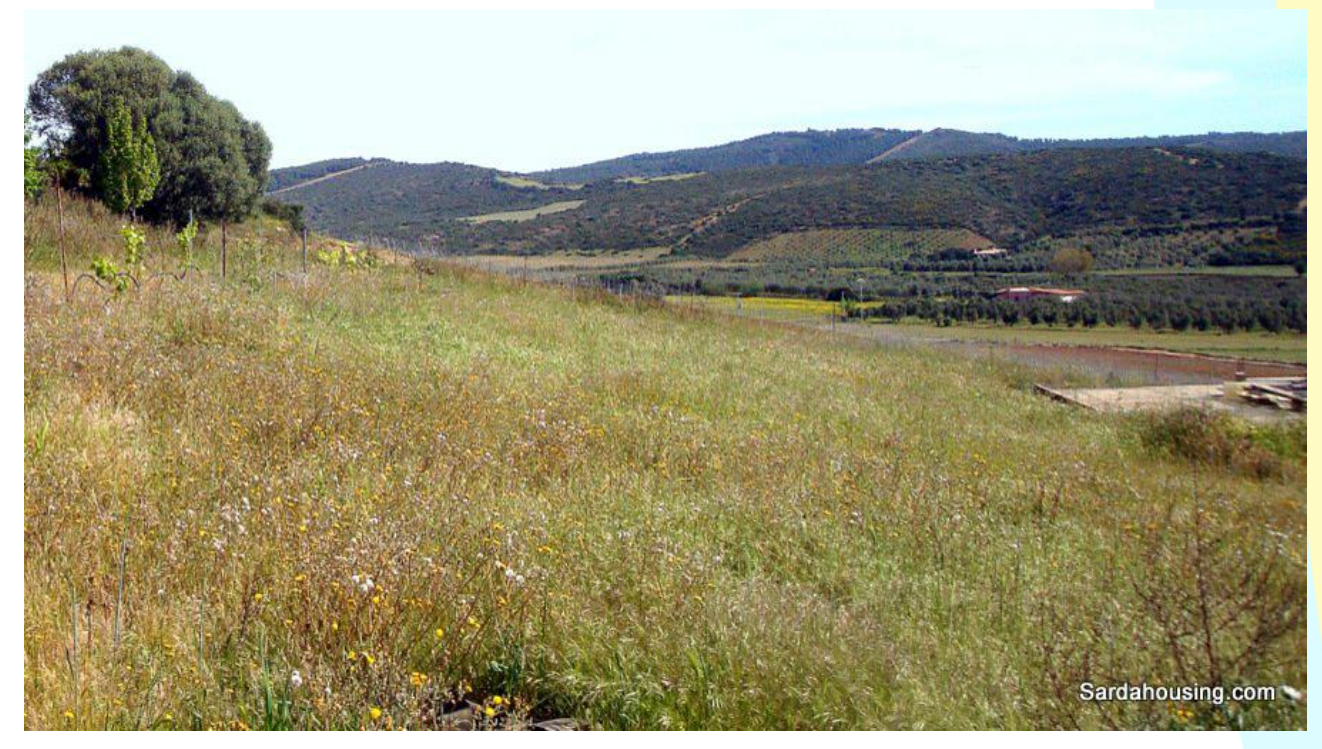
23 - Donori – Estate Arrideli: main house basement