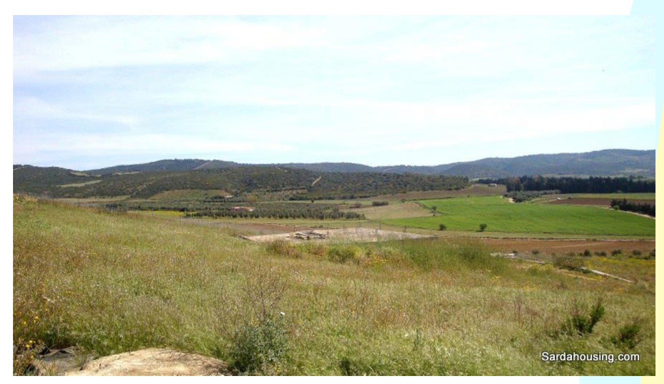
22 - Donori – Estate Arrideli: main house basement