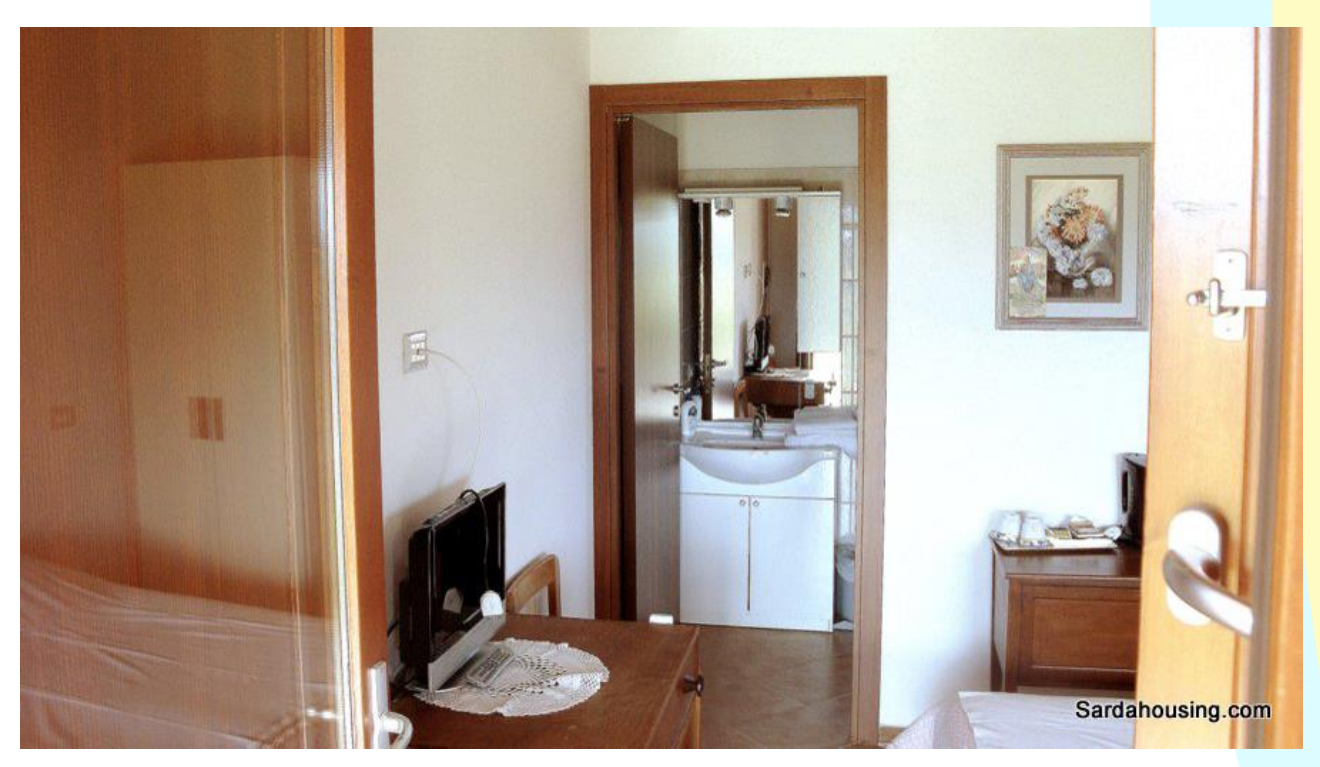
11- Donori – Estate Arrideli: inside one of guest housing