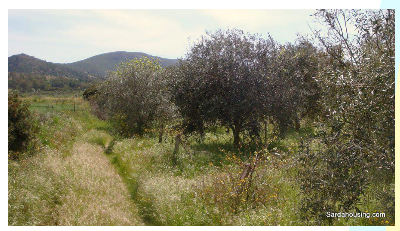
36 - Donori – Estate Arrideli: a view of the property