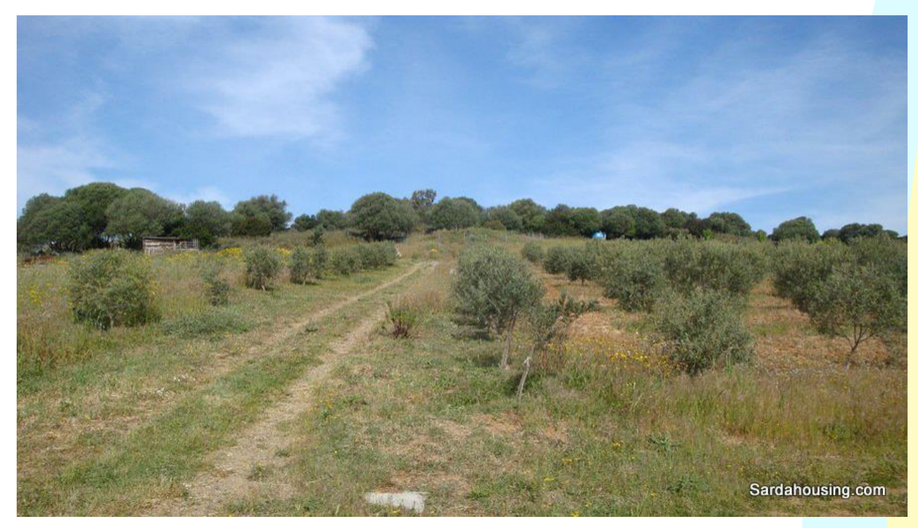
30 - Donori – Estate Arrideli: olive grove