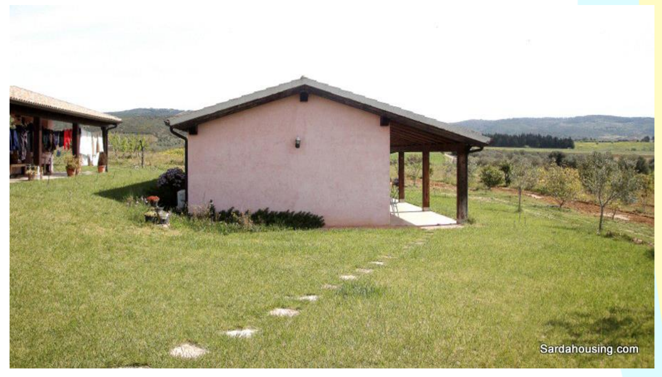
7 - Donori – Estate Arrideli: one of guest housing