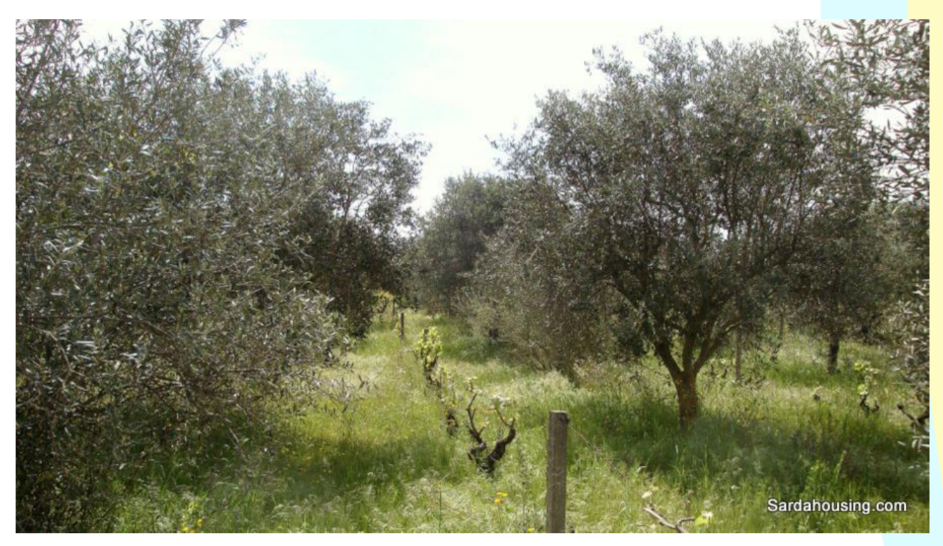
37 - Donori – Estate Arrideli: olive grove and vineyard