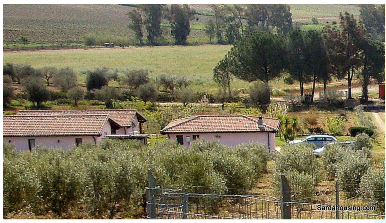
3 – Donori – Estate Arrideli: a view of buildings

info@sardahousing.com - www.sardahousing.com