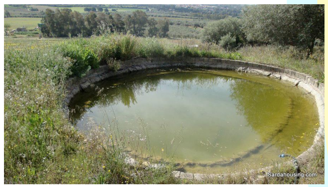
21 - Donori – Estate Arrideli: irrigation small lake