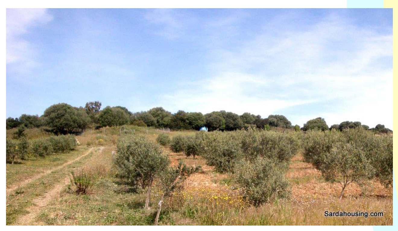
31 - Donori – Estate Arrideli: olive grove