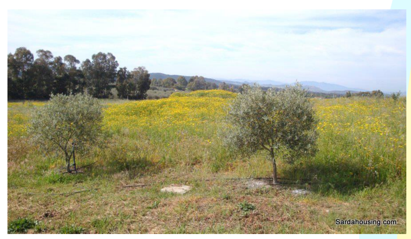
32 - Donori – Estate Arrideli: a view of the property