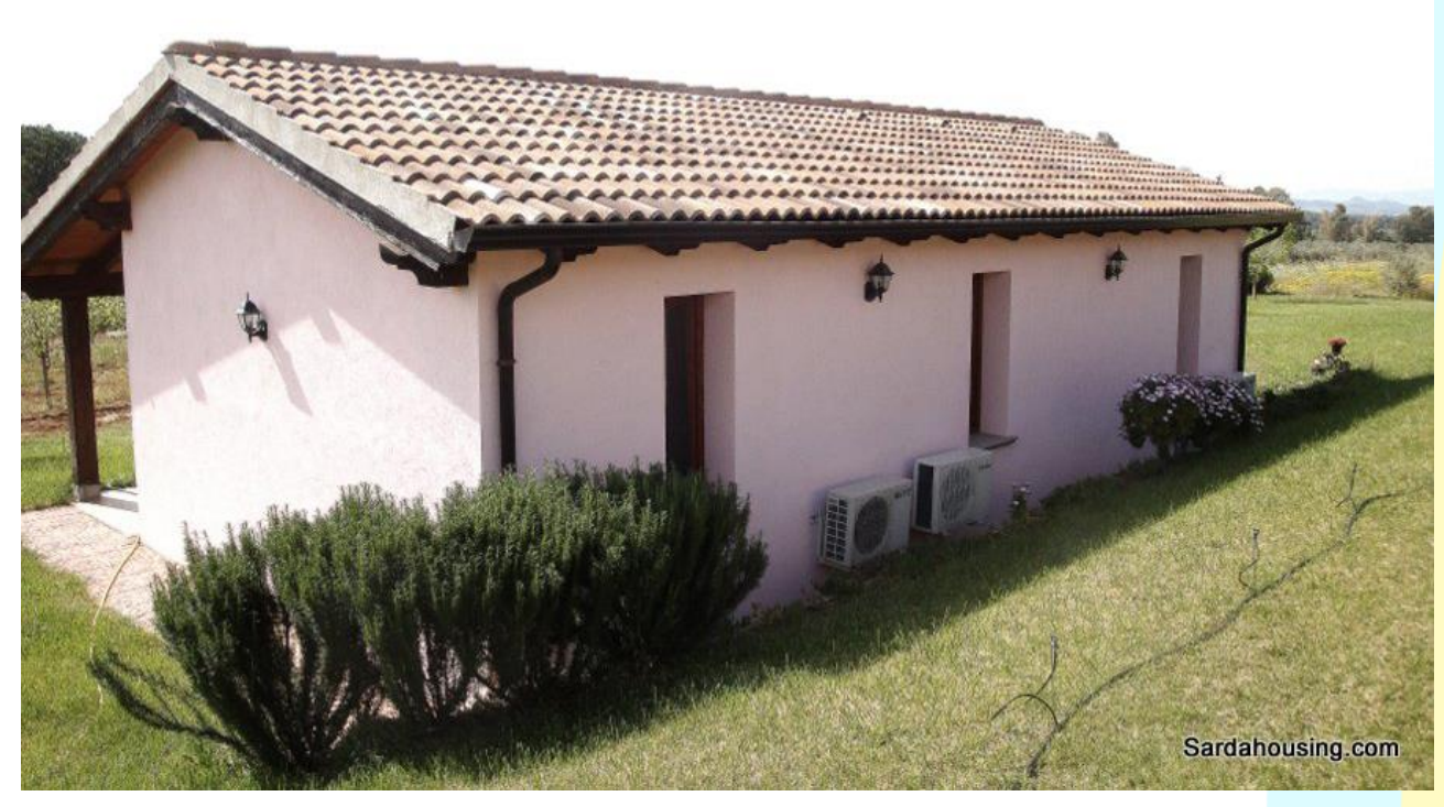
6 - Donori – Estate Arrideli: one of guest housing