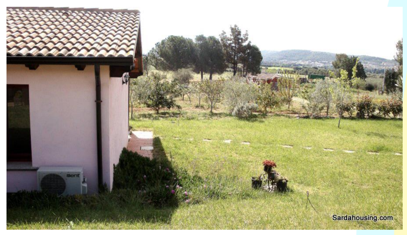
8 - Donori – Estate Arrideli: one of guest housing