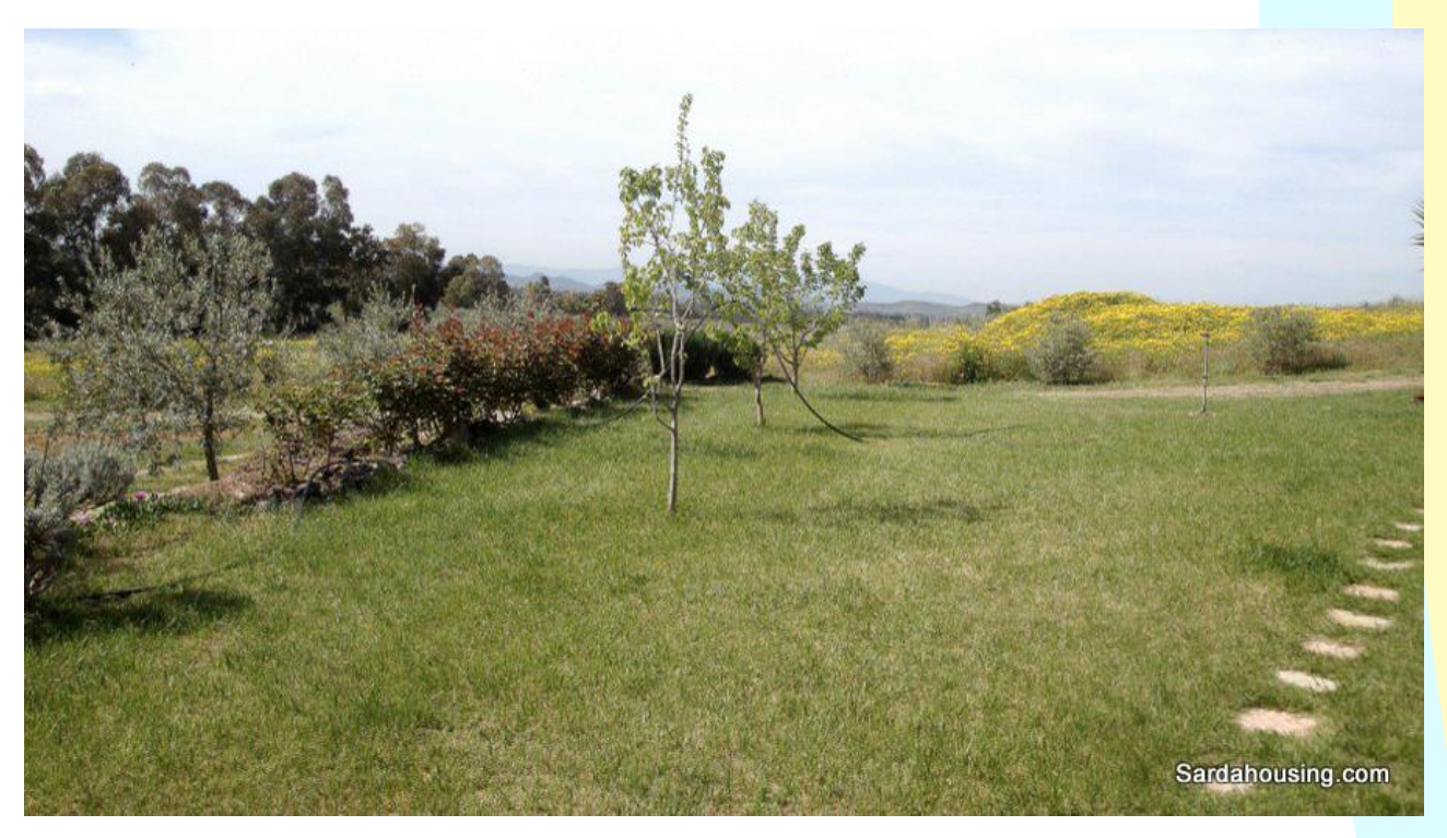
17 - Donori – Estate Arrideli: a view of property