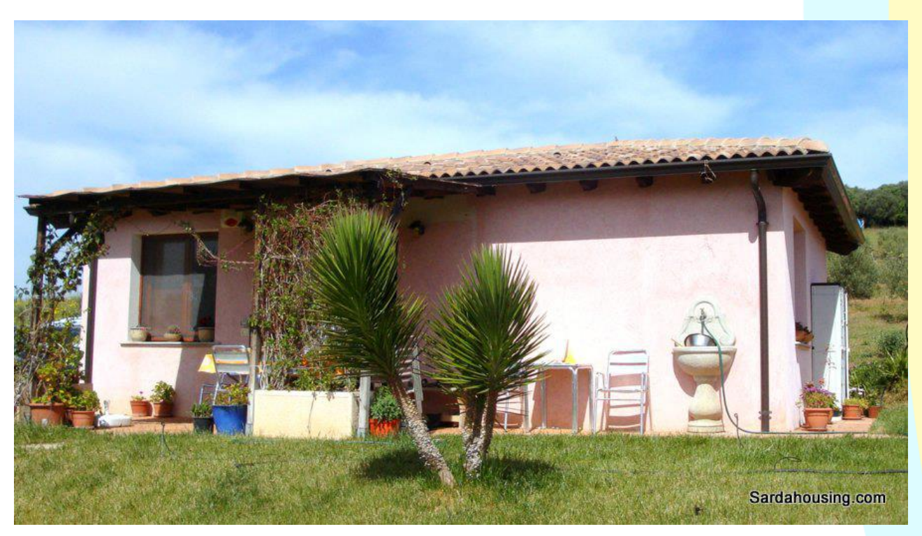
5 - Donori – Estate Arrideli: one of guest housing