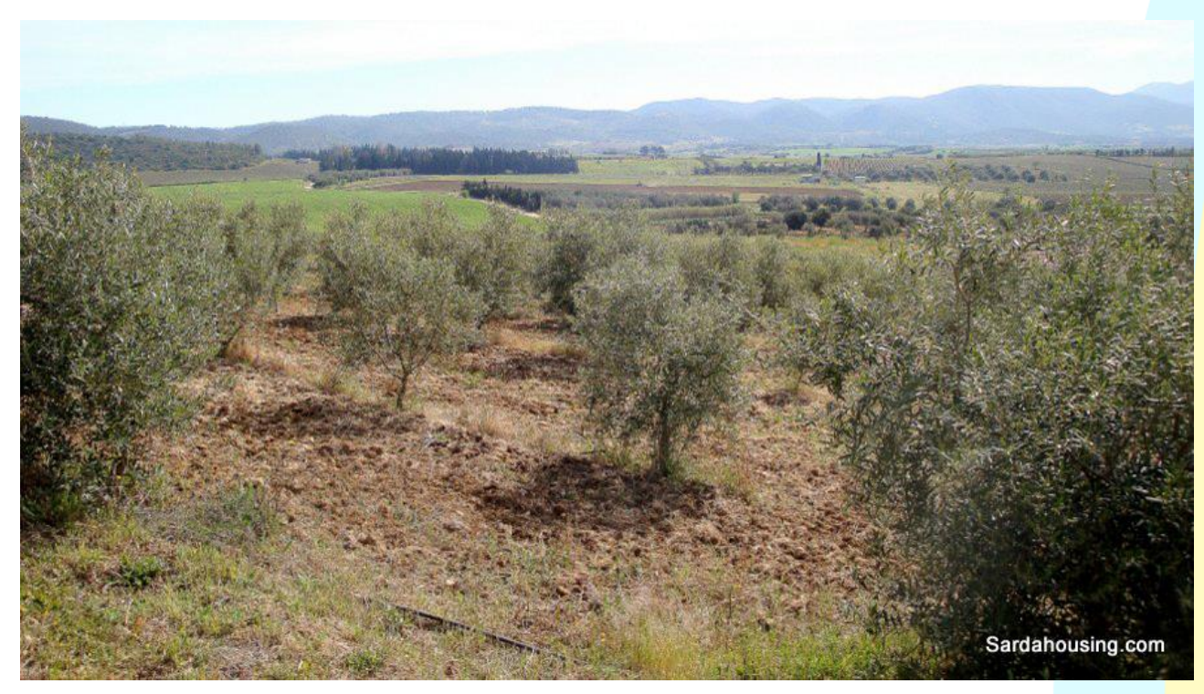
18 - Donori – Estate Arrideli: a view of property