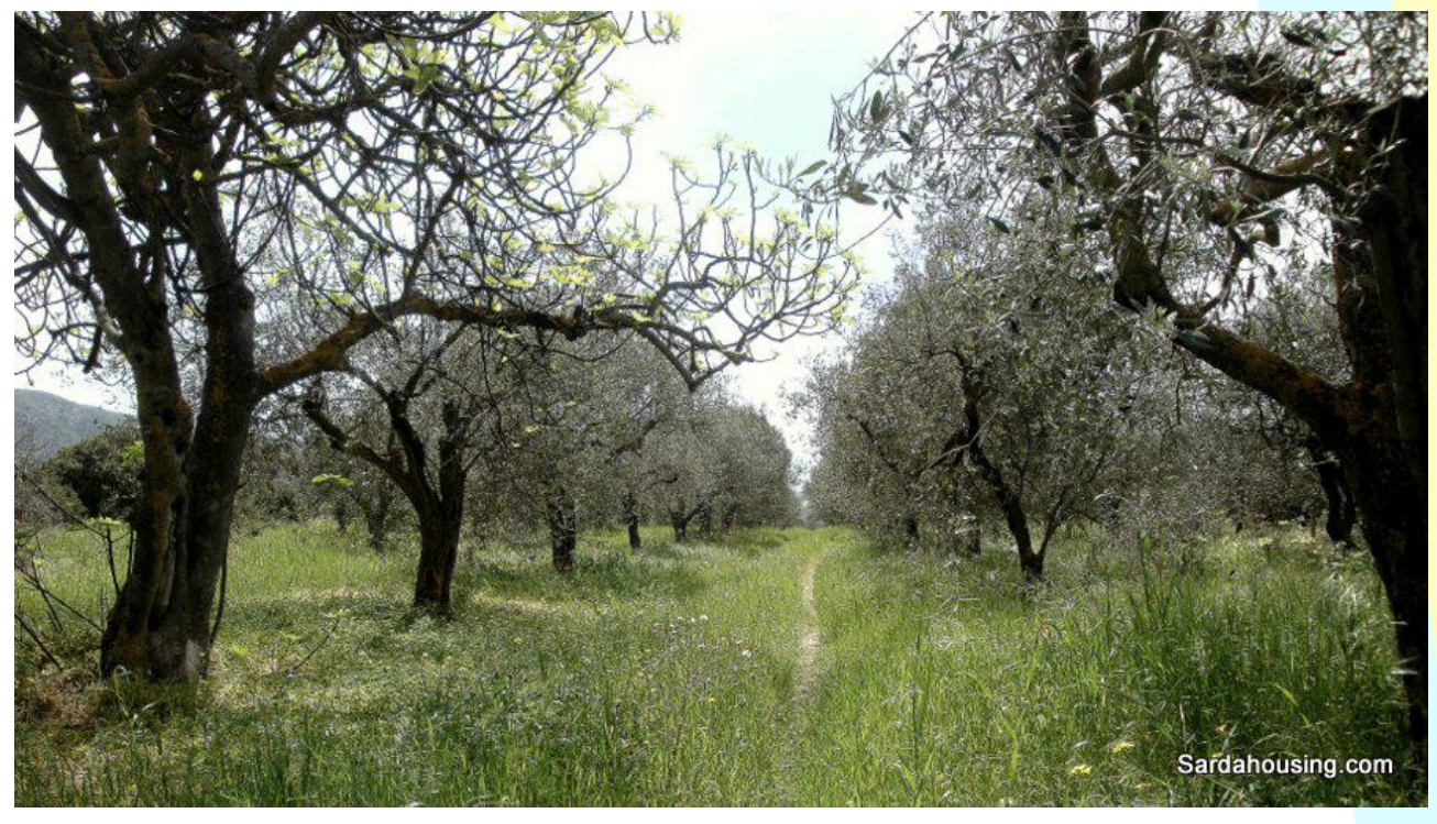
29 - Donori – Estate Arrideli: olive grove