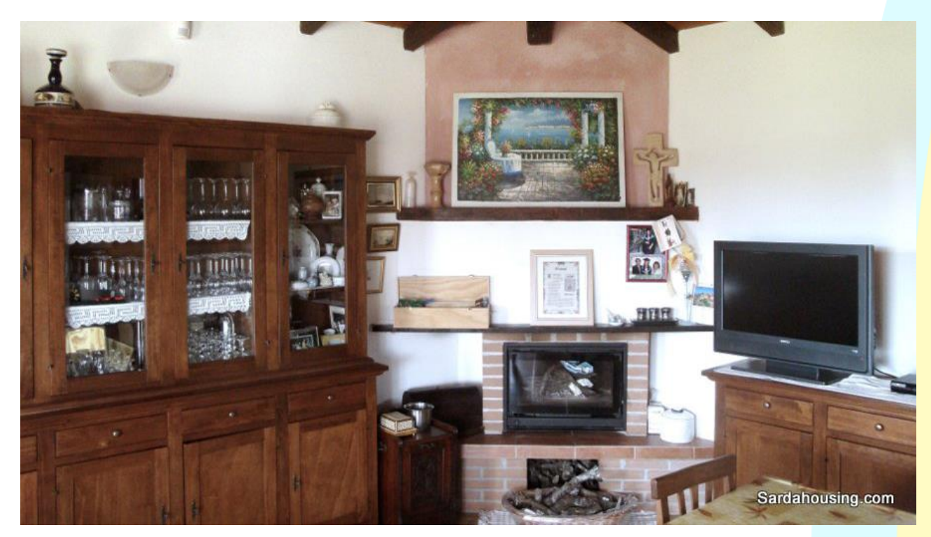
12 - Donori – Estate Arrideli: inside one of guest housing