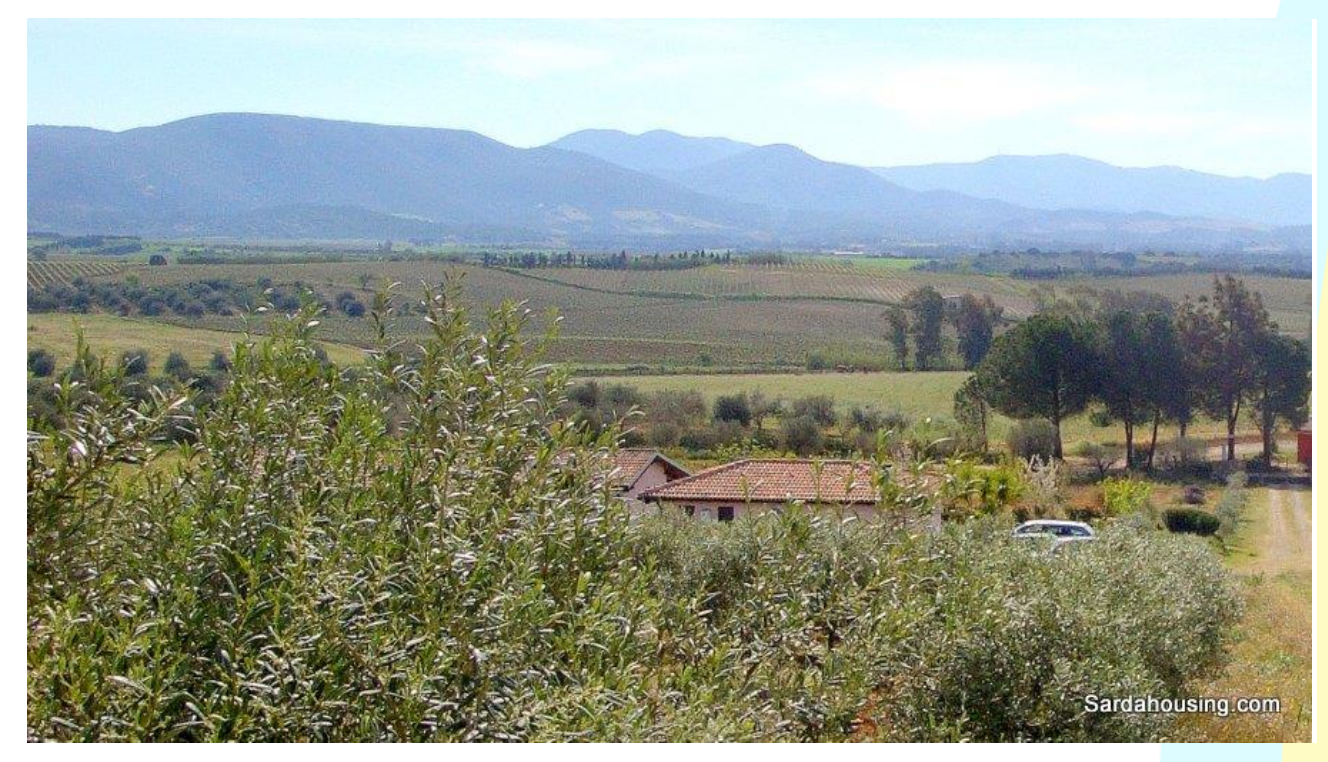
2 – Donori – Estate Arrideli: a view of buildings