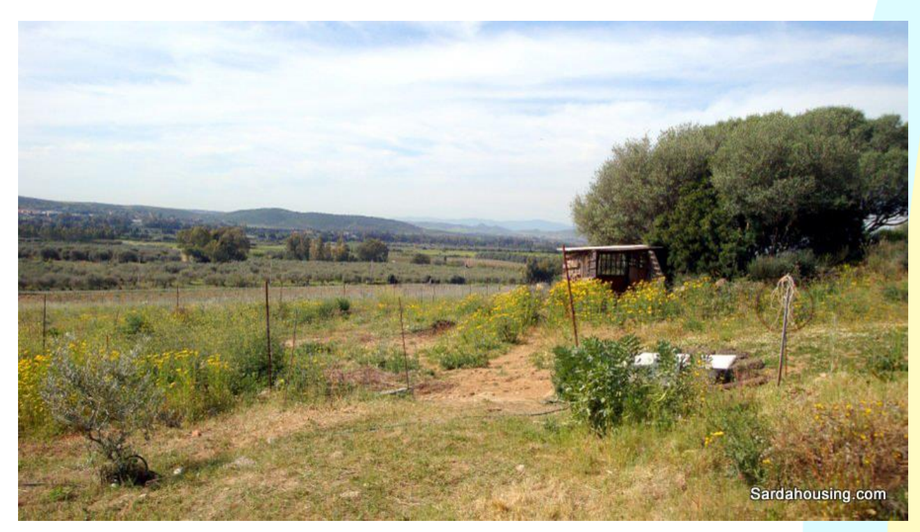
34 - Donori – Estate Arrideli: a view of the property