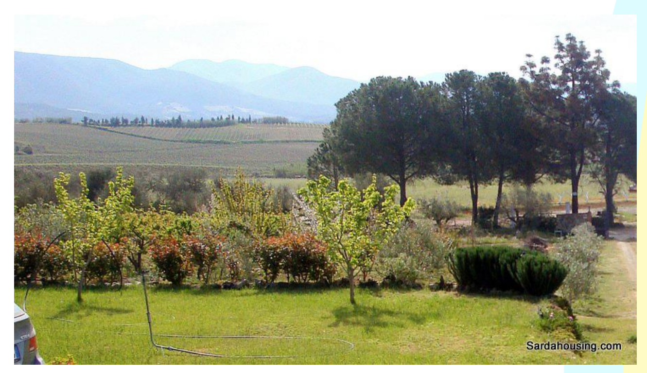
16 - Donori – Estate Arrideli: a view of property