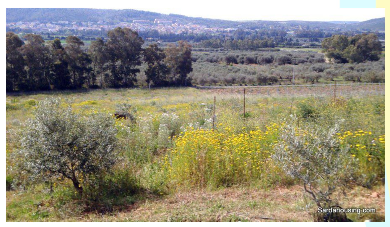
35 - Donori – Estate Arrideli: a view of the property