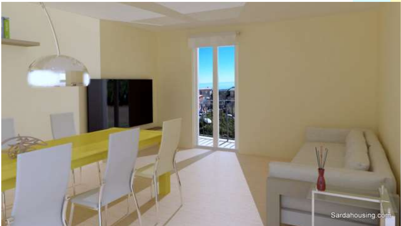
12 - Cala Gonone – Dorgali – Apartments Vasco