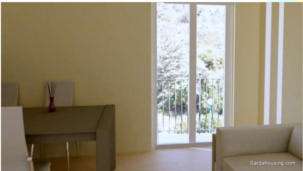
10 - Cala Gonone – Dorgali – Apartments Vasco