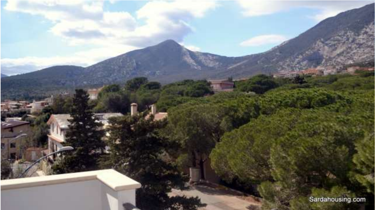
19 - Cala Gonone – Dorgali – Apartments Vasco: view from penthouse