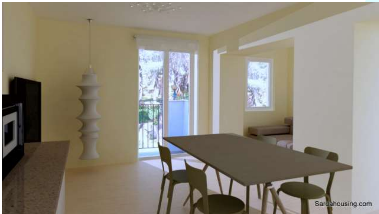
7 - Cala Gonone – Dorgali – Apartments Vasco