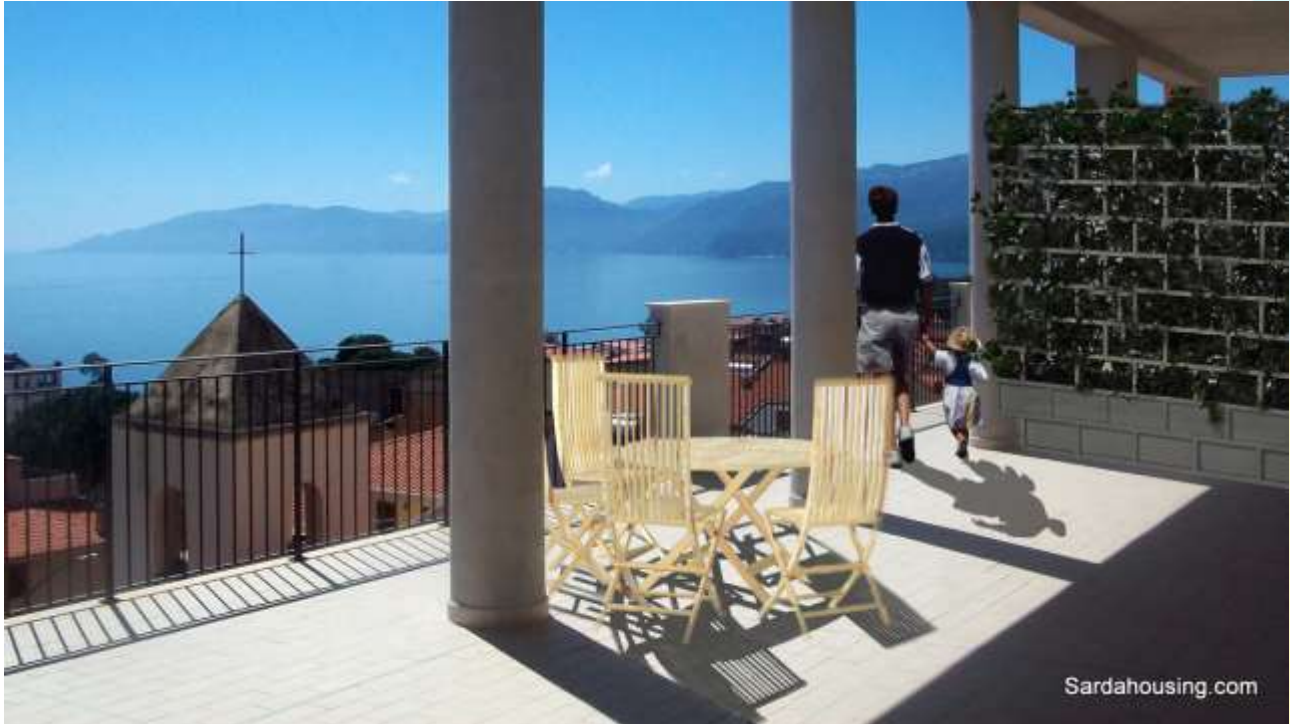
2 – Cala Gonone – Dorgali – Apartments Vasco: sea view from penthouse terrace