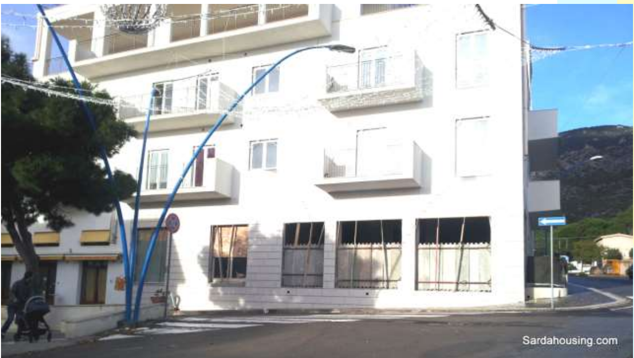
24 - Cala Gonone – Dorgali – Apartments Vasco: the completely renewed building