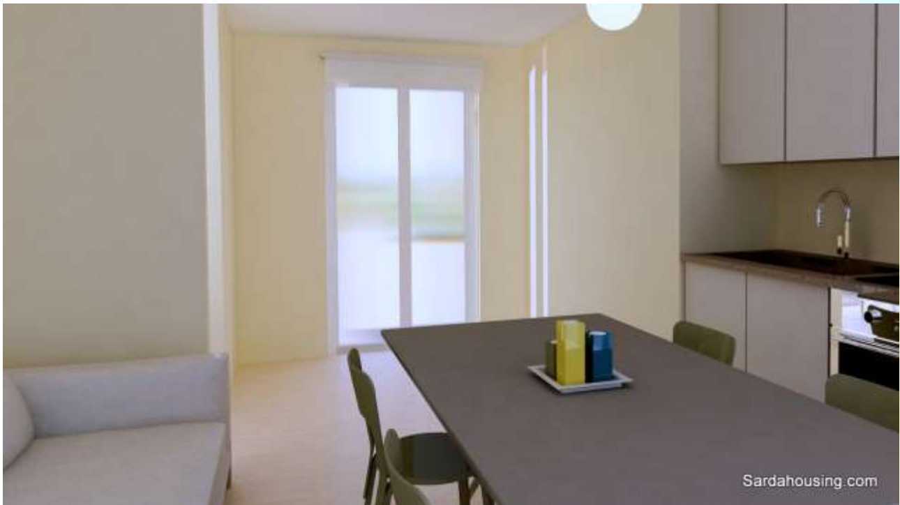
9 - Cala Gonone – Dorgali – Apartments Vasco