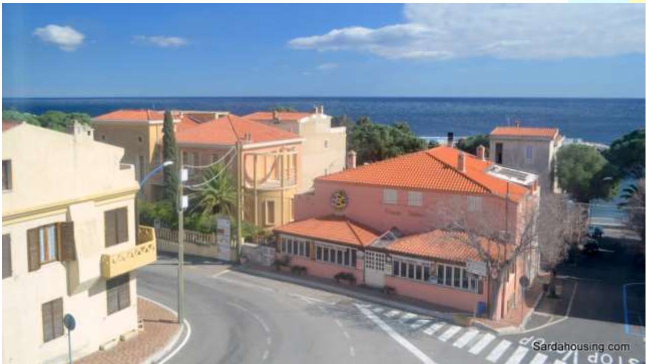
22 - Cala Gonone – Dorgali – Apartments Vasco: sea view