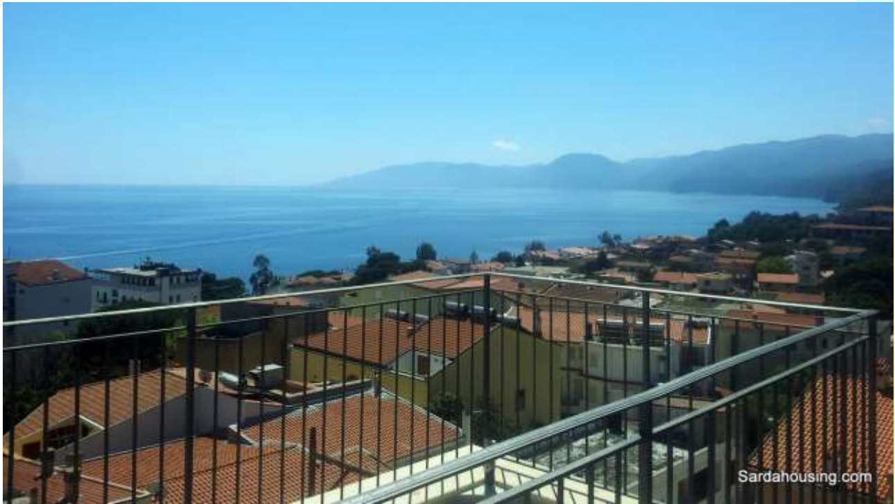
3 - Cala Gonone – Dorgali – Apartments Vasco: sea view from roof terrace