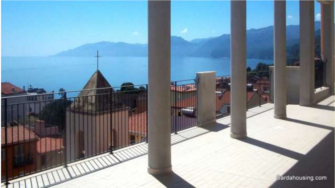
1 – Cala Gonone – Dorgali – Apartments Vasco: sea view from penthouse terrace

In Cala Gonone , one of the best known sea locations on the east coast of Sardinia , we offer magnificent sea view penthouses 150 metres to the beach .