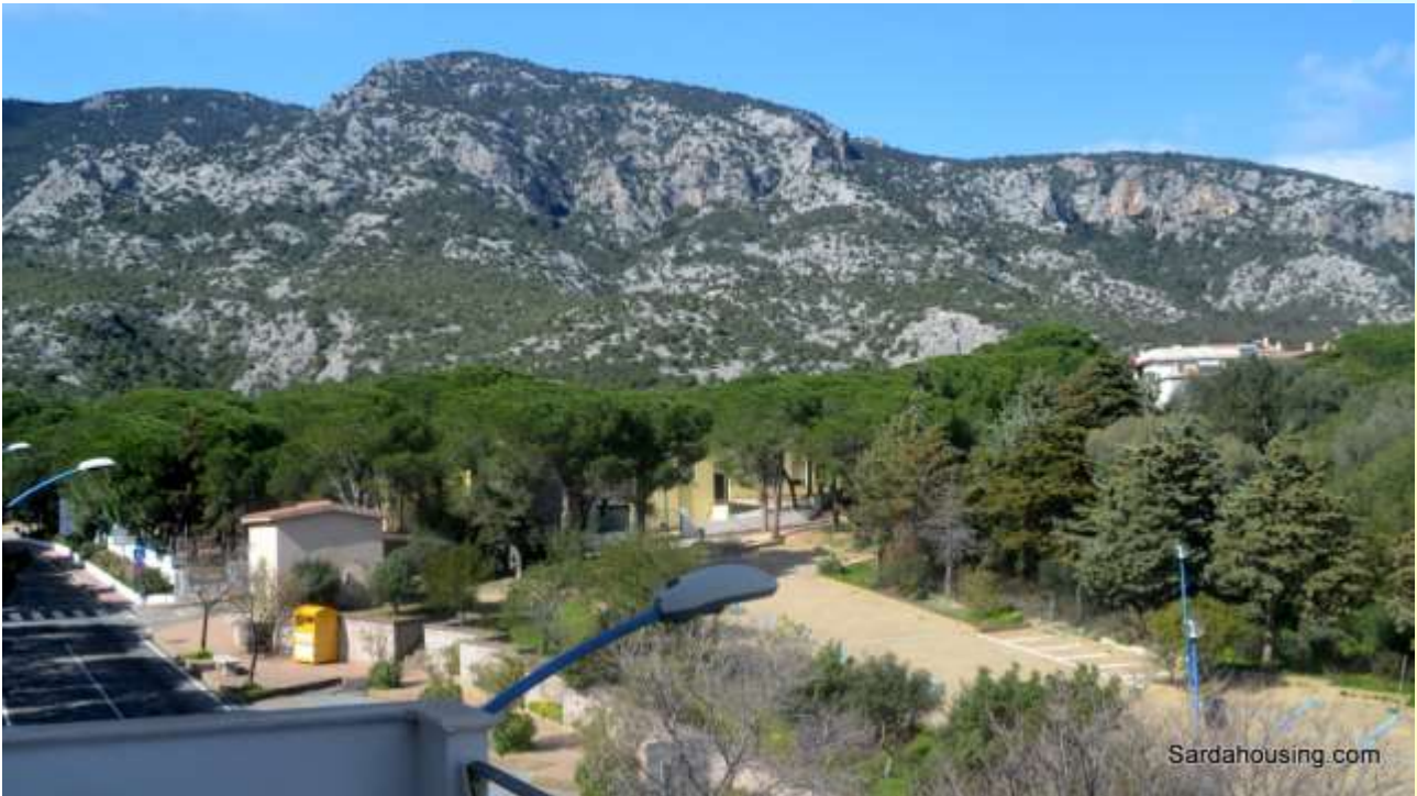
23 - Cala Gonone – Dorgali – Apartments Vasco: sea view