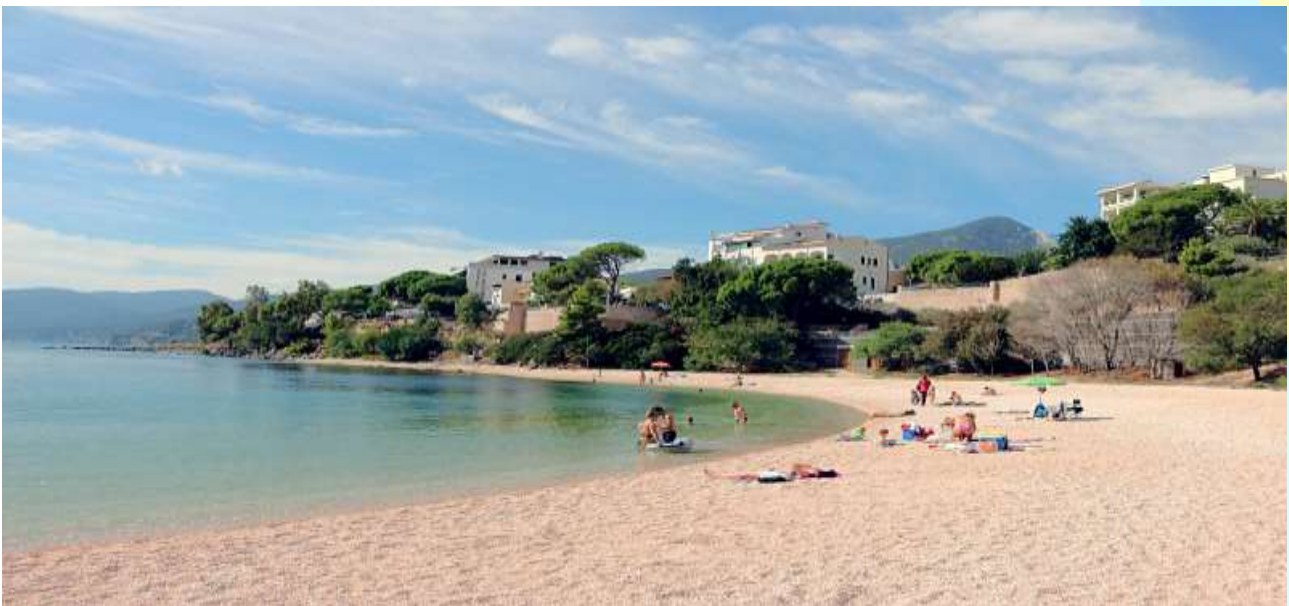
Cala Gonone – Spiaggia Centrale

Distances: Dorgali 10 km; Nuoro: 39 km; Olbia porto e aeroporto: 107 km.