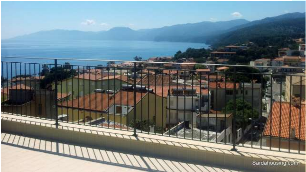
17 - Cala Gonone – Dorgali – Apartments Vasco: sea view from roof terrace