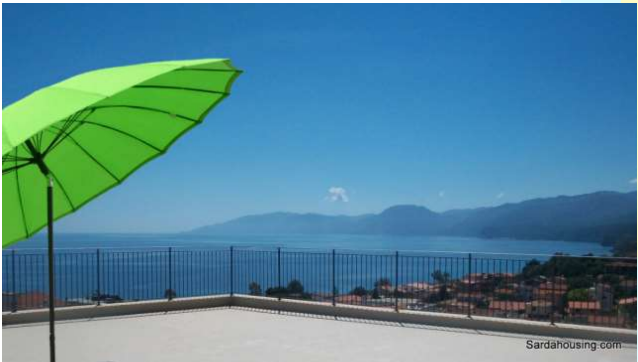
4 - Cala Gonone – Dorgali – Apartments Vasco: sea view from roof terrace