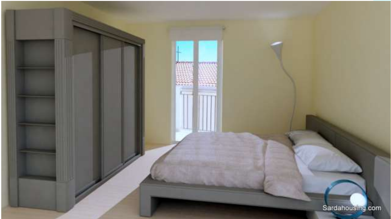
13 - Cala Gonone – Dorgali – Apartments Vasco