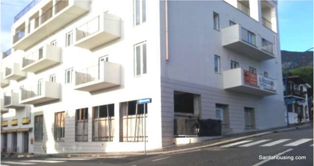
25 - Cala Gonone – Dorgali – Apartments Vasco: the completely renewed building