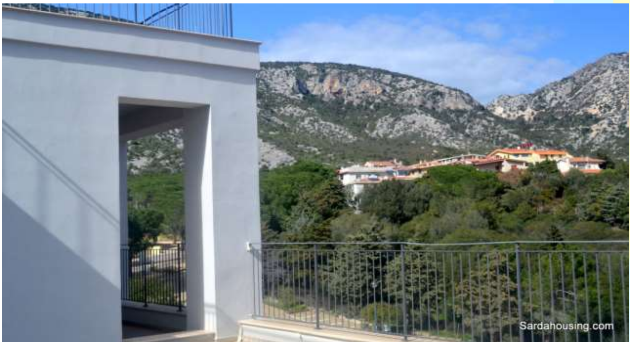
6 - Cala Gonone – Dorgali – Apartments Vasco: sea view from penthouse terrace