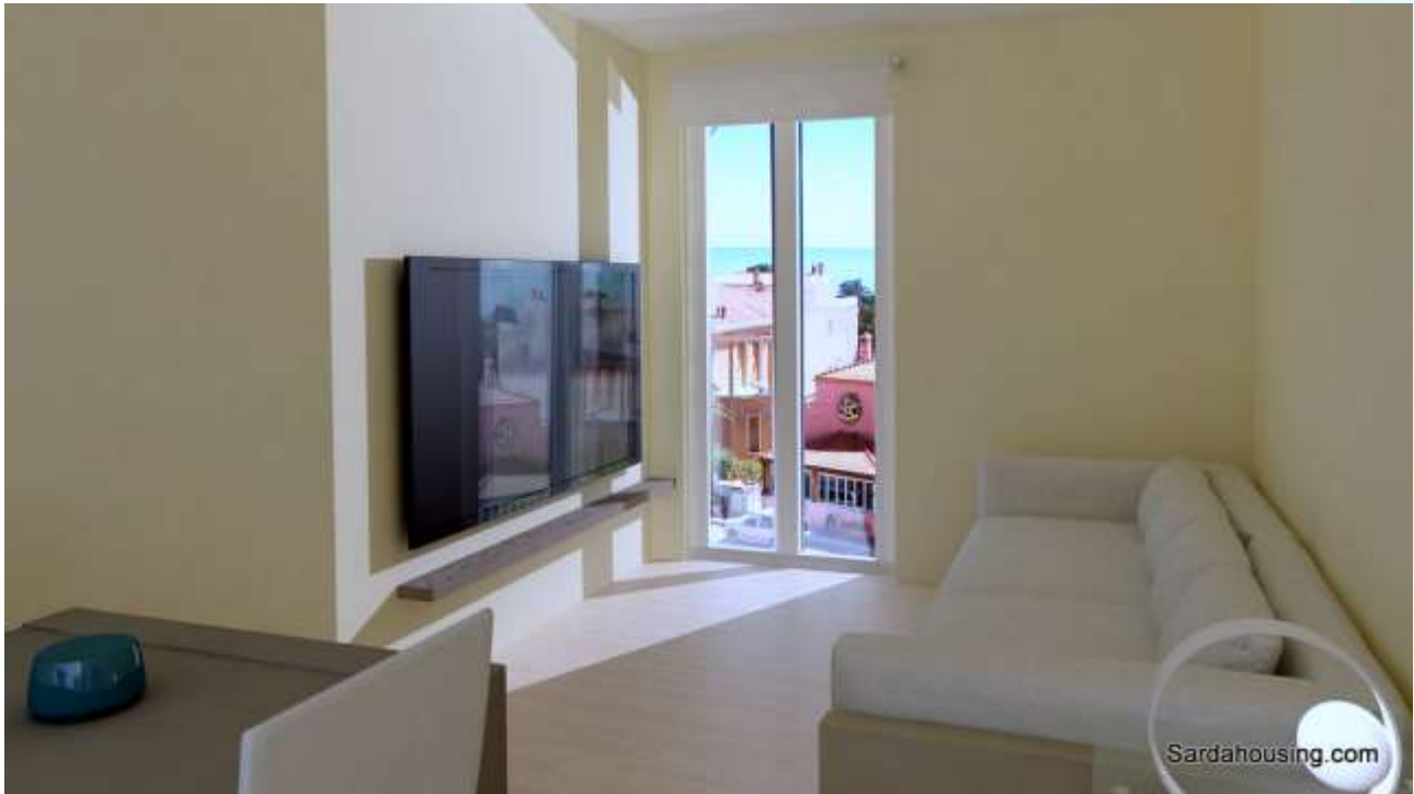
11 - Cala Gonone – Dorgali – Apartments Vasco