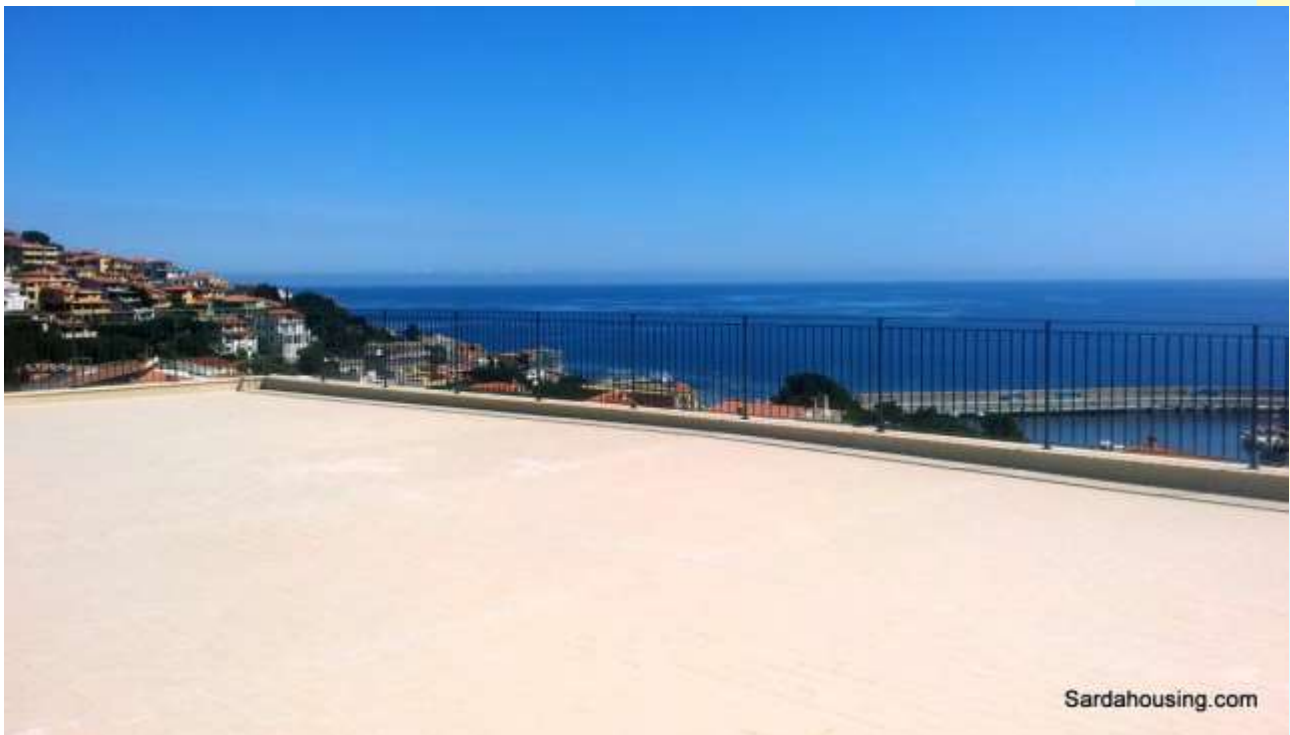
14 - Cala Gonone – Dorgali – Apartments Vasco: sea view from roof terrace