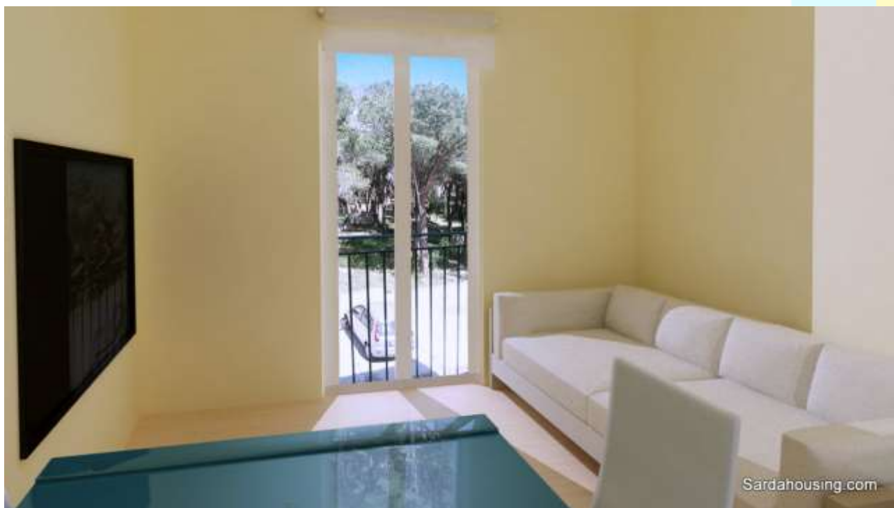
8 - Cala Gonone – Dorgali – Apartments Vasco