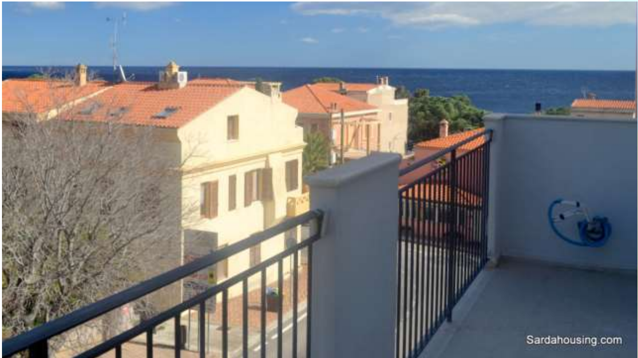
21 - Cala Gonone – Dorgali – Apartments Vasco: sea view from roof terrace