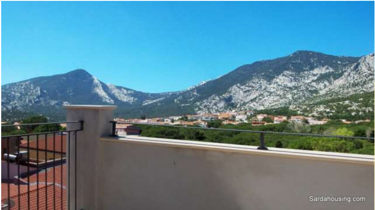
5 - Cala Gonone – Dorgali – Apartments Vasco: sea view from roof terrace