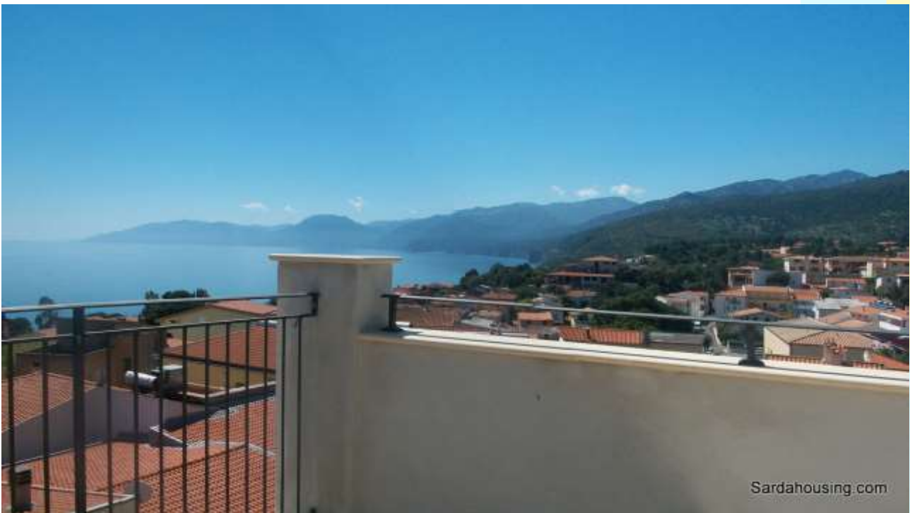
20 - Cala Gonone – Dorgali – Apartments Vasco: sea view from roof terrace