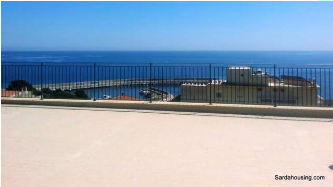
15 - Cala Gonone – Dorgali – Apartments Vasco: sea view from roof terrace