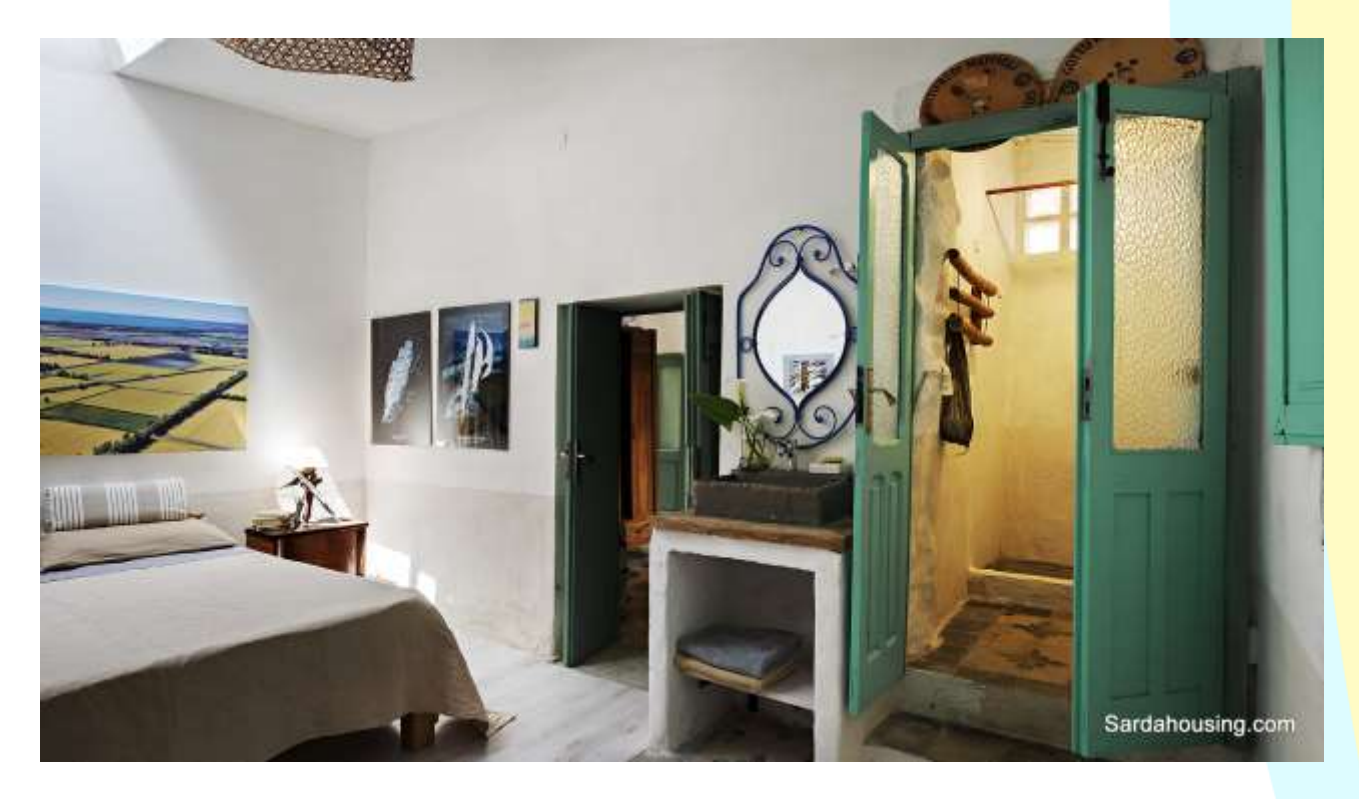
12 - Cabras - old centre - House Green - Renovated Campidanese house: bedroom