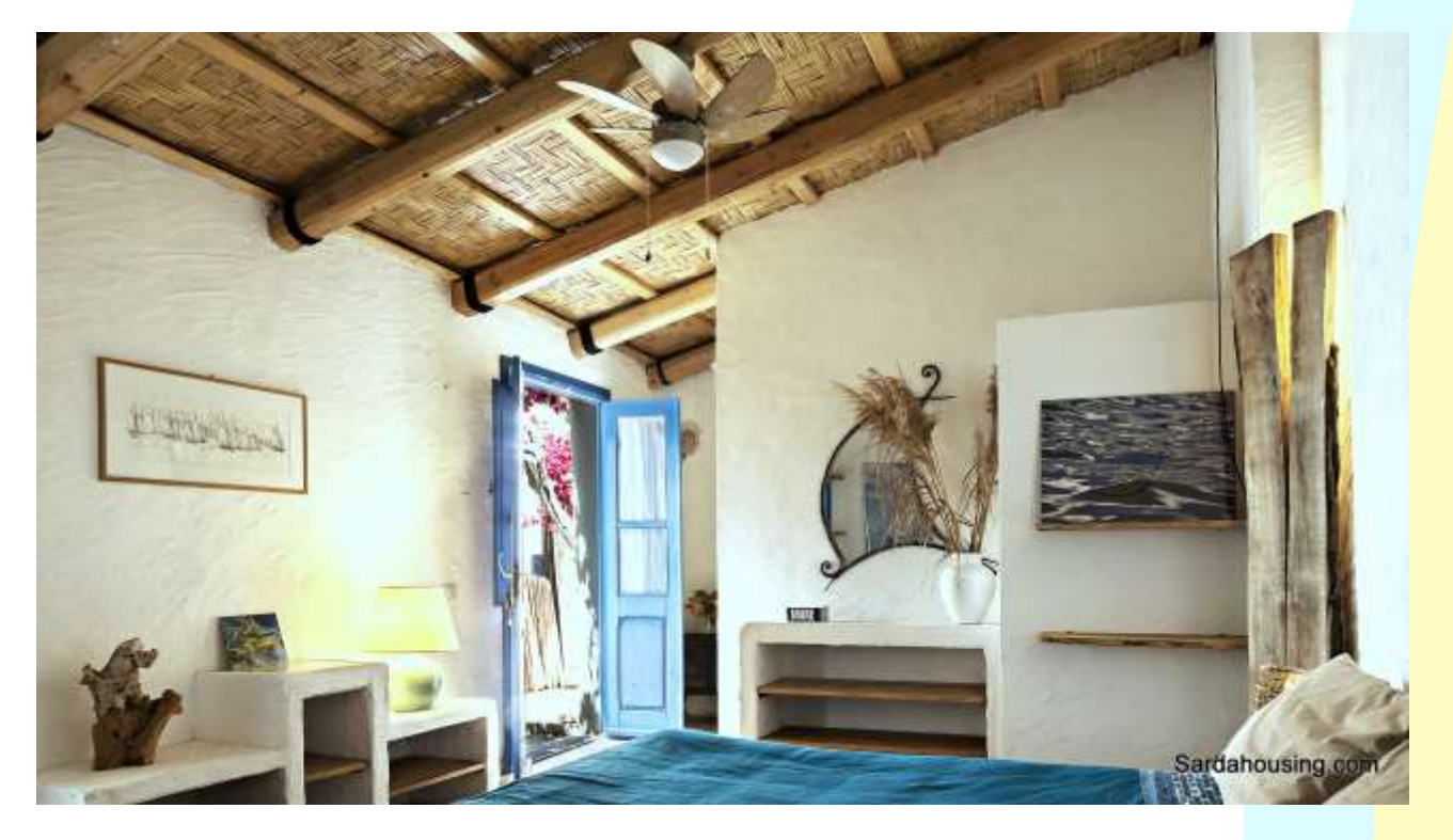
15 - Cabras - old centre - House Green - Renovated Campidanese house: bedroom