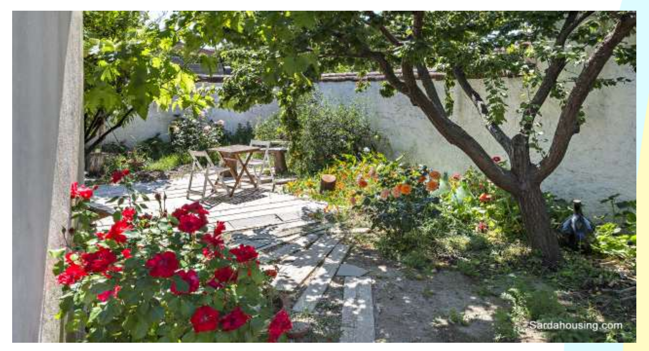
3 - Cabras – old centre – House Green – Renovated Campidanese house: garden