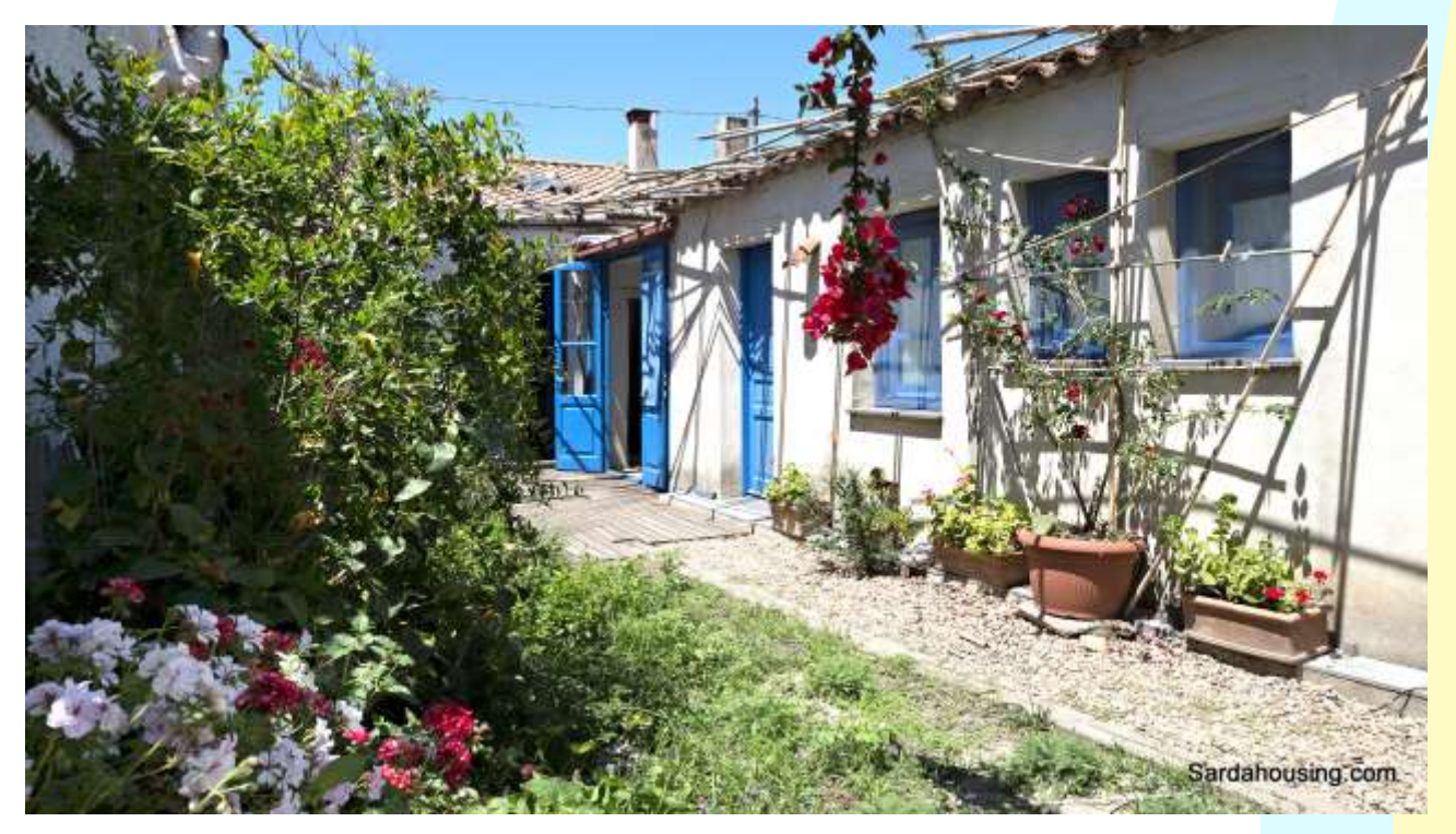
1 - Cabras - old centre - House Green - Renovated Campidanese house

In the old centre of Cabras (Oristano), we offer a complex of two traditional Campidanese houses, joined together. Magnificent renovation in green building.