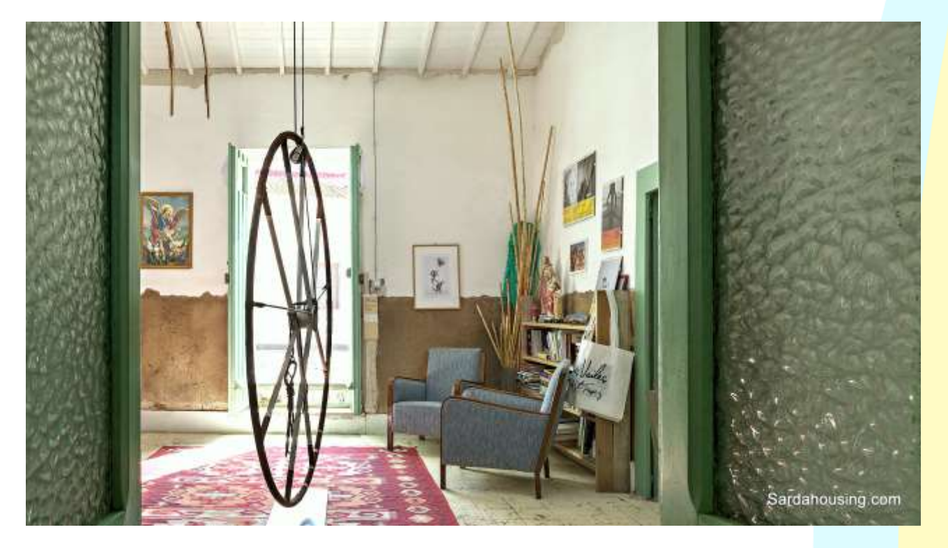
9 - Cabras - old centre - House Green - Renovated Campidanese house: living area