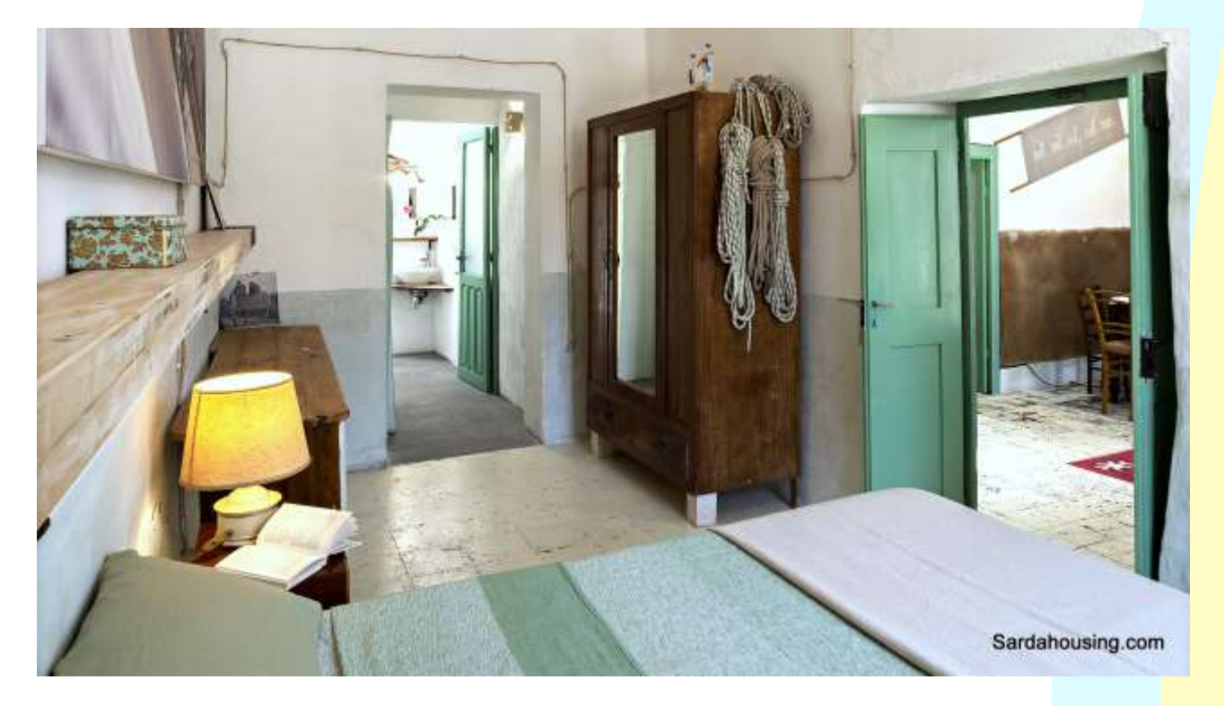
11 - Cabras - old centre - House Green - Renovated Campidanese house: bedroom