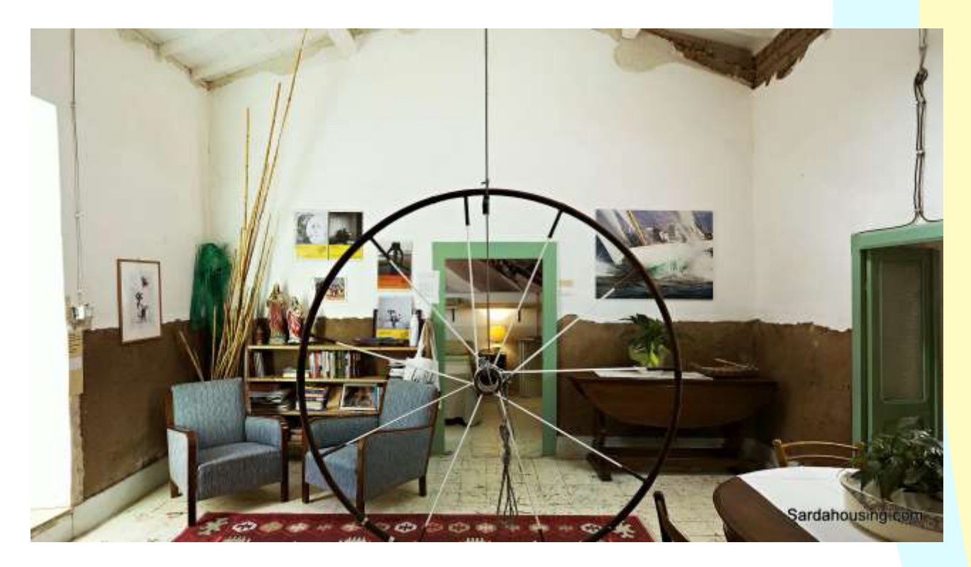
8 - Cabras - old centre - House Green - Renovated Campidanese house: living area