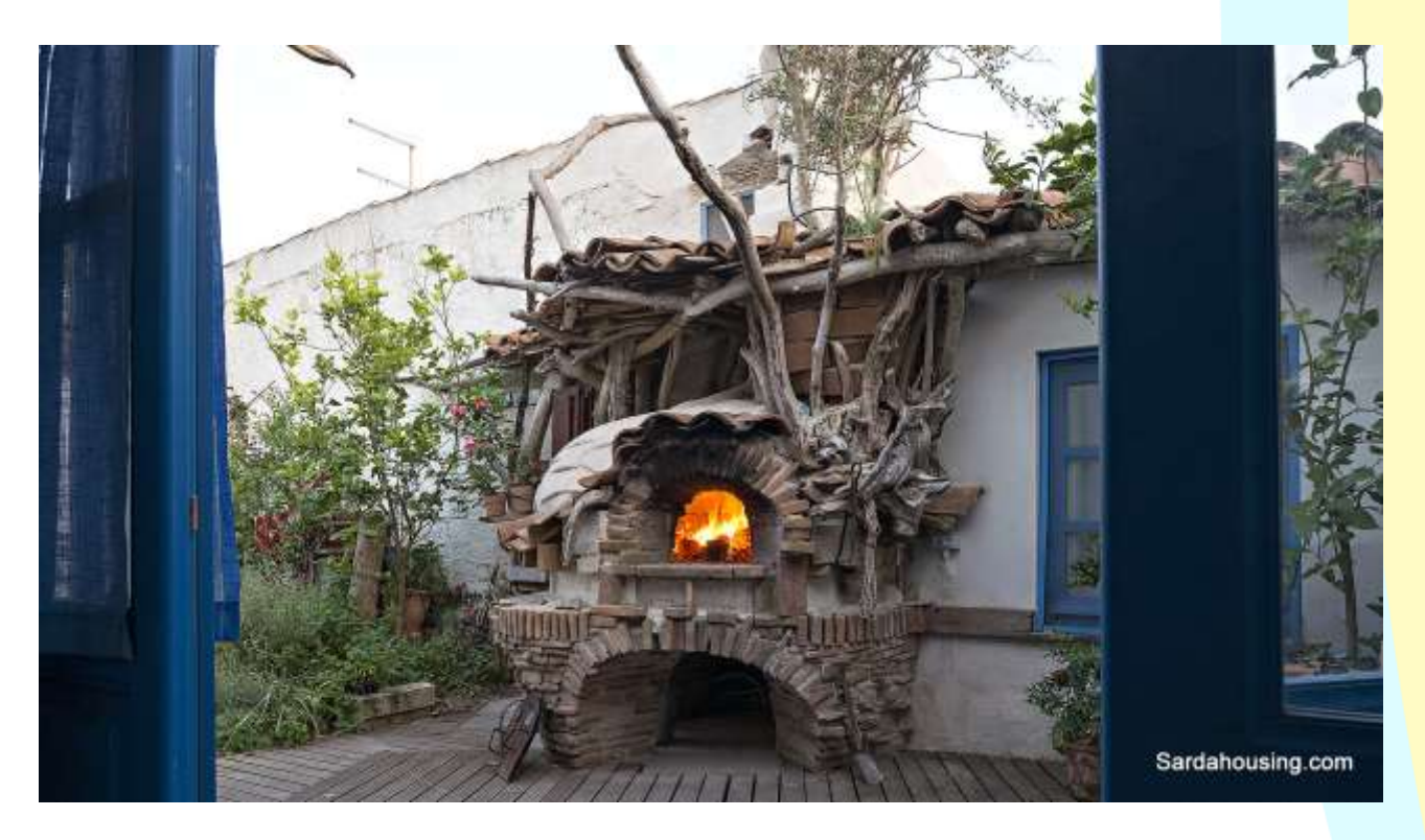
22 - Cabras - old centre - House Green - Renovated Campidanese house: traditional Sardinian oven