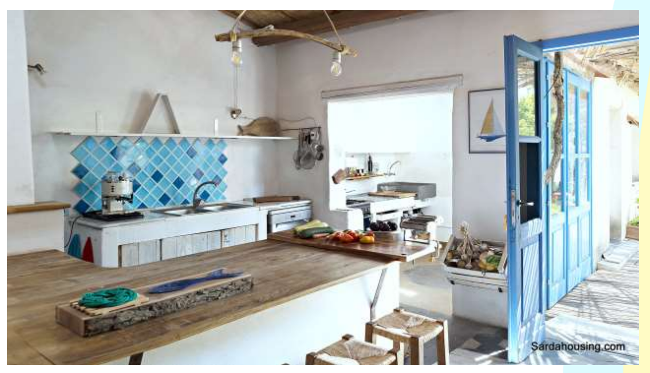
7 - Cabras - old centre - House Green - Renovated Campidanese house: kitchen