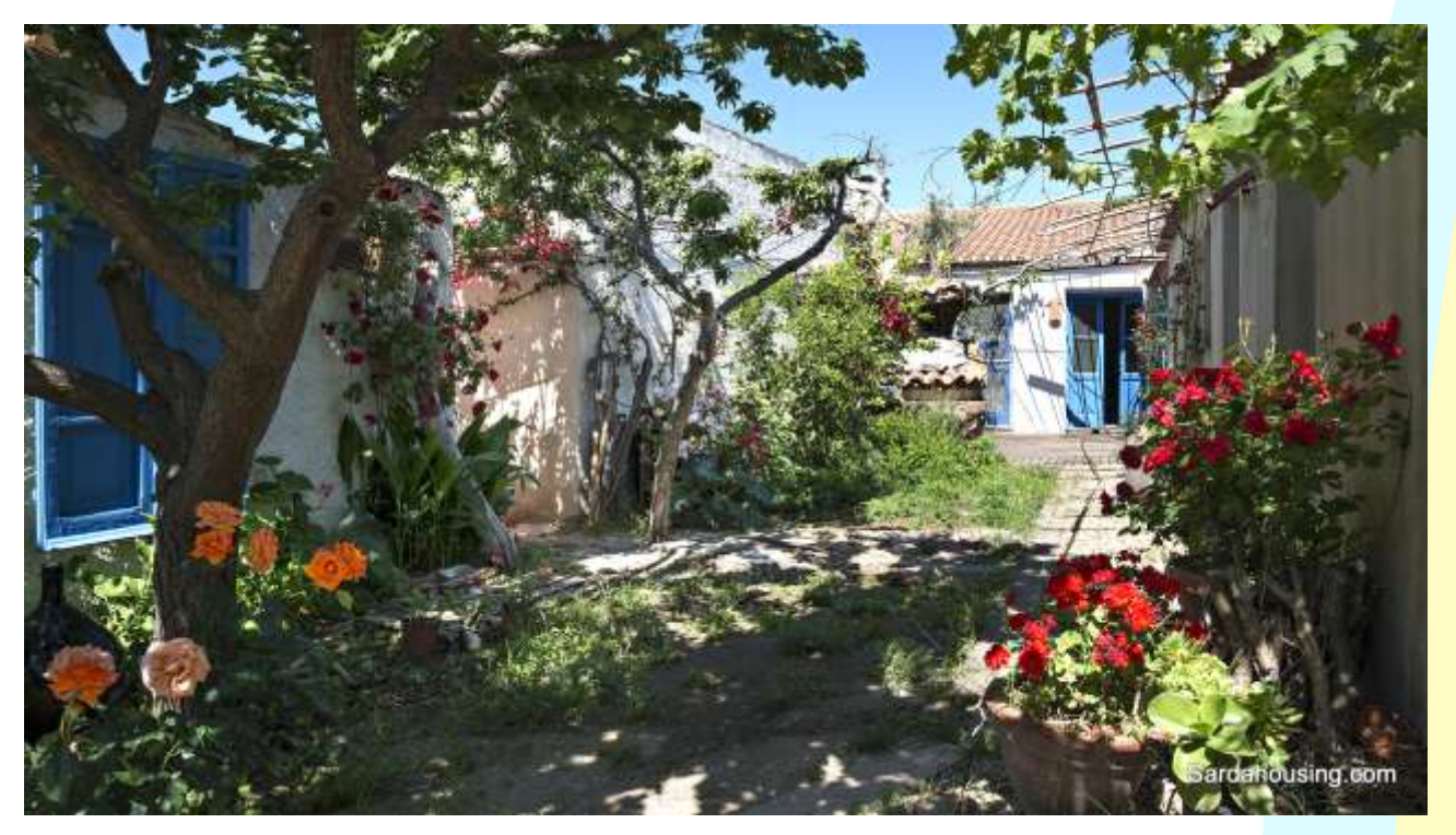
2 - Cabras - old centre - House Green - Renovated Campidanese house: garden