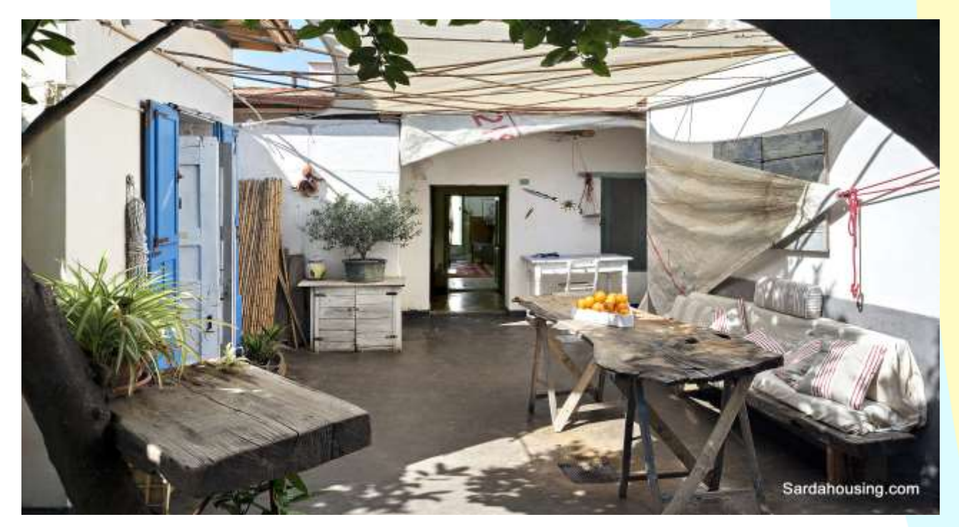
4 - Cabras - Casa Green - Campidanese ristrutturata: i giardini attrezzati

In the internal garden, facing the main kitchen, there is a small wood-fired oven in raw earth, as is traditional in Campidanese houses, for cooking food and making bread.