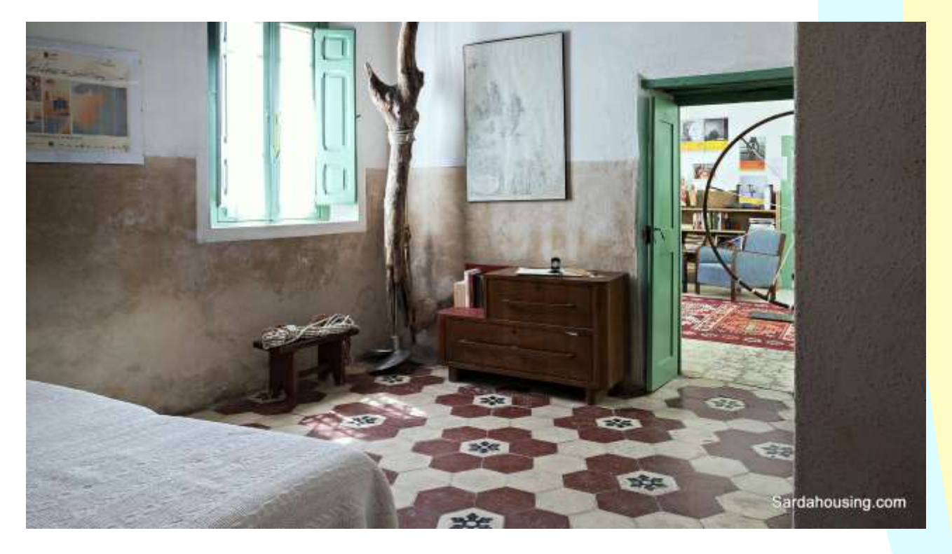
16 - Cabras - old centre - House Green - Renovated Campidanese house: bedroom