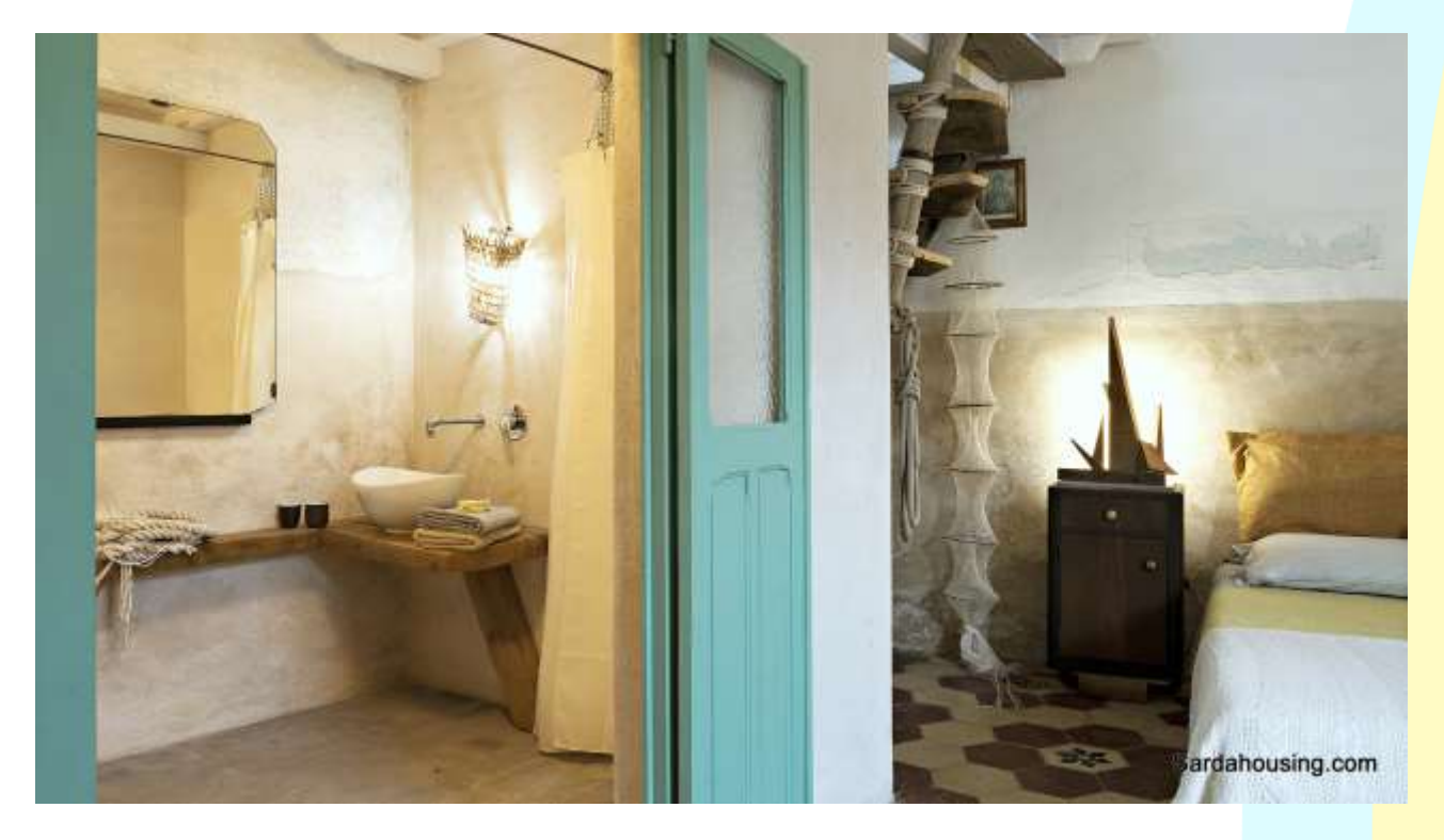
19 - Cabras - old centre - House Green - Renovated Campidanese house: en-suite bathroom