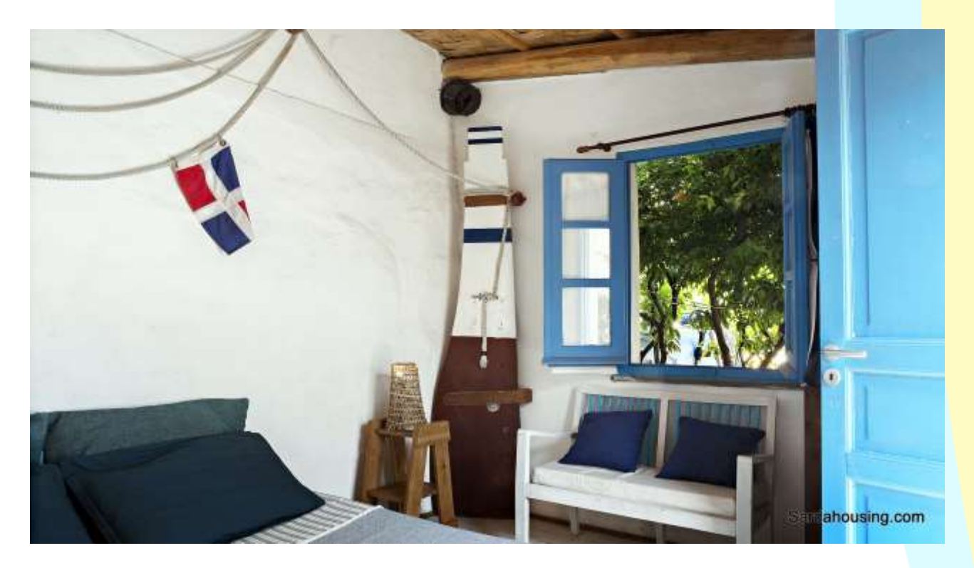
10 - Cabras - old centre - House Green - Renovated Campidanese house: bedroom