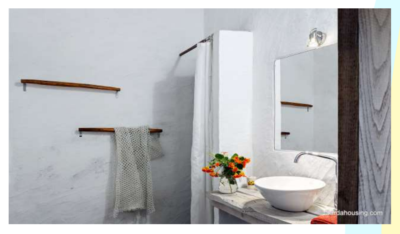
21 - Cabras - old centre - House Green - Renovated Campidanese house: en-suite bathroom