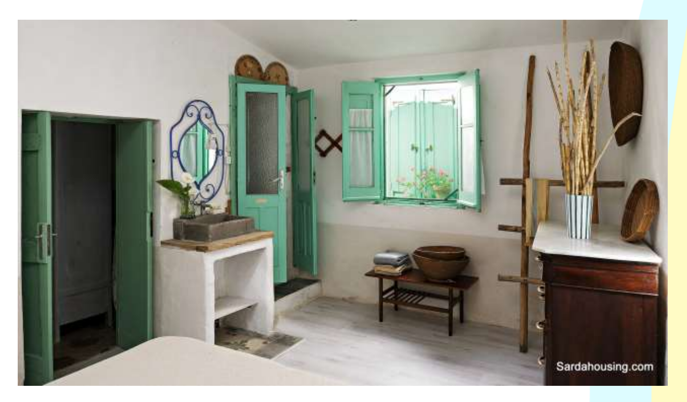
13 - Cabras - old centre - House Green - Renovated Campidanese house: bedroom