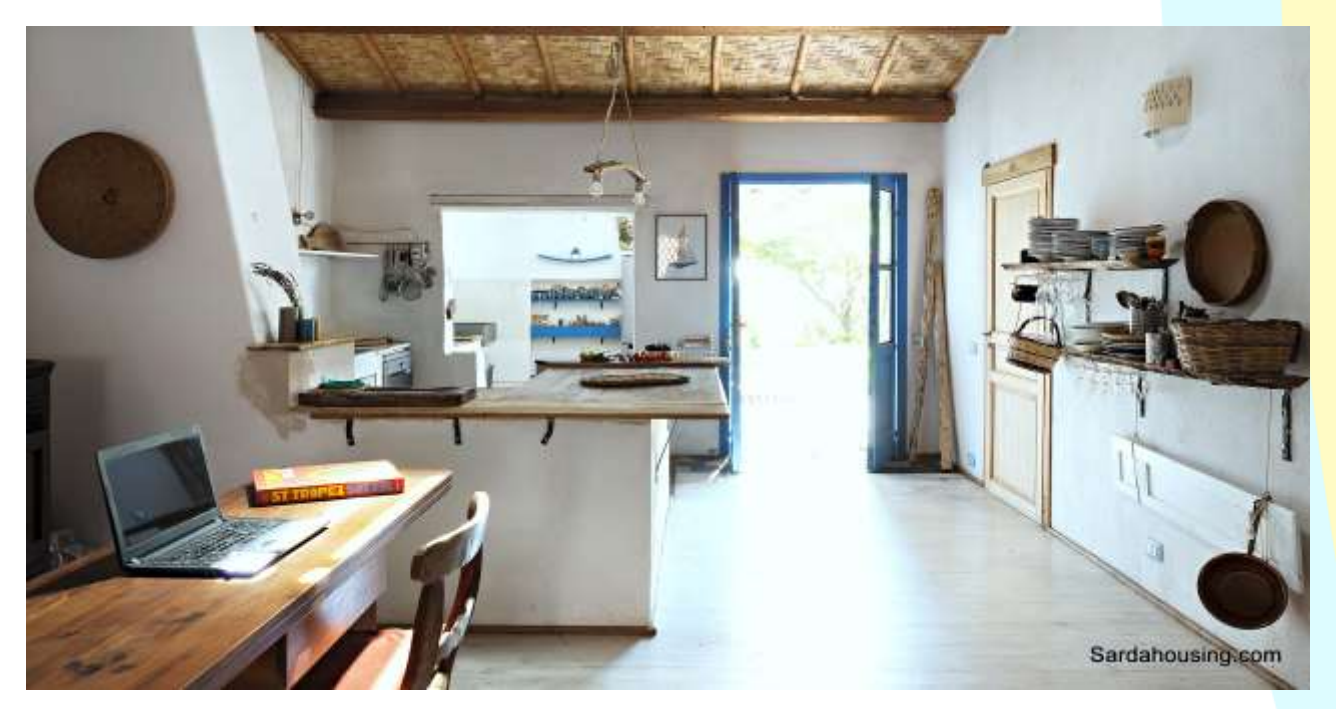
6 - Cabras - old centre - House Green - Renovated Campidanese house: kitchen