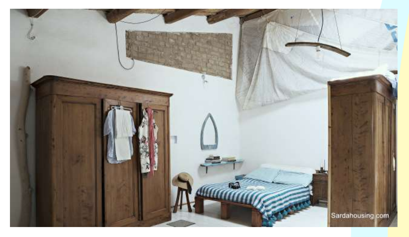
17 - Cabras - old centre - House Green - Renovated Campidanese house: bedroom