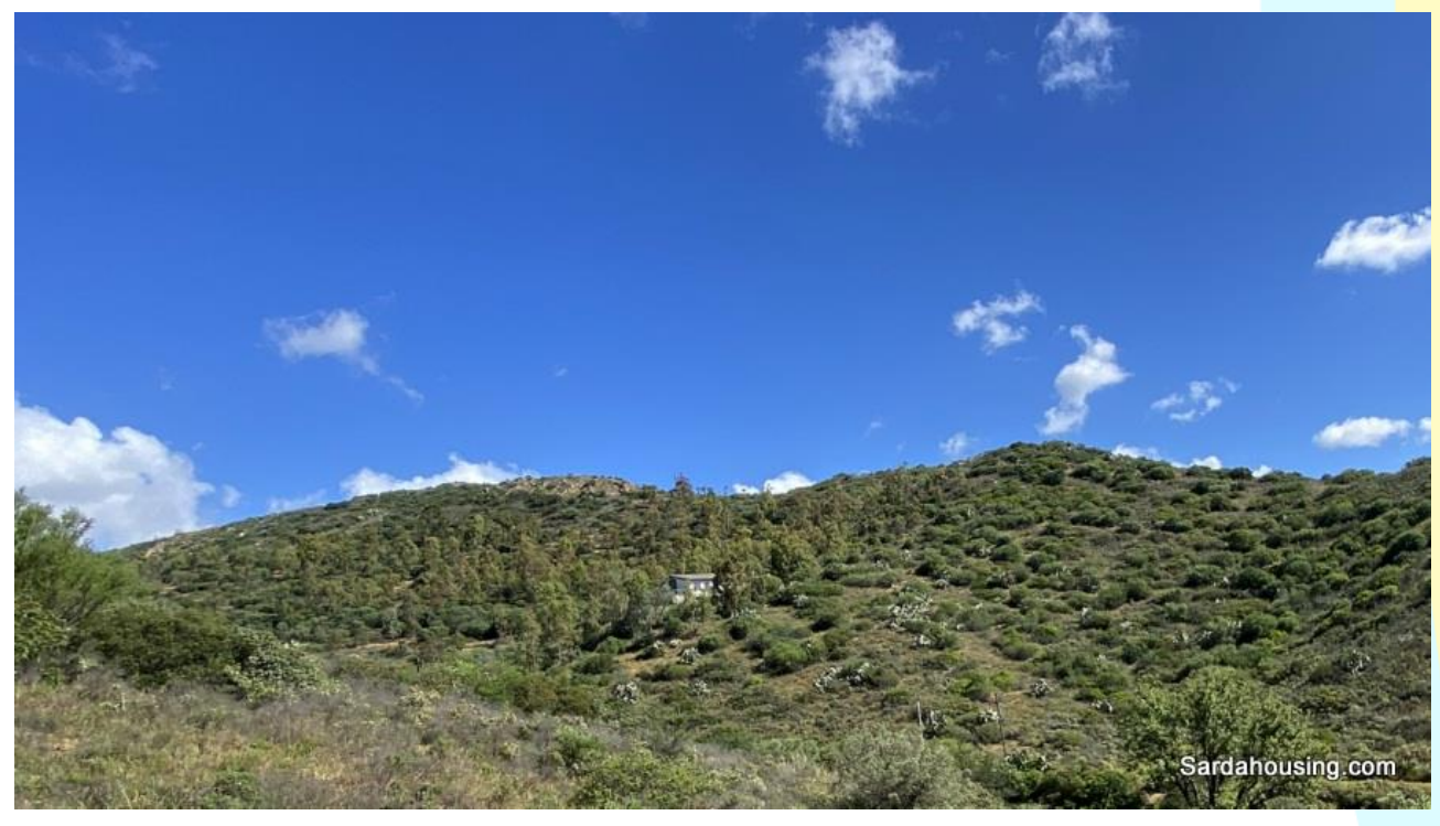
16 - Villa Nuxedda – Maracalagonis countryside –a view of the area