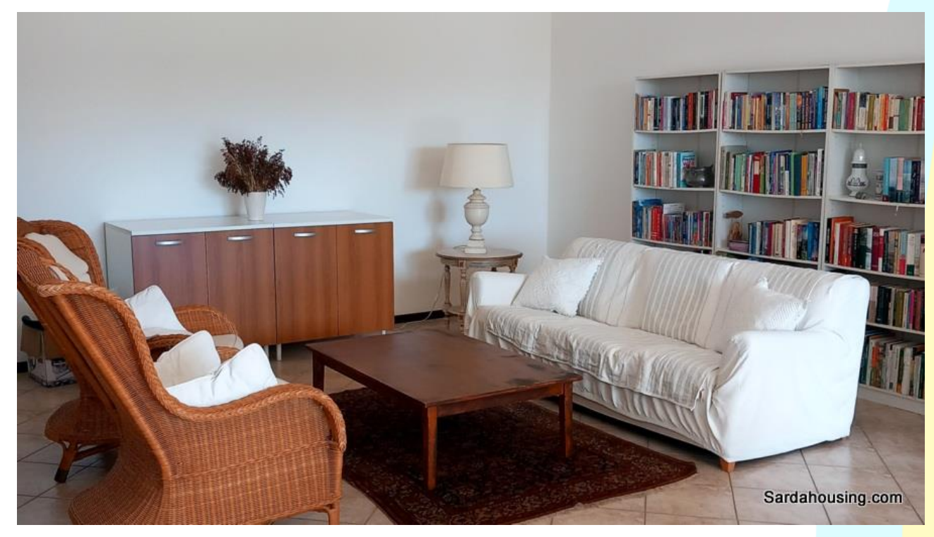
7 - Villa Nuxedda – Maracalagonis countryside – living room