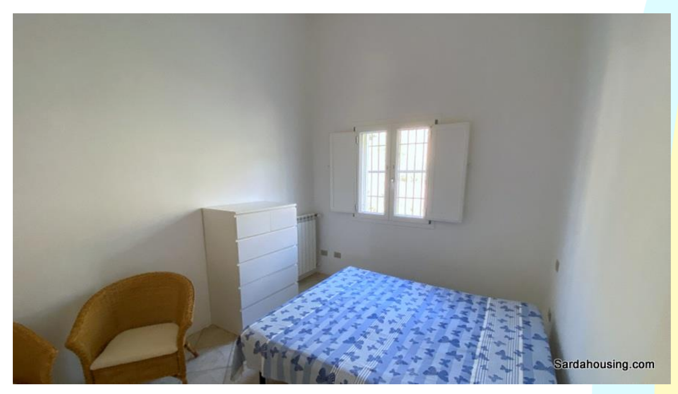
11 - Villa Nuxedda – Maracalagonis countryside – bedroom