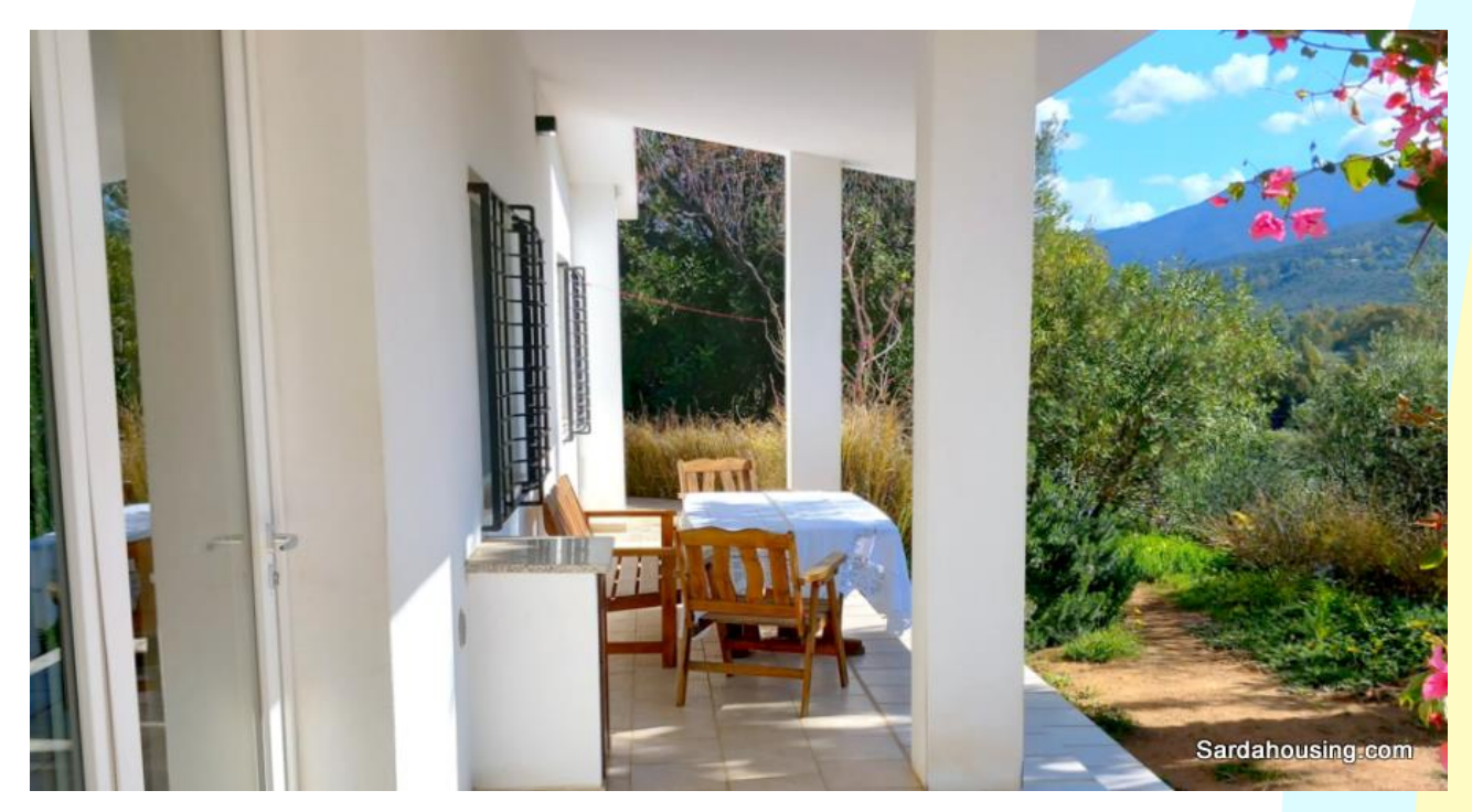
2 – Villa Nuxedda – Maracalagonis countryside – front veranda with open view