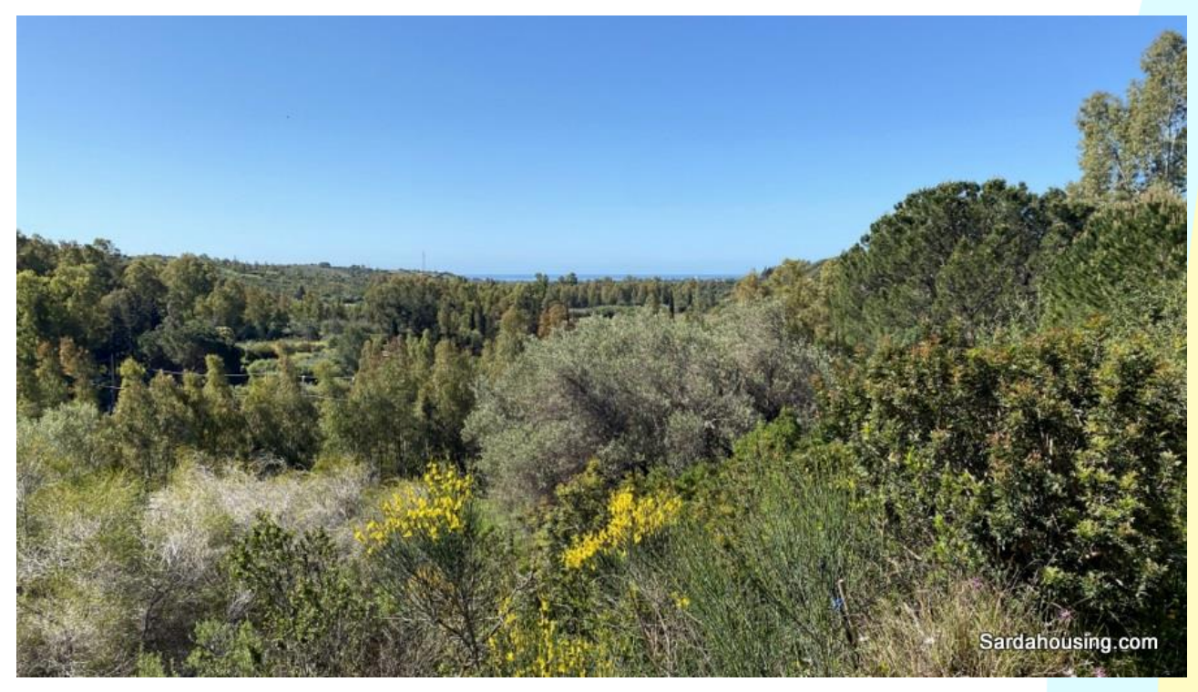
19 - Villa Nuxedda – Maracalagonis countryside – a view of the coast from the property