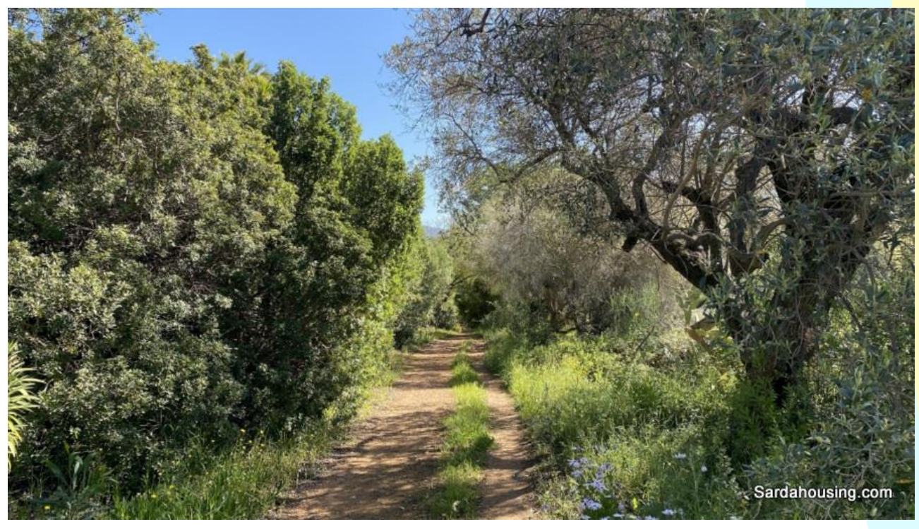
18 - Villa Nuxedda – Maracalagonis countryside – a view of the land