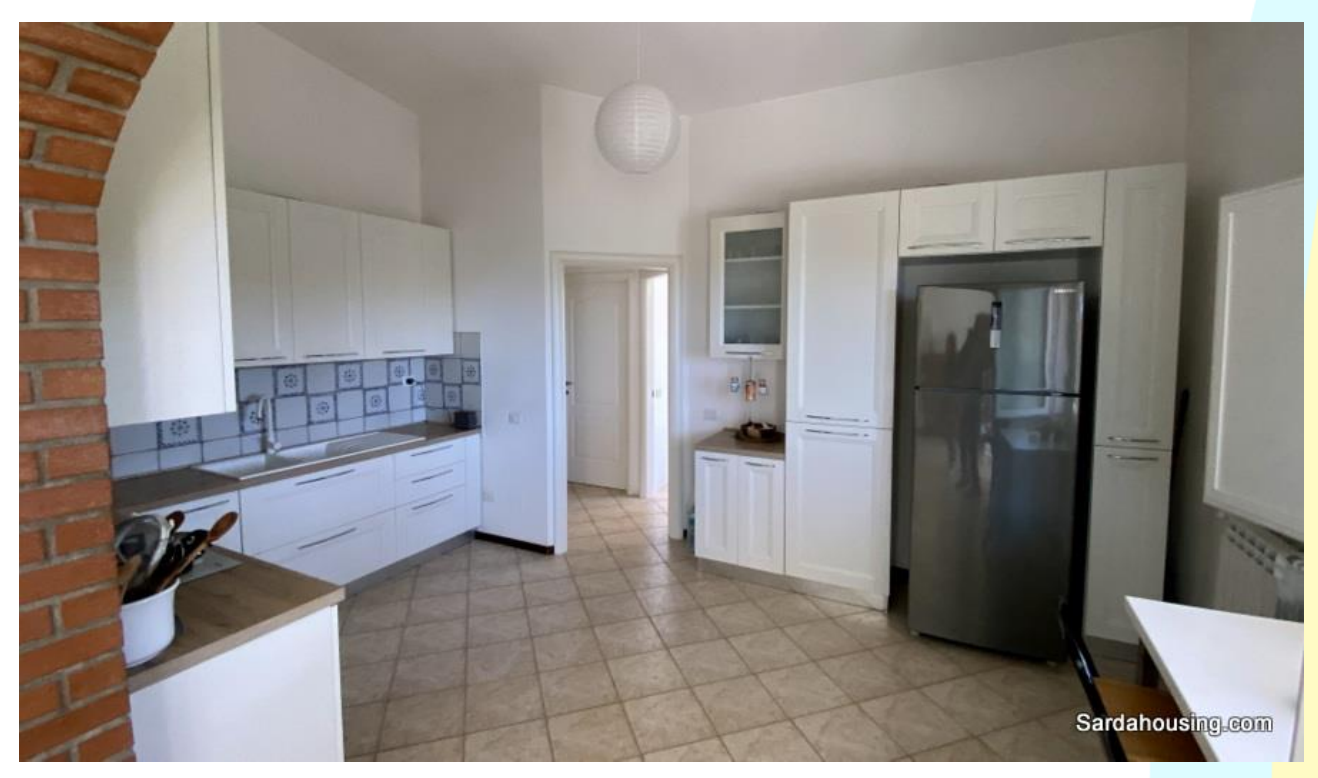
9 - Villa Nuxedda — Maracalagonis countryside — custom designed kitchen