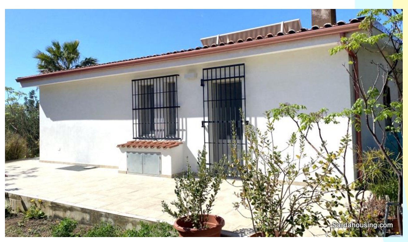
14 - Villa Nuxedda – Maracalagonis countryside – back of the house