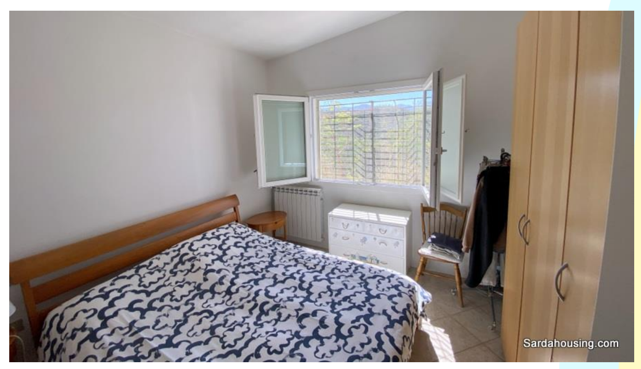
13 - Villa Nuxedda – Maracalagonis countryside – bedroom