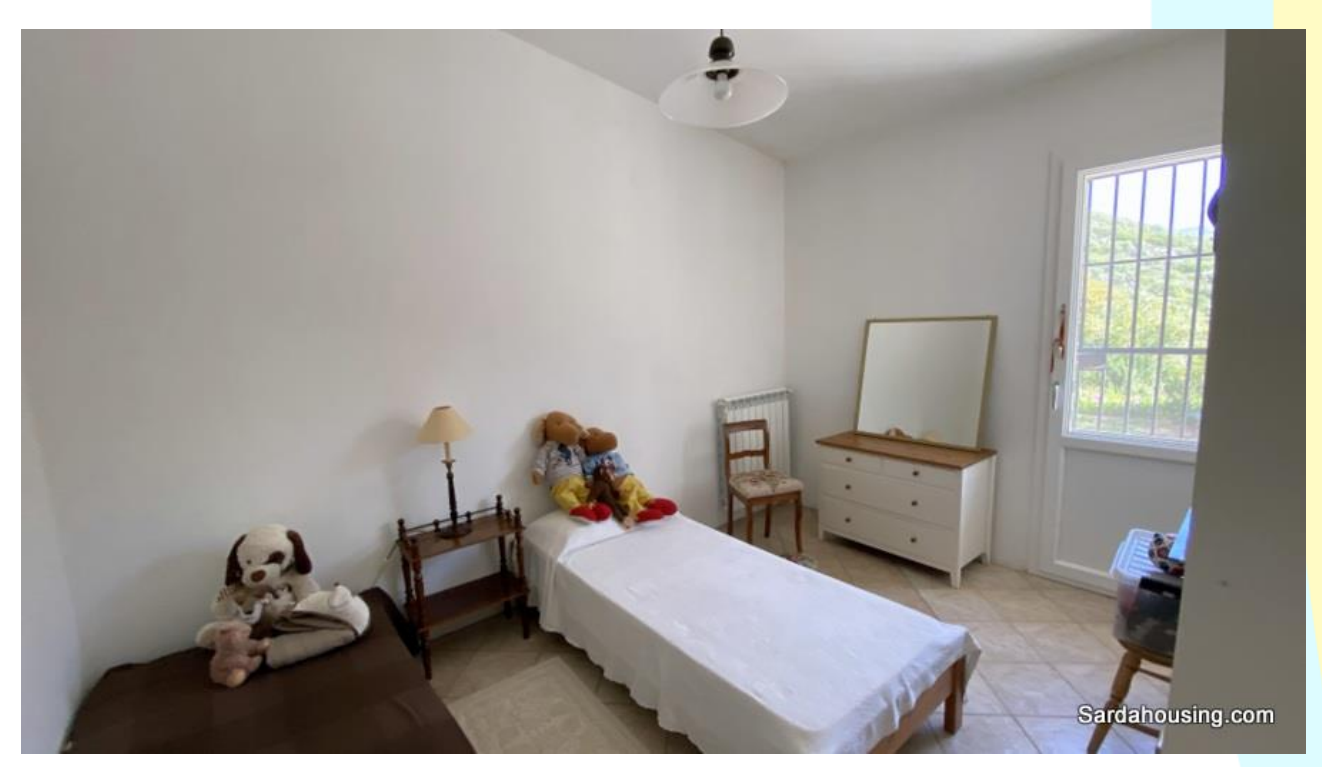
12 - Villa Nuxedda – Maracalagonis countryside – bedroom