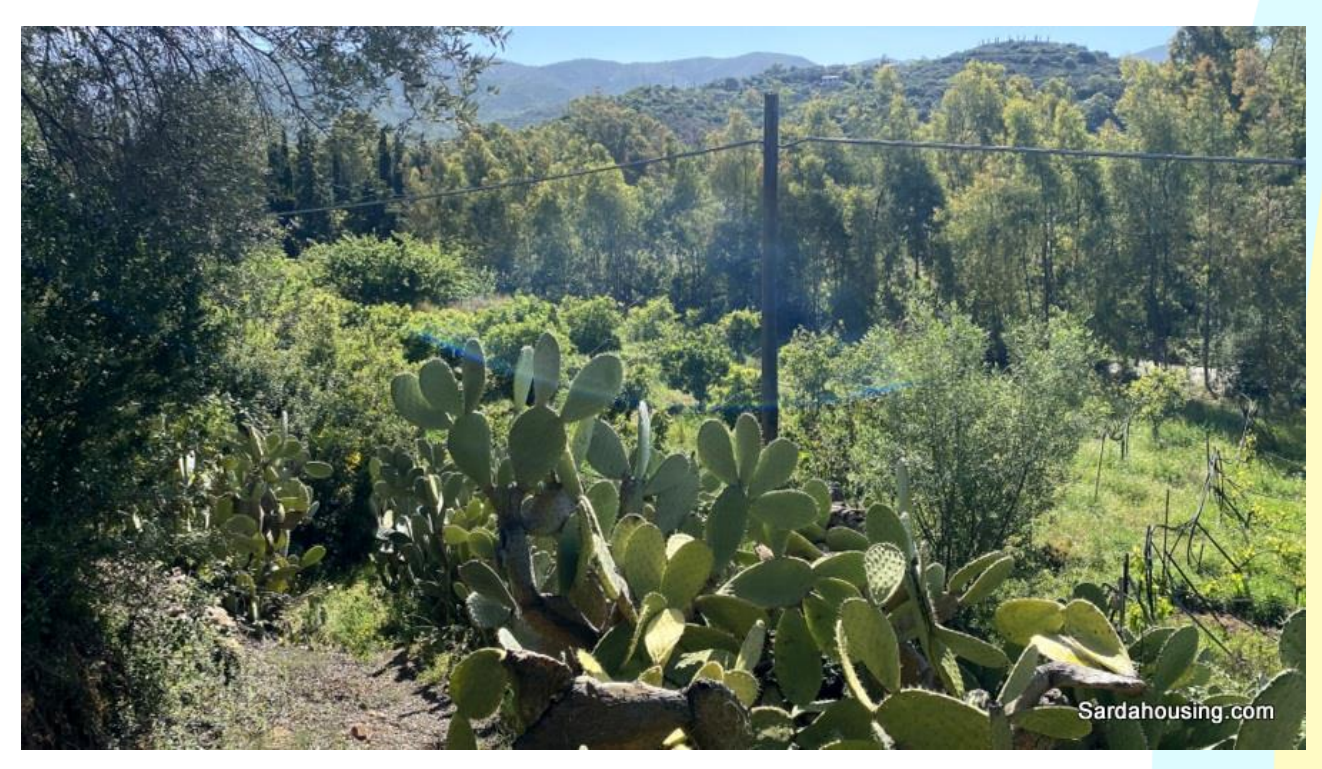
17 - Villa Nuxedda – Maracalagonis countryside – a view of the land