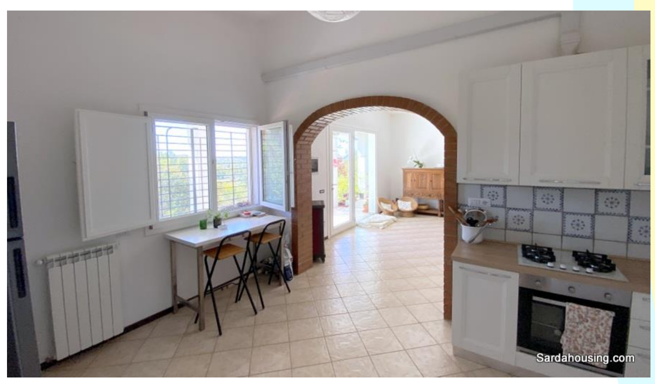
8 - Villa Nuxedda – Maracalagonis countryside – living area from the open kitchen