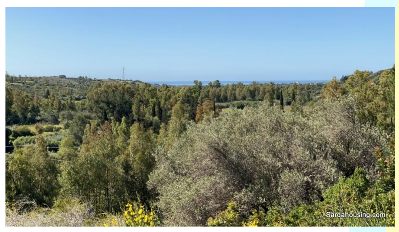
4 - Villa Nuxedda – Maracalagonis countryside – view of the coast from the property

Finally , the home has a large 70 sqm/h 2.50 m basement , which you can use as a laboratory, a storage room, a cellar or a garage. You access this level from outside , also by car.