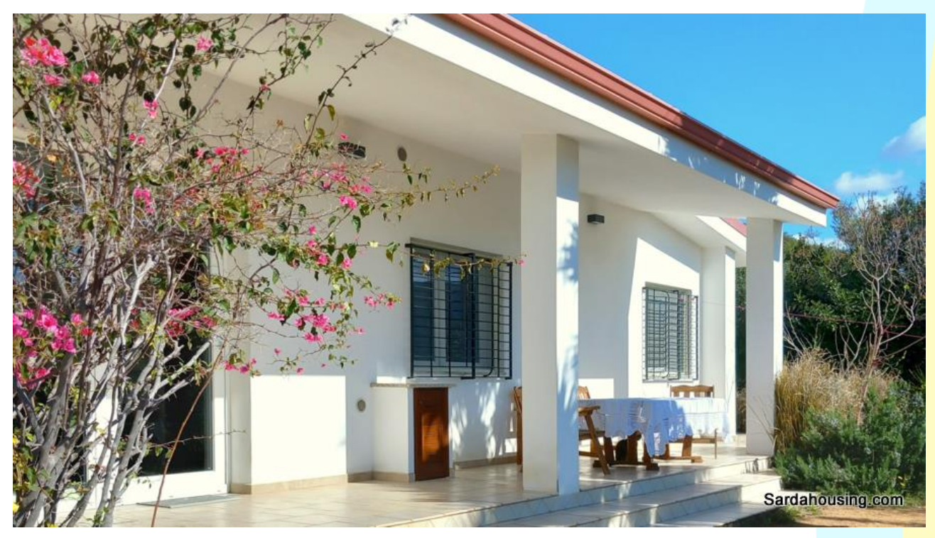
1 – Villa Nuxedda – Maracalagonis countryside – front veranda

Immersed in uncontaminated nature in the rural area of Maracalagonis, we offer a magnificent three-hectare property, with a villa and an organic cultivation area.