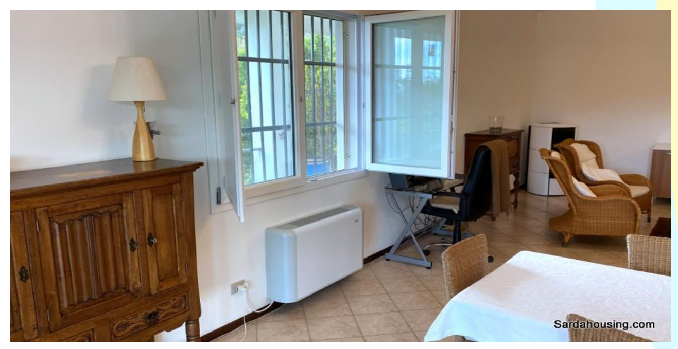
6 - Villa Nuxedda - Maracalagonis countryside - living area

info@sardahousing.com - www.sardahousing.com