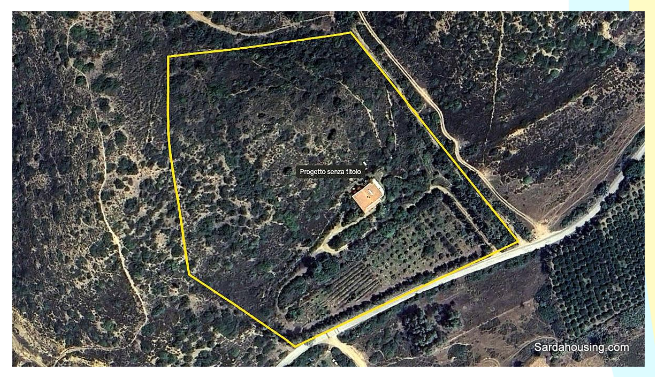
20 -Villa Nuxedda – Maracalagonis countryside – the property