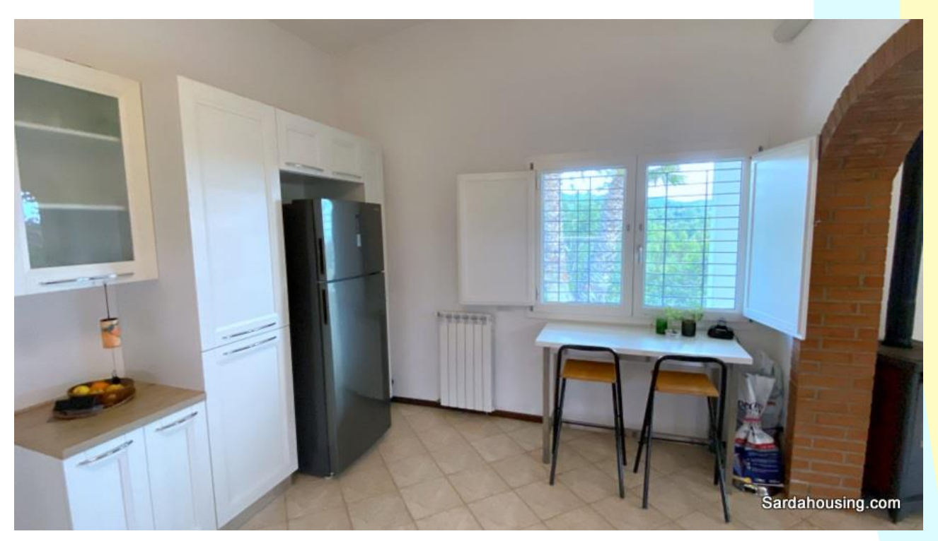
10 - Villa Nuxedda – Maracalagonis countryside – custom designed kitchen