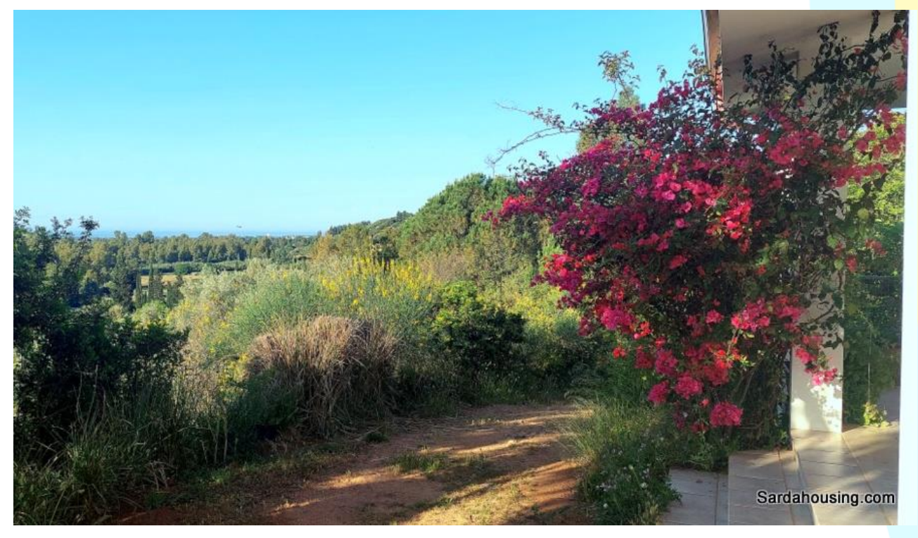
3 - Villa Nuxedda - Maracalagonis countryside - view of the coast from the front veranda

At the entrance we are welcomed by the large living area, a 49 sqm open space designed as living room and dining room with a large fireplace in its centre. The living room overlooks the front veranda where you can eat surrounded by greenery and enjoy the splendid view.