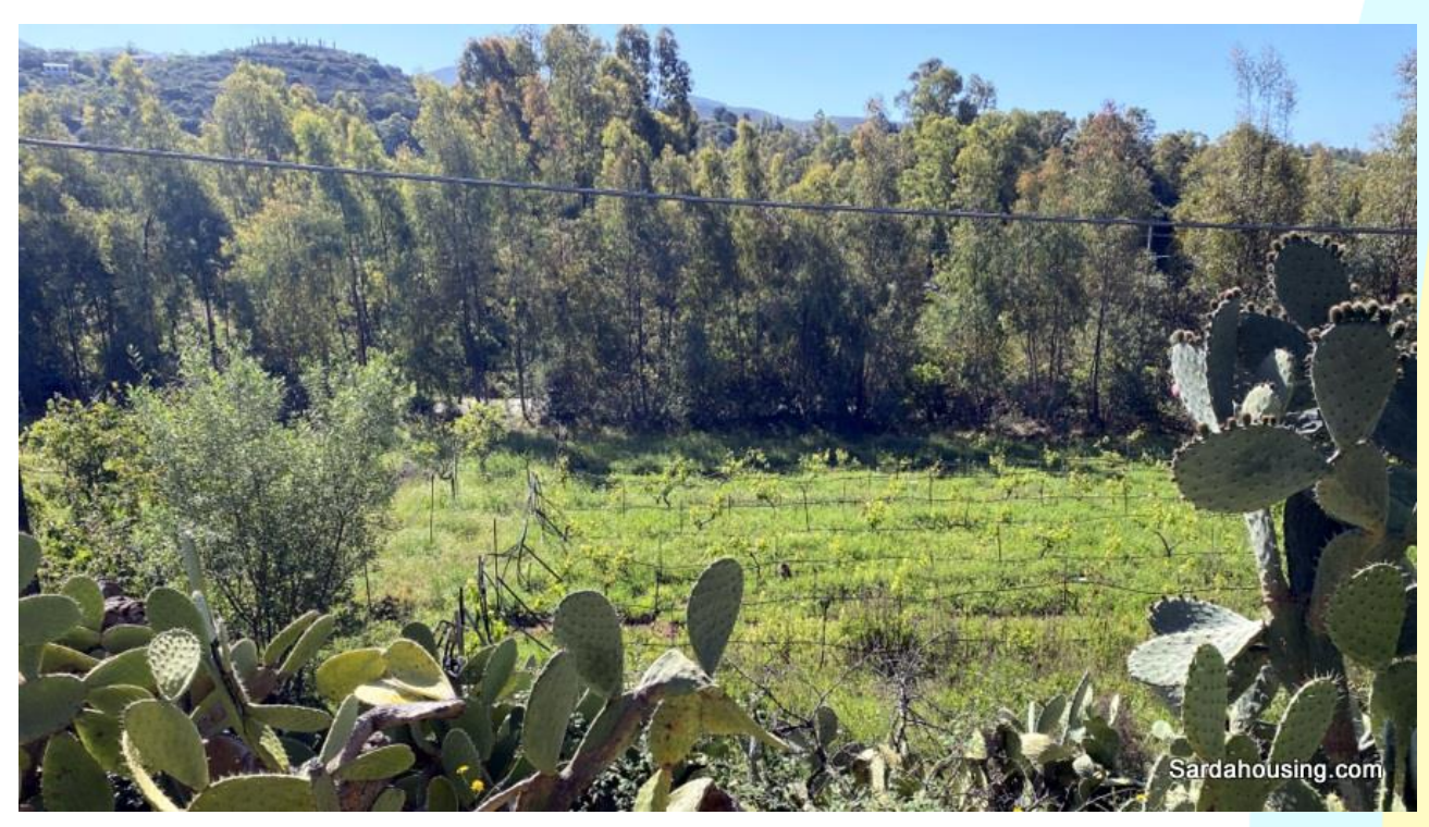
15 - Villa Nuxedda – Maracalagonis countryside – view of the organic cultivation