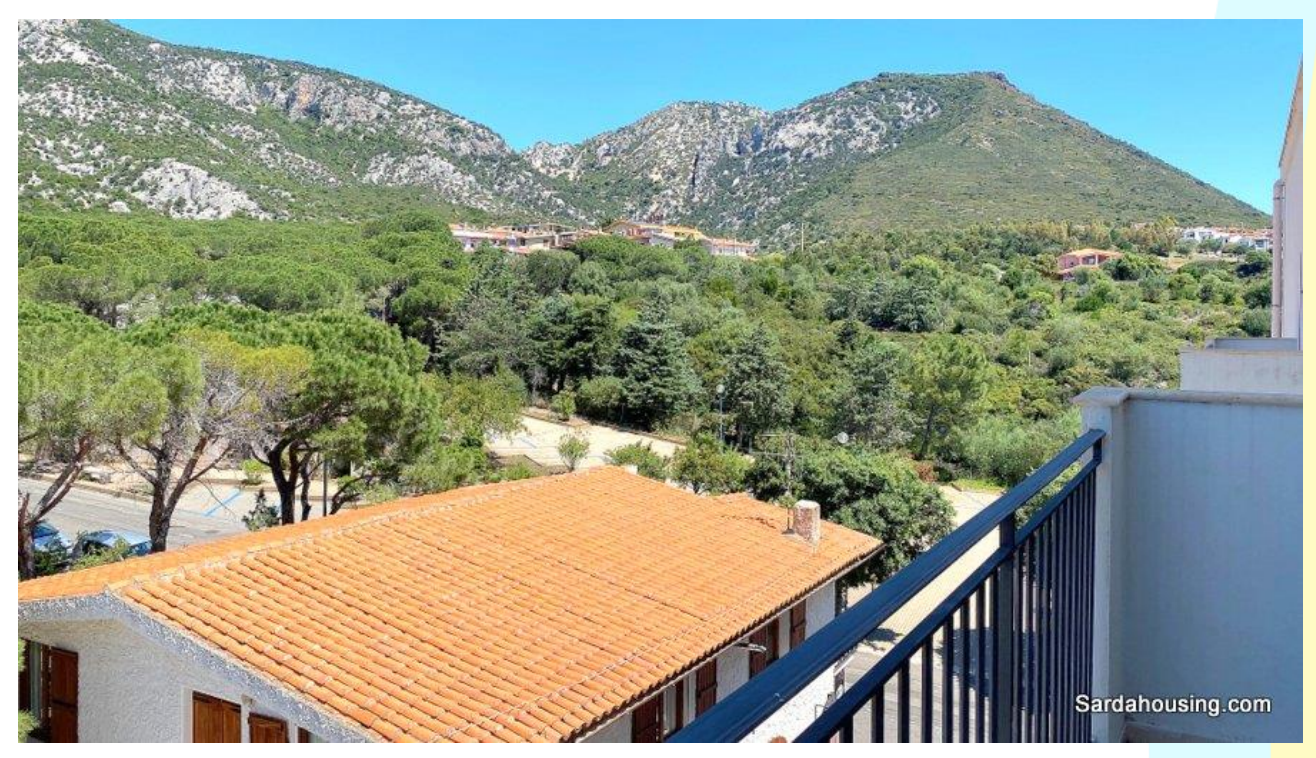
1 – Cala Gonone – Dorgali – Penthouse Vasco – a view from the terrace

In Cala Gonone, one of the best-known sea locations on the east coast of Sardinia, we offer a penthouse apartment with views of Supramonte, 150 metres to the beach.