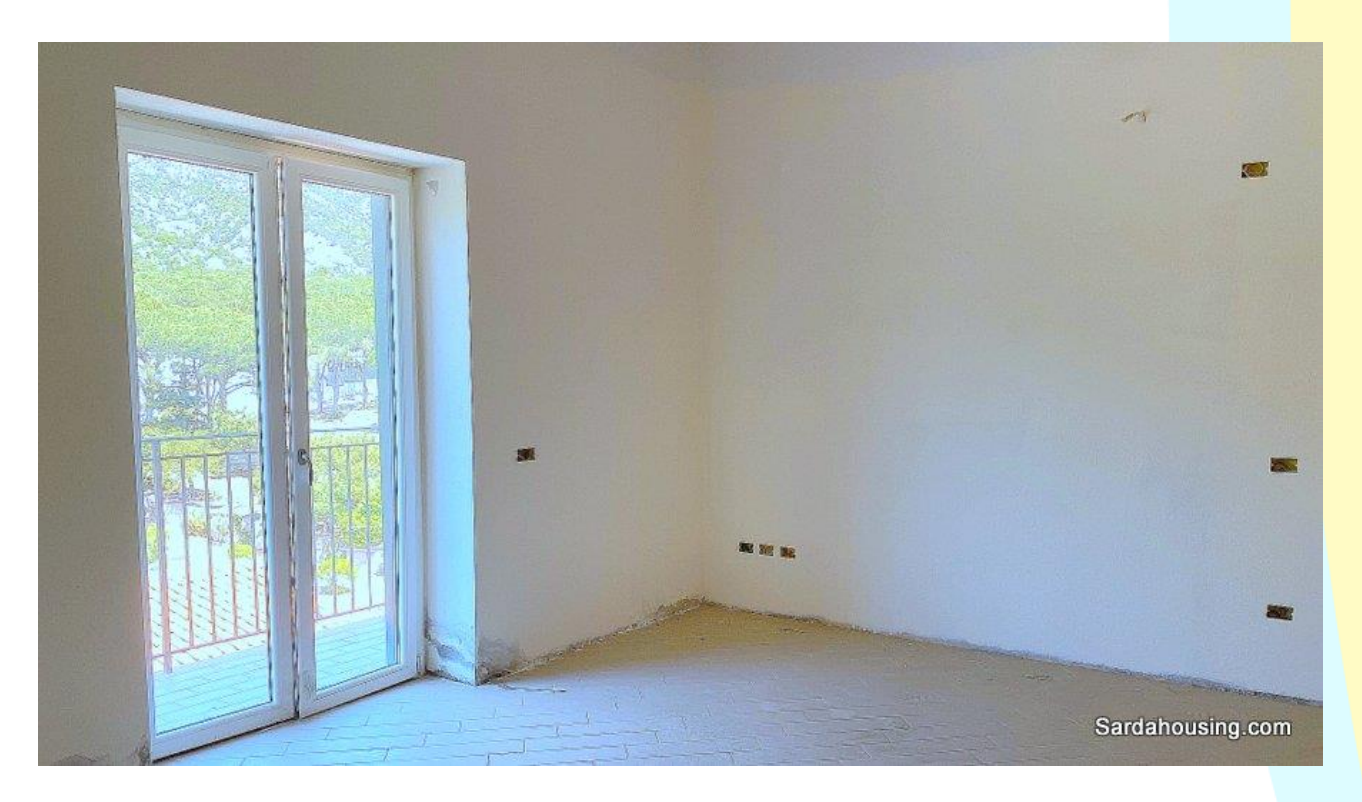
4 - Cala Gonone – Dorgali – Penthouse Vasco