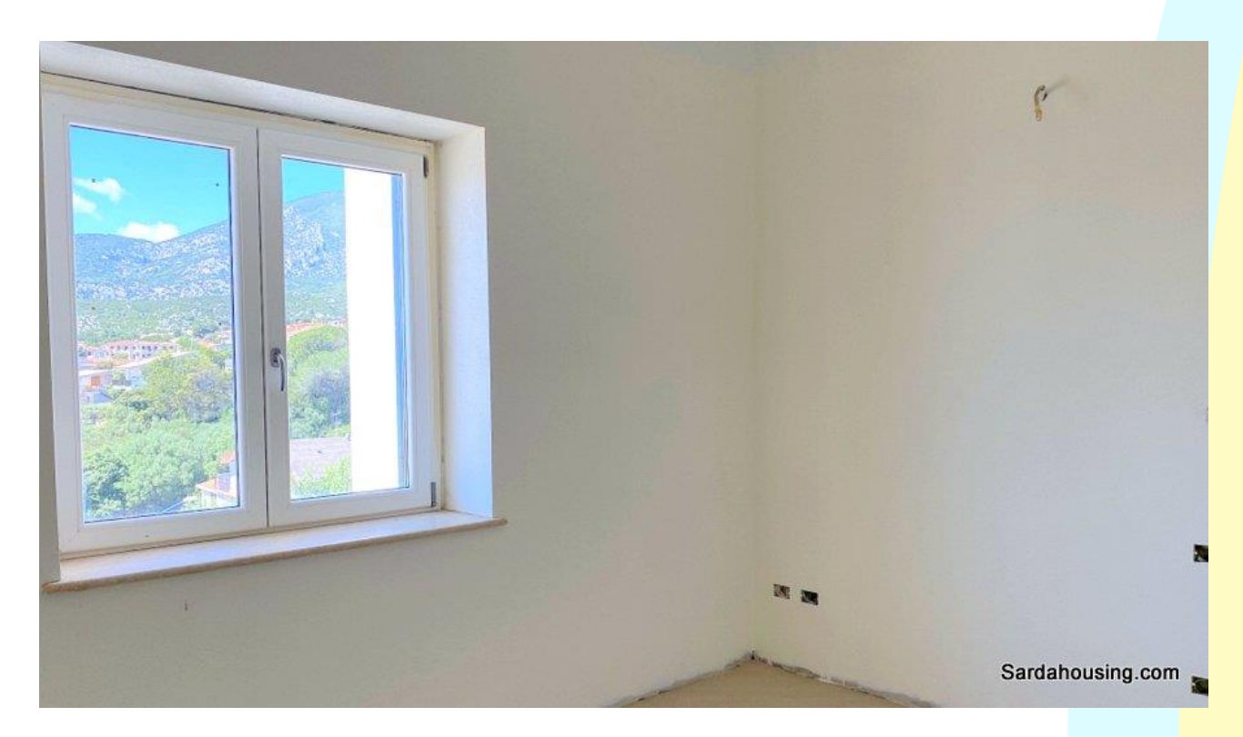
3 - Cala Gonone – Dorgali – Penthouse Vasco