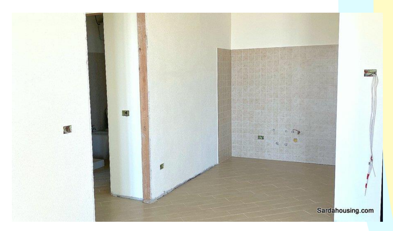
8 - Cala Gonone – Dorgali – Penthouse Vasco