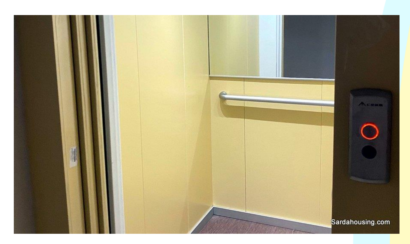
11 - Cala Gonone – Dorgali – Penthouse Vasco - lift