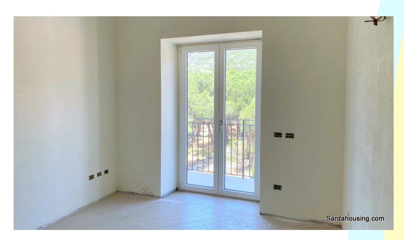
5 - Cala Gonone – Dorgali – Penthouse Vasco