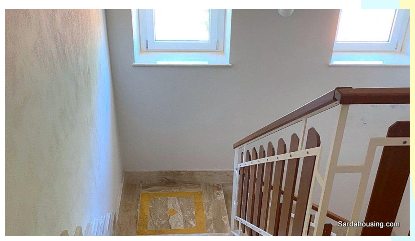
12 - - Cala Gonone – Dorgali – Penthouse Vasco - stairs