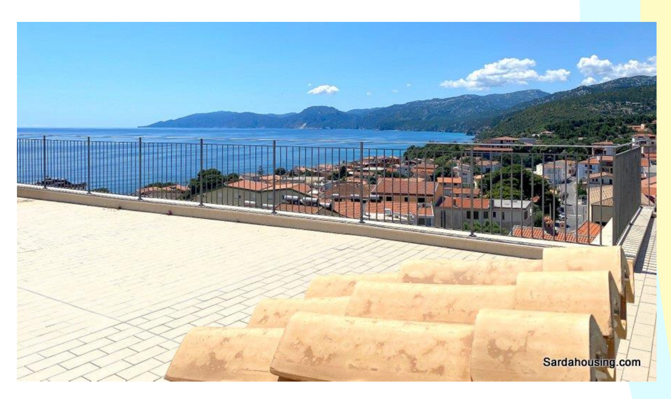
10 - Cala Gonone – Dorgali – Penthouse Vasco: a view from solarium-terrace