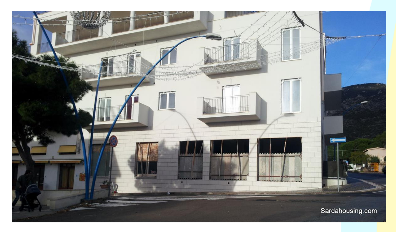
13 - - Cala Gonone - Dorgali - Penthouse Vasco - the renewed building