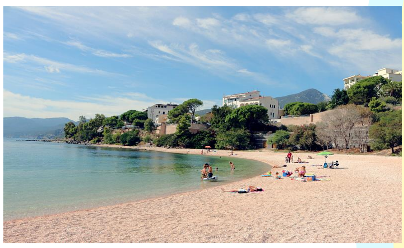
Spiaggia Centrale in Cala Gonone

Cala Gonone can be easily reached from the main towns of Sardinia (Cagliari, Sassari, Oristano, Nuoro and Olbia) via the S.S. 131.