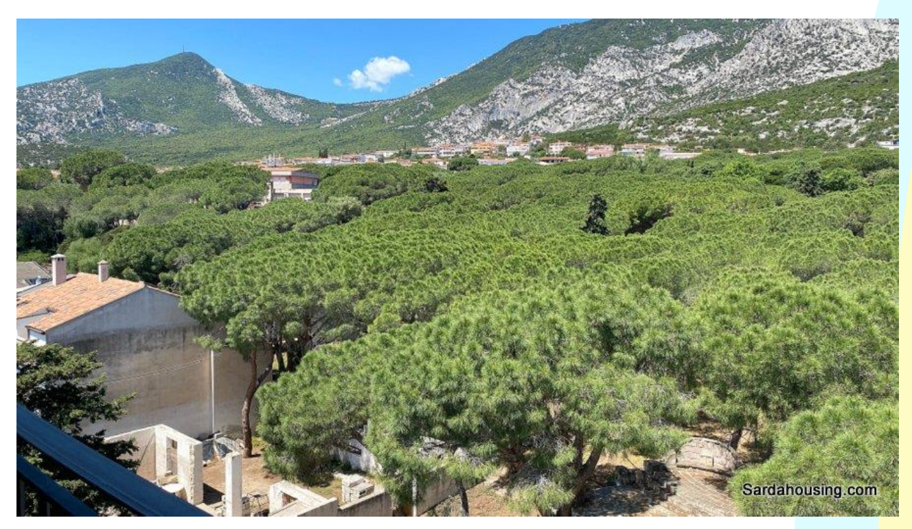
2 – Cala Gonone – Dorgali – Penthouse Vasco – a view from the terrace