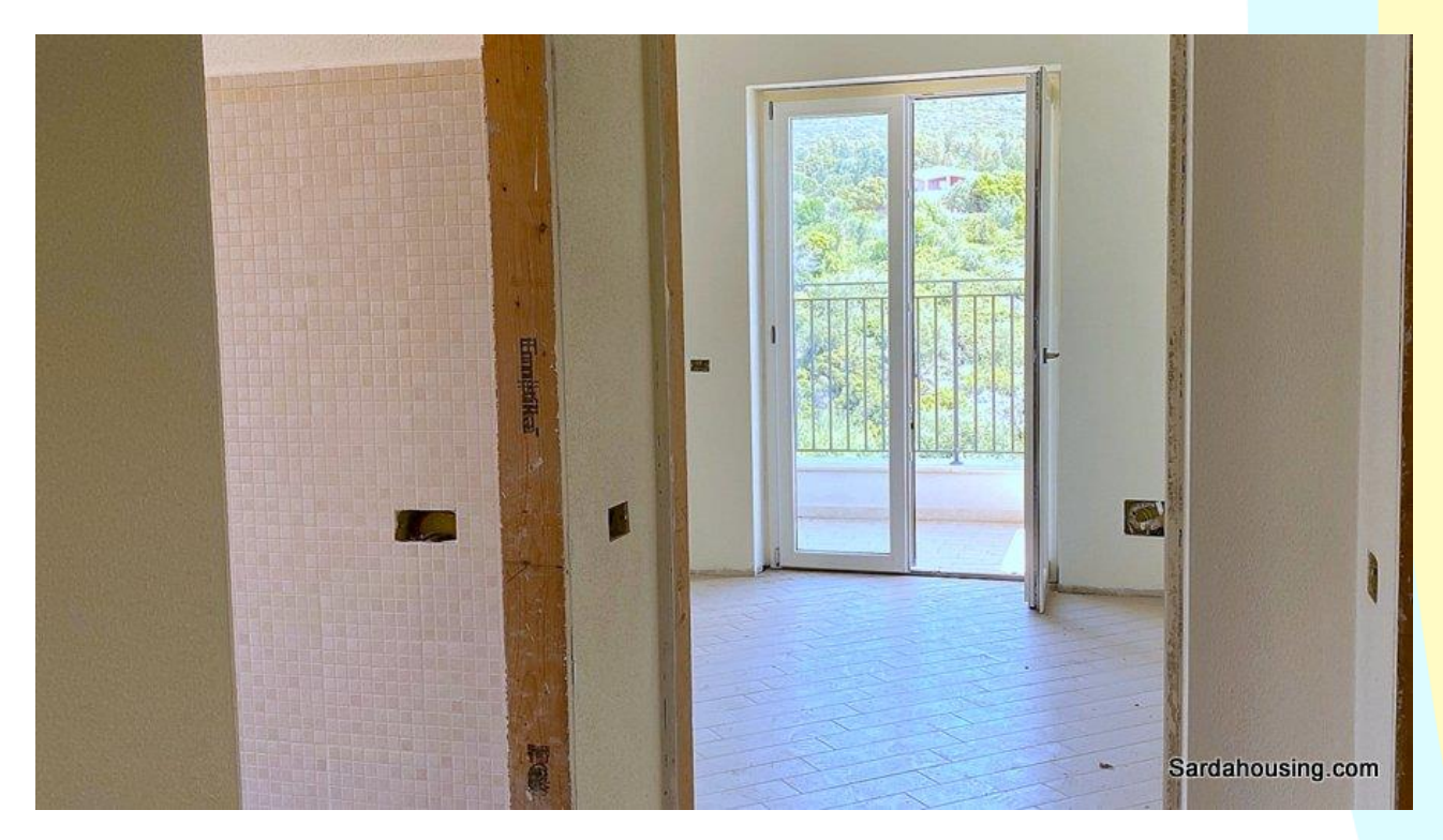
6 - Cala Gonone – Dorgali – Penthouse Vasco