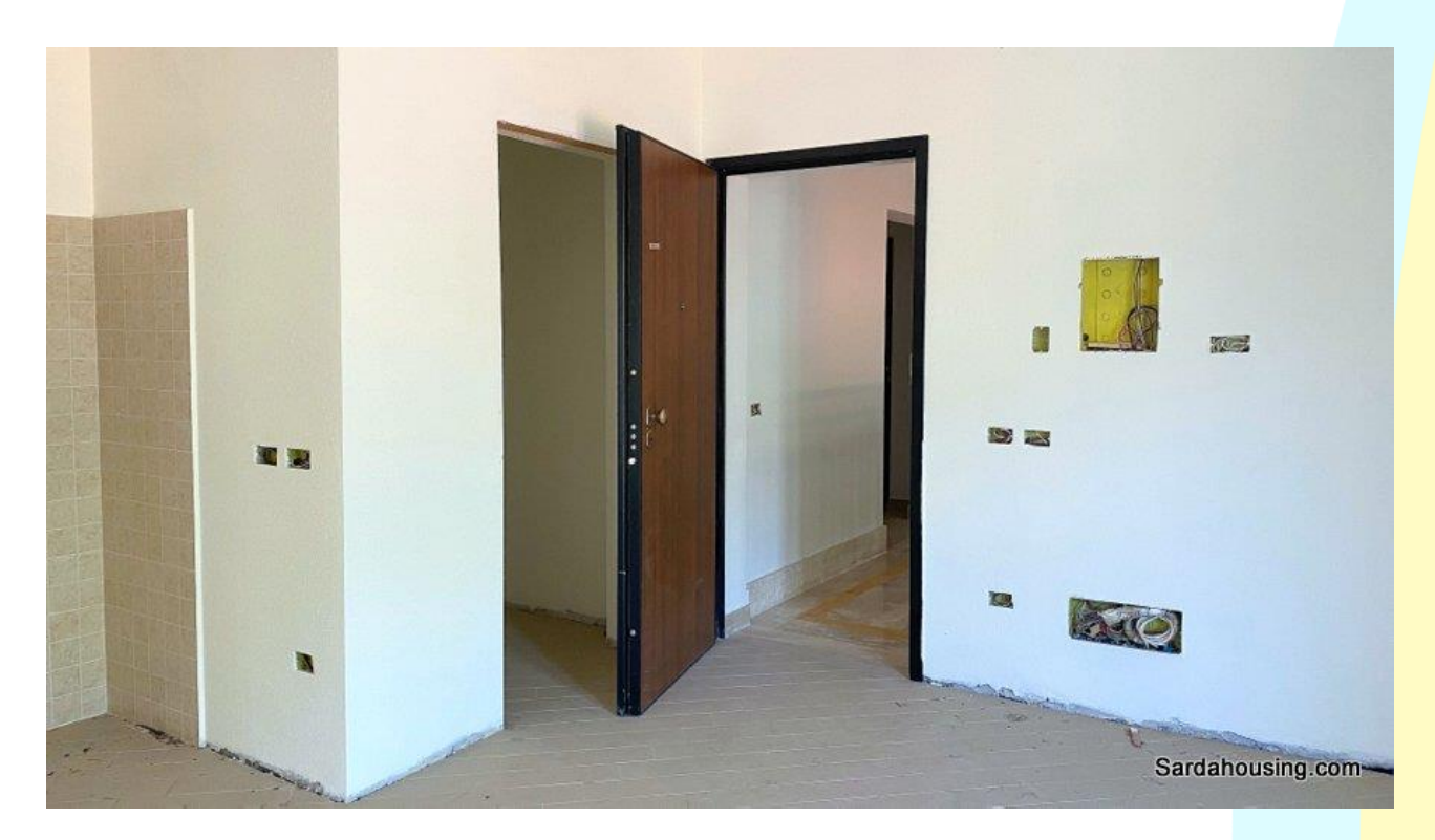
7 - Cala Gonone – Dorgali – Penthouse Vasco