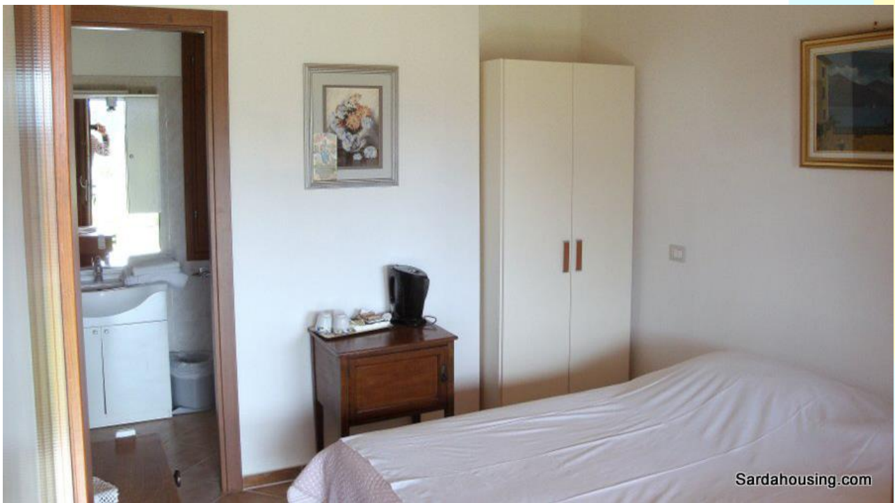
13 - Donori – Estate Arrideli: inside one of guest housing