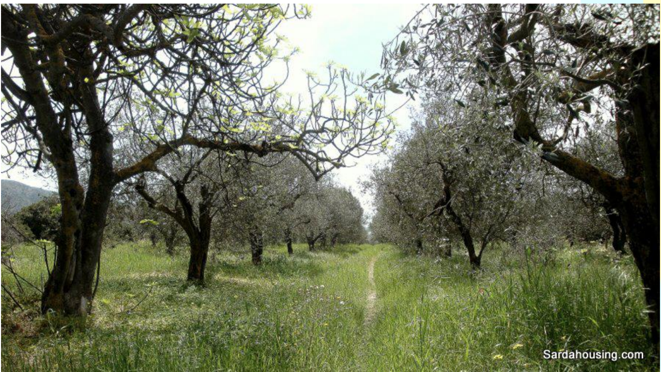
29 - Donori – Estate Arrideli: olive grove