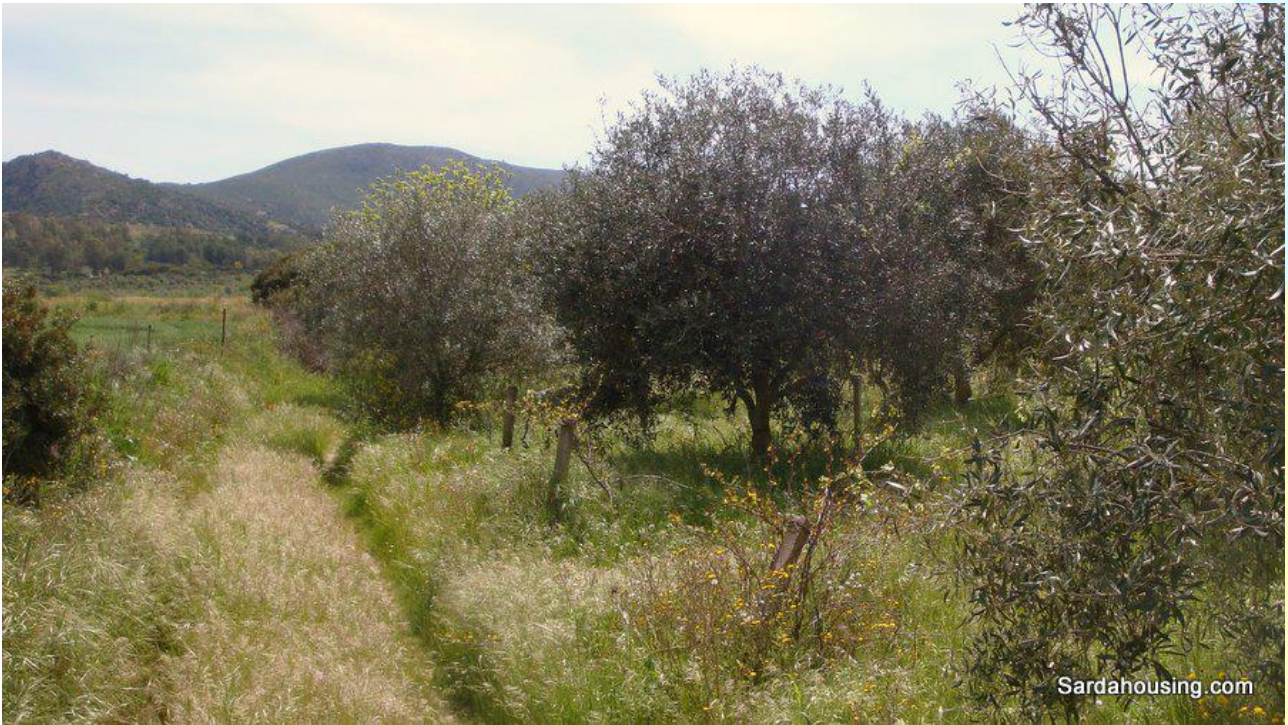
36 - Donori – Estate Arrideli: a view of the property