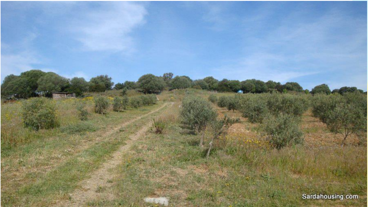
30 - Donori – Estate Arrideli: olive grove