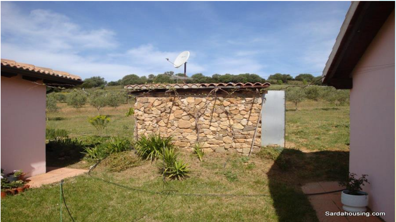
10 - Donori – Estate Arrideli: one of guest housing