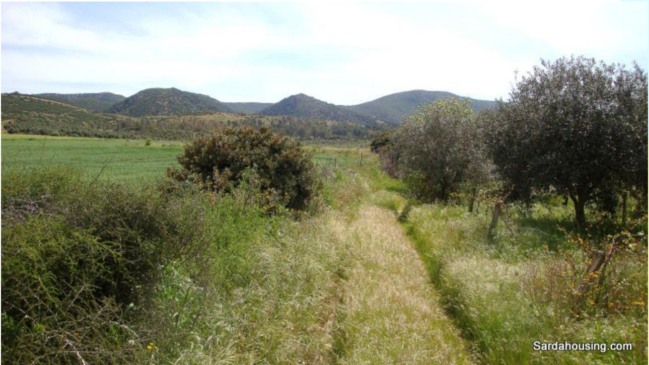
28 - Donori – Estate Arrideli: olive grove