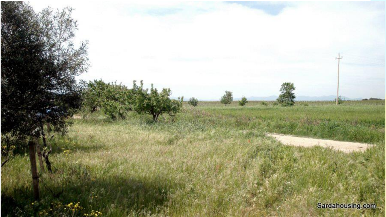
26 - Donori – Estate Arrideli: a view of the property