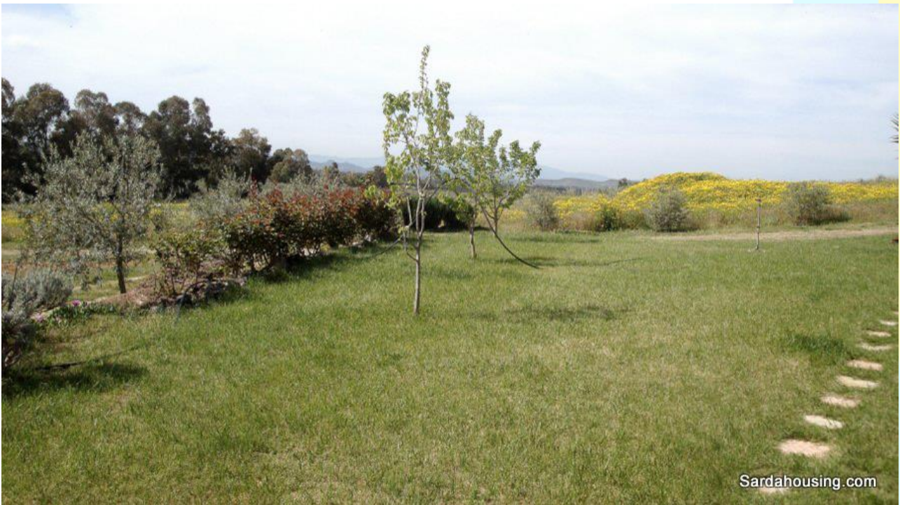
17 - Donori – Estate Arrideli: a view of property