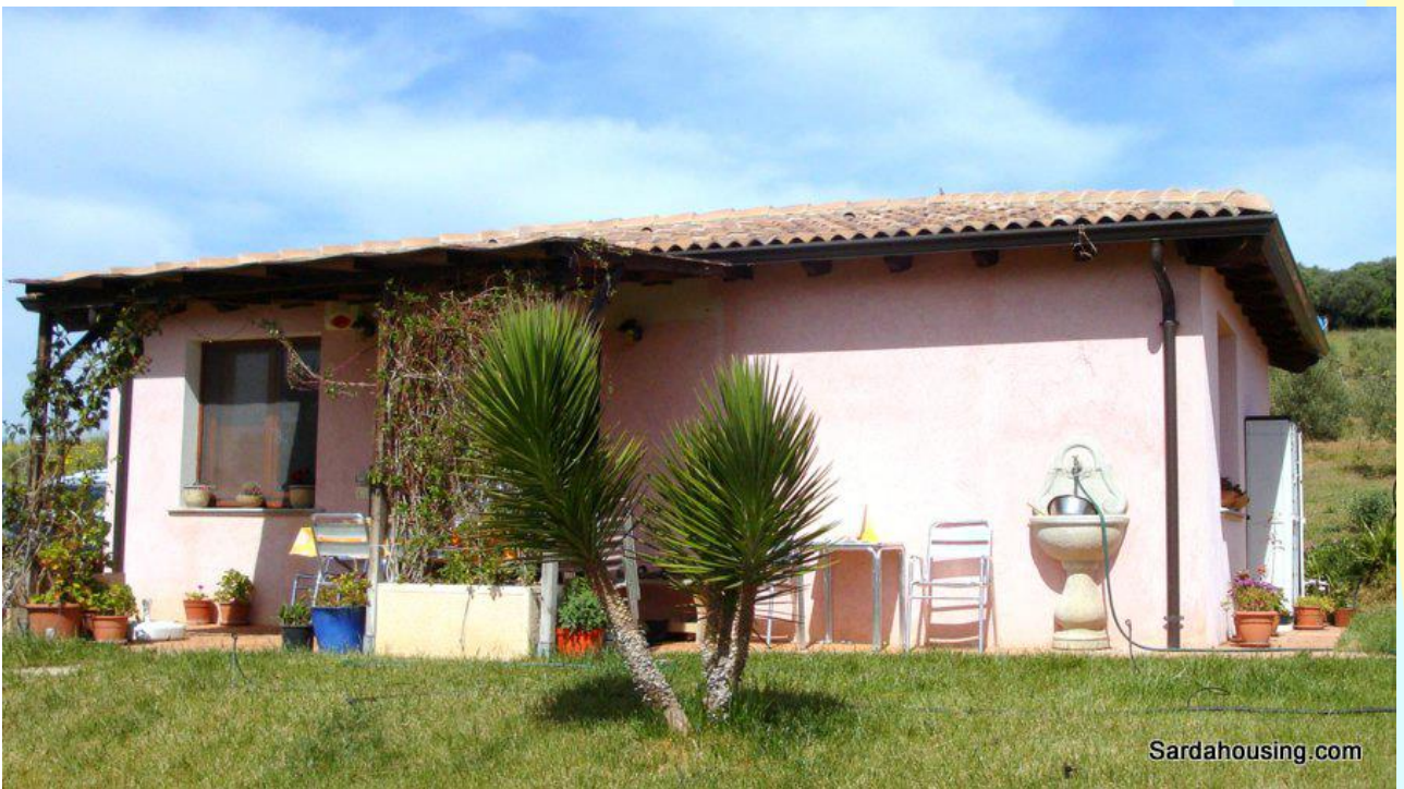
4 - Donori – Estate Arrideli: a view of buildings