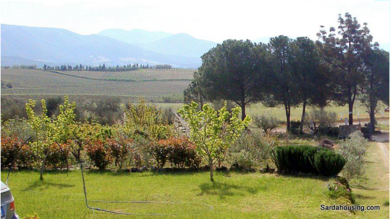
16 - Donori – Estate Arrideli: a view of property