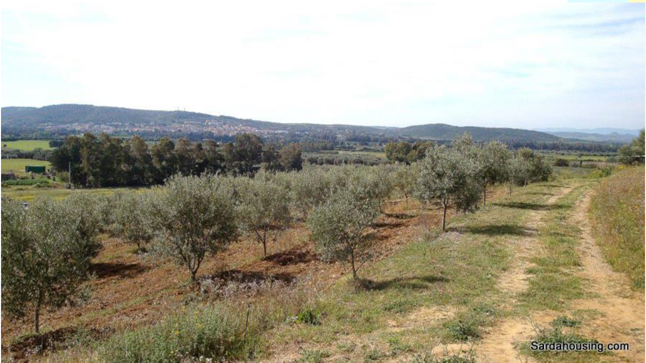
19 - Donori – Estate Arrideli: a view of property