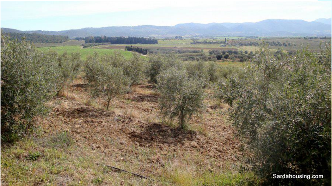
18 - Donori – Estate Arrideli: a view of property