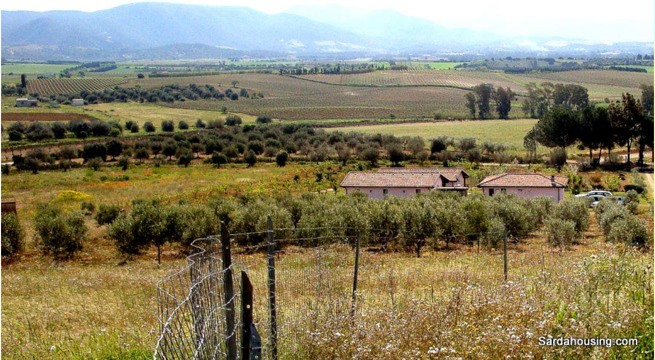
1 – Donori – Estate Arrideli: a view of buildings

In Donori countryside , 2 km from the village, we offer a beautiful recently built agricultural-tourist complex , suitable for cohousing , or an eco-village .