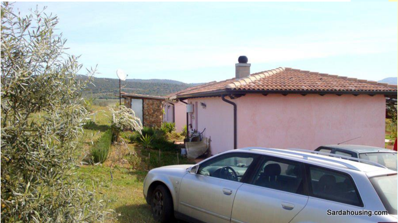
8 - Donori – Estate Arrideli: one of guest housing