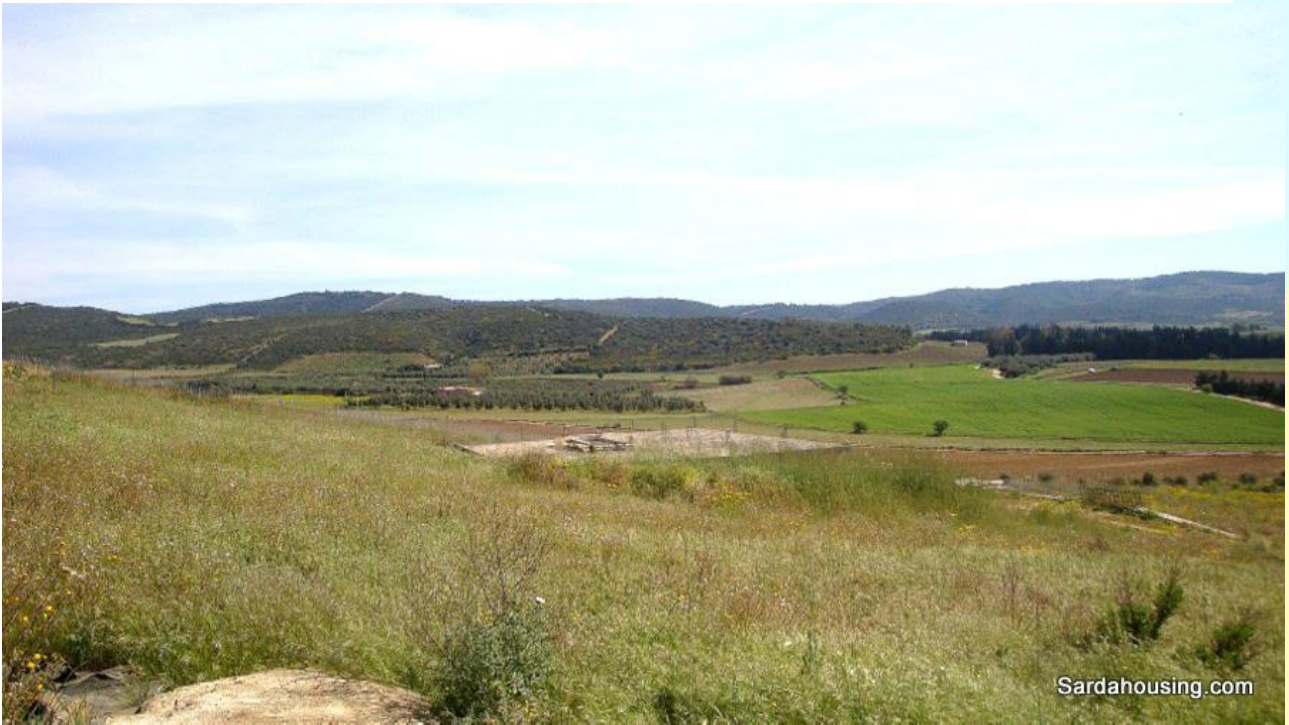
22 - Donori – Estate Arrideli: main house basement