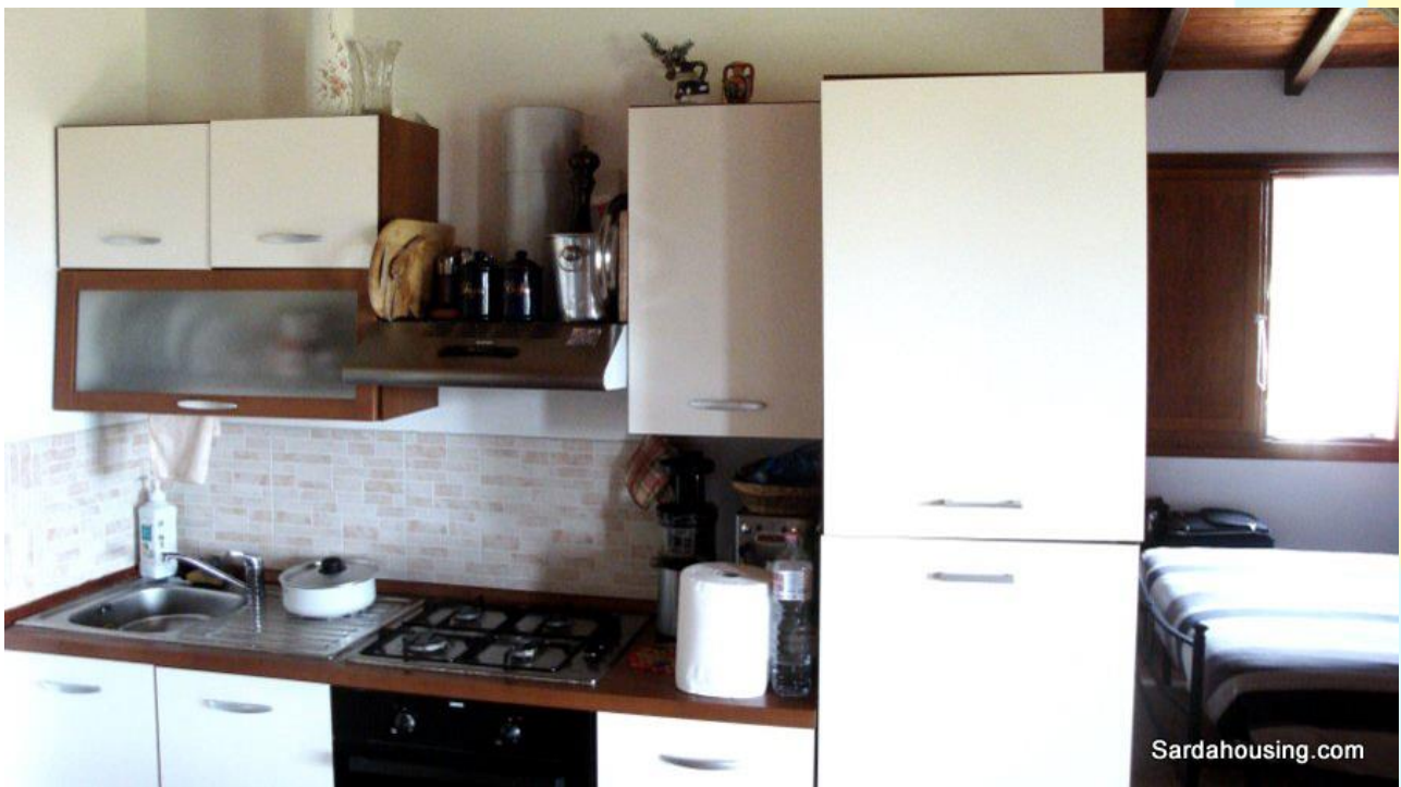
15 - Donori – Estate Arrideli: inside one of guest housing