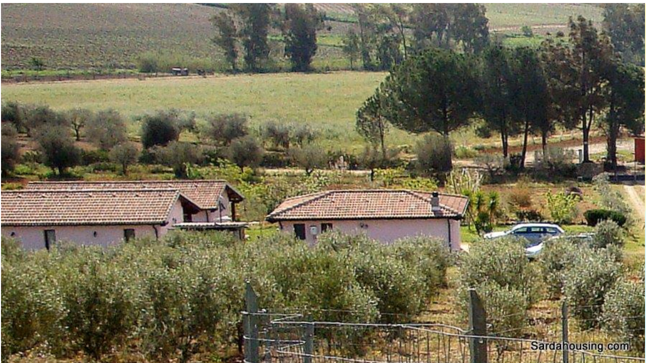
3 – Donori – Estate Arrideli: a view of buildings

info@sardahousing.com - www.sardahousing.com