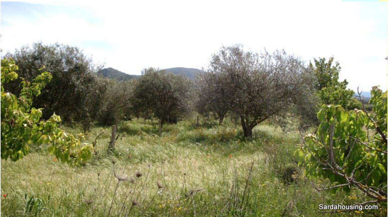
27 - Donori – Estate Arrideli: olive grove