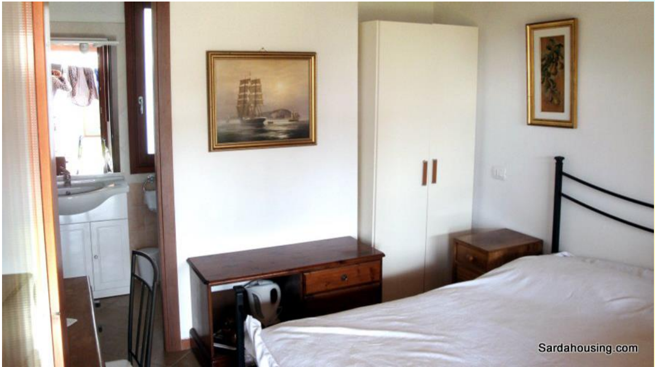
14 - Donori – Estate Arrideli: inside one of guest housing