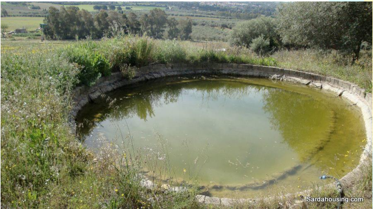
20 - Donori – Estate Arrideli: a view of property