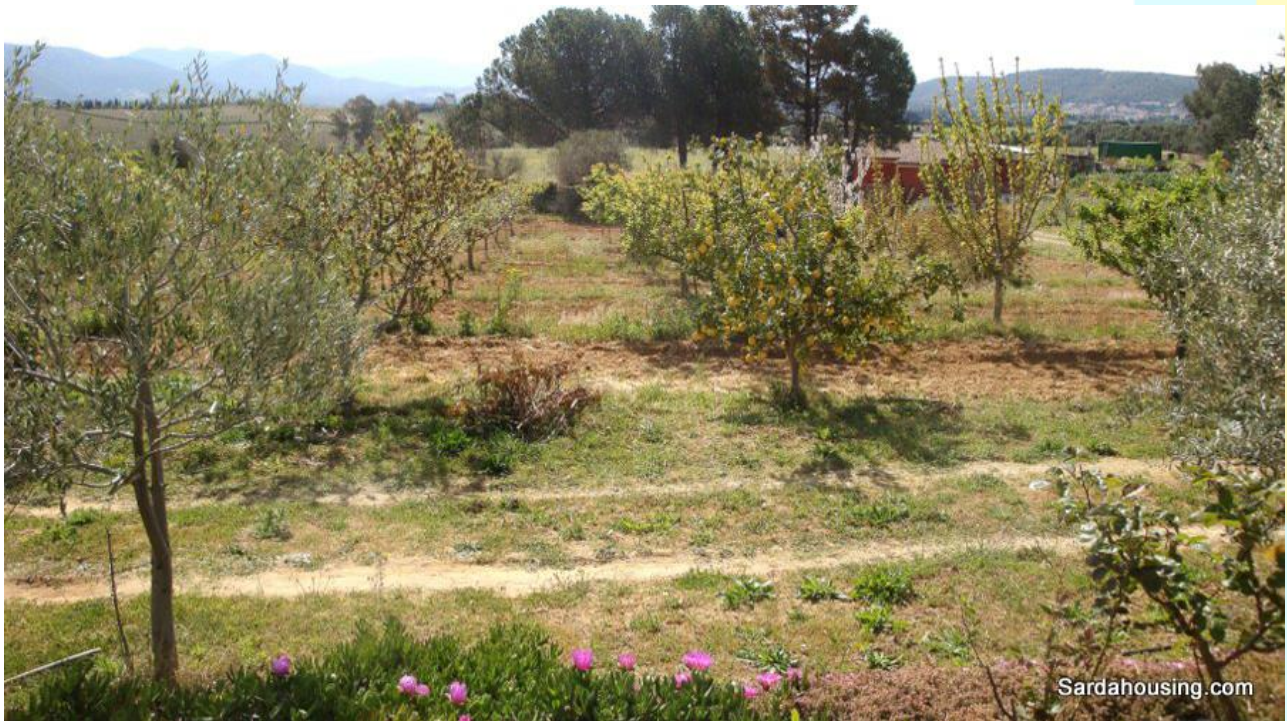
25 - Donori – Estate Arrideli: fruit tress