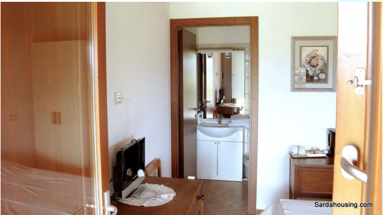
11- Donori – Estate Arrideli: inside one of guest housing