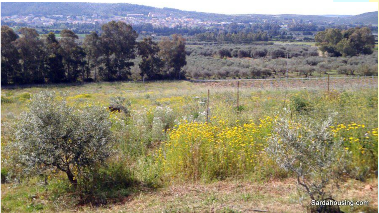
35 - Donori – Estate Arrideli: a view of the property