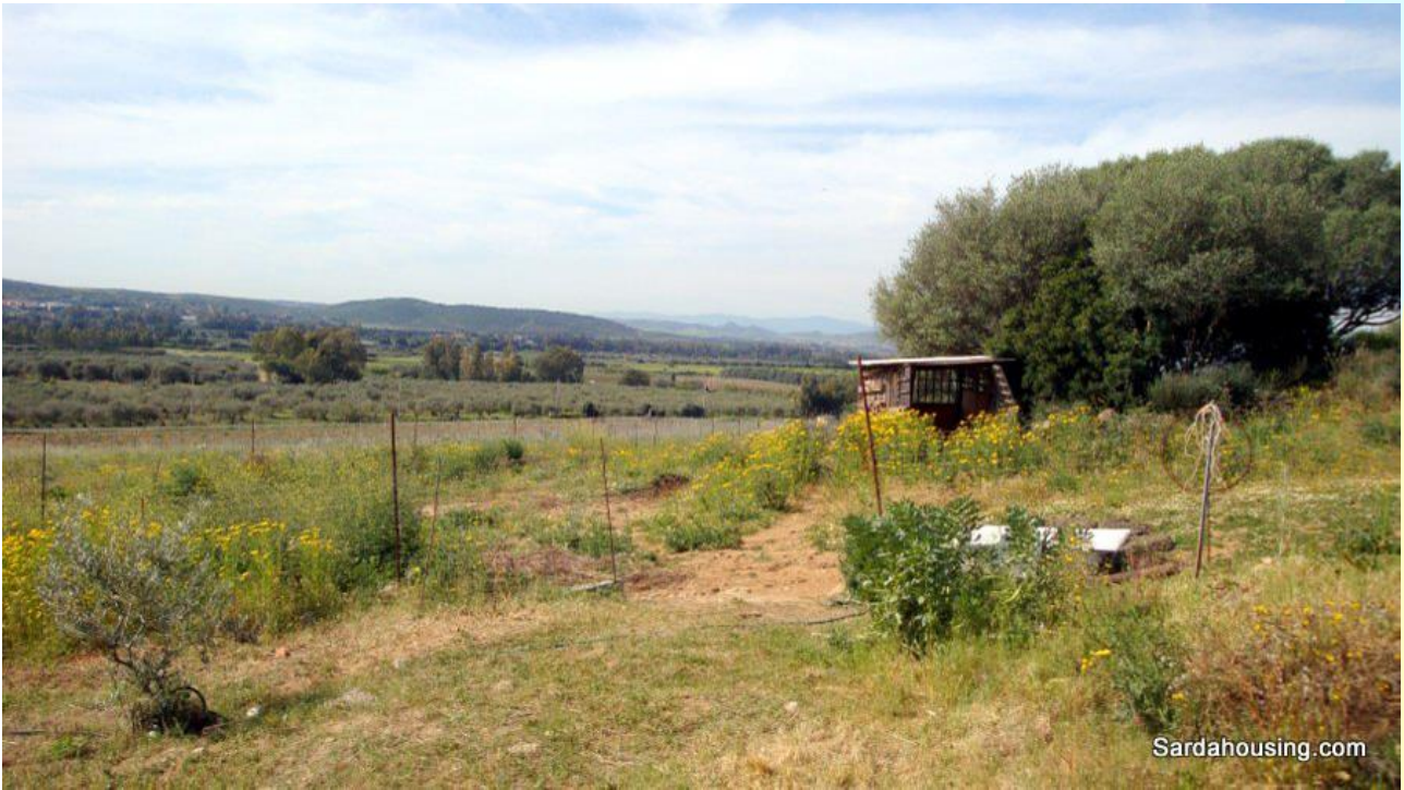
34 - Donori – Estate Arrideli: a view of the property