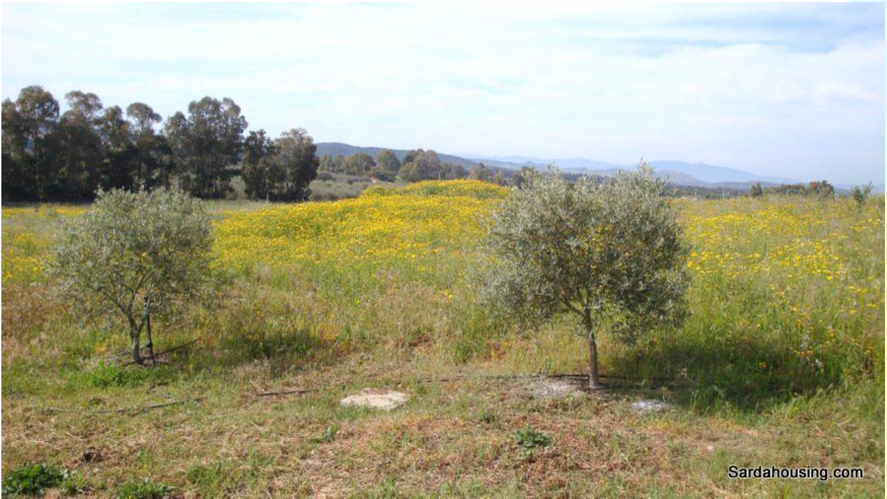
32 - Donori – Estate Arrideli: a view of the property