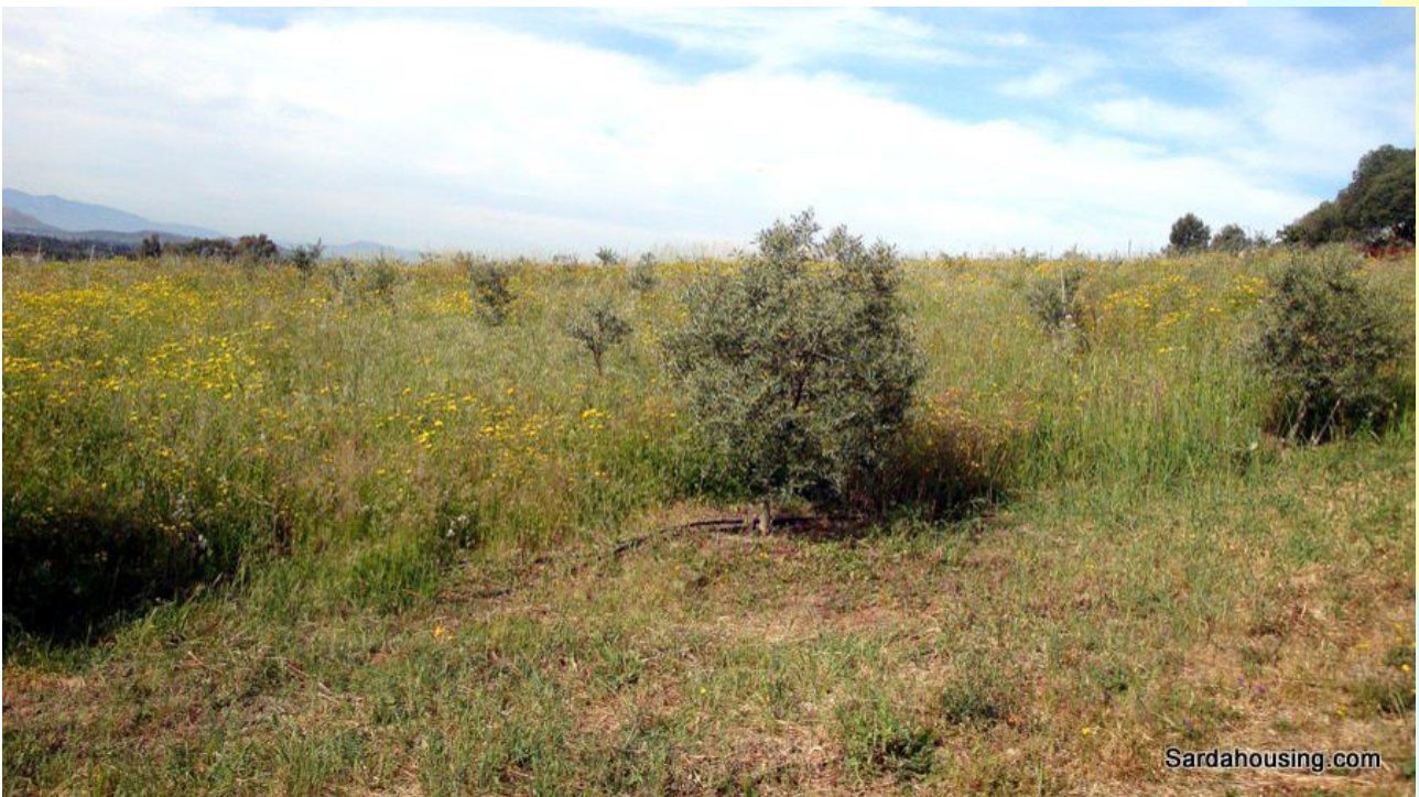
33 - Donori – Estate Arrideli: a view of the property