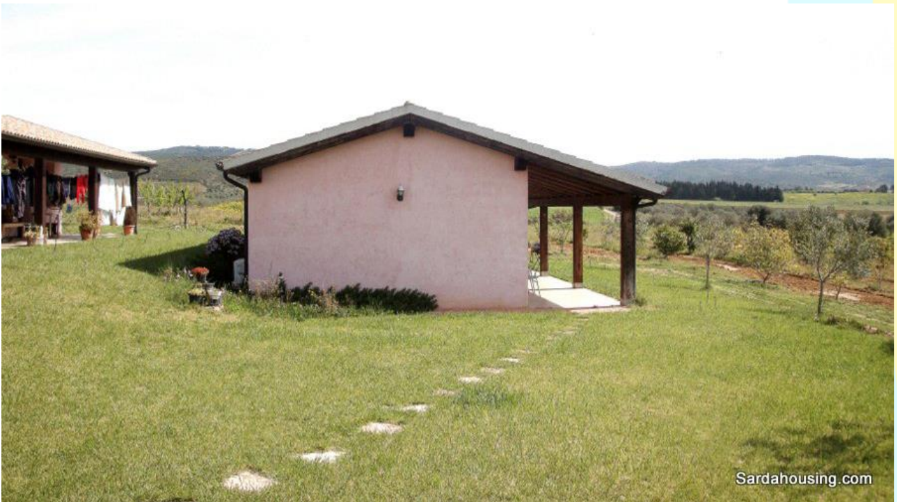
6 - Donori – Estate Arrideli: one of guest housing