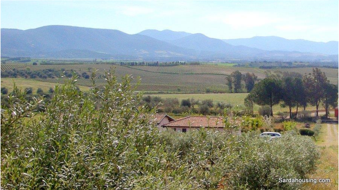
2 – Donori – Estate Arrideli: a view of buildings