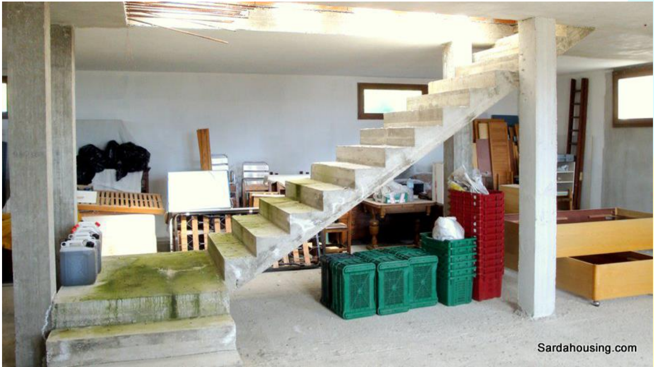
24 - Donori – Tenuta Arrideli: Estate Arrideli: main house basement