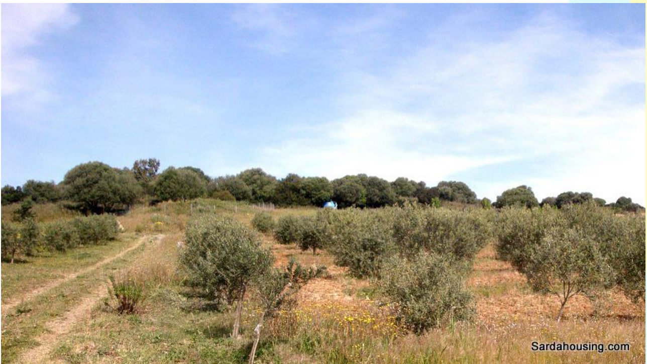
31 - Donori – Estate Arrideli: olive grove