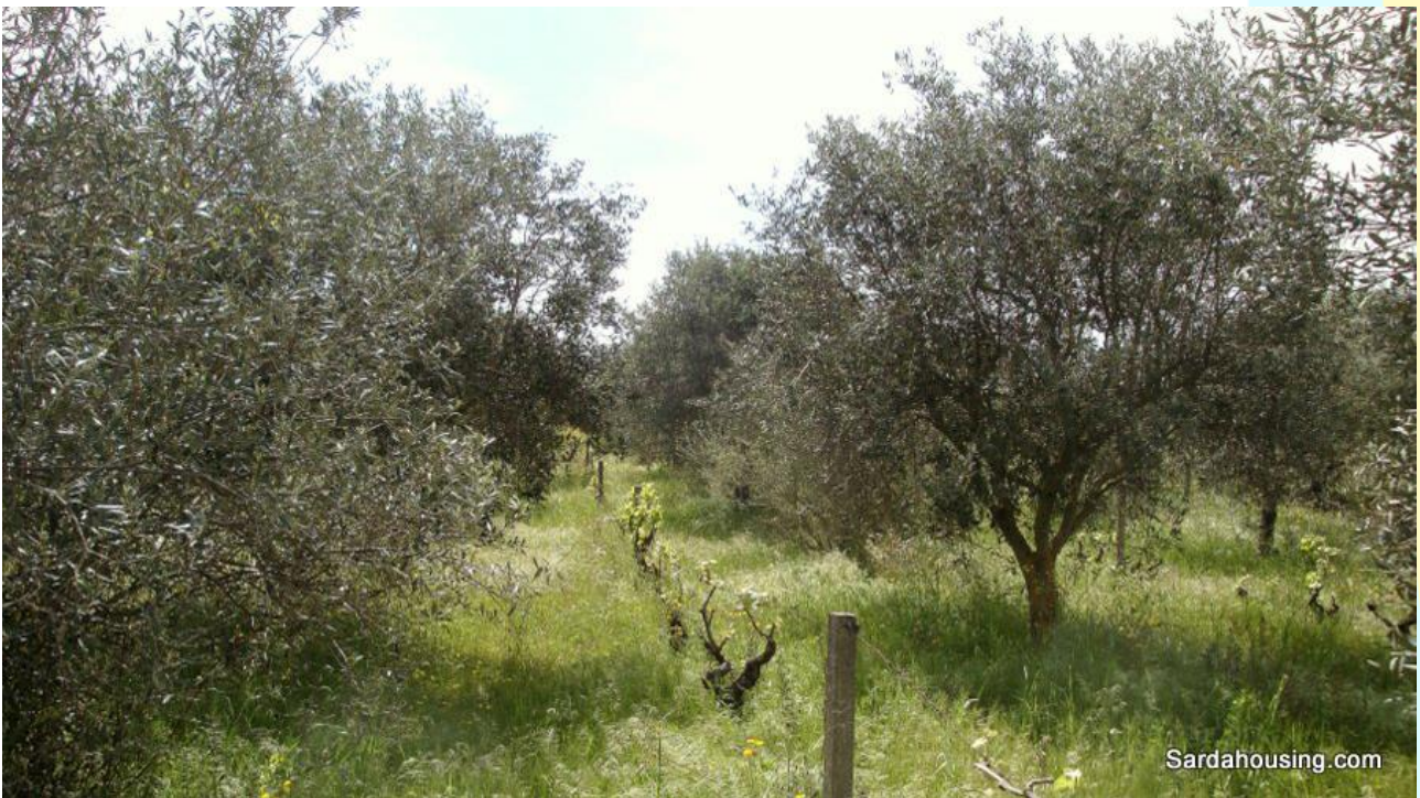
37 - Donori – Estate Arrideli: olive grove and vineyard