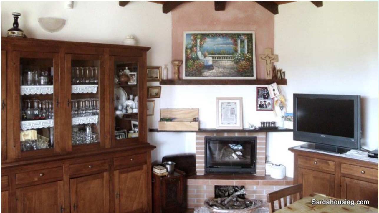
12 - Donori – Estate Arrideli: inside one of guest housing