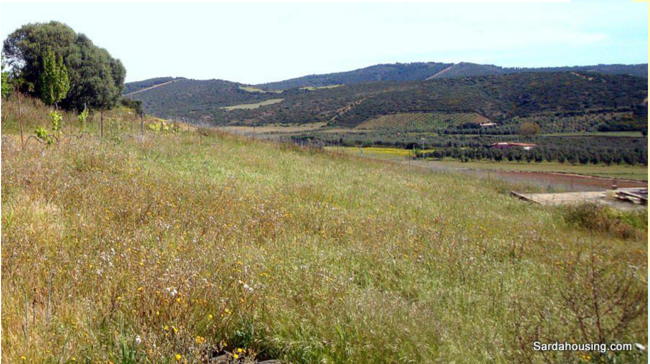
23 - Donori – Estate Arrideli: main house basement